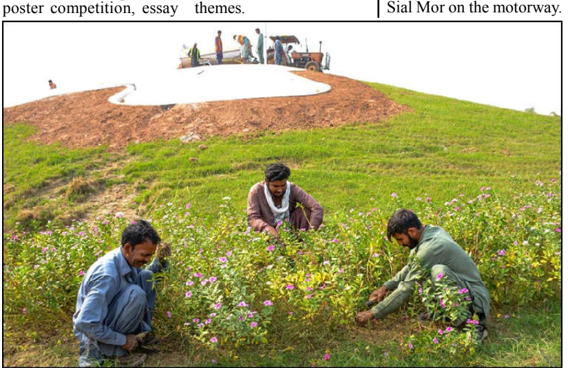
ISLAMABAD: CDA workers are busy cutting surplus grass to maintain green belt area vegetation.