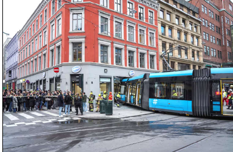
A crowd gathers to watch as first responders work after a tram derailed and crashed into a building in the center of Oslo, Norway.

The yen hit a threethan 1 per cent against the dollar. According to projections by national broad-