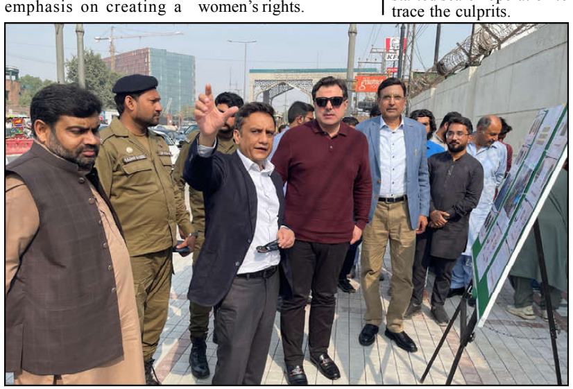
LAHORE: Punjab Minister for Housing and Urban Planning Bilal Yaseen being briefed by DG LDA Tahir Farooq regarding re-modeling of Thokar

A heavy police force cordoned off the area and started search operation to