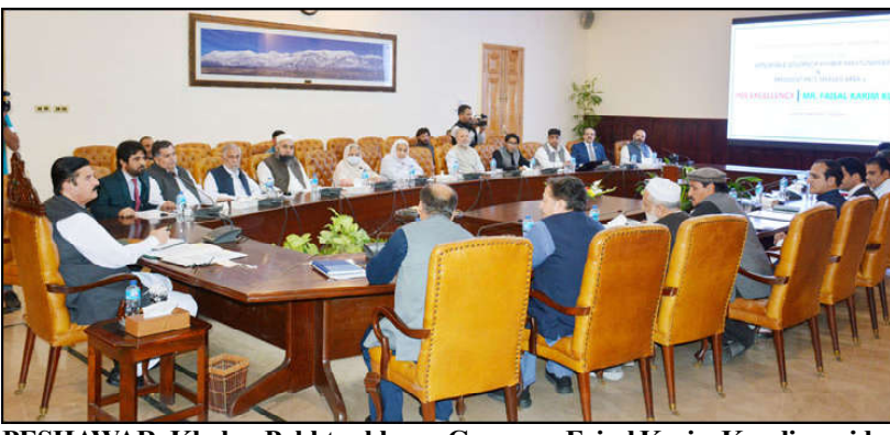
PESHAWAR: Khyber Pakhtunkhawa Governor Faisal Karim Kundi presides over the meeting of Pakistan Red Crescent Society Merged Districts Branch

advancing global peace, stability, and prosperity, bringing together foreign delegates. manufacturers, and thought leaders to discuss today's international defense defense and security challenges," he said.