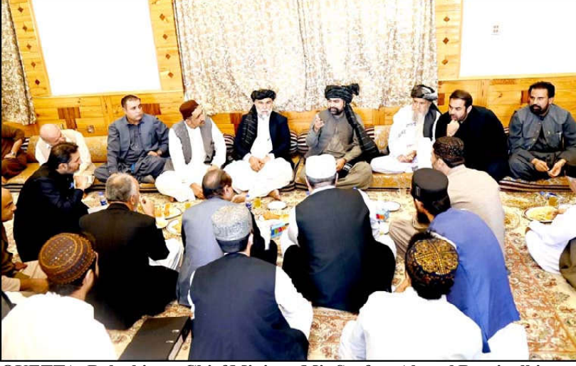
QUETTA: Balochistan Chief Minister Mir Sarfraz Ahmed Bugti talking to administration and local tribal elites during his visit to Jamia Islamia Educa

Bushra Bibi's exemption but issued notice for her