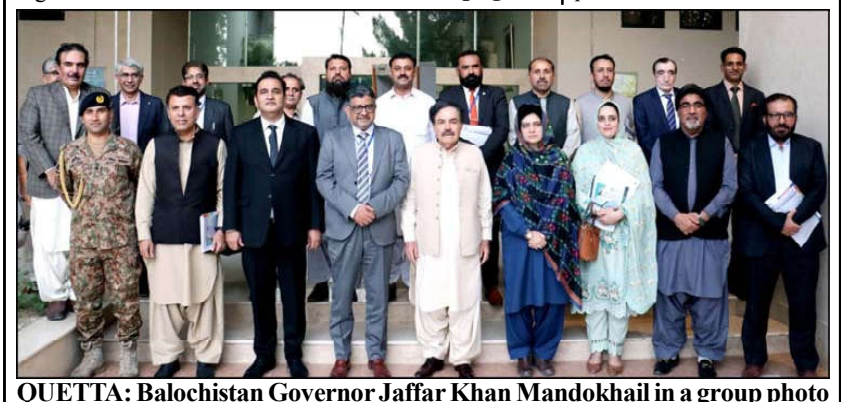
QUETTA: Balochistan Governor Jaffar Khan Mandokhail in a group photo with members during 12th Senate session of BUITEMS.

posed an average price increase of Rs 64.16 per MMBTU, raising the average rate to Rs 1,810.38 per MMBTU.