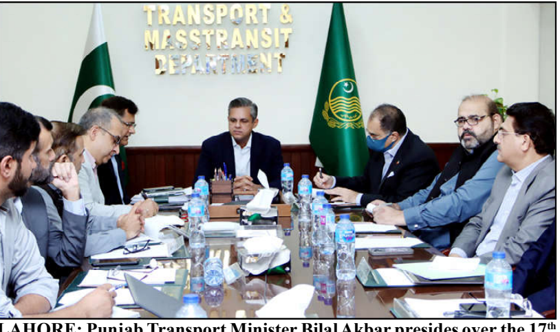
LAHORE: Punjab Transport Minister Bilal Akbar presides over the 17th meeting of Steering Committee for provision of bikes to students.

Dr. Yousaf Zafar highlighted the partnership as a unique opportunity to transform the cotton industry and expressed hope that it would bring Pakistan's cotton standards