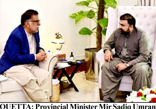
QUETTA: Provincial Minister Mir Sadiq Umrani meeting with Balochistan Chief Minister Mir Sarfraz Ahmed Bugti.

Speaking on the occasion, QESCO chief assured to supply electricity to the important hospitals round the clock.