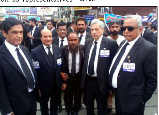
LAHORE: Lawyers gather for cast their votes on occasion of Annual Election of Supreme Court Bar Association 2024-25, held at Supreme Court Registry Building in Lahore.

Addressing the meeting, the Chief Secretary said that interfaith harmony and brotherhood imperative in today's world and we must unite as one nation to play our part in the country's development through mutual respect and love. The meeting was also briefed about interfaith harmony initiatives and challenges at the district level