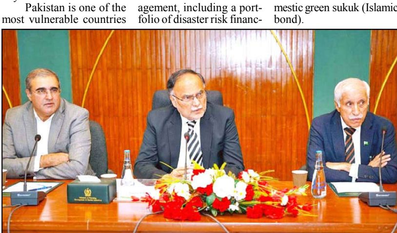
ISLAMABAD: Federal Minister for Planning & Development, Ahsan Iqbal chairing a review meeting of the focal groups constituted by the PM to analyze recommendations made by the Chinese working team.

The program supports mobilization of climate finance from public and private sources. This mate and disaster risk man- includes issuance of a domestic green sukuk (Islamic