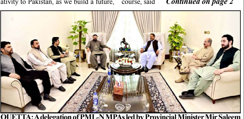
QUETTA: A delegation of PML-N MPAs led by Provincial Minister Mir Saleem Khosa meeting with Balochistan Chief Minister Mir Sarfraz Ahmed Bugti.

The FII conference featured discussions on artificial intelligence, robotics, education, energy, space, public health, and challenges, confronting sustainable development. The prime minister, citing future course, said Continued on page 2