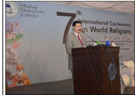
LAHORE: Governor Khyber Pakhtunkhwa Faisal Karim Kundi addressing 7th International Conference on World Religions at Minhaj University.

KARACHI (APP): The Sindh Chief Minister Syed Murad Ali Shah has said that the civilized nations must show their seriousness on the issue of Indian Illegally Occupied Jammu and Kashmir (IIOJK). On the occasion of Kashmir Black Day, he said that 77 years of atrocities of Indian occupation and aggression had gone by. The CM said, "We stand with the Kashmiri people and will continue to support the Kashmiri people against Indian atrocities." He was of the view that India was omitting atrocities on the people of IIOJK. IIOJK was a beautiful valley but India had stained it with blood, he said adding that India, through conspiracy, established her oppressive control over IIOJK and massacred Muslims. Murad said, "Today is the darkest day in the history of the world." The decision of IIOJK based on the resolutions of the United Nations Security Council was the only solution to the problems of the Kashmiri people. Indian aggression had shed the blood of many innocent Kashmiris, he said. The CM further said that India declared herself as a secular state but shy away from recognizing the IIOJK people's right to self-determination. He said, "We will always continue to support the right of the IIOJK people to achieve their legal right to self-determination."