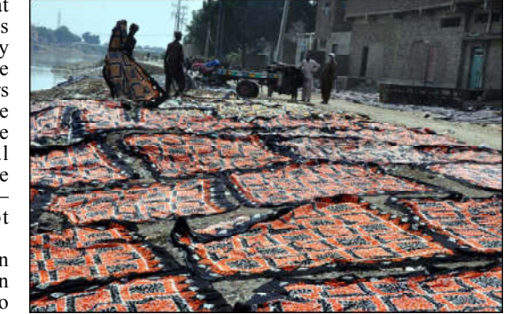
HYDERABAD: Laborers are busy in drying wreaths after washing into Canal in Hyderabad.

Moreover, the report highlights a pronounced disparity in digital development across different provinces and districts in Pakistan, ranging from high to very low levels of digital access.