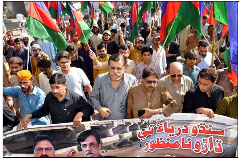
HYDERABAD: Members of Hari Committee are holding protest demonstration against building new canals to draw additional water from the Indus River, anti-people policies decisions and amending the Irsa Act, at Hyderabad press club.