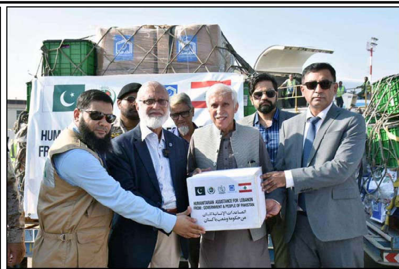
KARACHI: On instructions of Prime Minister, Pak NDMA Dispatched 14th Consignment of 17 tons for people of Lebanon from Jinnah International Airport to Beirut, Lebanon.