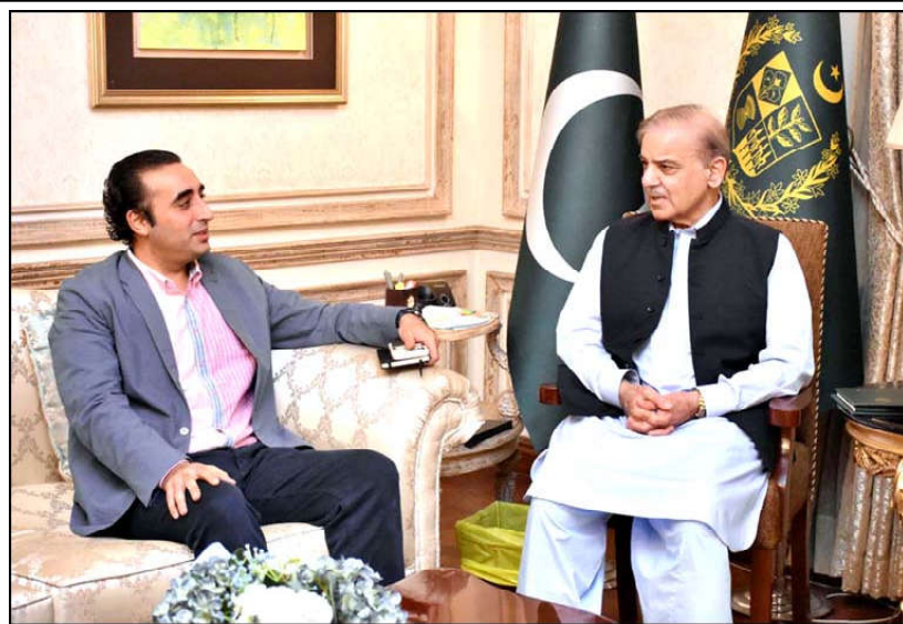
LAHORE: A delegation of Pakistan People's Party led by Chairman Bilawal Bhutto Zardari calls on Prime Minister Muhammad Shehbaz Sharif.

MASTUNG (INP): The security forces on Sunday conducted a successful operation and arrested an alleged terrorist from Mastung, a town in the Balochistan province. Sources close to the development disclosed that the security forces arrested a terrorist while conducting an operation in the Splanji Bazaar area of Mustang district. During the operation, the security officials recovered weapons, ammunition, and binoculars from the possession of the arrested terrorist. Security sources further revealed that the arrested individual had been involved in the murder of two individuals in the Splanji Bazaar area.