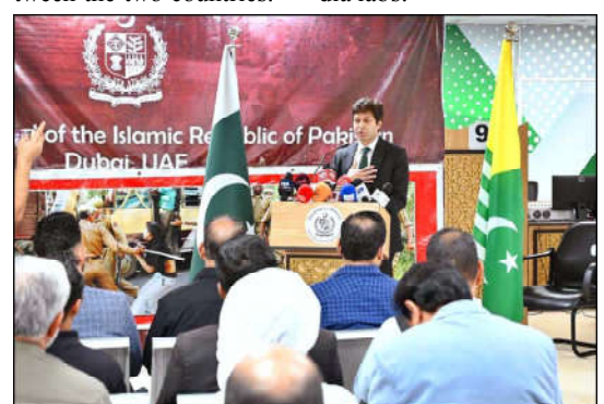
DUBAI: H.E. Hussain Muhammad, Consul General speaks during an event arranged to observe 27th October Kashmir Black Day at the Consulate General of Pakistan.

ISLAMABAD (INP): Pakistan's Air Traffic Control (ATC) has heightened monitoring of air traffic entering Pakistani airspace in response to escalating tensions between Iran and Israel. Media reports indicate that the closure of Iranian airspace has led to flights rerouting through Omani airspace instead. Pakistan is particularly focused on monitoring flights approaching its airspace from the west. Each flight is being verified before being granted entry.