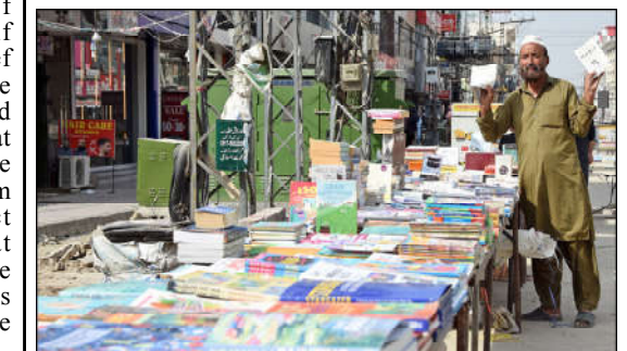
RAWALPINDI: A vendor is selling old books on his roadside workplace at Sadar area in the city.

He said through trade liberalization, countries can tap into global markets and enhancing their economic dynamism. Integrating with the global economy supports innovation and raises productivity, as companies adapt to international standards and practices, he added.