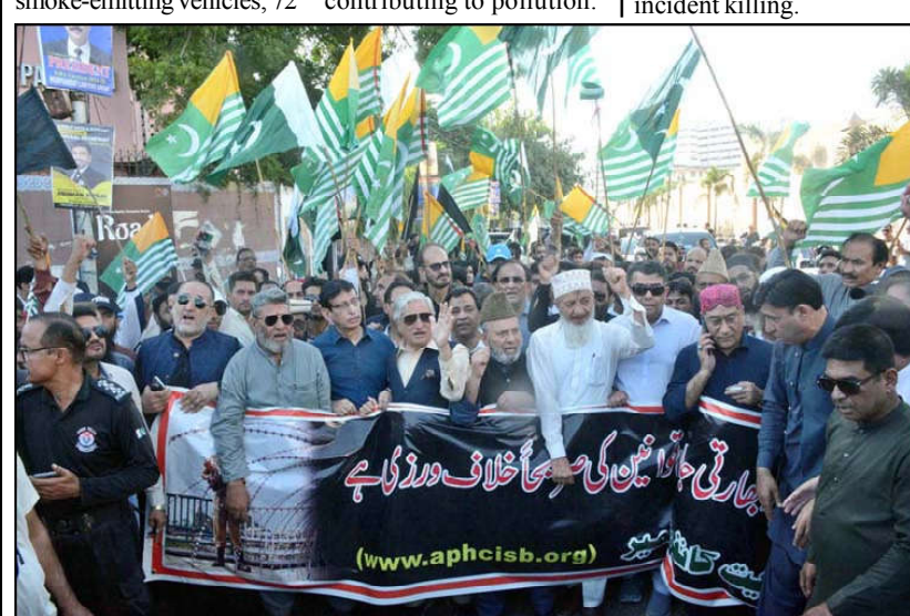
KARACHI: Participants of the All Parties Hurriyat Conference participate in rally and chant slogans against Indian atrocities in IIOJK on Kashmir Black Day.

LAHORE (APP): Senior Provincial Minister Maryam Aurangzeb said on Sunday that following Chief Minister Maryam Nawaz Sharif's directives, the Environment Protection Department's squads have demolished four industrial units in Lahore for contributing to pollution. These factories had repeatedly ignored notices to install emission control systems. Additionally, 941 vehicles were inspected, with fines issued to 234 smoke-emitting vehicles, 72 vehicles impounded, and total fines amounting to 503,000 rupees. In other actions, six kilns in Layyah, one in Sheikhupura, and four in Rawalpindi were shut down for failing to convert to zigzag technology. Maryam Aurangzeb stated that Chief Minister Maryam Nawaz Sharif had directed the Environment Protection Department to act against smog without any compromise. She urged Lahore's residents to actively support the anti-smog action plan and avoid contributing to pollution.