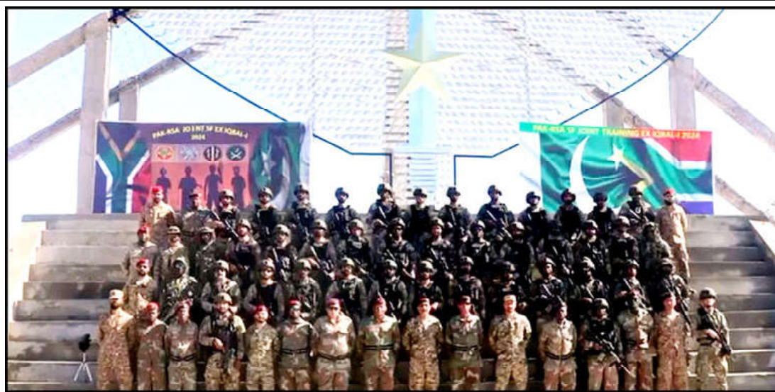
RAWALPINDI: The Combat Teams from Special Services Group, Pakistan Army and Republic of South Africa Special Forces in a group photo during closing ceremony of Pakistan-South Africa Joint Exercise Iqbal-I.

to what many view as a day of occupation and highlights the region's struggle for self-determination. The Council's objective basically is to push for a peaceful settlement of the decades-old Kashmir dispute, he said. Pakistan's Ambassador to Sweden, Bilal Hayee, said that the tragedy of Kashmir began when India occupied the State of Jammu and Kashmir by sending its army without the consent of