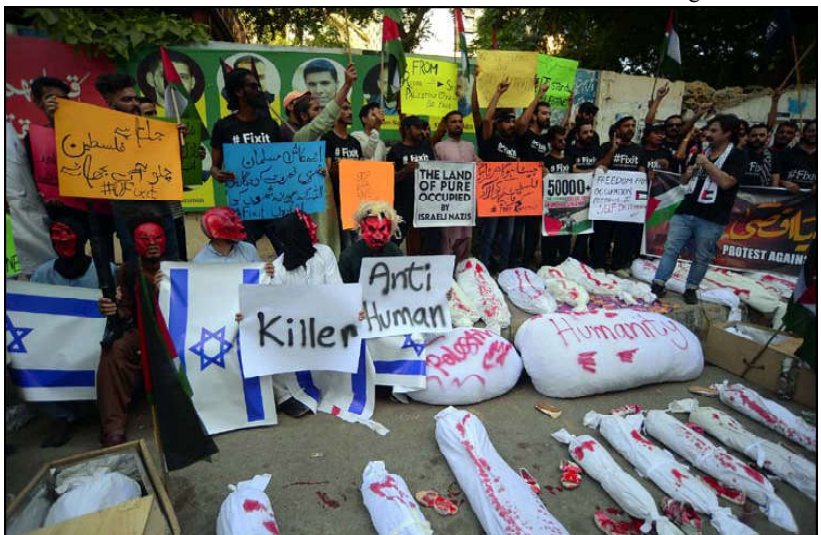
KARACHI: Members of Fixit Organization are holding protest demonstration against Israeli cruel and inhumane acts and expressing unity with the innocent people of Palestine, at Karachi press club.