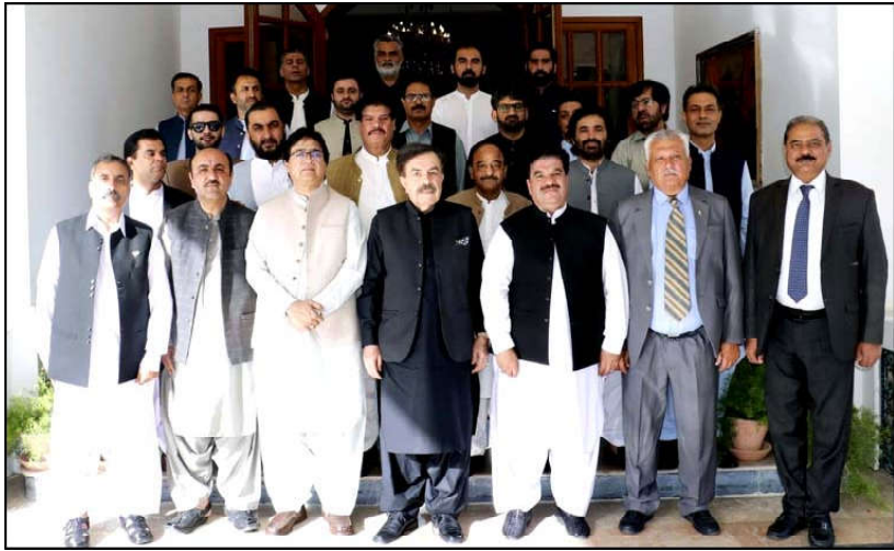
QUETTA: Balochistan Governor Jaffar Khan Mandokhail in a group photo with PML-N Balochistan Lawyers Wing.