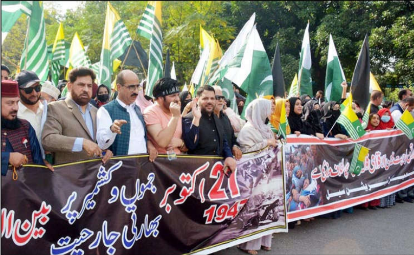
ISLAMABAD: Kashmiris peoples participate in a rally organized by Hurriyat Conference on the occasion of 77 years of Indian occupation of Occupied Kashmir on the occasion of Black Day.