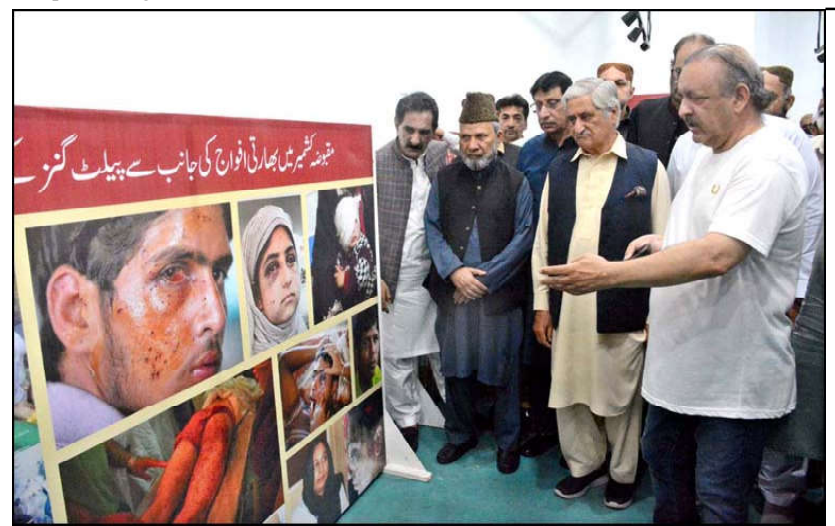
KARACHI: The former President and Prime Minister of Azad Jammu and Kashmir (AJK) Sardar Mohammed Yaqoob Khan with other participants viewing pictorial exhibition on the occasion of Kashmir Black Day at Arts Council of Pakistan.