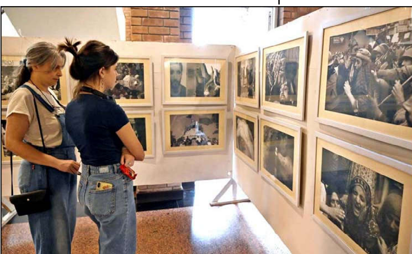
ISLAMABAD: Foreigner women keenly viewing photos during an exhibition at PNCA on the occasion of Kashmir Black Day.

their skills in digital economy and promote entrepreneurship and innovation in digital sectors," the officials remarked. "Provision of Telescopes to 110 schools and colleges would boost students' interest in astronomy and science." National Institute of Excellence in Teacher Education (NIETE) has been launched to train teacher through latest digital modes and AI-powered tools for improving their performance. Recruitment of Tech, Coding and Robotics Fellows would support schools in teaching coding and AI while financial literacy would equip both students and teachers for fiscal management. Provision of Foreign Language Labs to teach students Korean, German, Arabic, Japanese, and Chinese languages would also help broaden students' global outlook ensuring better career opportunities and cross-cultural competence.