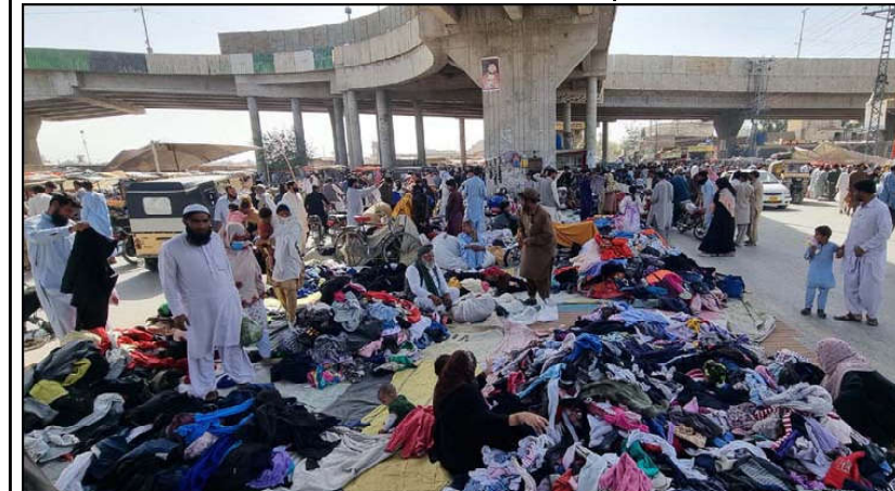
QUETTA: Warm clothes are being selling at a roadside stall as the demand of warm clothes increased in city on the arrival of winter season, at a weekly bazar in Quetta.

In light of the vast scope of the anti-smuggling jurisdiction and the shortage of personnel, a collaborative anti-smuggling strategy has been implemented through this Transformation.