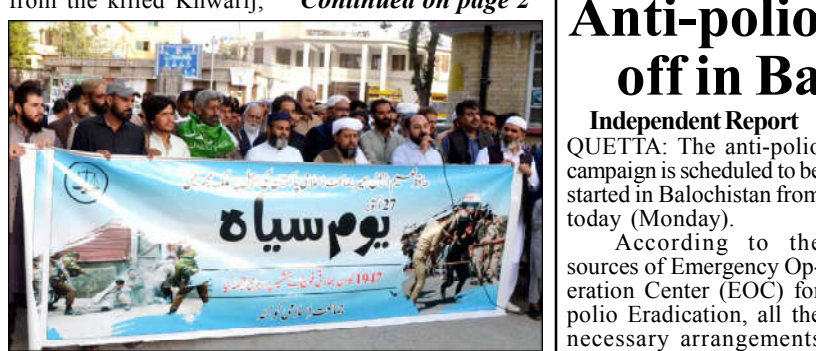
QUETTA: Activists of Jamat-e-Islami (JI) are holding rally to express solidarity with Kashmiri people and condemn brutality of Indian Army in Kashmir on the occasion of Black Day of Kashmir, in Quetta.

Sanitization of the area is being carried out to eliminate any other Khawarij found in the area as security forces of Pakistan are determined to wipe out the menace of terrorism from the country. Meanwhile, President Asif Ali Zardari on Sunday paid tribute to security forces for launching two successful operations against terrorists in Khyber Pakhtunkhwa. The president, in a statement, commended the bravery of security forces