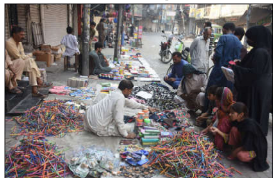
LAHORE: Citizens are busy in shopping on Sunday in the provincial capital.

Afghanistan, Iran, and Central Asian states as this strategy can offer mutual benefits, leveraging each country's unique resources and industries to create a fair exchange of goods and services. By reducing reliance on any single market, Pakistan could mitigate risks and enhance its economic resilience. He said balanced bilateral trade would also promote economic growth by stimulating local industries, and increasing foreign exchange earnings besides creating ample jobs. Pakistan's trade deficit is a complex issue.