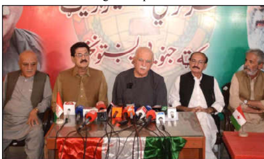
QUETTA: Chairman PkMAP Mehmood Khan Achakzai addressing a Press Conference.

ISLAMABAD (APP): Deputy Prime Minister and Foreign Minister Mohammad Ishaq Dar on Sunday said that Pakistan remained committed to promoting peace in South Asia and sought constructive relations with all neighbors, however, lasting peace in the region could not be realized without a just and peaceful settlement of the Jammu and Kashmir dispute, in line with the UNSC resolutions and the aspirations of Kashmiri people. "Pakistan stands in unwavering solidarity with the Kashmiri people in their struggle and will continue to provide its full political, moral and diplomatic support to the realization of their inalienable right to self-determination," the deputy prime minister/foreign minister said on the observance of Kashmir Black Day. He said October 27 marked a somber turning point in the history of Jammu and Kashmir. On this day, seventy-seven years ago, the Indian forces landed in Srinagar, marking the beginning of a prolonged and painful chapter for the region. Over the past seven decades, India has employed various strategies to strengthen its control over Indian Illegally Occupied Jammu and Kashmir (IIOJK), he added. However, since August 5, 2019, they had witnessed an accelerated effort to undermine the internationally recognized disputed status of IIOJK.