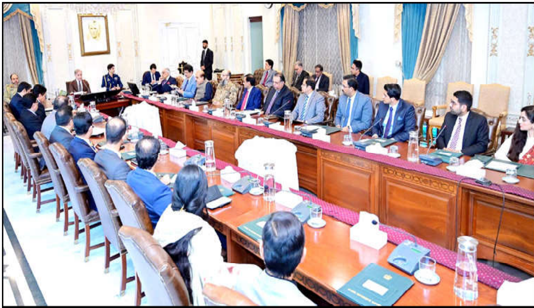
ISLAMABAD: Newly selected Community and Labor Welfare Attachés call on Prime Minister Muhammad Shehbaz Sharif.