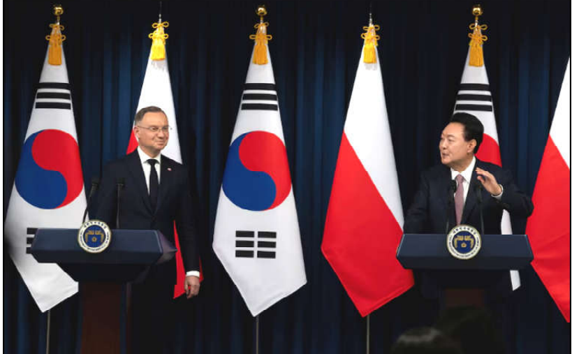
South Korean President Yoon Suk-yeol and Polish President Andrzej Duda speak during a joint press conference at the Presidential Office in Seoul, South Korea.