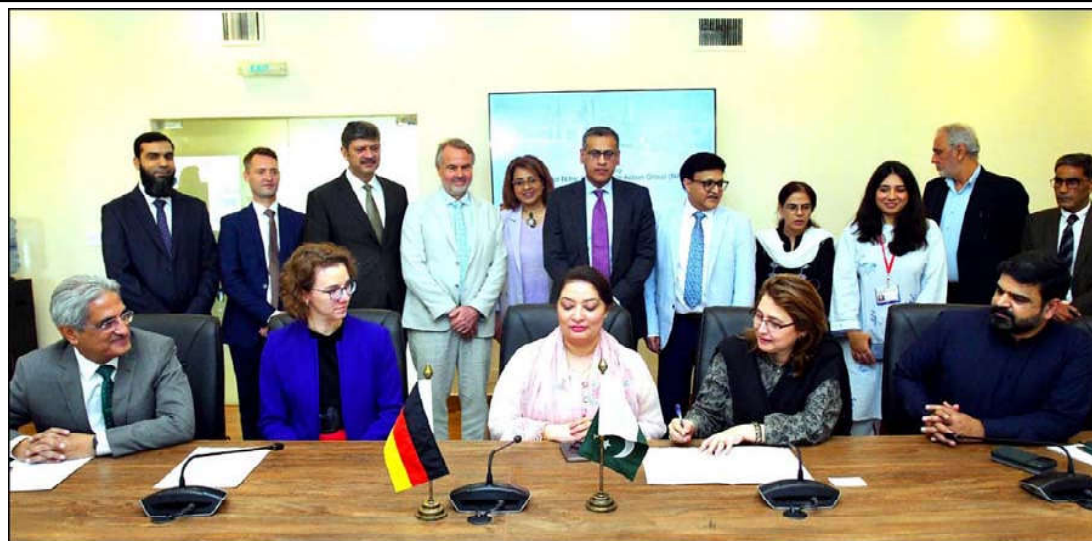
ISLAMABAD: Coordinator to the Prime Minister on Climate Change and Environmental Coordination, Romina Khurshid Alam signs Statement of Understanding (SoU) with private sector members to mitigate nitric acid mitigation pact for enhanced national climate action held at the Ministry of Climate Change and Environmental Coordination in Islamabad.