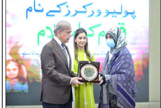
ISLAMABAD: Prime Minister Muhammad Shehbaz Sharif presenting souvenirs to front line Polio Workers and the relatives of those Polio Workers who embraced martyrdom in the line of duty.

ISLAMABAD (APP): The prime minister, who earlier launched a nationwide polio vaccination drive by administering polio drops to the children, appreciated the support from international partners including the World Health Organisation, UNICEF, and Bill and Melinda Gates Foundation, who had contributed to Pakistan's efforts to fight out the polio. "With this commitment, we will meet success and polio will be pushed out of the country and will never be allowed to resurface," he resolved, and also appreciated the Saudi government's support. Calling them the "real heroes" the prime minister paid tribute to the sacrifices of the polio workers in the ISLAMABAD (APP): Prime Minister Shehbaz Sharif on Thursday paying tribute to the efforts and sacrifices of the polio workers, and support by the international partners, reiterated his government's resolve to make Pakistan a polio-free country to save the future of millions of children. The prime minister, addressing an event held on World Polio Day dedicated to recognise the sacrifices of the polio workers, said that the resurfacing of the polio cases in the country required reuniting the efforts to fight the menace. He reaffirmed that the government would face the challenge with an unwavering commitment to purge the country of this crippling disease. Continued on page 2