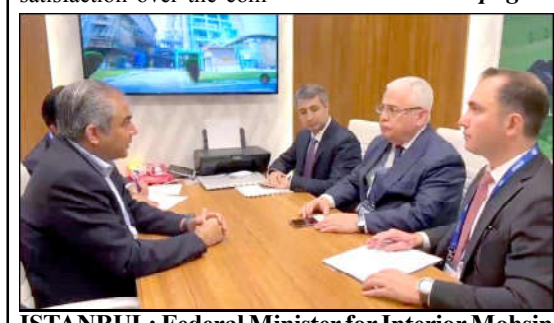
ISTANBUL: Federal Minister for Interior Mohsin Naqvi in a meeting with Azerbaijan's Minister of State for Interior Aliyev Ismat Rashid in Istanbul.