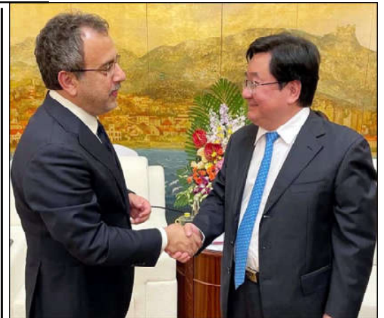
QINGDAO: Federal Minister for Power, Sardar Ahmad Khan Leghari, meets Mr. Yao Huan, Vice-President of Power China on the sidelines of the Third Belt & Road Energy Ministerial Conference in Qingdao, China.

and leverage data from the Sustainable Development Science Satellite 1 (SDGSAT-1), which supports the attainment of the SDGs and fosters a data-driven approach to sustainable development. According to sources, this partnership aims to enhance data sharing.