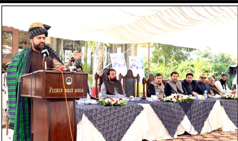
PISHIN: Chief Minister Balochistan Mir Sarfaraz Ahmed Bugti addressing participants of inaugural ceremony of shifting of agriculture tubewells on solar energy.