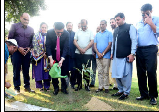
KARACHI: Governor Khyber Pakhtunkhwa Faisal Karim Kundi plants a sapling under POA Environment Commissioner Tree Plantation drive at KPT Football Stadium.