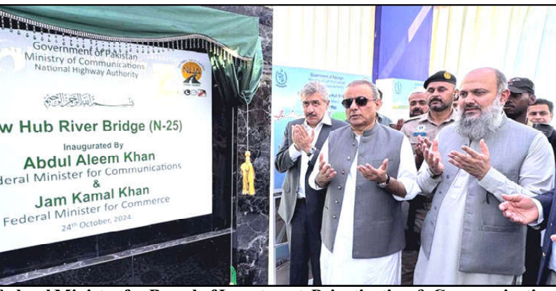
Federal Minister for Board of Investment, Privatization & Communications Abdul Aleem Khan and Federal Minister for Commerce Jam Kamal Khan inaugurating the Hub River Bridge (N-25).