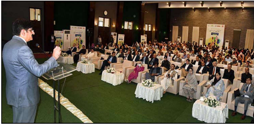
KARACHI: Sindh Chief Minister, Syed Murad Ali Shah addresses the audience during the World Polio Day Program, held at CM House in Karachi.