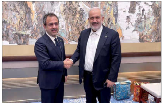
QINGDAO: Federal Minister for Power Sardar Awais Ahmed Khan meets with Iranian Energy Minister Abbas Ali Abadi on the sidelines of the 3rd Belt & Road Ministerial Conference in Qingdao, China.

WASHINGTON (INP): More than 60 members of the US House of Representatives have written a letter to President Joe Biden urging him to pressure Islamabad to release PTI founder Imran Khan. The congressmen stressed the president that efforts should be made to also secure release of other political prisoners in Pakistan. The former prime minister has been incarcerated since August last year after his conviction in several criminal case ahead of the February 8 elections. In their letter, the lawmakers belonging to the Democratic party urged President Biden to prioritise human rights in the US policy towards Pakistan. "We write today to urge you to use the United States' substantial leverage with Pakistan's government to secure the release of political prisoners including former Prime Minister Khan and curtail widespread human rights abuses," they wrote. They also asked the US embassy officials to visit Imran in Adiala Jail. The letter marked the first such collective call from congressmen for the release of Imran, "who otherwise has had tenuous relations with Washington as a long standing critic of US foreign policy."