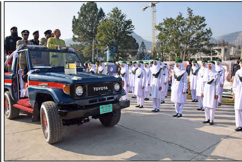
MUZAFFARABAD: President Azad Kashmir, Barrister Sultan Mahmood Chaudhry inspecting the parade on the occasion of the 77th foundation day of Azad Kashmir.

Servants (Appointments, Promotion and Transfer) Rules, 1989 for reservation of quota for transgender, revising the fourth condition of its decision taken in the 12 th meeting of the Provincial Cabinet allowing partial relaxation of ban for creation of positions of project employees with domicile from other than Ex-FATA. The cabinet approved guidelines for nomination of the chairman for production Bonus Utilization Committee and revised production Bonus Guidelines 2024. Under Petroleum Exploration and Production Policy 2012, the Production Bonus is payable once commercial production of Oil and Gas commences from a producing field. The Policy authorizes the Provincial Government to issue guidelines.