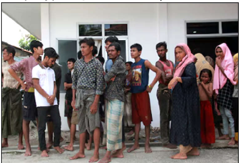
Rohingya refugees are pictured at a temporary shelter after they landed at Labu Pekan beach in Deli Serdang, North Sumatra province, Indonesia.

Monitoring Desk LONDON: Britain will ban single-use vapes from next year, a government minister said on Thursday, seeking to crack down on the environmental harm and rising usage levels among children. Health authorities have raised concerns about the use of vapes among young adults, with their colourful designs and fruity flavours making them stand out on grocery store shelves. According to a 2024 survey by health charity ASH, about one in five children aged 11-17 said they had tried vaping.