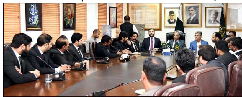
ISLAMABAD: Federal Minister for Law and Justice Senator Azam Nazeer Tatar held a meeting with Lawyers from various Bar Associations.

ISLAMABAD (APP): The representatives of different bar councils on Thursday met Minister for Law and Justice Senator Azam Nazeer Tatar. The representatives of bar associations from Jhelum, Khushab, Sohawa, Chuniyan and Nurpur Thal held meeting with the law minister. They discussed the discussion on various issues related to bar councils. The law minister said that Bank of Punjab branches and counters will be opened in court premises after discussing with the Punjab government and the Punjab Bar Council on the issues of court fees and stamps. The contact has been established between the Vice Chairman Punjab Bar Council Chaudhry Babar Waheed and the management of Bank of Punjab. He assured that full cooperation while discussing the problems of lawyers and said that government prioritizes welfare schemes for lawyers.