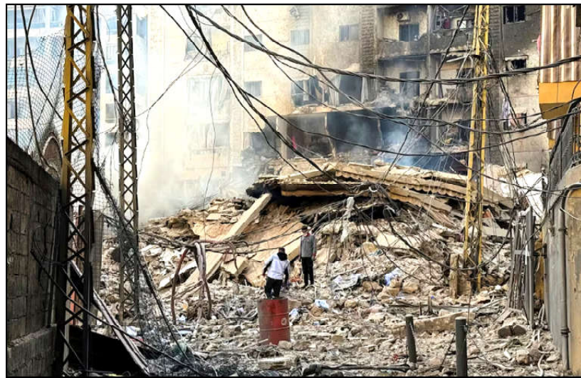
Men walk on the rubble at a site damaged in the aftermath of Israeli strikes on Beirut's southern suburbs, amid the ongoing hostilities between Hezbollah and Israeli forces, Lebanon.

Monitoring Desk BEIRUT: Lebanon state media reported 17 Israeli raids on Beirut's southern suburbs, with six buildings levelled and the vacated offices of a pro-Iran broadcaster hit as the Iran-Hezbollah war reached its one-month mark. APFPTV footage showed a massive explosion followed by smaller blasts in the embattled southern suburbs after the Israeli army issued an evacuation warning for the area, where Hezbollah holds sway. The official National News Agency (NNA) reported at least 17 Israeli raids, marking one of the most violent nights in the area since the Israel-Hezbollah war erupted on Sep 23. Six buildings were destroyed around the suburb of Layluki, NNA said, calling the raids "the most violent in the area since the beginning of the war." The strikes came shortly after the Israeli military's Arabic-language spokesman, Avichay Adraee, issued evacuation warnings on social media platform X. There was no warning, however, for a strike that hit the Jnah neighbourhood in southern Beirut.