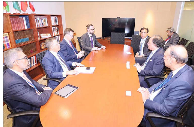
WASHINGTON DC: Federal Minister for Finance and Revenue Senator Muhammad Aurangzeb held a meeting with the delegation of Standard Chartered Bank.