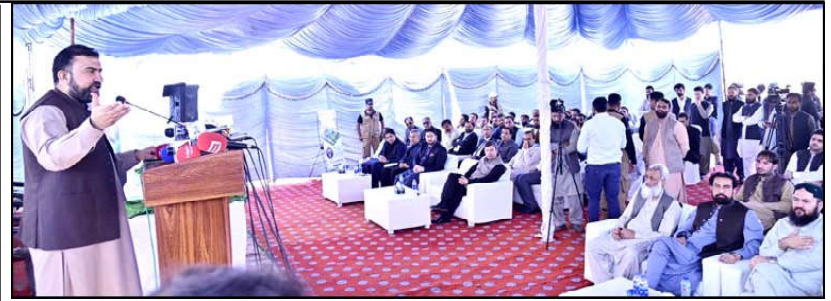
QUETTA: Chief Minister Balochistan Mir Sarfaraz Ahmed Bugti addressing inaugural ceremony of Circular Road Parking Plaza.

The finance minister said that alongside privatizing state-owned enterprises (SOEs), Pakistan's IMF deal also rests on increasing its tax base, and reforming of the country's power sector. Aurangzeb told AFP there was a common theme between all three major issues. Pakistan is hoping to finalize the delayed privatization of its flag carrier and the outsourcing of Islamabad's international airport in November, the minister said. During a previous interview with AFP in April, Aurangzeb had said he hoped the privatization of the government-owned Pakistan International Airlines (PIA) could be completed by June 2024. The finance minister said the five-month delay was down to two factors: ensuring macroeconomic stability, and doing the proper due diligence of the interested parties. "The reality is, when any foreign investor comes in, or even the local investor, who is going to put in a substantial amount of money, they want to ensure that the foundation is there," he said, referring to macroeconomic factors.