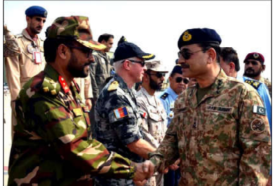
RAWALPINDI: Chief of Army Staff (COAS), General Syed Asim Munir interacts with aircrew during the Multinational Exercise Indus Shield-2024, at an operational Air Base of Pakistan Air Force (PAF).