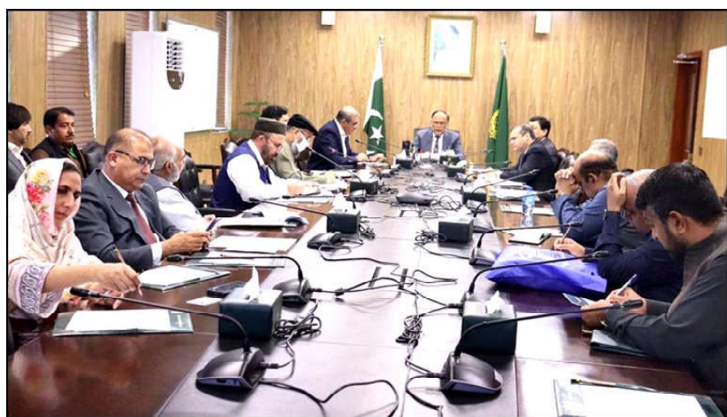
ISLAMABAD: Federal Minister for Planning, Development & Special Initiatives, Ahsan Iqbal, chairing a meeting of the Prime Minister's Committee for Planning and Execution of Foreign-Funded Development Projects in Federal Capital.