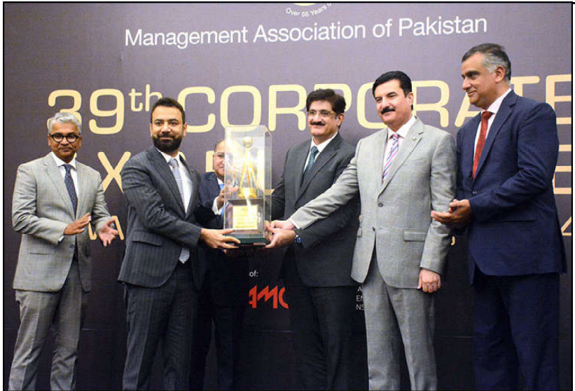
KARACHI: Sindh Chief Minister Murad Ali Shah distributes awards at the 39th Corporate Excellence Awards ceremony, organized by the Management Association of Pakistan (MAP), KP Governor Faisal Karim Kundi was also present on the occasion.