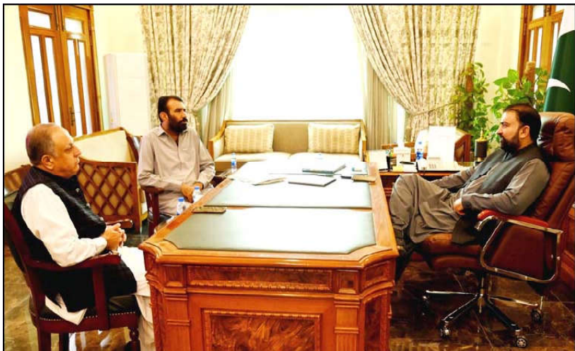
QUETTA: Parliamentary Secretary Transport Abdul Majeed Badini and leader of PPP Mir Changez Khan Jamali meeting with Chief Minister Balochistan Mir Safaraz Ahmed Bugti.

politics due to multiparty system. There can be no polarization in judiciary because it is institution of justice. Polarization of extreme level was seen supreme court since some period. Senior judges can have what objection over appointment of junior judge as chief justice of Pakistan. Congress accords approval to the appointment of judges in US. The power for appointment of judges of SC rest with parliamentarians in India. Members of parliament can make attachment of judges in India as well.