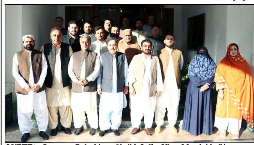
QUETTA: Governor Balochistan Sheikh Jaffar Khan Mandokhail in a group photo with Provincial Ministers and MPAs belong to PML-N.

Shehbaz Sharif prayed for the families of the victims as well as speedy recovery of the injured.