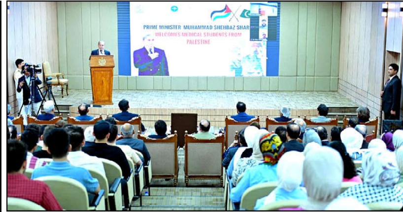
ISLAMABAD: Prime Minister Muhammad Shehbaz Sharif addressing a ceremony held in honour of students of Palestine who recently arrived in Pakistan to complete their medical education.