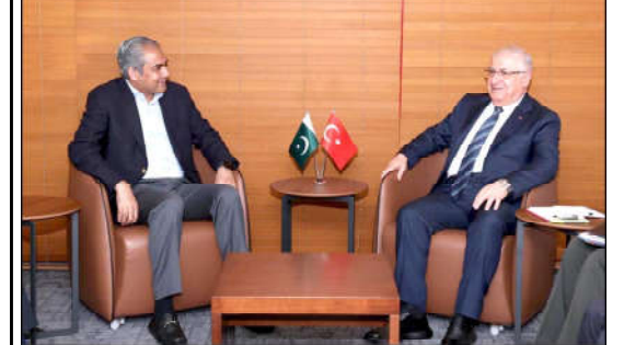
ISTANBUL: Federal Minister for Interior Moin Naqvi in a meeting with Turkiye Minister of National Defense Yasar GÜLER.

President Zardari also approved October 26 as the date for administering the oath of office to Justice Yahya Afridi as the next