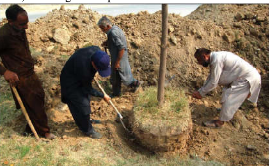
ISLAMABAD: CDA workers start relocate the plants from the site of new flyover site on Jinnah Avenue.