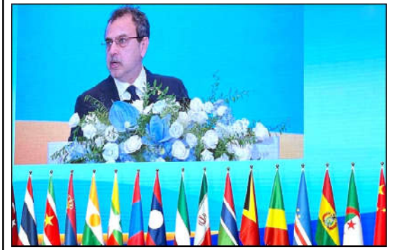
QINGDAO: Federal Minister for Power, Sardar Awaish Ahmad Khan Leghari delivers a keynote address at the opening ceremony of the 3rd Belt & Road Energy Ministerial Conference at Qingdao.