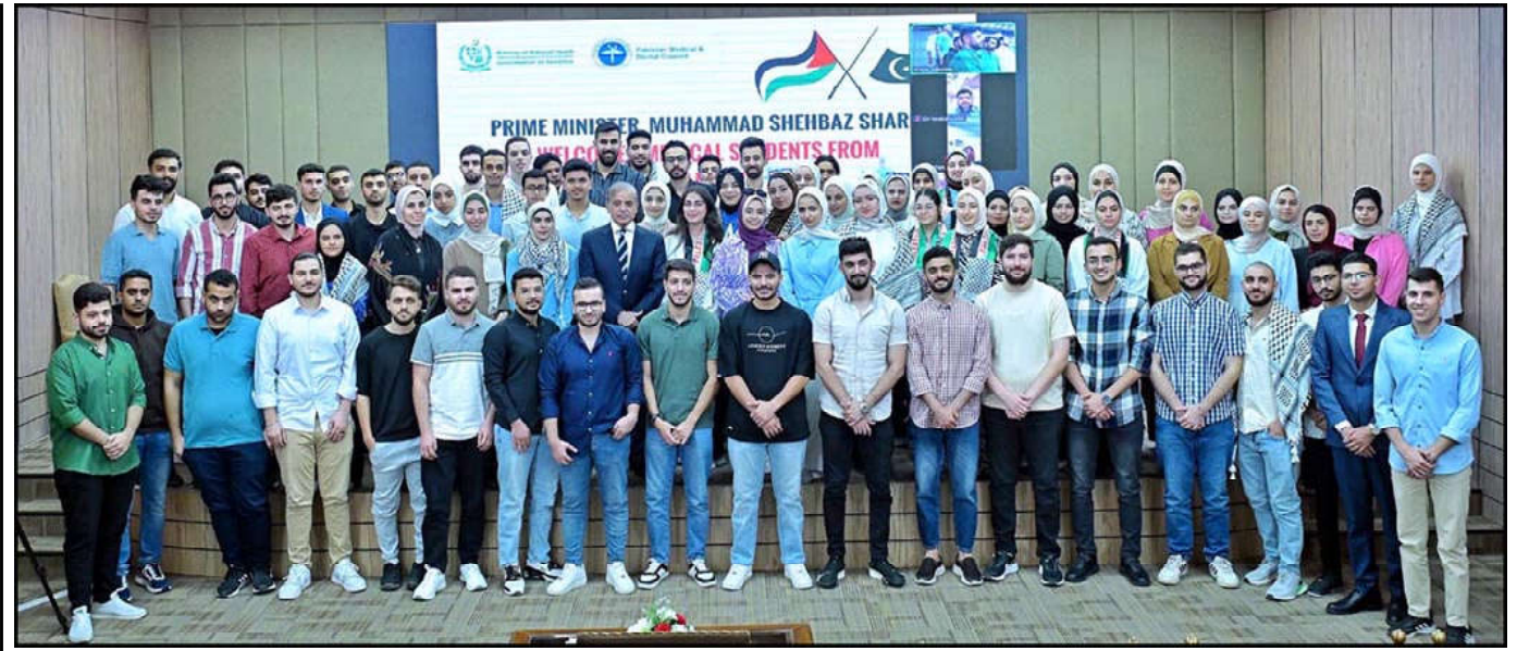
ISLAMABAD: Prime Minister Muhammad Shehbaz Sharif in a group photo with students of Palestine who recently arrived in Pakistan to complete their medical education.