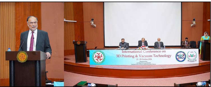
ISLAMABAD: Minister for Planning, Ahsan Iqbal, inaugurates the First International Conference on 3D Printing and Vacuum Technology at National Center for Physics, Quaid-i-Azam University.

The IG directed all zonal officers, circle officers, and SHOs to carry out organized operations at crime hotspots within a given timeframe and implement anti-crime measures. Syed Ali Nasir Rizvi emphasized that protecting the lives, property, and dignity of the citizens of Islamabad is the top priority of the ICT Police.