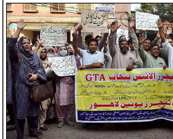
LAHORE: Members of Grand Teachers Alliance (GTA) Punjab are holding protest demonstration for timescale promotions and other demands, at Hall road in Lahore.