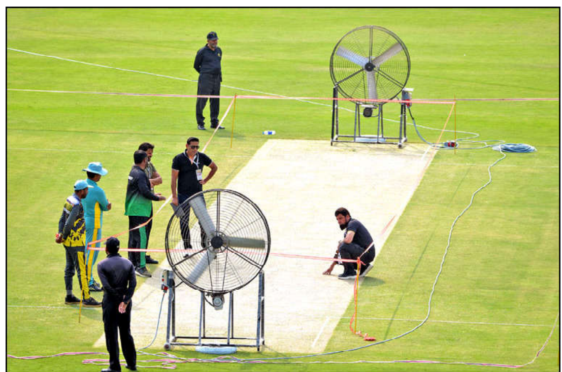
RAWALPINDI: Members of Pakistan’s Cricket Board selection committee Aleem Dar and Aqib Javed inspect the pitch during a practice session on the eve of their third and final Test cricket match between Pakistan and England at the Rawalpindi Cricket Stadium, in the city.

ISLAMABAD (APP): President Asif Ali Zardari on Wednesday urged the countrymen to pursue the late Nusrat Bhutto’s mission of public welfare and strengthening of democracy in the country. The president, in his message on the 13th death anniversary of the Madar-e-Jamhuriat (Mother of Democracy) Nusrat Bhutto, called for following her ideology as a role model to strengthen democracy. Paying tribute to the late Nusrat Bhutto’s great political services and struggle against the dictator for the restoration of democracy and people’s rights, the president said that she played a leadership role for the Pakistan Peoples Party in difficult times.