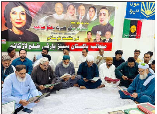
NAUNDERO: Leaders and activists of Peoples Party (PPP) are reciting Holy Book (Quran) and offer Fataha for the soul of Begum Nusrat Bhutto on the event of her Death Anniversary held in Naundero.