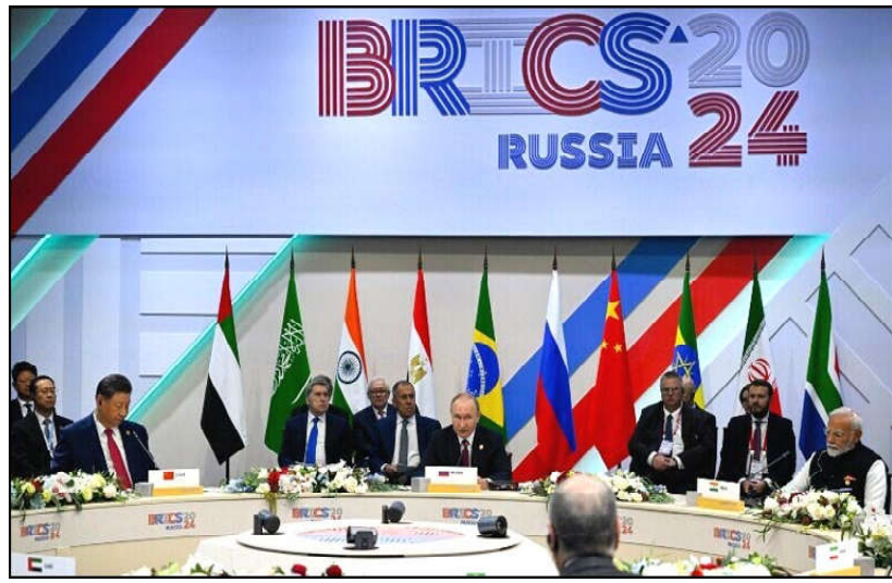
Chinese President Xi Jinping, Russia's President Vladimir Putin and Indian Prime Minister Narendra Modi attend the narrow format meeting of the Brics summit in Kazan.