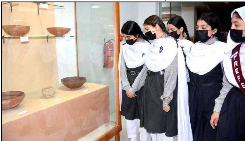
QUETTA: Students of meridian public high school visiting Mehrgharh Museum.