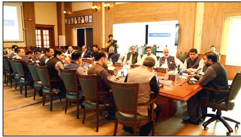
QUETTA: Chief Minister Balochistan Mir Sarfraz Ahmed Bugti presiding over a meeting to review progress on development projects.

In addition to this, millions of dollars could be saved after decreasing dependency on the imports of organic goods.