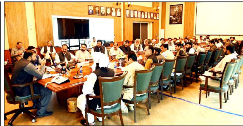
QUETTA: Heads of Local Bodies institutions meeting with Chief Minister Balochistan Mir Sarfaraz Ahmed Bugti.

other appropriate measures to strengthen universal peace," President Secretariat Press Wing, in a press release on Wednesday, quoted the president as saying. Guided by the vision of founding father, Quaid-e-Azam Muhammad Ali Jinnah, the president said, Pakistan had consistently championed the principles of the UN Charter. "We have maintained a firm and abiding commitment to multilateralism, with the UN playing a central role for the promotion of international peace and security, sustainable development and human rights for all. We have also made invaluable contributions to international peace and security, including by serving as a leading military and police contributor to UN peacekeeping operations," he added. Despite its remarkable