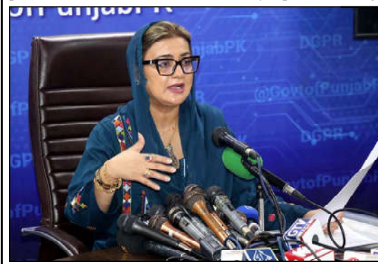
LAHORE: Punjab Information Minister, Azma Bukhari addresses to media persons during press conference, in Lahore.

besides lowering the registration and renewal fee of a quality and environment-friendly plastic bag manufacturing factory. The Cabinet also gave approval to recruit 310 Environment Inspectors besides approving the purchase of 250 e-bikes and a Standard Uniform for them. The Cabinet approved the establishment of Punjab Examination, Curriculum, Training and Assessment Authority (PECTAA) besides approving CM Punjab laptop scheme. Madam Chief Minister directed the authorities concerned to give laptops to students as soon as possible.