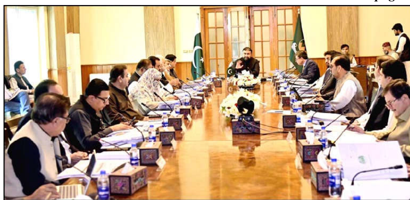
QUETTA: Chief Minister Balochistan Mir Sarfraz Ahmed Bugti presiding over meeting of Provincial Cabinet