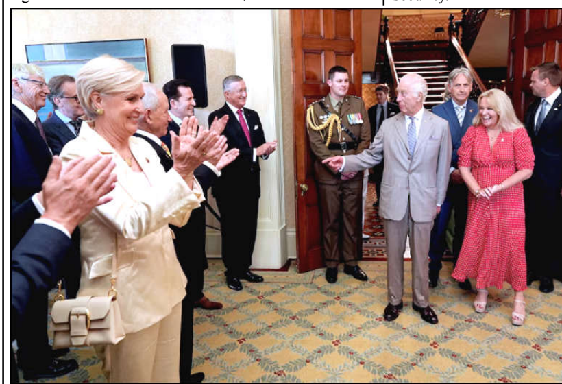
Britain's King Charles attends a King's Foundation Australia event at Admiralty House in Sydney, during the royal visit to Australia and Samoa.

Mpox, a viral disease related to smallpox that causes fever, body aches, swollen lymph nodes and a rash that forms into blisters, has two main subtypes — clade 1 and clade 2. From May 2022, clade 2 spread around the world, mostly affecting gay and bisexual men in Europe and the United States. In July 2022, the World Health Organisation (WHO) declared an international public health emergency.