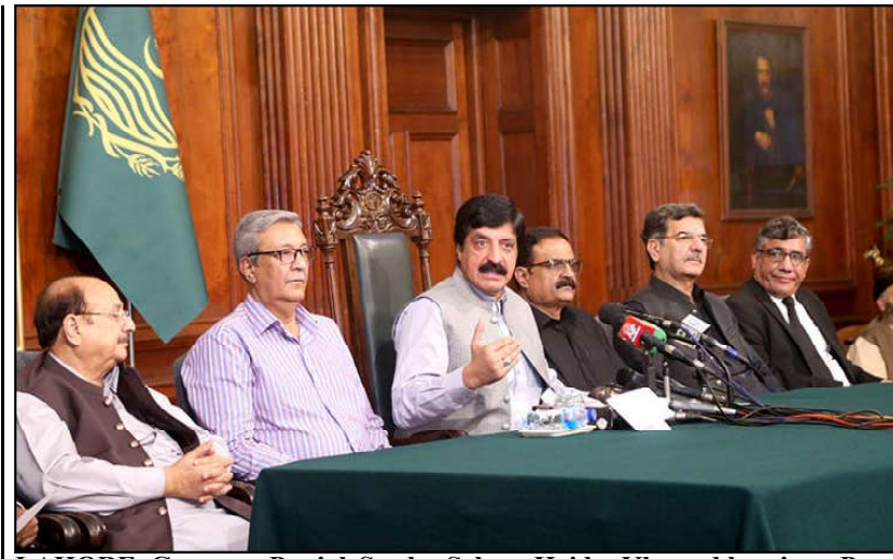
LAHORE: Governor Punjab Sardar Saleem Haider Khan addressing a Press Conference at Governor House.