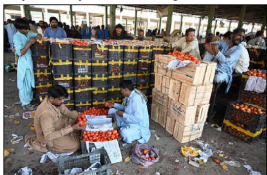
HYDERABAD: Labourers carefully pack best quality tomatoes into wooden crates for delivery at vegetable market.