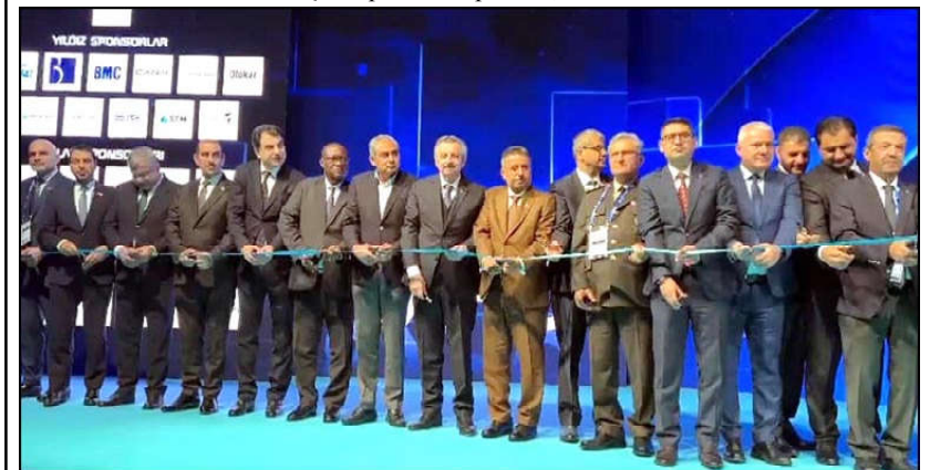
ISTANBUL: Federal Minister for Interior Mohsin Naqvi along with other delegates inaugurating SAHA Expo in Istanbul Türkiye.