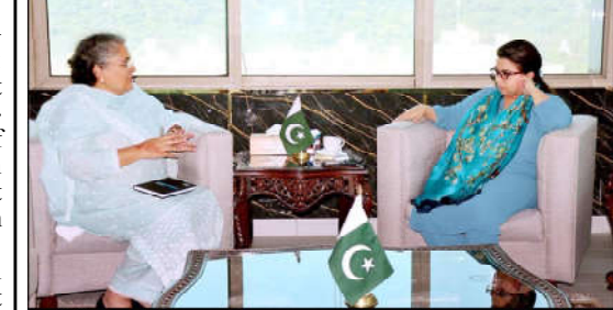
ISLAMABAD: Minister of State for IT and Telecommunication, Ms. Shaza Fatima Khawaja in a meeting with Pakistan Ambassador to Germany Ms. Saqlain Syedah in Federal Capital.

ISLAMABAD (Online): A girl has been murdered in the name of honor in federal capital Islamabad. Brother of girl murdered her sister in the name of honor in the area of Golra police. Brother cut the throat of girl with knife. According to police brother of victim had suspicion of moral conduct of his sister. The victim girl was absent from home since the last one year. Brother killed her on her return to home. The case has been registered on the report of uncle of girl. The family members and residents of mohallah handed over the accused to police.