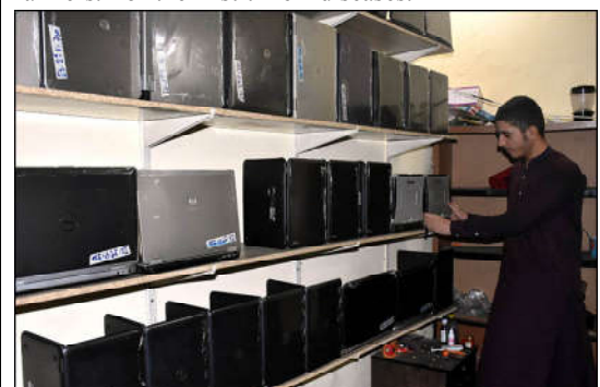
LAHORE: Shopkeeper displaying Laptop to attract costumers at Hall Road.

Provincial Minister for Livestock Balochistan Sardar Faisal Khan Jamali said, "We need vaccines from Punjab to protect our sheep and goats from diseases."