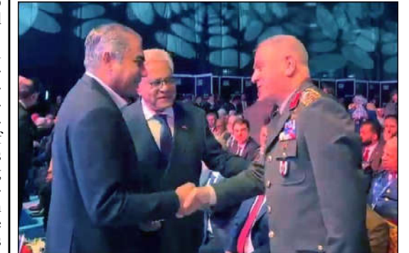
ISTANBUL: Federal Minister for Interior, Mohsin Naqvi shaking hands with Chief of the Turkish General Staff Gen. Metin Gurak at the inauguration of SAHA Expo in Istanbul.

tarian aid to Lebanon and Gaza. He said apart from air, relief goods should be sent by trucks. Directing to accelerate the transportation of humanitarian aid, Shehbaz Sharif emphasized ensuring the aid reaches the deserving ones. The meeting was informed that Pakistan is sending tents, clothes, blankets, medicines and food items to people affected by Israeli aggression in Gaza and Lebanon. It was informed that due to Israeli attacks and blockades, there are difficulties in delivering aid supplies to the affected areas in Palestine and Lebanon. The meeting was informed that the NGOs who want to send relief goods for the victims of Gaza and Lebanon will be facilitated by the government.