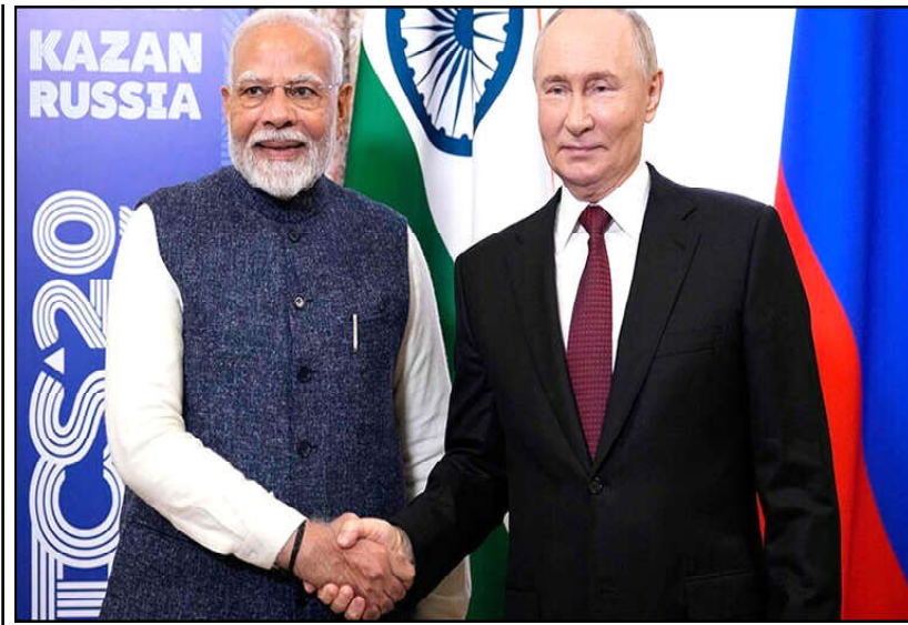
Russia's President Vladimir Putin meets with Indian Prime Minister Narendra Modi on the sidelines of the Brics summit in Kazan.

On the eve of the BRICS summit, Putin met with United Arab Emirates President Sheikh Mohammed bin Zayed Al Nahyan for informal talks that went on until midnight at his Novo-Ogaryovo residence outside Moscow.