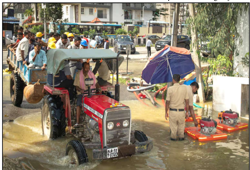
Workers ride a tractor through a flooded street after heavy rains in Bengaluru, India.

The Lee brothers are the sons of Lee Kuan Yew, modern Singapore's founding father. They have been engaged in a public spat since 2017 over the late patriarch's family home.