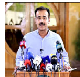
The cabinet members reiterated their determinations that under the leadership of Balochistan Chief Minister Mir Sarfraz Bugti, the government is striving hard to improve the governance model to extend relief to the masses and resolve the challenges.

The Balochistan Cabinet in its meeting held under the chairmanship of Chief Minister Mir Sarfraz Bugti approved the first-ever digital and social media policy in the province. Under the policy, a comprehensive framework related to social media will be formulated and the positive