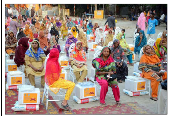
HYDERABAD: Ration distribution is underway among Hindu Community in connection of Diwali celebration organized by Al-Khidmat Foundation, at Circuit House Mandir in Hyderabad.

districts, including Upper and Lower Kohistan, Kolai Palas, Torghar, Upper and Lower Chitral, Tank, and Upper and Lower South Waziristan. Children attending government schools in these areas will receive 1,000 rupees per month, and they will also be able to get free admission to registered private schools. In the first phase, 40,000 children will benefit from this program. Additionally, girls in grades 6 to 10 across the province will receive 500 rupees per month as an educational stipend.