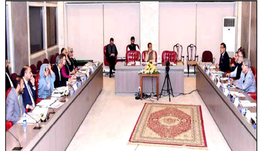
ISLAMABAD: A meeting of the newly constituted Special Parliamentary Committee held to deliberate on the name of the next chief justice of Pakistan in Parliament House