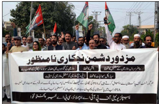
PESHAWAR: Members of Peoples Unity of PIA Employees are holding protest demonstration against privatisation of Pakistan International Airlines (PIA), at Peshawar press club.

(MCD) IMF, Jihad Azour. Thanking the IMF for its continued support to Pakistan, especially for the recently approved US$7 billion Extended Fund Facility (EFF), the delegation outlined the government's efforts towards fiscal consolidation, revenue expansion, energy and SOE reforms, aimed at transitioning Pakistan from stabilization to growth. Congratulating Pakistan on the successful start of the Fund programme, Jihad Azour emphasized the importance of staying the course on reforms.