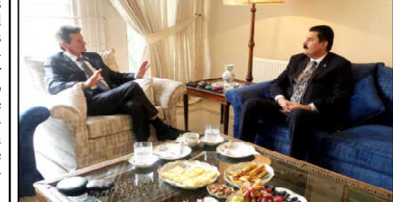
ISLAMABAD: Governor Khyber Pakhtunkhwa Faisal Karim Kundi called on Ambassador of Hungary in Pakistan H.E. Bela Fazekas.

nities for Pakistani students in Hungarian universities, advocating for enhanced collaboration and exchange of experiences in the education sector. He also extended an invitation to the faculty and students of Hungarian universities to visit Peshawar, aiming to solidify educational and cultural ties between the two nations. The Governor underscored the critical importance of the bilateral relationship between Pakistan and Hungary, urging both countries to enhance cooperation across various sectors to create opportunities for mutual development and prosperity. The Hungarian ambassador acknowledged the initiatives for youth development, women empowerment, and educational advancement in Khyber Pakhtunkhwa, assuring full support for these efforts.