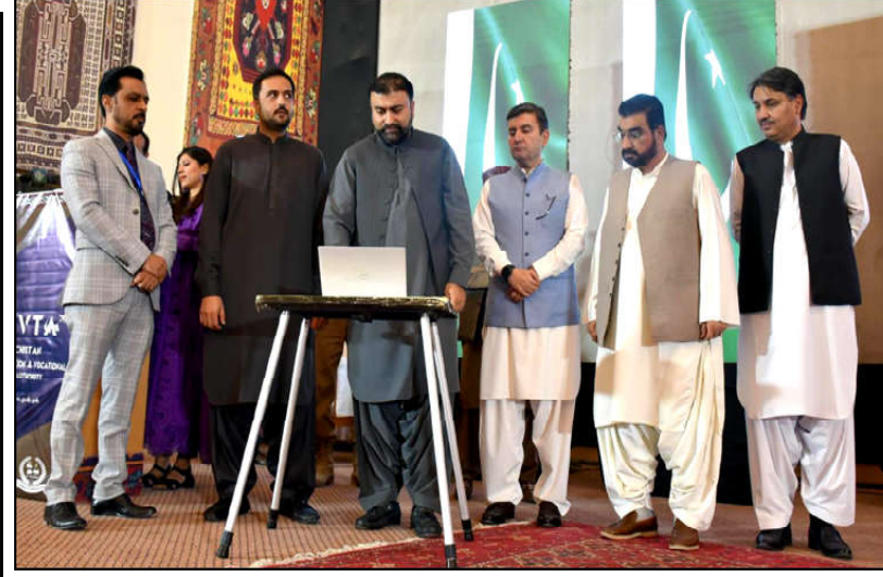
QUETTA: Chief Minister Balochistan Mir Sarfraz Ahmed Bugti inaugurating Chief Minister Youth Skills Development Program