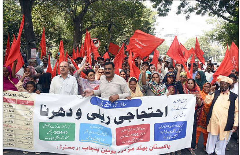
LAHORE: Labourers of Brick Kiln hold a banner during protest against Brick owners in front of press club in the Provincial Capital.