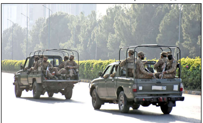
ISLAMABAD: Pak Army soldiers patrolling at Jinnah Avenue during security high alert in the Federal Capital.

PML-N and JUI-F were on the same page regarding the amendment. Aseefa Bhutto, Yousuf Raza Gilani, Syed Khurshed Shah, Syed Naveed Qamar and others attended the meeting. He also condemned the surfacing of differences after the consensus was reached. He said that all the lawful demands of the JUI-F chief were forwarded to the PM with the hope that the same would be addressed. Bilawal further said that all the promises made in the Charter of Democracy would be materialised. Bilawal Bhutto also paid rich tribute to the martyrs of the Karsaz tragic incident and said fatiha for them. On the proposal of Aseefa Bhutto, Bilawal was elected as parliamentary leader of both the PPP and the PPP (Parliamentarian). Bilawal also directed all the parliamentarians to stay in Islamabad till Monday. Bilawal further said that he wanted to pass the amendment without support of the turncoats.