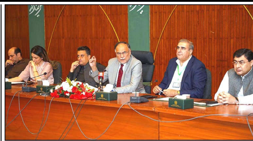
ISLAMABAD: Federal Minister for Planning, Development & Special Initiatives, Ahsan Iqbal, presides over a high-level consultative session focused on transforming transport corridors into economic corridors.