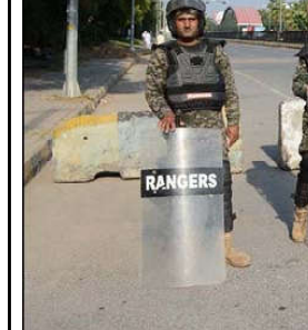
ISLAMABAD: Rangers personal stand alert on closed road due to PTI protest in capital city.

ISLAMABAD (APP): The Supreme Court of Pakistan has constituted seven regular benches for next week to hear the cases. The first bench would be headed by Chief Justice of Pakistan Qazi Faez Isa and comprising Justice Naeem Akhtar Afghan and Justice Shahid Bilal while Justice Mansoor Ali Shah, Justice Ayesha Malik and Justice Aqeel Abbasi are included in the second bench. The third bench is comprising Justice Munib Akhtar and Justice Athar Minallah while the fourth bench comprises Justice Yahya Afridi, Justice Hassan Azhar Rizvi and Justice Shahid Waheed. Similarly, the fifth bench is comprising Justice Amin ud Din Khan, Justice Muhammad Ali Mazhar and Justice Irfan Saadat Khan while the sixth bench include Justice Jamal Khan Mandokhail, Justice Musarrat Hilali and Justice Malik Shahzad Ahmed.