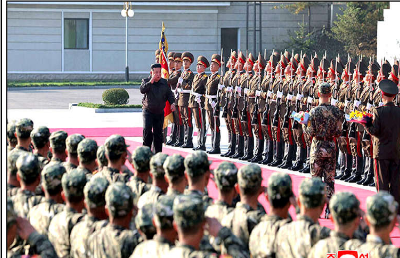
North Korea's leader Kim Jong Un visiting the command of the 2nd Corps of the Korean People's Army, at an undisclosed location in North Korea.

Araghchi's visit to Egypt is part of a wider diplomatic tour in the region meant to ease tensions. This month he met with officials in Syria, Lebanon, Qatar, Oman, and Iraq, and is expected to head to Turkey after concluding talks in Egypt.