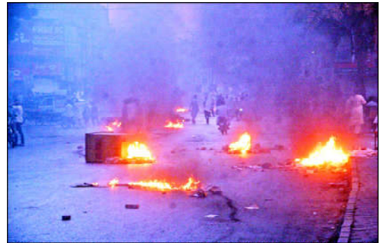
KARACHI: Activists of a religious party burned tyres on a road during protest, in Provincial Capital.