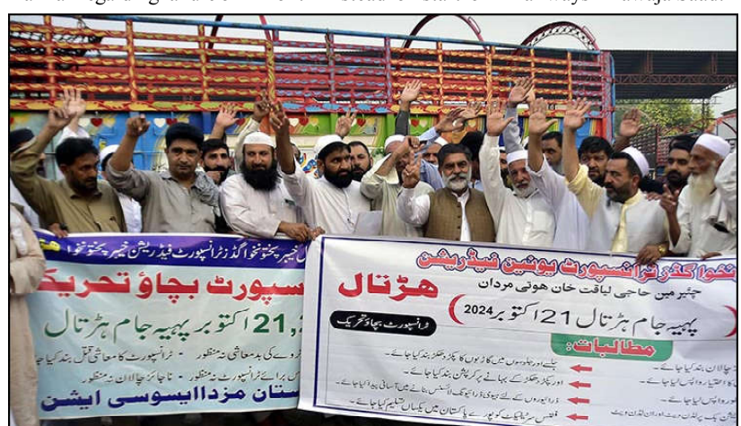
PESHAWAR: Activists of All Khyber Pakhtunkhwa Goods Transport Association hold protest in favor of their demands at fruit mandi G T road.

0.19% are food (0.32), tobacco (0.39%), textile (0.63%) garments (2.15%), petroleum products (0.51%), automobiles (0.39%), pharmaceuticals (-0.10%), cement (-1.02%), iron & steel products (-0.71%), electrical equipment (-0.63%) and furniture (-1.85%). The production in July-August 2024-25 as compared to July-August 2023-24 has increased in food, tobacco, textile, wearing apparel, coke & petroleum products, chemicals, automobiles, other transport equipment, and other manufacturing (football) while it decreased in pharmaceuticals.