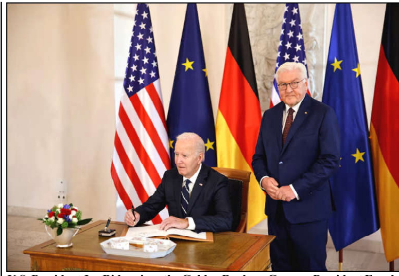
U.S. President Joe Biden signs the Golden Book, as German President Frank-Walter Steinmeier looks on, at Berlin's Bellevue castle in Berlin, Germany.