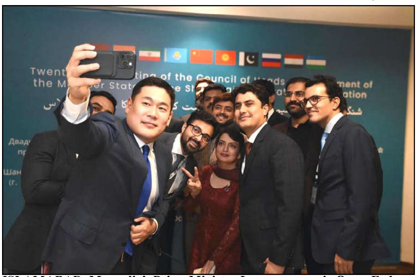
ISLAMABAD: Mongolia's Prime Minister, Luvsannamsrain Oyun-Erdene, captures memorable moments with Pakistani officials before departing for his homeland, wrapping up a successful visit to Pakistan.