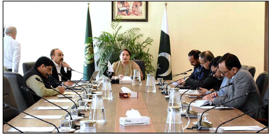
ISLAMABAD: Coordinator to Prime Minister on Climate Change Romina Khurshid Alam presiding over a 2nd meeting of the Pakistan Climate Change Authority in the Committee Room of the M/Climate Change & Environmental Coordination.

She noted that lack of collaboration and cooperation among federal and provincial government organisations for implementing long-term and short-term national climate change policy measures for coping with the adverse fallouts of climate change has only increased the climate vulnerability of not only various socio-economic sectors but also infrastructure, lives and livelihoods of the people.