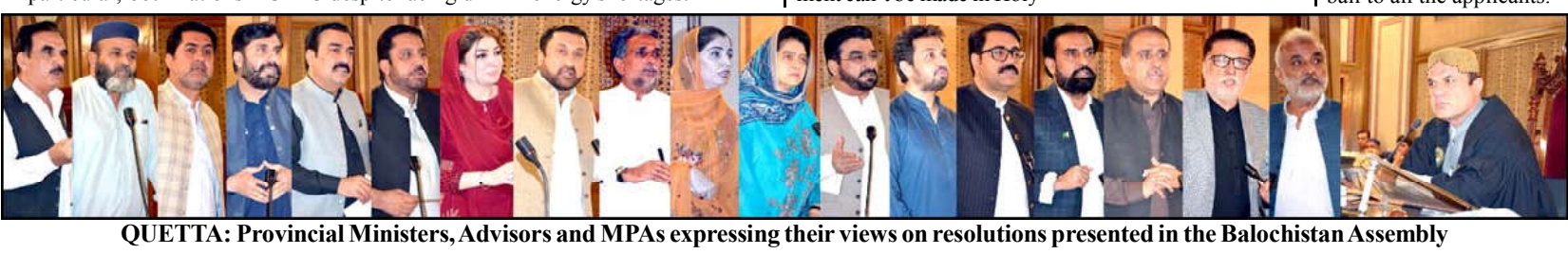
QUETTA: Provincial Ministers, Advisors and MPs expressing their views on resolutions presented in the Balochistan Assembly