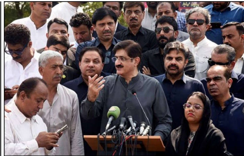
KARACHI: Sindh Chief Minister Syed Murad Ali Shah speaks to the media at the Karsaz Memorial of Martyrs.