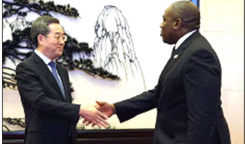
Britain's Foreign Secretary David Lammy and Chinese Vice Premier Ding Xuexiang shake hands before their meeting at the Great Hall of the People in Beijing, China.