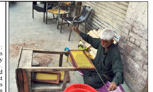
LAHORE: An old man is busy weaving a chair at his workplace near Lahore Hotel Road.

WASHINGTON (INP): Gold prices hit record highs on Friday as uncertainty surrounding the U.S. presidential elections and the war in the Middle East prompted investors to seek out the safe-haven asset, while easing monetary policy environment kept prices elevated.