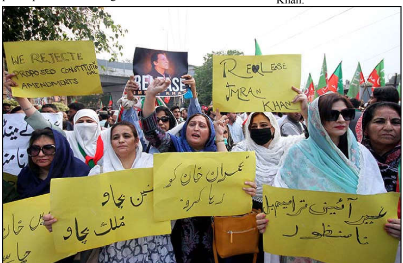
PESHAWAR: Activists of Tehreek-e-Insaf (PTI) are holding protest demonstration for release of PTI Founder Imran Khan, at Peshawar press club.

IG Punjab replied We contacted PTA. The CJ LHC while moving to IG Punjab remarked today is October 18 and videos went viral on October 13 and 14. You wake up when fire flares up and all is reduced to ashes. The court inquired from IG Punjab you contacted the relevant authorities too late. IG Punjab replied the video went viral from more than 700 accounts. Police have only one institution to check cyber crime. The CJ LHC remarked IG Sahb it is your failure. You allowed the children to come on road. You should also give account of two days that you did what on October 14 and 15. Videos are still lying on X and Tiktok. You did nothing for two days. You kept on waiting. The CJ LHC remarked you did nothing in two days after filing documents and started your work from October 16. If there is intent then all works are done. IG Punjab took the plea it is not so easy to prevent data from being uploaded and nor we have authority in this regard. If we will stop it from one account it is reposted from other account.