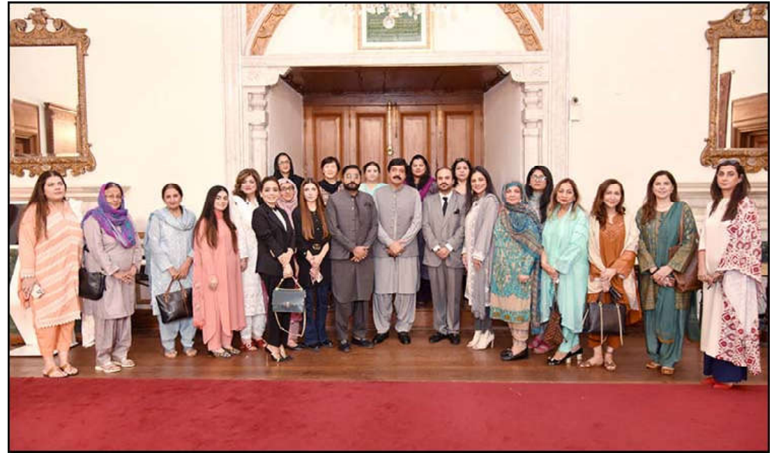
LAHORE: The delegation of Federation of Pakistan Chamber of Commerce and Industry Women Empowerment and Development Committee led by convener Maryam Qasim Khan in a group photo with Governor Punjab Sardar Saleem Haider Khan at Governor House.

FY24, amid continued tight monetary policy stance, fiscal consolidation, and softer global commodity prices and noted that these trends came alongside the easing of external account pressures, contributing to a build-up of foreign exchange reserves, which together with FX market reforms including in exchange companies instilled stability in the foreign exchange market. The year also witnessed a moderate agriculture-led GDP growth that was supported by a small but gradual