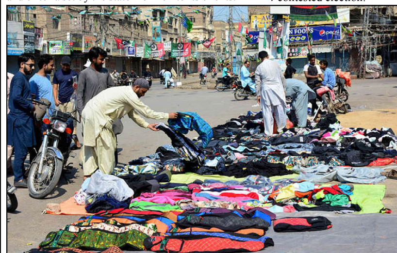
HYDERABAD: A vendor displaying and selling the covers of motorcycle to customers at Kohe noor chowk.