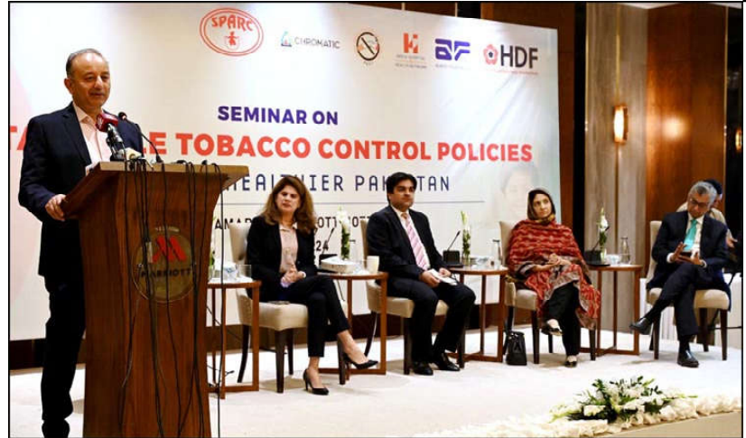
ISLAMABAD: Federal Minister for Petroleum Dr. Musadik Malik addresses a seminar on sustainable tobacco control policies, aiming for a healthier Pakistan, organized by the Society for the Protection of the Rights of the Child (SPARC).