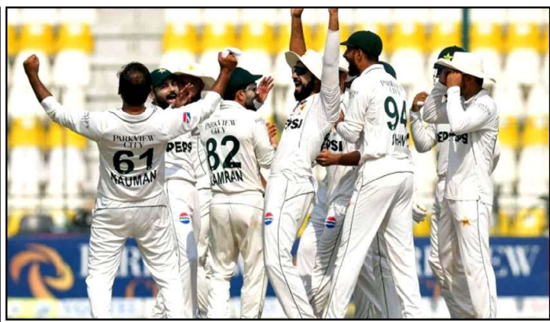
Pakistan team celebrating after winning second Test against England in Multan

also going to be materialized. He said that we are providing the opportunities to the talented youths of the province to move ahead under the Benazir Bhutto Scholarship Programme. Under the Programme, the provincial government would bear the educational expenses of the students for 16 years. The Chief Minister on the occasion expressed the resolve to bring the youngsters closer to the State by ending bad governance. He also reiterated his resolve that no job would be sold out and merit would be ensured. He noted with concern that while we are providing opportunities of progress to the youngsters, they are being made suicide bombers on the other side, he added emphasizing that now the decision has to be made by the people of province. He said that the State is our identity and as such we have to honour it. The Chief Minister said that the passage of development comes out from Balochistan, while uneven development is the issue of whole province. He regretfully pointed out that falsehood is spread through baseless propaganda on social media. He said that while Shanghai Cooperation Organization's summit was going on in Islamabad, on the other hand, resentment was spread through baseless propaganda of rape. He once again urged the youths to move ahead by adopting positive approach.