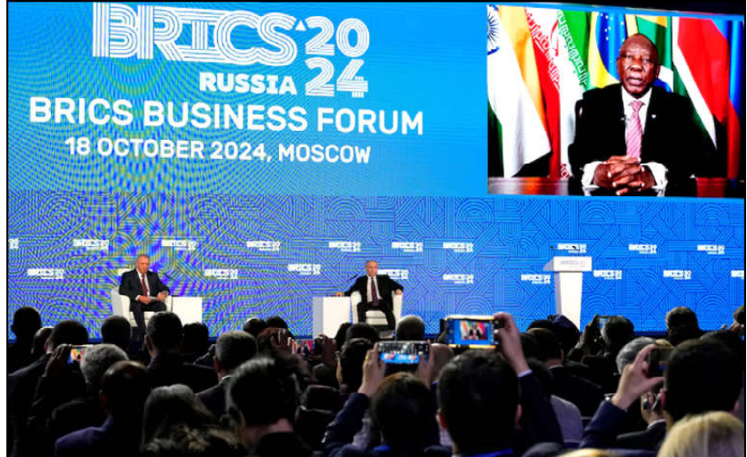
Russian President Vladimir Putin listens to South African President Cyril Ramaphosa speaking via a video link during the BRICS Business Forum in Moscow, Russia.

He said he would discuss with Scholz ongoing efforts to increase military support for Ukraine and shore up its civilian energy infrastructure "by unlocking the value of frozen Russian assets." They would also discuss the Middle East conflict.