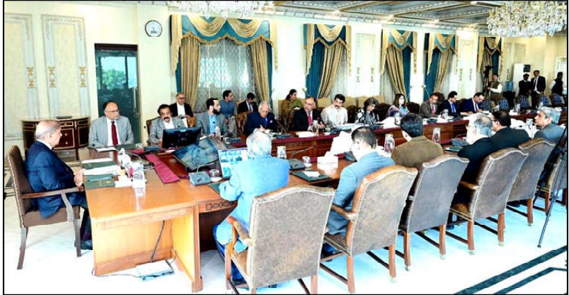
ISLAMABAD: Prime Minister Muhammad Shehbaz Sharif chairs a meeting regarding relief efforts in Gaza and Palestine by the Government of Pakistan.