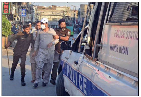
RAWALPINDI: Police personals arrest of a activists of PTI during a protest at Dhok Khaba in the city.

ISLAMABAD (APP): Thieves stole jewellery worth more than 16 crores on Friday from a house in Sandra area of Lahore. According to a private news channel, in addition to the jewelry, cash amounting to over 40 lakhs was also stolen. As soon as the incident was reported, police reached the scene and began their investigation. An FIR has been registered, and the search operation for the culprits involved in the massive theft was underway.