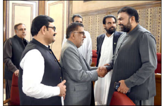
QUETTA: Provincial Ministers talking with Chief Minister Balochistan Mir Sarfaraz Ahmed Bugti during Balochistan Assembly session

ISLAMABAD (Online): Supreme Court (SC) has declared unconstitutional all policies and quota related to packages in respect of children of government employees. 11-page verdict was authored by Justice Naem Akhtar Afghan. According to written order all the policies regarding children of government employees have been declared unconstitutional. In the decision Prime Minister (PM) package for employment and section 11-A of Sindh Civil Servants Rules-1947 related to quota have been declared null and void. A 3-member bench of SC presided over by Chief Justice of Pakistan (CJP) Qazi Faez Isa took up the case for hearing. Additional Attorney General (AAG) told the