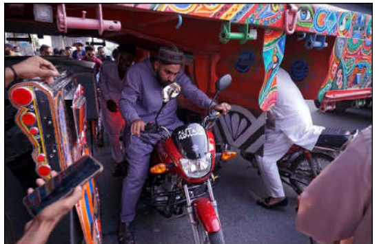
GUJRANWALA: Commuters are facing inconvenience due to protest demonstration of Tehreek-e-Insaf (PTI) for release of PTI Founder Imran Khan, at Gt road in Gujranwala.