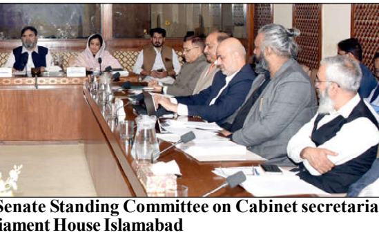
Senator Rana Mahmood ul Hassan, Chairman Senate Standing Committee on Cabinet secretariat presiding over a meeting of the Committee at Parliament House Islamabad

been widely appreciated, he added. During the occasion, CTO Muhammad Sarfraz Virk praised the unwavering efforts of the Islamabad Traffic Police, highlighting that the officers worked tirelessly around the clock to manage traffic effectively. The CTO emphasized the critical role they played in ensuring smooth traffic flow during such a significant international event. CTO Virk also acknowledged the patience and understanding shown by the citizens of Islamabad and Rawalpindi during the Summit, describing their cooperation as praiseworthy. Muhammad Sarfraz Virk thanked the residents of the federal capital for their full support, which was instrumental in the successful execution of traffic arrangements.