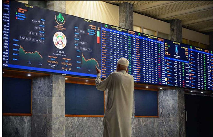
KARACHI: Brokers are busy in trading at Pakistan Stock Exchange (PSX) in Karachi.