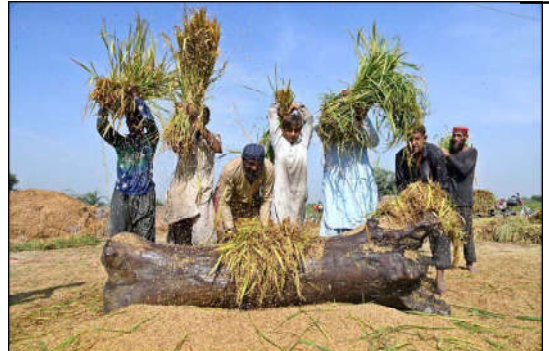
LARKANA: Farmers threshing rice crop in a traditional way at their field near Ratodero Road.