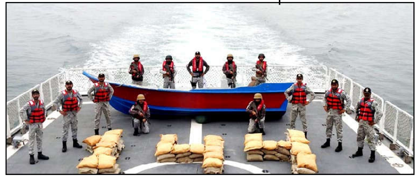
ISLAMABAD: Pakistan Navy Ship seized 1.3 Tons Of Narcotics during Focused Operation Himalayan Spirit in North Arabian Sea.

There is no objection over transferring the reference to anti corruption court.