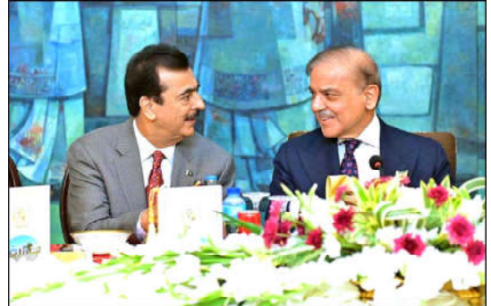
ISLAMABAD: Prime Minister Muhammad Shehbaz Sharif with Chairman Senate Syed Yousuf Raza Gillani at a banquet organized in honor of the senators.