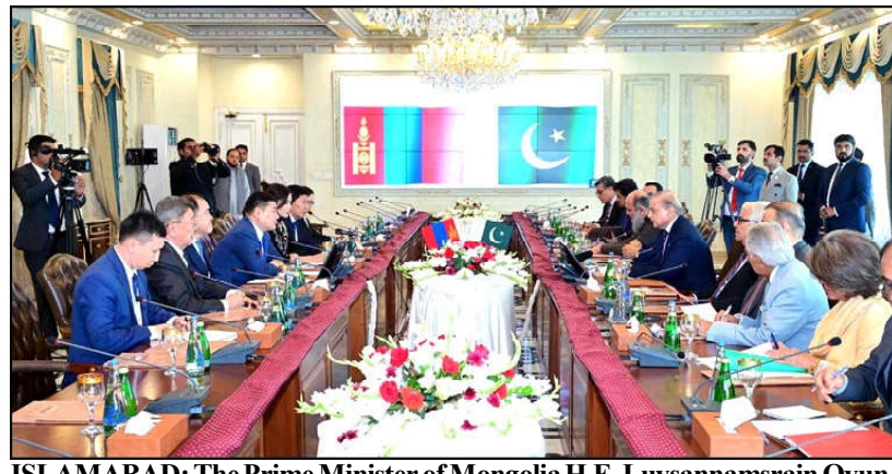
ISLAMABAD: The Prime Minister of Mongolia H.E. Luvsannamsrain Oyun-Erdene along with a delegation meets Prime Minister Muhammad Shehbaz Sharif.