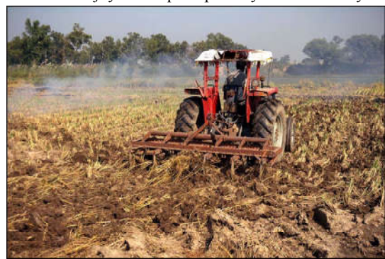
GUJRANWALA: Farmer ploughs field with the help of heavy machinery to earn his livelihood to support his family, at a field in Gujranwala.

Total liquid foreign reserves held by the country, in the previous week ended on October 04, 2024, were $ 16,047 million.