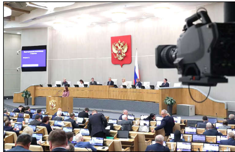
Members of Russia's State Duma, the lower house of parliament, attend a plenary session in Moscow, Russia.

The Nikkei said its nationwide poll, conducted along with the Yomiuri newspaper, garnered responses from 165,820 people randomly contacted by phone on Tuesday and Wednesday. A poll by broadcaster TBS showed on Wednesday released the LDP may lose about 30 seats, while Komeito may shed a small number.