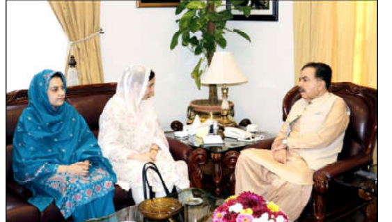
QUETTA: Chairman Balochistan Commission on the Status of Women Fouzia Shaheen meeting with Governor Balochistan Sheikh Jaffar Khan Mandokhail

Federal Ministries, Gilgit-Baltistan and the representatives of Azad Jammu and Kashmir (AJK) governments briefed the minister regarding the preparations and arrangements for Kashmir Black Day.