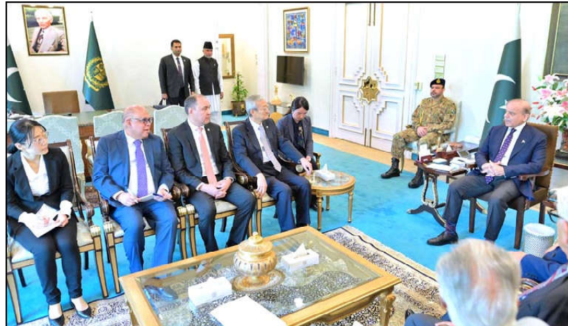
ISLAMABAD: Secretary General Shanghai Cooperation Organisation Zhang Ming calls on Prime Minister Muhammad Shehbaz Sharif.