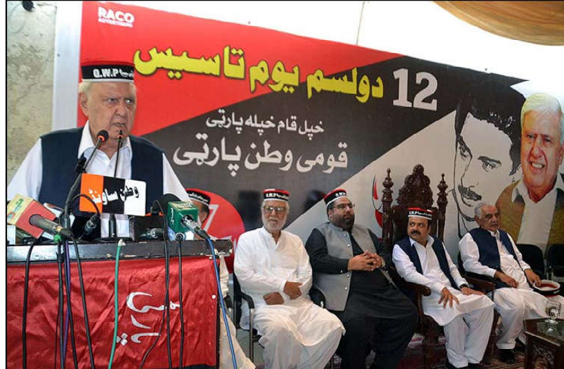
PESHAWAR: Qaumi Watan Party Chairman, Aftab Ahmad Khan Sherpao addresses to participant during Annual Foundation Day ceremony held in Peshawar.