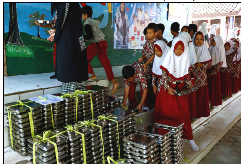
Students queue to take meals from free nutritious meals program trial at an elementary school in Sukabumi, West Java province, Indonesia.

McBurney on Monday had ruled in a separate