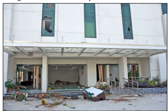
RAWALPINDI: A view of damage building of a college from students during a protest of students in favor of their demands at 6th road in the city.

transparent this year and there was large-scale protest across the country regarding the irregularities witnessed during the test. He said that several out of syllabus questions were included in the test which was evident of mismanagement and inefficiency. He said that the petitioners were qualified and eligible candidates and attempted all the questions wherein it was found that some questions in the question paper were having multiple interpretations, higher difficulty level, defective answer wrong answers and confusing one and filed complaints before the Khyber Medical University (KMU), Peshawar for reviewing the answer keys through independent subject experts and upon their recommendations the petitioners be awarded