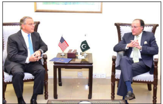
ISLAMABAD: Federal Minister for Finance & Revenue Senator Muhammad Aurangzeb called on by the Ambassador of USA to Pakistan H.E. Donald Blome.