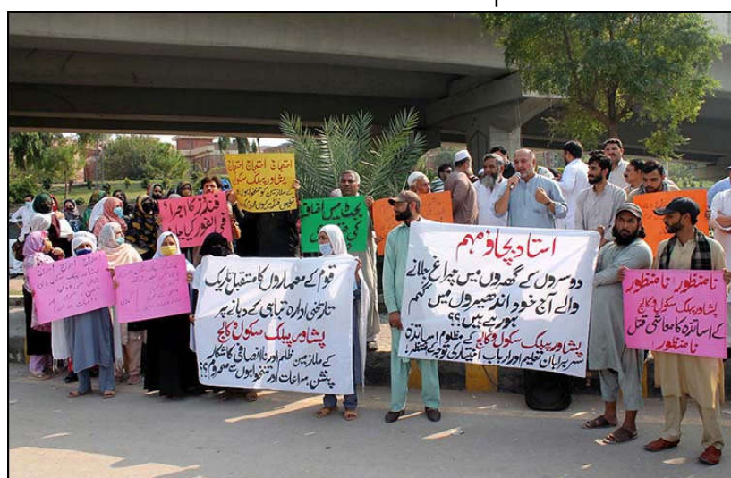
PESHAWAR: Teachers and staffs of Peshawar Public School and College are holding protest demonstration for acceptance of their demands, outside KPK Assembly building in Peshawar.

ISLAMABAD (APP): A powerful explosion rocked the Ormur area of Peshawar in Khyber Pakhtunkhwa on Thursday which targeted a police vehicle where fortunately, no casualties have been reported so far, although the blast caused significant damage to the police vehicle. According to SSP operational, the blast sent shock waves through the surrounding area, causing panic among locals, private news channel reported. Law enforcement agencies quickly cordoned off the area and launched an investigation into the incident. "We are reviewing footage from nearby CCTV cameras and gathering evidence to determine the perpetrators behind the attack," said SSP operational. According to Police officials, bomb disposal squads were immediately deployed to the scene to scan the area.