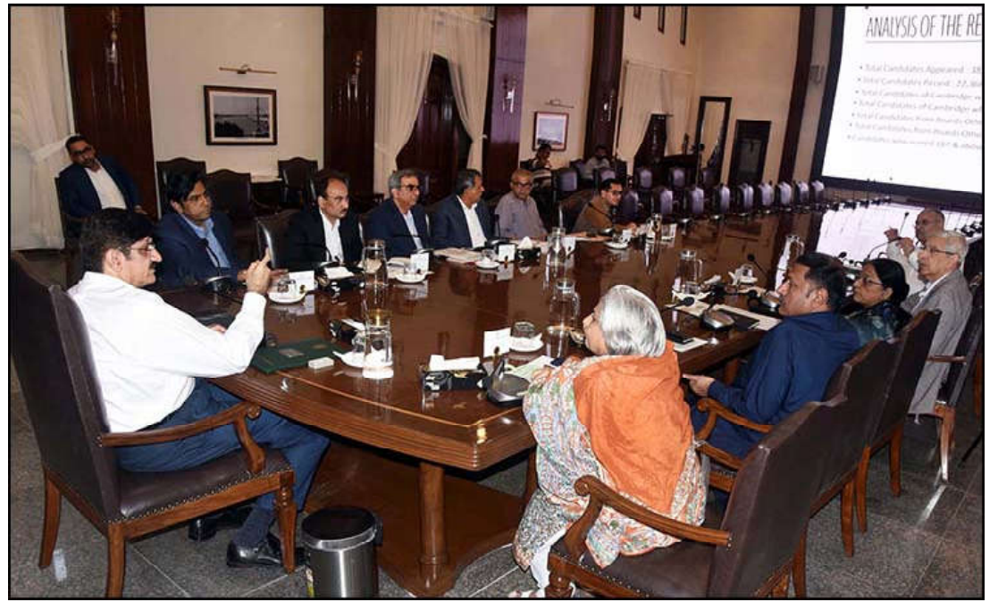
KARACHI: Sindh Chief Minister, Syed Murad Ali Shah presides over a joint meeting of University and Boards and Vice Chancellor, held at CM House in Karachi.

connect 12 districts of the province and Khyber Pakhtunkhwa with Punjab and Balochistan. In the meeting, the provincial government also decided to build its own transmission line. This 120 km long 220 kV transmission line will be laid from Swat to Chakdra. This transmission line will provide power to the local industries at cheap rates from the hydropower plants of the provincial government to be built in Swat and other adjoining areas. With the completion of this project.