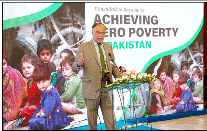
ISLAMABAD: Federal Minister for Planning, Development, and Special Initiatives, Ahsan Iqbal addressing during an event organized by the Ministry of Planning on the International Day for the Eradication of Poverty.

On behalf of the Government of Pakistan, the prime minister reaffirmed the unwavering dedication to this cause, and invited all sectors of society to join them in building a more prosperous, equitable, and inclusive world.