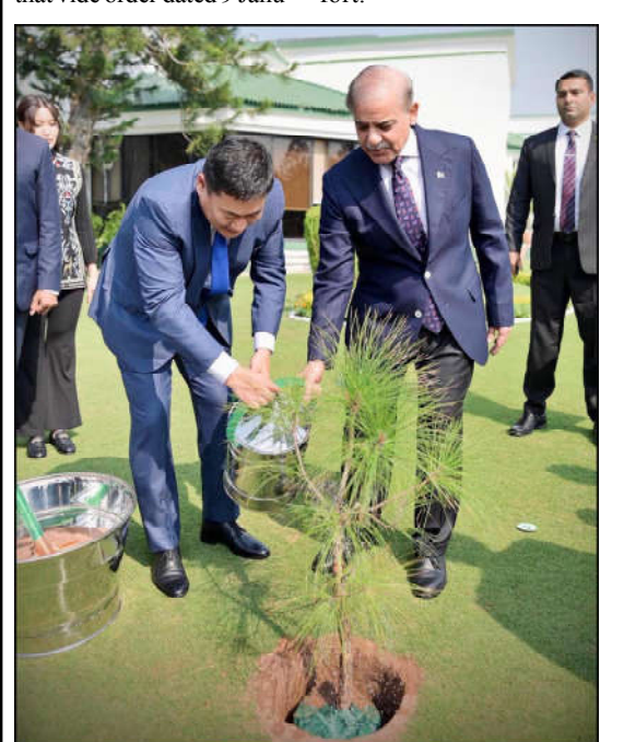
ISLAMABAD: Prime Minister Muhammad Shehbaz Sharif plants a sapling along with the Premier of Mongolia H. E. Luvsannamsrain Oyun-Erdene.

The court said, "If the Implementation Bench did not examine the progress reports then their submission is pointless. Moreover, except for one, all the Hon'ble Judges of the Implementation Bench have since retired and were not replaced by this Court. WAPDA's counsel also stated that preparation of progress reports consumes time, money and effort."