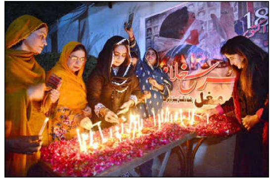
HYDERABAD: PPP ladies wing ladies workers light-up candles and earth lamps in memory of the martyrs of the Karsaz incident at Mughal House.