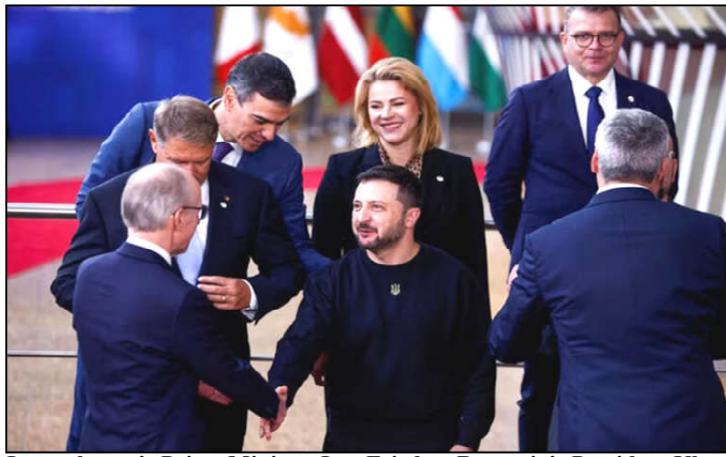
Luxembourg's Prime Minister Luc Frieden, Romania's President Klaus Iohannis, Spain's Prime Minister Pedro Sanchez, Ukraine's President Volodymyr Zelenskyy, and President of the European Council Charles Michel attend a European Union leaders summit in Brussels, Belgium.

Following the attacks, Israeli Prime Minister Benjamin Netanyahu vowed to crush Hamas and bring home all 251 hostages seized by fighters in their cross-border assault.