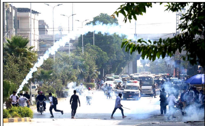
RAWALPINDI: A view of tear gas fire toward student during for protest against the alleged rape in Lahore. More than 150 students have been arrested.

"Three-tier scrutiny of Afghan nationals' documents for passport that are mandatory for attestation from a gazetted officer, re-verification of the attestation issuing authority and before final issuance of the passport of CNIC, the data of the applicant is confirmed through the Family Registration Certificate (FRC) data of NADRA," he said.