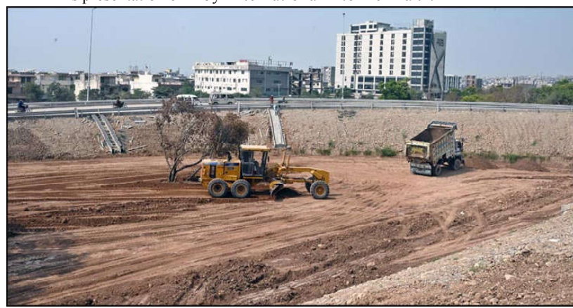
ISLAMABAD: Machinery is being used for leveling the ground to prepare a green area along the road near Kakpul.

He remarked this at the Brookings Institution's Global Economy and Development Programme virtual event on Thursday.