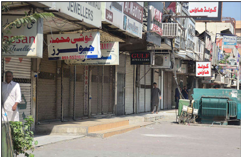
RAWALPINDI: The shops in different markets are closed in view of the decision of the administration to keep the residential hotels closed in connection with the SCO conference held in the Federal Capital.