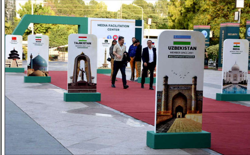
ISLAMABAD: A view of media facilitation center prepared for International and national media persons at Pak-China Friendship Center ahead of Shanghai Cooperation Organisation (SCO) Summit 2024 in the Federal Capital.

ISLAMABAD (APP): The 7th death anniversary of renowned stage star and TV artist Nusrat Ara, famously known as Bil Batori, was observed on Monday. According to a private news channel, she was born in Karachi back in 1964 and later moved to Lahore to pursue acting. The star rose to fame in the 90s with the hit TV drama Ainak Wala Jin, which saw her essay the ever-famous role of Bil Batori.