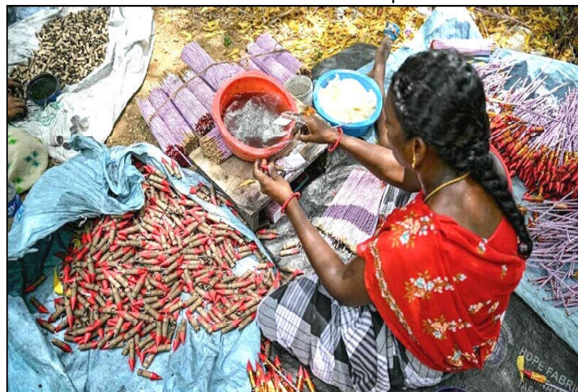
A woman works at a firecracker factory on the outskirts of Sivakasi in India's Tamil Nadu state.

Monitoring Desk NEW DELHI: India withdrew its envoy to Canada on Monday along with other officials and diplomats who Ottawa named as "persons of interest" in a matter related to an investigation in the country, the foreign ministry said. New Delhi rejected the "preposterous imputations" of the Canadian assertion, made in a diplomatic communication on Sunday, saying it was part of Canadian Prime Minister Justin Trudeau's "political agenda" centred around "vote bank politics". The foreign ministry also said it summoned the Canadian Charge d'Affaires on Monday and informed him that the "baseless targeting" of Indian diplomats and officials in Canada was "completely unacceptable". "We have no faith in