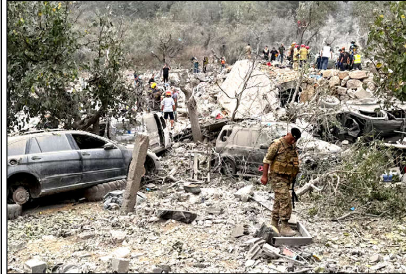
Lebanese army soldier inspects a site damaged by an Israeli air strike in the Christian-majority region of Aitou in north Lebanon.

ground operation in Lebanon earlier this month with the goal of weakening Hezbollah and pushing the militant group away from the border to allow thousands of displaced Israelis to return to their homes. Inside Gaza, an Israeli airstrike killed at least 20 people including children at a school Sunday night, according to two local hospitals. The school in Nuseirat was sheltering some of the many Palestinians displaced by the war. Meanwhile, explosions hit early Monday outside Al-Aqsa Martyrs Hospital in Deir al-Balah, killing three people and injuring about 50 others, the hospital said. Tents caught fire, and residents of the Central Gaza community carried the injured into the hospital. Hezbollah's deadly strike in Israel came the same day that the United States announced it would send a new air-defense system to Israel to help bolster protection against missiles, along with troops needed to