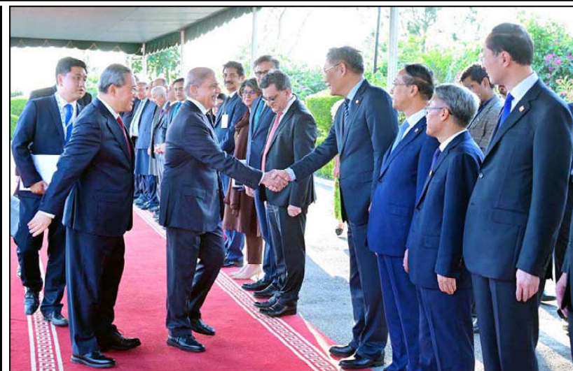
ISLAMABAD: Prime Minister Muhammad Shehbaz Sharif and Chinese Premier, Li Qiang introducing their respective delegations during the later's visit to Prime Minister's House.

peaceful coexistence and collaborative progress, she highlighted. By strengthening ties with SCO member states, Pakistan will further solidify its position as a key player in regional affairs, she added. Aurangzeb emphasized the significance of the Shanghai Cooperation Organization (SCO) in strengthening Pakistan's regional integration and connectivity. She noted that Pakistan's participation in SCO forums, such as the Council of Heads of State and the Council of Heads of Government, has enhanced its cooperation with member states in areas like trade, investment, energy, and counter-terrorism.