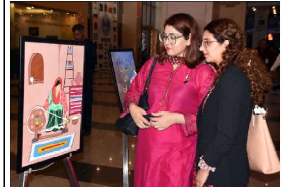
ISLAMABAD: Girls are looking a Pakistani culture painting at Pak-China center ahead of inauguration ceremony of Media Facilitation Centre at Pak-China Friendship Center ahead of Shanghai Cooperation Organisation (SCO) Summit 2024.