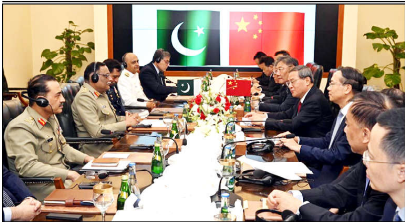
ISLAMABAD: Chinese Premier Li Qiang holding a significant meeting with Chairman of the Joint Chiefs of Staff Committee and the Service Chiefs.