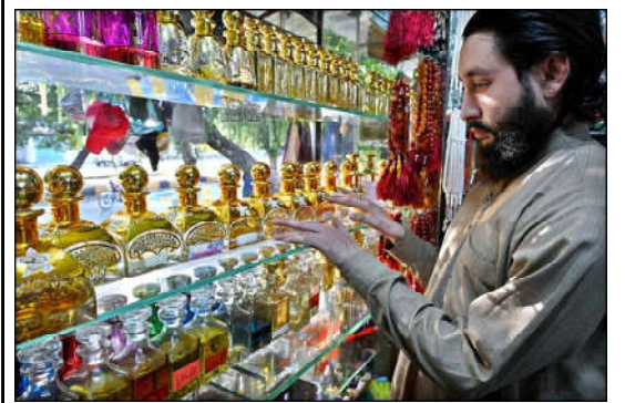
ISLAMABAD: A shopkeeper arranging and displaying perfumes to attract the customers in the city.

their applications to the cloud, improving efficiency and enabling light-asset operations. Additionally, carriers can rapidly innovate with new business-to-business models on Huawei Cloud, empowering them to offer more dynamic services to their customers. For digital governments, Huawei Cloud provides consultancy and technology in constructing national government clouds, enabling the efficient implementation of future cities that are perceptive, intelligent, and safe. In media & entertainment industry, Huawei Cloud helps traditional companies reshape digital content production by upgrading to a cloud-native architecture that adapts to future business demands. Customers can also use Huawei's one-stop OTT solution to quickly build content processing and distribution capabilities, enabling low latency and a smooth viewing experience. In addition, MetaStudio, the digital content production pipeline.