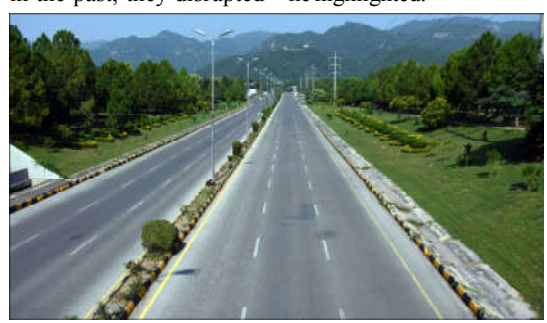
ISLAMABAD: A view of deserted view of 7th Avenue due to three day holiday ahead of Shanghai Cooperation Organisation (SCO) Summit 2024, in the Federal Capital.