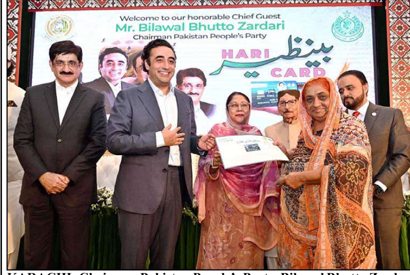
KARACHI: Chairman Pakistan People's Party, Bilawal Bhutto Zardari distributing Benazir Hari Cards to the farmers in a ceremony at the Chief Minister House. PPP Women's Central President Faryal Talpur, Sindh Chief Minister Syed Murad Ali Shah and Sindh Agriculture Minister Sardar Muhammad Bakhsh Khan Meher is also present.