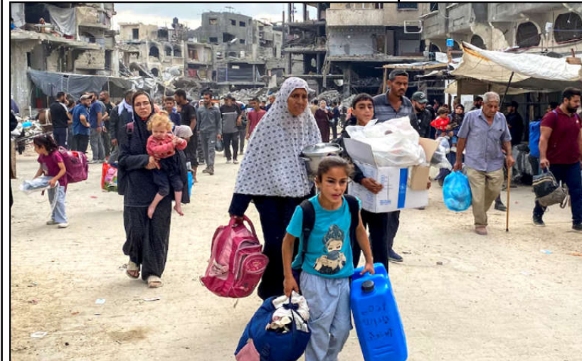
Displaced Palestinians make their way as they flee areas in northern Gaza Strip following an Israeli evacuation order, amid the Israel-Hamas conflict, in Jabalia.

Monitoring Desk NEW DELHI: India's capital New Delhi on Monday ordered a "complete ban" on fireworks in a bid to curb air pollution in a city where levels are regularly ranked among the worst in the world. The ban is the toughest in a string of restrictions on the hugely popular firecrackers — rules that have been widely flouted. "There will be a complete ban on the manufacturing, storage, selling [...] and bursting of all kinds of firecrackers," the Delhi Pollution Control Committee said in a statement. The order was made because of the "public interest to curb high air pollution", it said. It comes two weeks before Diwali, the Hindu festival of lights on November 1, where many see fireworks as integral to celebrations.