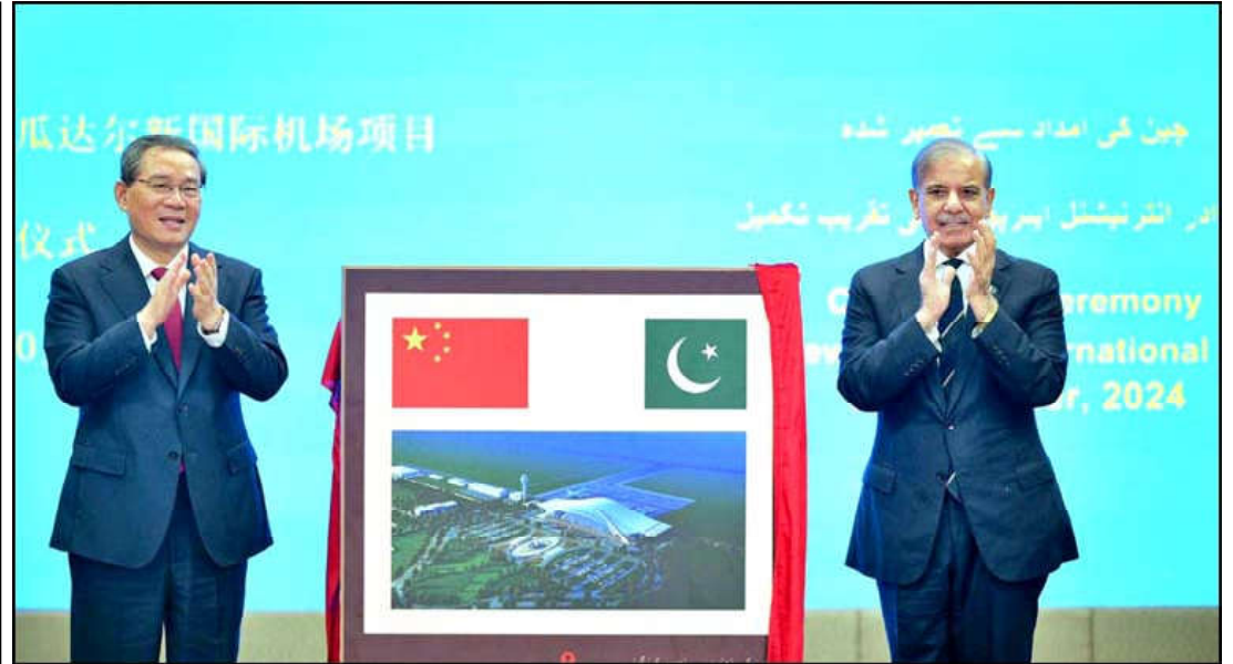
ISLAMABAD: Prime Minister Muhammad Shehbaz Sharif and Chinese Premier, Li Qiang unveiling a plaque to mark the completion of New Gwadar International Airport.