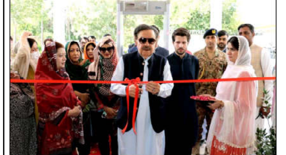
QUETTA: Governor Balochistan Sheikh Jaffar Khan Mandokhail formally inaugurating Fine Arts exhibition at Sardar Bahadur Khan Women's University.

Balochistan, Mir Sarfraz Ahmed Bugti, were also present during the meeting. During the meeting, the president said that Turkiye was a great and sincere friend of Pakistan and the Muslim World and had been taking principled positions on the issues faced by the Muslim Ummah as well as raising its voice against injustice. The meeting expressed concern over the grave humanitarian situation in Palestine and Lebanon where Israel was killing innocent people. It was emphasized that the Muslim World needed to make sincere and serious efforts to address the challenges being faced by the Ummah. President Zardari said that Turkiye was on its way to becoming an economic power and expressed his best wishes for the success and prosperity of Turkiye.