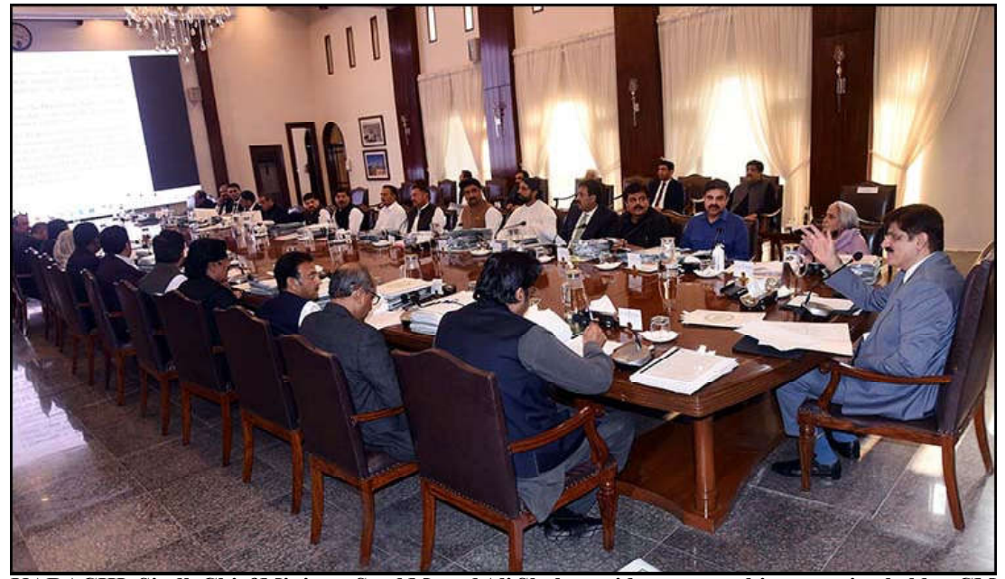
KARACHI: Sindh Chief Minister, Syed Murad Ali Shah presides over a cabinet meeting held at CM House in Karachi.