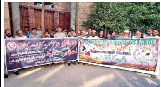
QUETTA: Members of Pakistan Mine Workers Federation are holding protest demonstration against the attack on miners in Duki area of Balochistan, at Quetta press club.

ISLAMABAD (APP): Saudi Minister for Investment, Sheikh Khalid Bin Abdul Aziz Al Faleh on Friday expressed his admiration for Pakistan's private sector and abundant resources. "We are impressed with the private sector of Pakistan and the resources available, including natural resources, fantastic human resources, technology, manufacturing, and innovation," the minister said. During a visit to Park View City, he emphasized that empowering these resources with increased investment, such as the initiatives announced earlier, will further unlock Pakistan's potential. The Saudi Minister expressed optimism about Pakistan's economic future,