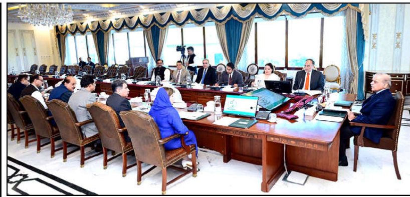
ISLAMABAD: Prime Minister Muhammad Shehbaz Sharif chairs a meeting on matters related to Ministry of Federal Education and Professional Training.