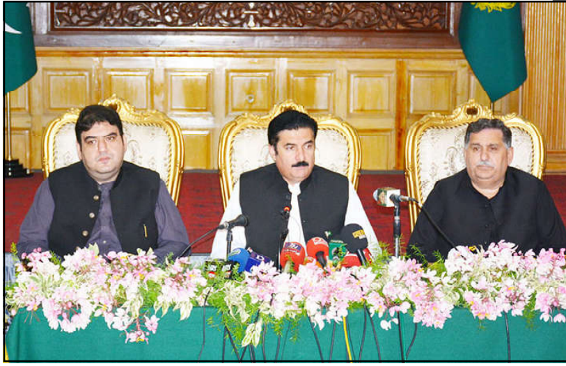
PESHAWAR: Governor Khyber Pakhtunkhwa Faisal Karim Kundi addressing press conference at Governor House.