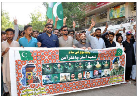
HYDERABAD: Members of Civil Society are holding rally in favor of Pakistan Armed Forces, in Hyderabad.