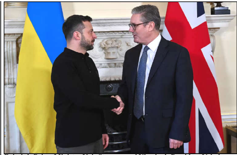
Britain's Prime Minister Keir Starmer and Ukraine's President Volodymyr Zelenskyy shake hands on the day of a bilateral meeting inside 10 Downing Street in London, Britain.