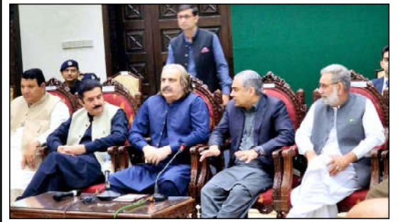
PESHAWAR: Federal Interior Minister, Mohsin Naqvi participating in Grand Jirga organised by the Khyber Pakhtunkhwa government.