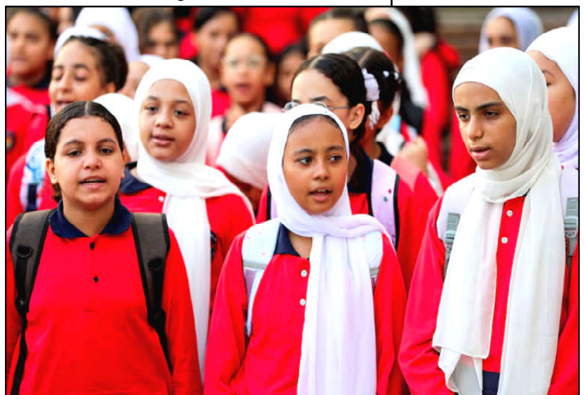
Students line up on the first day of the academic year at Orman school, in Cairo, Egypt.

At sea, the hurricane created waves close to 8.5m high, the National Oceanic and Atmospheric Administration said.