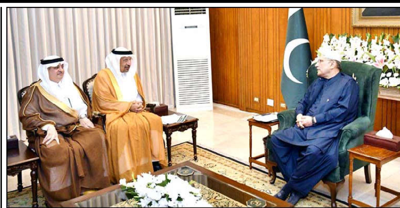
ISLAMABAD: A Saudi delegation led by Minister for Investment, Khalid bin Abdulaziz Al-Falih called on the President Asif Ali Zardari at Aiwan-e-Sadr.