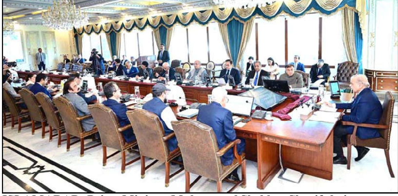
ISLAMABAD: Prime Minister Muhammad Shehbaz Sharif chairs a meeting of the Federal Cabinet.

ergy sector" said Najy Benhassine, World Bank Country Director for Pakistan. "Implementation of planned structural policy reforms supported by a strong national political consensus and increased private sector participation, is critical to mitigate risks, support stronger private-led growth and poverty reduction," he added. As the economic stabilization continues, macroeconomic risks remain high reflecting high financing needs, modest foreign exchange reserves, high debt and debt servicing costs, financial sector vulnerabilities, and a loss-making power sector that continues to weigh on public finances.