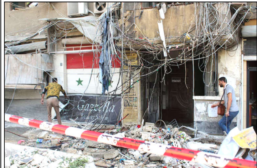
People inspect a damaged area in the aftermath of what Syrian state media reported was an Israeli strike in the Mezzah suburb, west of Damascus, Syria.

"The scale of this human rights violation is overwhelming, and it's been hard to fully grasp because of stigma, challenges in measurement, and limited investment in data collection," UNICEF said in releasing the report. It comes ahead of an inaugural Global Ministerial Conference on Ending Violence Against Children, opens new tab in Colombia next month. UNICEF said its findings highlight the urgent need for intensified global action, including by strengthening laws and helping children recognise.