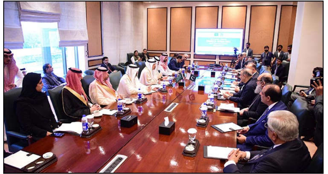
ISLAMABAD: Federal Ministers and private sector leaders in meeting with Saudi Investment Minister H.E. Eng. Khalid bin Abdulaziz Al-Falah to discuss enhancing trade and investment.

Sheikh Khalid expressed enthusiasm about the announcement from the Saudi Crown Prince regarding a $5 billion investment in Pakistan, revealed during Prime Minister Shehbaz Sharif's recent visit shortly after he took office. "I'm delighted to have the Public Investment Fund (PIF) represented among us," he remarked.