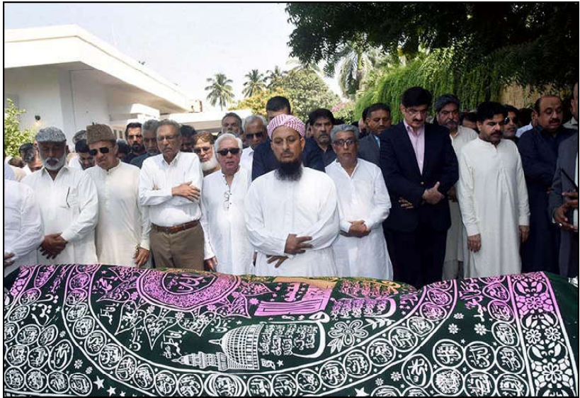
KARACHI: Sindh Chief Minister, Syed Murad Ali Shah along with others attend funeral prayer of senior politician Ellahi Bux Soomro, held at his residency in Karachi.