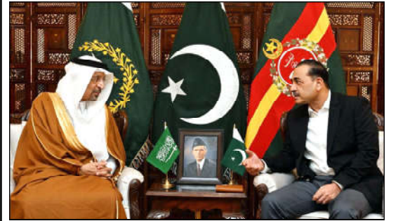
RAWALPINDI: Minister of Investment, Kingdom of Saudi Arabia, Khalid Bin Abdulaziz Al Falih, accompanied by a high-level government cum business delegation, meet with General Syed Asim Munir, NI(M), Chief of Army Staff (COAS).

The COAS further assured the delegation of Pakistan's full support and commitment and conveyed his optimism for the promising outcomes that would mutually benefit both nations.