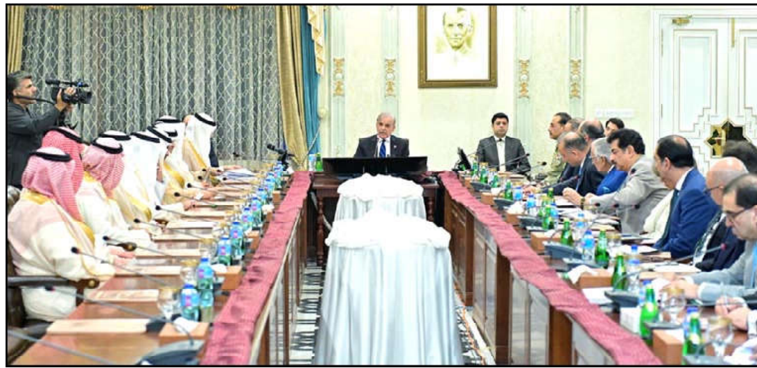
A delegation of the Kingdom of Saudi Arabia led by Investment Minister H. E. Mr Khalid Bin Abdul Aziz Al Falih called on Prime Minister Muhammad Shehbaz Sharif in Islamabad.

He said that such steps should be taken for development of the city, which are seen practically on the ground.