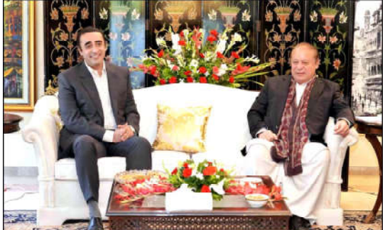
ISLAMABAD: Chairman Pakistan People's Party, Bilawal Bhutto Zardari meets with President PML-N, Mian Muhammad Nawaz Sharif at Punjab House.