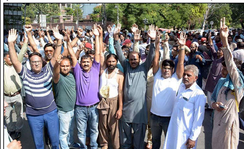
LAHORE: Members of All Pakistan Clerks Association (APCA) are holding protest demonstration against massive unemployment, increasing price of daily use products and inflation price hiking, at Civil Secretariat in Lahore.