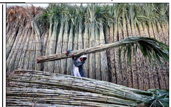
LAHORE: Labourers collecting bundles of sugarcane at the bank of River Ravi to supply near the Vegetable Market in the Provincial Capital.

ISLAMABAD (APP): The 100-Index of the Pakistan Stock Exchange (PSX) witnessed bearish trend, losing 216.06 points on Thursday, a negative change of 0.25 percent, closing at 85,453.22 points against 85,669.28 points on the last trading day. A total of 503,750,595 shares were traded during the day as compared to 596,052,076 shares the previous trading day, whereas the price of shares stood at Rs 27,912 billion against Rs 31,341 billion on the last trading day. As many as 313 companies transacted their shares in the stock market, 115 of them recorded gains and 189 sustained losses, whereas the share price of 9 companies remained unchanged. The three top trading companies were PTCL with 52,237,770 shares at Rs 14.52 per share.