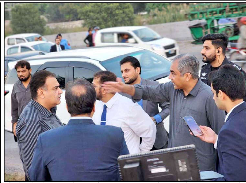
ISLAMABAD: Interior Minister Mohsin Naqvi overseeing the preparation for SCO Summit in Islamabad City.

"Other key initiatives include the establishment of a National Task Force for Mental Health, which provides oversight, promotes mental well-being, and advocates for better care and human rights for those affected by mental disorders. We have also integrated mental health education, into the Lady Health Worker training curriculum to enhance early detection of the problem," he further noted.