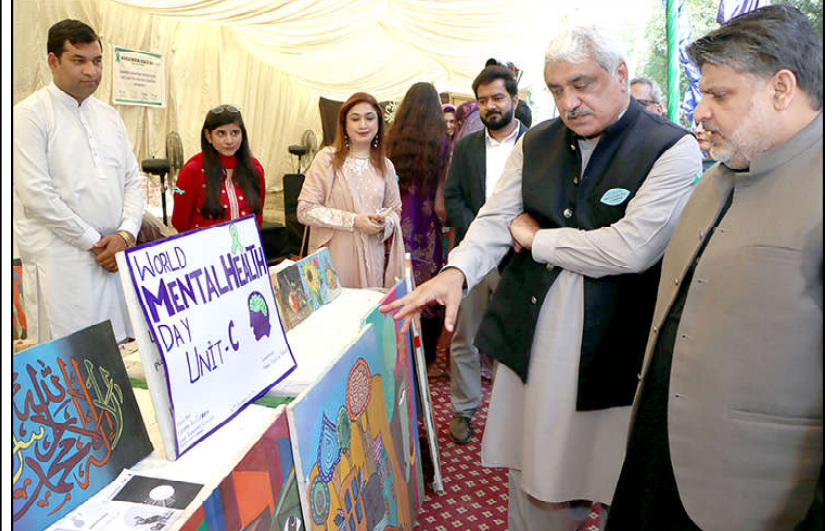
LAHORE: Punjab Health Minister Khawaja Salman Rafique watching the stalls on the eve of World Mental Health Day ceremony at Punjab Institute of Mental Health.