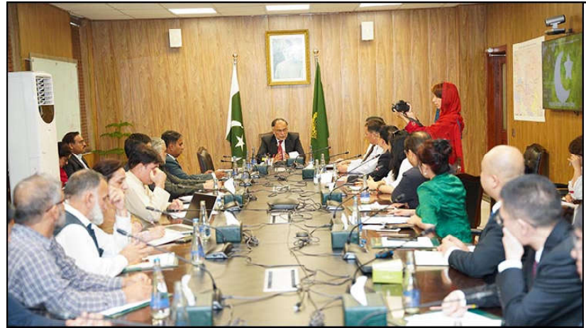
Federal Minister for Planning Development & Special Initiatives Ahsan Iqbal meeting with delegation from the China Asia Economic Development Association (CAEDA) here in Islamabad.