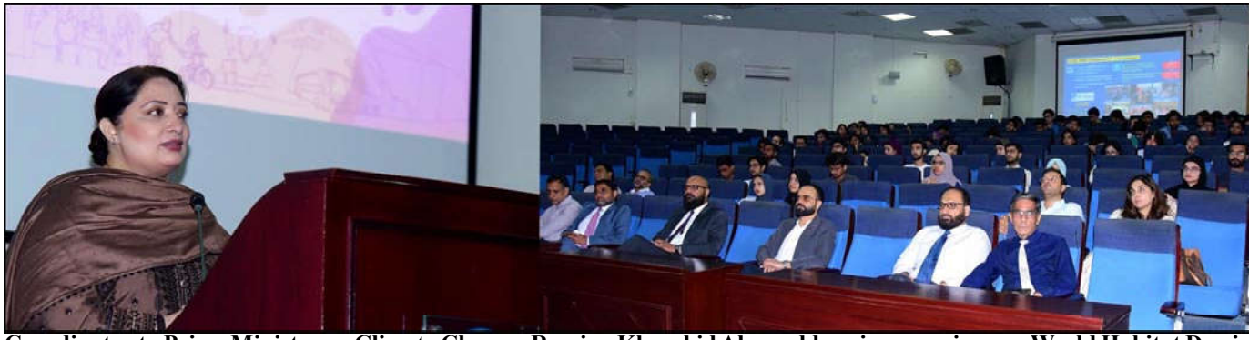
Coordinator to Prime Minister on Climate Change, Romina Khurshid Alam addressing a seminar on World Habitat Day in Islamabad.