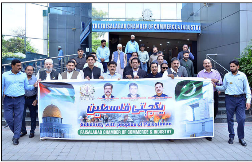
FAISALABAD: Members of Chamber of Commerce and Industry hold a banner during a pro-Palestinian protest to mark the first anniversary of the Israel-Hamas conflict, at FCCI in the city.