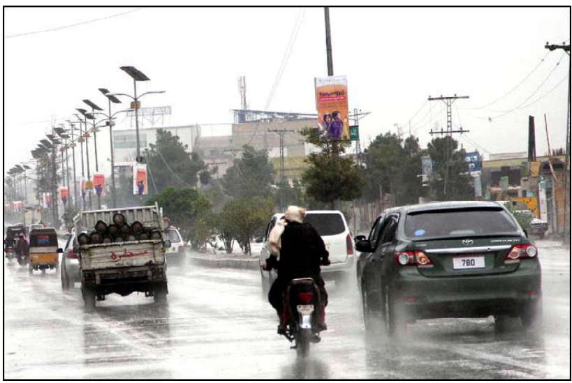
QUETTA: Commuters are passing through a road during downpour, at Airport road in Quetta.

England XI: Zak Crawley, Ben Duckett, Ollie Pope (captain), Joe Root, Harry Brook, Jamie Smith, Chris Woakes, Gus Atkinson, Brydon Carse, Jack Leach, Shoaib Bashir