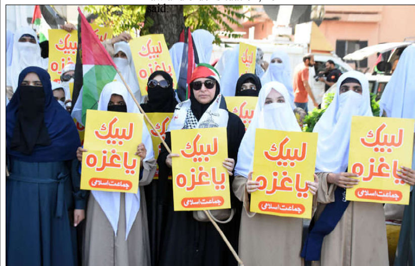
ISLAMABAD: Jamaat Islami Women Wing hold a protest demonstration against Zionist regime on the occasion of the first anniversary of Operation Tufan Al-Aqsa in the Federal Capital.