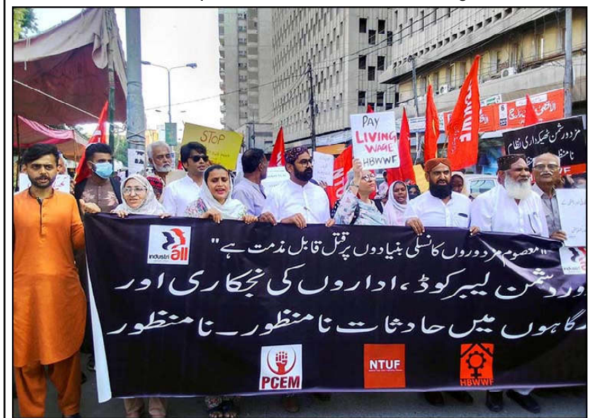
KARACHI: Members of National Trade Union Federation are holding protest demonstration for acceptance of their demands, at Karachi press club.