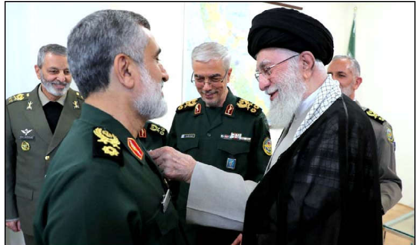
Iran's Supreme Leader Ayatollah Ali Khamenei awards Fath Medal of honour to IRGC Aerospace Force Commander Amir Ali Hajizadeh, in Tehran, Iran.