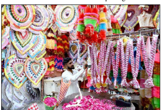
LARKANA: A vendor skillfully arranges fresh flower garlands at his shop in Larkana, attracting customers with colorful blooms.

Jazz and Mercantile will also be introducing an exclusive trade-in program, offering competitive trade-in values to make it easier for existing iPhone users to upgrade and enjoy the latest features effortlessly. To further enhance customer value, Jazz is offering complimentary bundle packages.