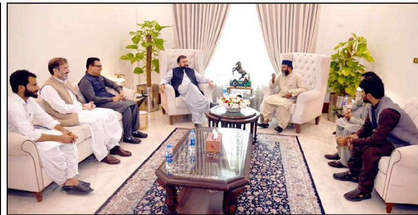
QUETTA: MPA Maulana Hidayat ur Rehman and others meeting with Chief Minister Balochistan Mir Sarfraz Ahmed Bugti

predictable extreme events have given devastating blow to our struggling economy. He commended the National Disaster Management Authority (NDMA) of Pakistan for its hard work to have evolved a tested mechanism as a national response towards such natural calamities. Key components of our national response include proactively working at reducing vulnerability to disasters and providing coping mechanisms and framework for effective disaster management. He expressed his satisfaction that NDMA's National Emergency Operation Center (NEOC) had the best capacities in management of national disasters. "NEOC is founded on high-end technology inputs to create disasters' early warnings much ahead of time - saving lives and infrastructure."