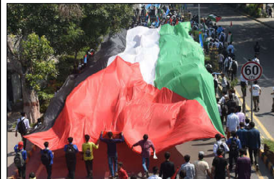
LAHORE: Participants of "Talba Palestine Million March" marching through the Mall Road carrying the flag of Palestine in the provincial capital.