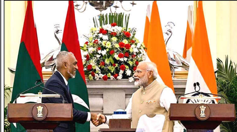
India's Prime Minister Narendra Modi and Maldives President Mohamed Muizzu shake hands after a joint media briefing at the Hyderabad House in New Delhi.

Harris was there earlier this week, holding a rally in Ripon, birthplace of the Republican Party, where she appealed to moderate and disgruntled conservatives. Trump's visit comes on the back of a theatrical campaign return on Saturday to the same venue in Butler, Pennsylvania, where he narrowly avoided a would-be assassin's bullet back in July. The former president campaign's team had hoped to recapture the momentum he enjoyed at that time — riding high in the polls before President Joe Biden upended the race by withdrawing and being replaced by Harris.