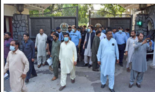
ISLAMABAD: Officials of Capital Development Authority (CDA) leaving Khyber Pakhtunkhwa House after sealed, in the Federal Capital.

and humanitarian work. It was launched in May 2015 under the direction and patronage of the Custodian of the Two Holy Mosques, King Salman bin Abdulaziz Al Saud. This organization is based on high humanitarian goals in its operations, which aim to provide assistance to the needy and disaster victims anywhere in the world. These tasks are carried out under right monitoring procedures and modern methods of rapid transition, which are carried out by United Nations organizations and international and local non-profit organizations. The plans and programmes offered by the KSRelief vary according to the needs of the beneficiaries and their circumstances. These aid projects cover all areas of relief and humanitarian work, including food security, camp management, shelter, initial rehabilitation, conservation.