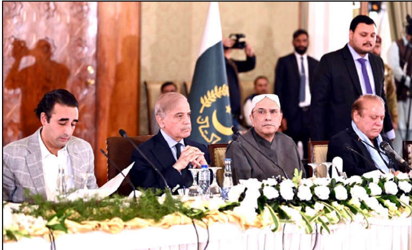
ISLAMABAD: President Asif Ali Zardari, Prime Minister Shehbaz Sharif, PML-N Quaid Nawaz Sharif and PPP Chairman Bilawal Bhutto Zardari attending All Parties Conference (APC) on Palestine and Gaza held at Aiwan-e-Sadr

Ph: 284-1470/284-1473 REG: No. BC-116 B/ID-445 V&amp; XXVI No. 47, Rabi-us-Sani 04, 1446 AH Tuesday October 08, 2024 Pages 08, Price Rs.15