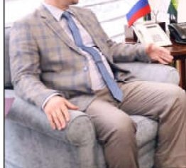
QUETTA: Chief Minister Balochistan Mir Sarfaraz Ahmed Bugti presiding over a meeting to review progress of Chief Minister Youth Skills Development Program

The meeting reviewed in detail the progress on the CM Youth Skills Development Programme. Addressing the meet-