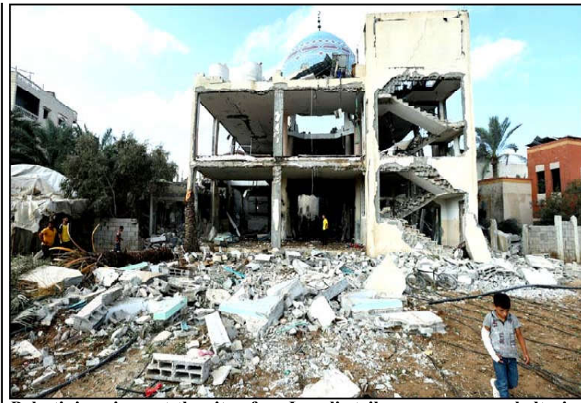
Palestinians inspect the site of an Israeli strike on a mosque sheltering displaced people, in Deir Al-Balah, in the central Gaza Strip.

than 250 taken hostage, according to Israeli figures. The target of Israel's airstrikes across Lebanon and its ground invasion in the south of the country is the Lebanese armed group Hezbollah, Iran's chief ally in the region. More than 2,000 people have been killed in nearly a year of fighting, most of them in the past two weeks, according to the Lebanese health ministry. The ministry said on Sunday that 23 people had been killed on Saturday. The United Nations' refugee chief said on Sunday that there were "many instances" where Israeli airstrikes had violated international law by hitting civilian infrastructure and killing civilians in Lebanon. Israel says it targets military capabilities and takes steps to mitigate the risk of harm to civilians, while Lebanese authorities say civilians have been targeted. Israel accuses both Hezbollah and Hamas of hiding among civilians.