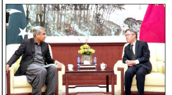
ISLAMABAD: Federal Minister for Interior Mohsin Naqvi in a meeting with Chinese Ambassador Jiang Zaidong in Federal Capital.

The administrative wing of the Ministry of SAFRON will be dissolved, and a special committee will be formed to decide the future of Jammu & Kashmir State Properties. As per sources, the sale of state properties will occur as needed, and the revenue generated will be spent on the welfare of Azad Kashmir and GB. Additionally, the Directorate of Health Services (DHS) of Kashmir and GB will undergo a review, with plans to transfer control to the Azad Kashmir government. DHS funding for GB will be managed in consultation with the Ministry of Health, the sources said. The Jammu and Kashmir Refugee Rehabilitation Organization is also set to be dissolved, and staff reductions will take place in the Azad Kashmir and Gilgit-Baltistan Councils, as well as in the CC Office.