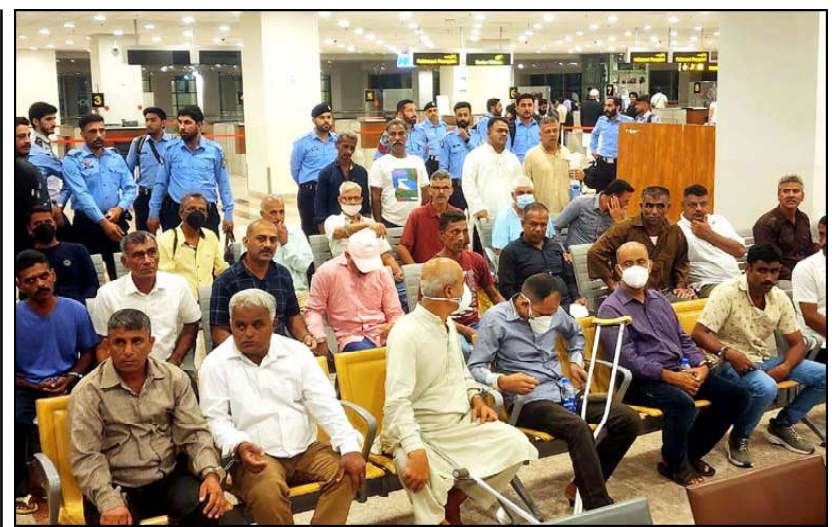
ISLAMABAD: Pakistani Prisoners on their return to Pakistan from Sri Lanka at Islamabad International Airport.

It is necessary to mention here that these Pakistan Army personnel embraced martyrdom while fighting bravely with Fitna al-Khawarij in North Waziristan.