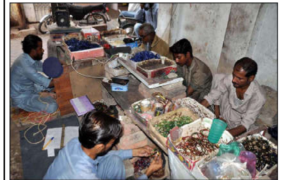
HYDERABAD: Laborers prepare bangles at a workshop as demand of bangles increased in Hyderabad.

He emphasized that earned income could be used in two ways either by investment or by spending, however added FBR would make both these activities inaccessible (absolutely impossible) for non-filers with the help of automation where FBR would integrate payment and invoicing systems.