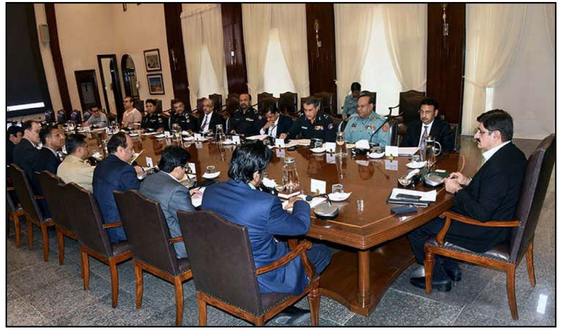
KARACHI: Sindh Chief Minister, Syed Murad Ali Shah presides over a meeting to review law and order situation, at CM House in Karachi.

for the restoration of their rights and the liberation of their lands on every possible platform. He called on human rights organizations and global powers to take practical steps against this oppression, ensuring that Palestinians receive their rightful entitlements and can live freely in their own country. The Governor concluded his statement with a prayer for the Palestinian people, asking for divine assistance in overcoming their suffering and achieving freedom.