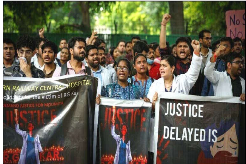
Doctors shout slogans during a protest demanding justice following the rape and murder of a trainee medic at a hospital in Kolkata, in New Delhi, India.

Monitoring Desk MILAN: Italian prosecutors on Saturday accused seven people and two sub-contractors of crimes including fraud and breaching airplane safety rules following an investigation into suspected flawed parts produced by an Italian company for Boeing. The prosecutors launched their investigation in late 2021, opens new tab after Boeing said some parts for its 787 Dreamliner plane supplied by a company working for Italian aerospace group Leonardo (LDO.FM), opens new tab had been improperly manufactured. Investigators found that two Italian sub-contractors used cheaper and non-compliant forms of titanium and aluminium to make certain parts, saving significant sums of money on their raw material costs.