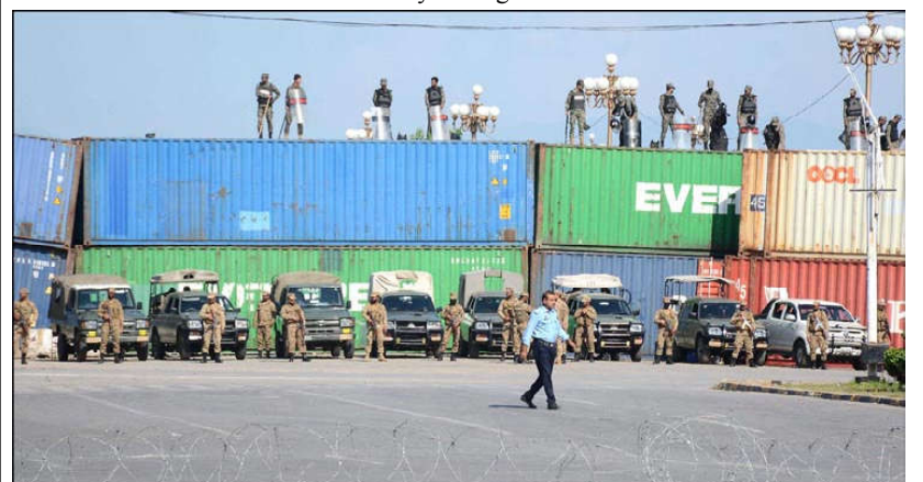
ISLAMABAD: Pakistan Army is standing upside down in D Chowk for peace and order in the country.

Amir Muqam said that under the dynamic leadership of Prime Minister Shehbaz Sharif, a number of mega projects have been launched and in the upcoming day Pakistan will host the Conference of Organization of Islamic Countries (OIC). The federal government will take stern action against the facilitators of PTI protestors who massively misused the resources of the poor province of KPK.