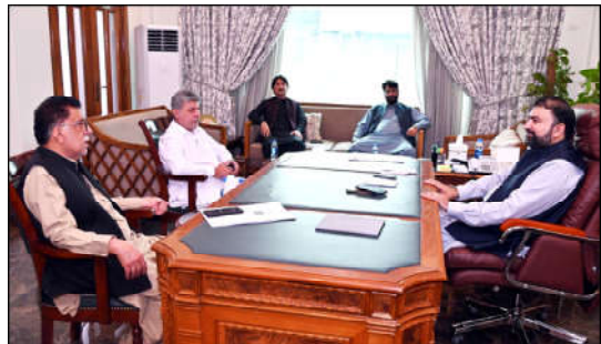
QUETTA: Provincial Ministers Mir Sadiq Umrani, Nawabzada Tariq Magsi and MP Mir Zabid Reki meeting with Chief Minister Balochistan Mir Sarfaraz Ahmed Bugti