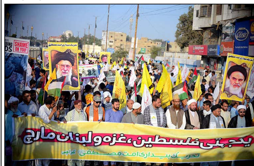
KARACHI: Supporters of Tehreek-e-Bedari-e-Ummat-e-Mustafa (SAWW) are holding protest demonstration against Israeli aggression and atrocities on the Gaza Strip and solidarity with the Palestinians, held at M.A Jinnah road in Karachi.