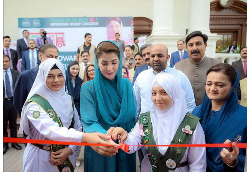
LAHORE: Punjab Chief Minister Maryam Nawaz Sharif along with students of Girls College inaugurate Chief Minister Transport Program for Women.