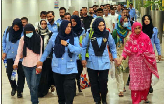
ISLAMABAD: Pakistani Prisoners on their return to Pakistan from Sri Lanka at Islamabad International Airport.

He regretted Muslims' weak role in unraveling the universe's mysteries. He said, Allama Iqbal called youth 'Shaheen' and encouraged them to move forward. The minister said the current era is driven by technology and artificial intelligence adding the Fourth Industrial Revolution and Big Data were changing human leadership and predicted that future progress belongs to nations that excel in science and technology. Ahsan Iqbal said that the Ministries of Planning and Education plan to utilize Space Week as a platform for youth and stressed the importance of increasing young people's interest.