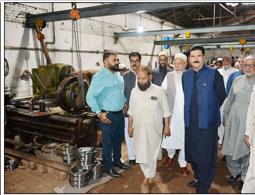
PESHAWAR: Governor Khyber Pakhtunkhwa Faisal Karim Kundi visits Daudsons Army at Industrial Estate.

Jam Kamal urged REAP to propose actionable suggestions for achieving the government's export targets within the next year, emphasizing the importance of addressing food safety concerns, especially in the European Union, where standards are becoming increasingly stringent.