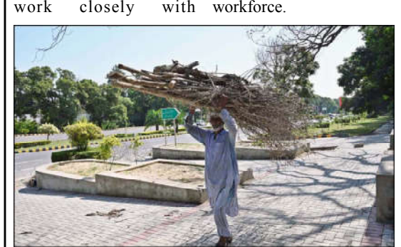
ISLAMABAD: An elderly person on the way carrying bundle of dry branches of tree for domestic use in Federal Capital.