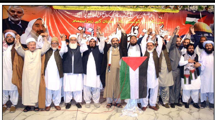
QUETTA: Participants of Gaza Conference express solidarity with the people of who are facing the Israeli aggression.