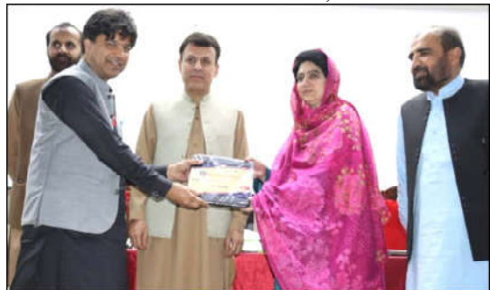
QUETTA: Provincial Minister for Education Raheela Hameed Khan Durrani distributing certificate among participants of a conference organized by University of Balochistan

He said that the provincial government has increased the grant of public sector universities from Rs. 2.5 billion to Rs. 5 billion during the current financial year. The formula of distribution of grant among the universities has also been devised, she added.