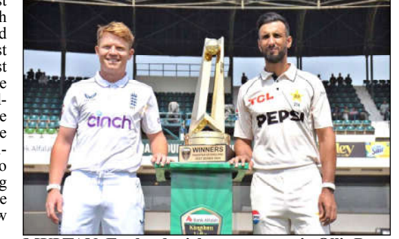
MULTAN: England cricket team captain Ollie Pope and his Pakistani counterpart Shan Masood pose with the Test series trophy on as first Test cricket match will be played from October 7-11 at the Multan Cricket Stadium.

need to leave poor results behind and begin Pakistan's resurgence as a top cricketing nation. "We have a huge opportunity to turn things around against England, and we're looking to make a strong start in Multan," Masood said earlier in the week. "The team is excited, and we're hoping for memorable results." "I assure you, everyone is eager for a comeback and to take Pakistan cricket in the right direction. Pressure is a privilege — leading your country is an honor,