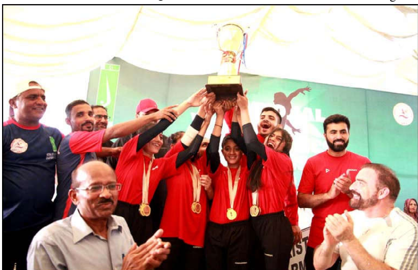
KARACHI: Players of Pakistan Army Team are lifting trophy after wins National Women Gymnastics Championship 2024 held in Karachi.

DUBAI (APP): India women beat Pakistan women by six wickets in the seventh fixture of the ICC Women's T20 World Cup 2024 at the Dubai International Cricket Stadium (DICS) on Sunday afternoon. This was Pakistan's first defeat in the ongoing mega event, while India claimed their first win. Chasing a modest 106 to win, India achieved the target for the loss of four wickets in the 19th over. India's captain Harmanpreet Kaur played a responsible innings and scored 29 off 24 balls including a four. Opening batter Shafali Verma top-scored with a 35-ball 32, hitting three fours. Jemimah Rodrigues was other notable run-getter for the winning team with a 28-ball 23. Captain Fatima Sana was the most successful bowler for Pakistan, bagging two wickets for 23 runs in her four overs, while Omaima Sohail and Sadia Iqbal snapped a wicket each. Earlier, after opting to bat first, Pakistan managed to score 105 for eight in their allotted 20 overs. Former captain Nida Dar top-scored for the side with 28 off 34 balls including a four. That Pakistan were able to get past the 100-run mark was due to a 28-run partnership between Nida and Syeda Aroob Shah (14 not out, 17b, 1x4) for the eighth wicket. Wicketkeeper-batter Muneeba Ali (17, 26b, 2x4s) and Fatima (13, 8b, 2x4s) were the other batters to reach double figures.