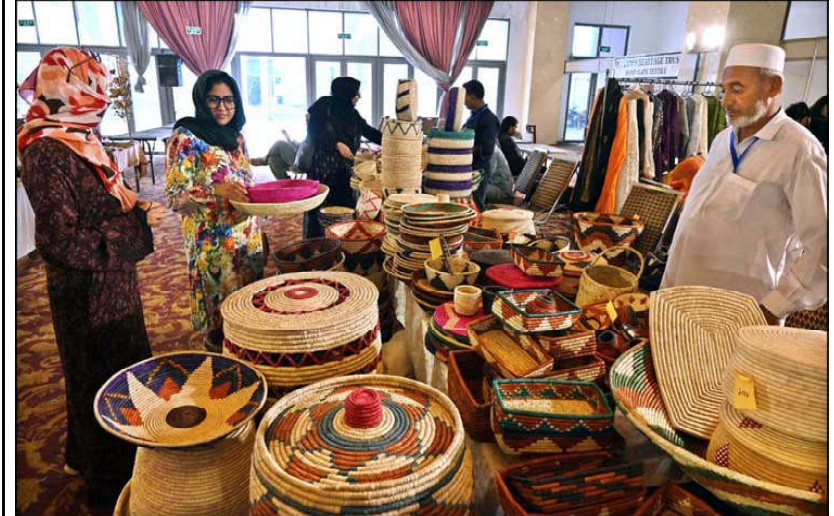
ISLAMABAD: Visitors taking keen interest in different handmade items displayed by artisans during two day "Daachi Arts & Craft Exhibition" at Pak China Friendship Centre in the Federal Capital.

ISLAMABAD (APP): Indus River System Authority (IRSA) on Sunday released 151,400 cusecs water from various rim stations with inflow of 121,600 cusecs. According to the data released by IRSA, the water level in River Indus at Tarbela Dam was 1536.90 feet and was 138.90 feet higher than its dead level of 1,398 feet. The water inflow and outflow in the dam was recorded as 71,400 cusecs and 68,000 cusecs respectively. The water level in River Jhelum at Mangla Dam was 1209.90 feet, which was 159.90 feet higher than its dead level of 1,050 feet.