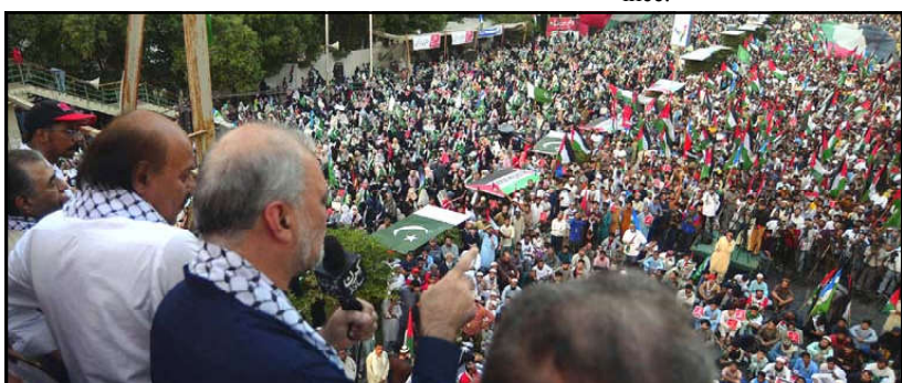
KARACHI: Jamal-e-Islami (JI) Chief, Hafiz Naeem-ur-Rehman addresses to his supporters during a protest rally against Israeli cruel and inhumane acts and expressing unity with the innocent people of Palestine, at Shahrah-e-Faisal in Karachi.