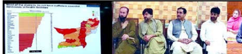
QUETTA: Provincial Health Minister Bakht Muhammad Kakar being briefed by DG Health Dr. Amin Mandokhail regarding betterment of health department

"They are treading course of collision. They have nothing to do with the prosperity of the country. They just know how to commit corruption and dance," the KP governor said.