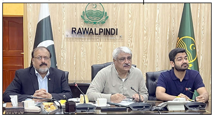
LAHORE: Punjab Minister for Health Khawaja Salman Rafique and Deputy Commissioner preside over the meeting regarding anti-dengue campaign.