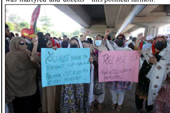
PESHAWAR: Activists of Tehreek-e-Insaf (PTI) are holding protest demonstration for release of PTI Founder Imran Khan, outside KPK Assembly in Peshawar.

Furthermore, she expressed regrets for the parents who were sacrificing their children in this political turmoil.