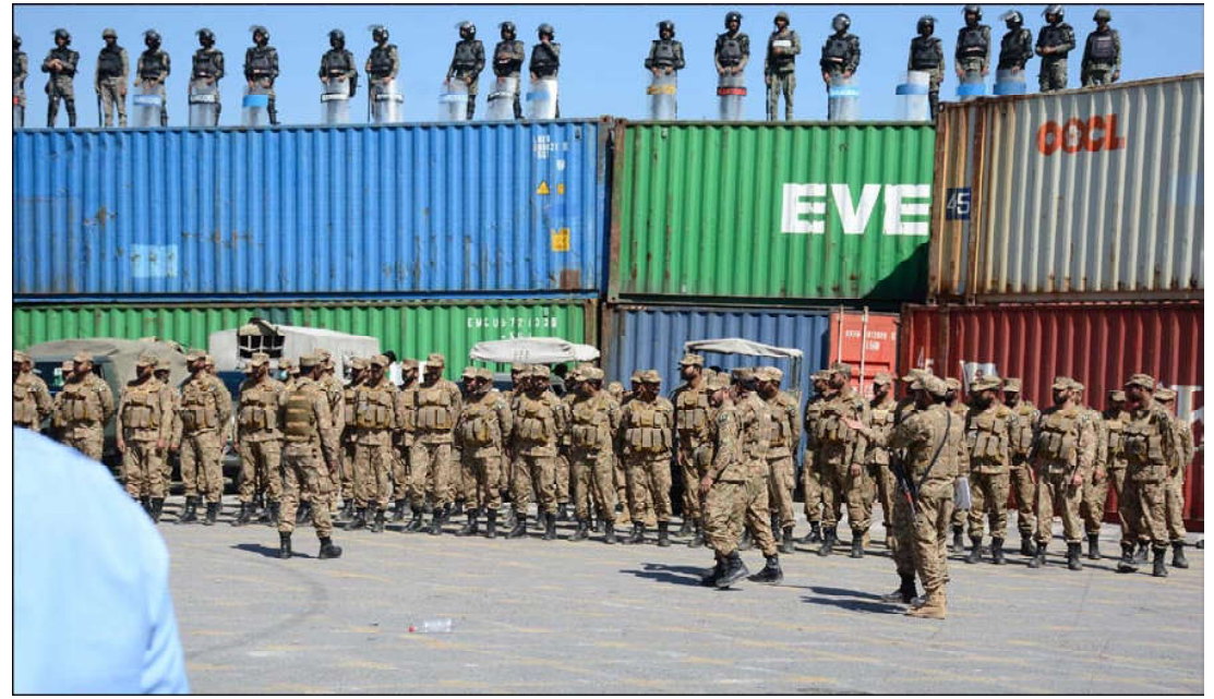
ISLAMABAD: Army and Rangers are standing in reverse to control PTI's protest and situation at D Chowk.