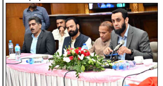
LAHORE: Federal Minister for Information, Broadcasting, National Heritage and Culture Attaullah Tarar addressing the meeting of the UC Chairmen and Vice Chairmen of constituency NA-127 at Model Town.