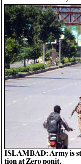
ISLAMABAD: Army is standing in reverse to control PTI's protest and situation at Zero point.

In a media talk after the funeral of the constable who was martyred during the PTI protest here, the Interior Minister said that those involved in the killing of the martyr would face law and vowed to bring the culprits to justice. He expressed his condolences to the police and the victim's family.