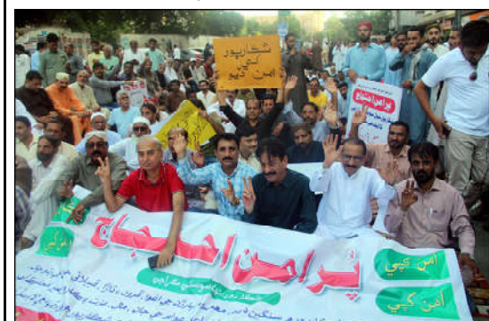
KARACHI: Activists of Shikapur Civil Society demonstrate in favour of their demands outside the Karachi Press Club.

He said that currently 50 thousand young people were receiving free IT training in the Governor House.