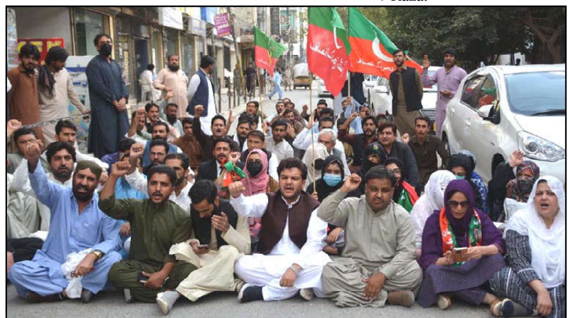
QUETTA: PTI workers stage a protest in favor of their demands outside OPC.

In a post on his official X-handle, the Senator wrote, "It happened many times in the past that the government of the PML-N and the Pakistan People's Party was in some parts of the federation and provinces. Despite the mutual tension, it has never happened that any of the federating unit has attacked the