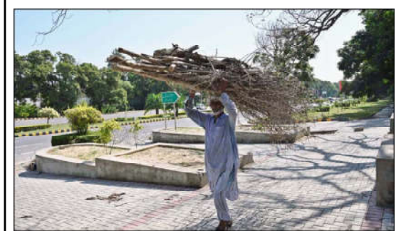
ISLAMABAD: An elderly person on the way carrying bundle of dry branches of tree for domestic use in Federal Capital.