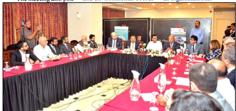
KARACHI: Federal Minister for Education and Professional Training Khalid Maqbool Siddiqui chairing a meeting with the NAVTTC counterpart colleagues from United Kingdom.