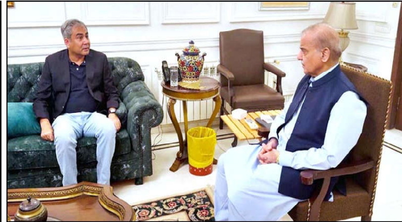
LAHORE: Interior Minister Syed Mohsin Raza Naqvi calls on Prime Minister Muhammad Shehbaz Sharif.

The PM commended both the interior minister and the minister for privatization for their efforts in facilitating the prisoners' return from Sri Lanka.