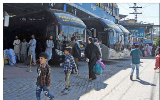
RAWALPINDI: People are arriving at Faizabad bus station for traveling their home towns as bus station open after three days in the city, due to roads closed during PTI protest in twin cities.

According to the data 1307 motorbikes, 82 autorickshaws, 122 motorcars, 34 vans, 10 passenger buses, 22 truck and 117 other types of vehicles and carts were involved in these road traffic accidents.