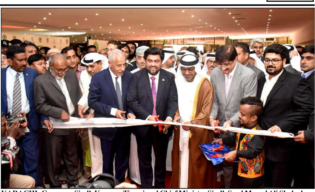
KARACHI: Governor Sindh Kamran Tissori and Chief Minister Sindh Syed Murad Ali Shah along with foreign delegates inaugurate the Pakistan First 2 day International Date Palm Festival in collaboration with Khalifa International Awards (UAE) organized by Ministry of National Food Security

He reiterated that the government's priority is to provide maximum facilities to the people. All economic indicators are positive, with exports increasing, the trade deficit decreasing, and inflation dropping to 6.9%, surpassing even expert projections.