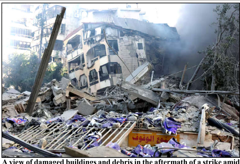
A view of damaged buildings and debris in the aftermath of a strike amid ongoing hostilities between Hezbollah and Israeli forces, in Beirut's south