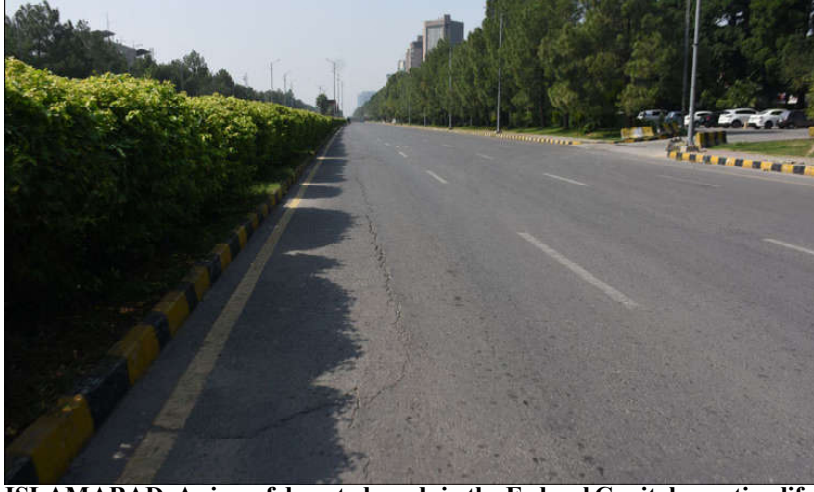
ISLAMABAD: A view of deserted roads in the Federal Capital, creating life miserable for citizens.