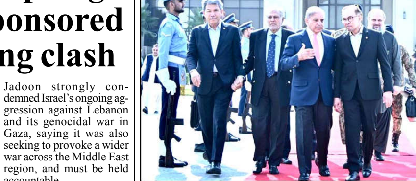
RAWALPINDI: Prime Minister, Muhammad Shehbaz Sharif bidding fare well to Prime Minister of Malaysia, Dato Seri Anwar Ibrahim before his departure at PAF Nur Khan Air Base in Rawalpindi.

Iqbal ahead of the upcoming historic visit of Chinese Premier, Li Qiang.