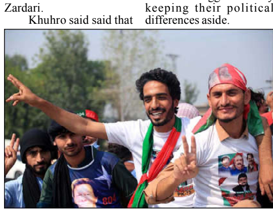
PESHAWAR: Activists and supporters of Tehreeke-Insaf (PTI) are holding protest rally at the entrance to the Motorway-1 in Peshawar.

Palestine, and urged the United Nations play its role in stopping the Israeli aggression. He appealed to all political parties to take a strong united stand against the Israeli aggression by