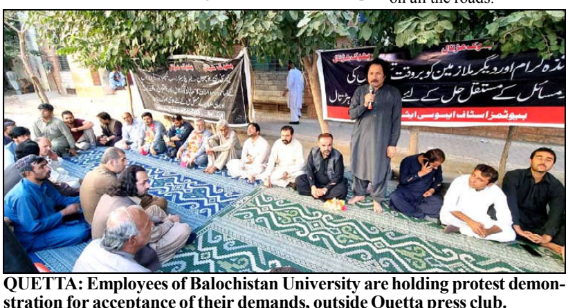
stration for acceptance of their demands, outside Quetta press club.

too has been sealed on different spots IJP Double road has also closed for traffic. All the roads coming to Murree road have also been shut. Heavy contingent of police have been deployed on all the roads.