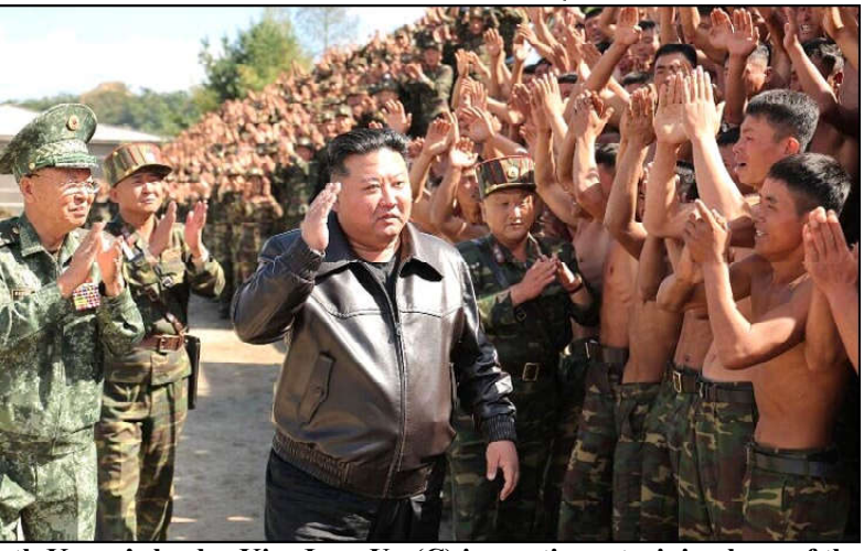
North Korea's leader Kim Jong Un (C) inspecting a training base of the Korean People's Army's special operations forces in the western region, at an undisclosed location in North Korea.

potential supply disrup-This will mark the first