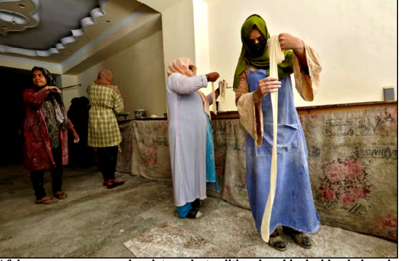
Afghan women prepare dough to make traditional cookies inside a bakery in

'Don't go digging", he urged others who might think they had also worked out the answer.