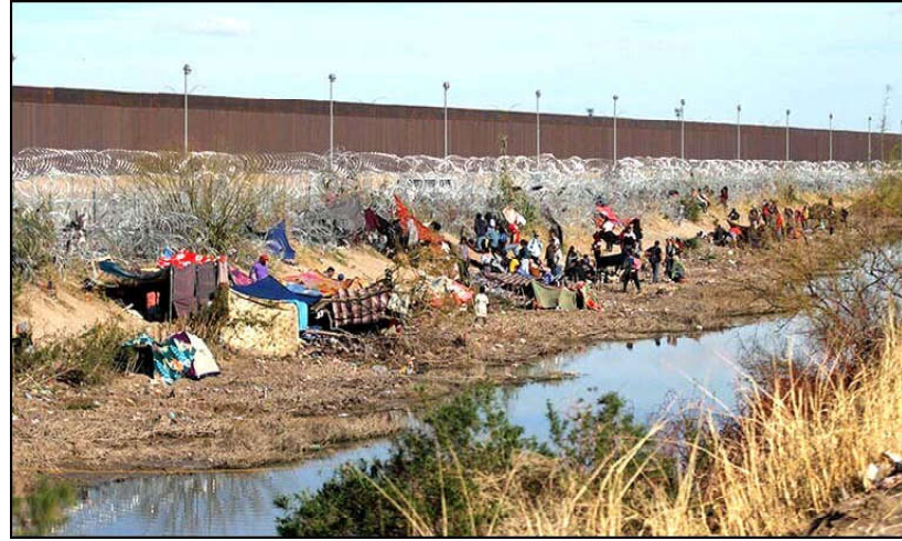
Migrants seeking asylum wait on the border of Ciudad Juarez, Chihuahua state, Mexico.

This would mean that cyclones contributed to between three and five per cent of all deaths recorded in the affected areas on the US Atlantic coast over those 85 years, the study said. The total death toll over that time could be as high as five million, meaning that cyclones may have contributed to more deaths than car accidents, infectious diseases or deaths in war, it added. When the researchers first saw how long the devastating effect of cyclones lasted on communities — which drove the huge numbers — they were "very surprised."