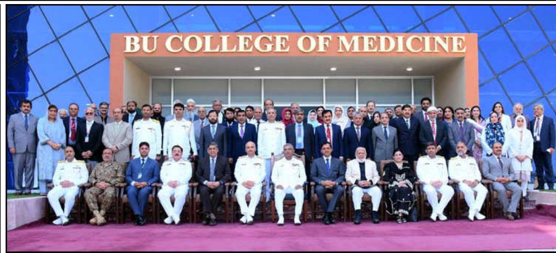
ISLAMABAD: Chief of Naval Staff, Admiral Naveed Ashraf in a group photo with officials of Bahria University College of Medicine during ceremony held in Islamabad.

There have been repeated discussions with relevant bodies, provinces, fund implementing partners (FIPs), researchers, practitioners and experts related to the subject which resulted into culmination of