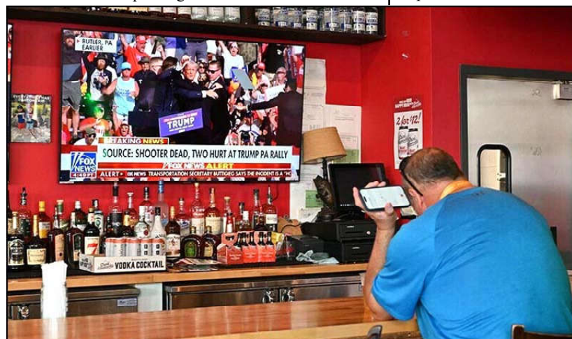
People watch the news on television inside a bar in Wisconsin.

"The temperature of the ocean surface near Japan was also markedly high, which possibly contributed to high temperatures on the ground," it added, citing the "long-term effect of global warming" as well.