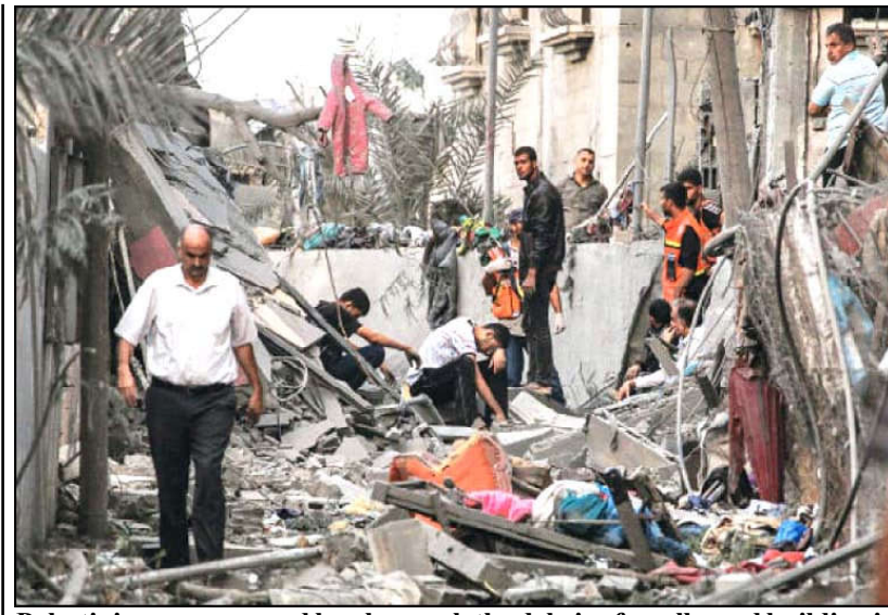
Palestinian rescuers and locals search the debris of a collapsed building in Khan Younis after an Israeli air strike.

"Europeans and the US said if we do not act, there will be a peace in Gaza in one week. We waited for them to have peace but they increased their killing," he said.