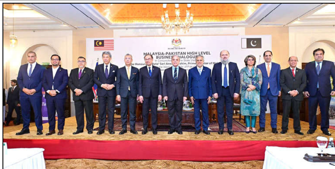
ISLAMABAD: Prime Minister Muhammad Shehbaz Sharif and Prime Minister of Malaysia YAB Dato' Seri Anwar Ibrahim in a group photo at Malaysia-Pakistan High Level Business Dialogue.