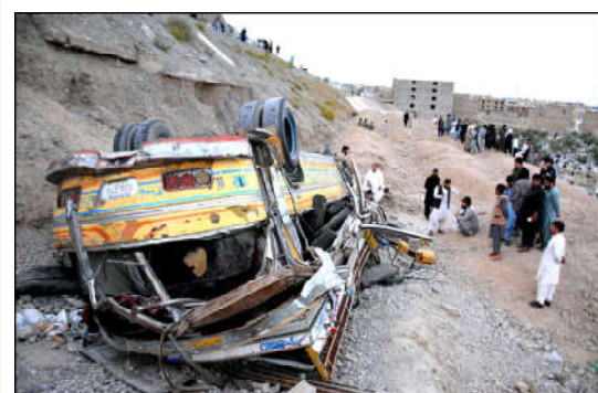
QUETTA: A large number of people are gathered after a bus fell into a ditch due to over speeding, near Hazara Graveyard located on Western Bypass in Quetta.

Meanwhile, the Minister personally visited the hospital and inquired about the health of injured.