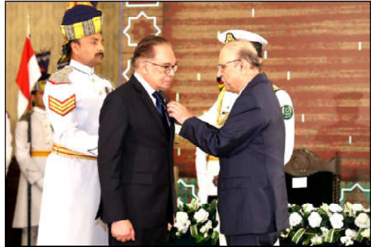
President Asif Ali Zardari conferring the award of Nishan-e-Pakistan upon the Prime Minister of Malaysia, Dato Seri Anwar Ibrahim, during a special investiture ceremony held at Aiwan-e-Sadr.