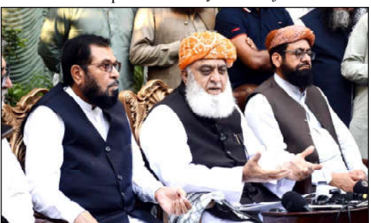
ISLAMABAD: Maulana Fazlur Rehman, head of Jamiat Ulema-e-Islam Pakistan addressing a press conference.