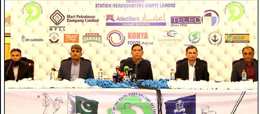
LAHORE: Commander Central Punjab Pakistan Navy Admiral Azhar Mahmood briefing media about 10th Chief of Naval Staff Amateur Net Shield Golf Tournament.