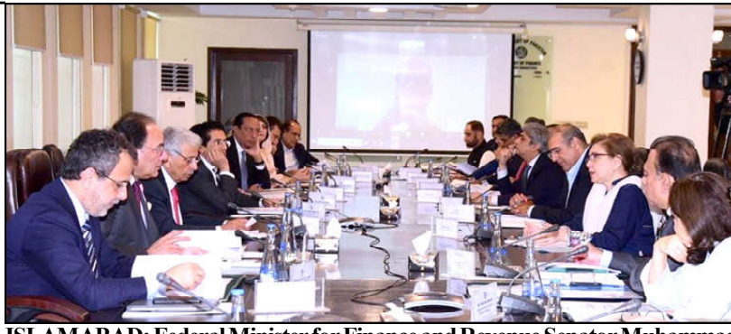
ISLAMABAD: Federal Minister for Finance and Revenue Senator Muhammad Aurangzeb chaired the meeting of the Economic Coordination Committee (ECC) at the Finance Division in Federal Capital.