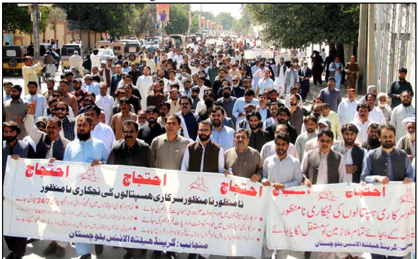
QUETTA: Members of Grand Health Alliance Balochistan are holding protest rally against privatization of government hospitals, in Quetta.

The Additional Attorney General said that the decision on Article 63A was full of contradictions. He said that on the one hand it said that vote was a fundamental right but at the same time this right was abolished on the direction of the party.