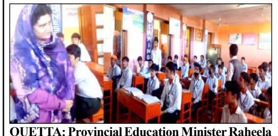
QUETTA: Provincial Education Minister Raheela Hameed Khan Durran inspecting class room during her visit to Sandeman School.