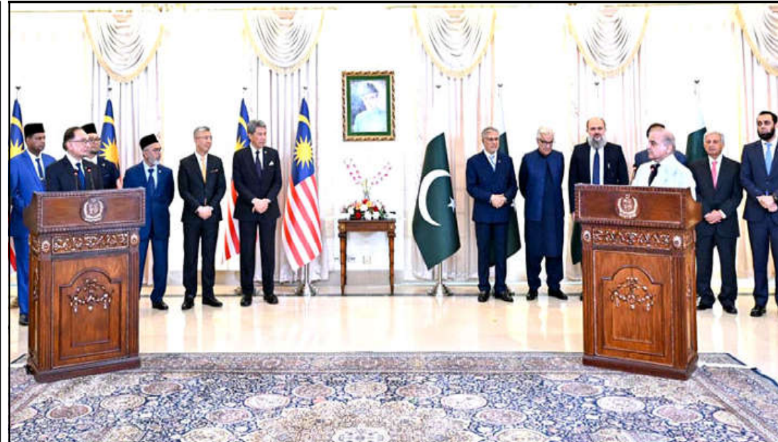
ISLAMABAD: Prime Minister Muhammad Shehbaz Sharif and the Prime Minister of Malaysia, Dato' Seri Anwar Ibrahim address a joint press stakeout.

Health officials associated with the federal government as well as provincial governments are urging parents to ensure their children receive the polio vaccine, which is crucial in preventing the spread of this debilitating disease.