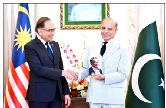
ISLAMABAD: The Prime Minister of Malaysia, Dato' Seri Anwar Ibrahim present Prime Minister Muhammad Shehbaz Sharif his book titled "Asian Renaissance", at a MoU signing ceremony.