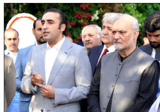
ISLAMABAD: Chairman Pakistan People's Party Bilawal Bhutto Zardari talking with media persons along with Chief of Jamaat-e-Islami Hafiz Naem Ur Rehman after a meeting at Zardari House, in the Federal Capital.