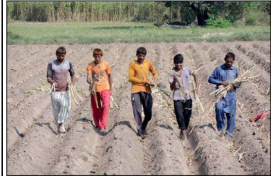
FAISALABAD: Farmers are working hard in the fields to plant sugarcane, an important crop in the sugar industry in the outskirts area of the city.

Cargo volume of 147,934 tonnes, comprising 100,291 tonnes.