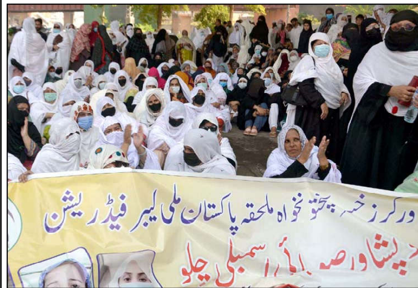
PESHAWAR: Lady Health Workers are holding protest demonstration against non-payment of their salaries, outside KPK Assembly in Peshawar.