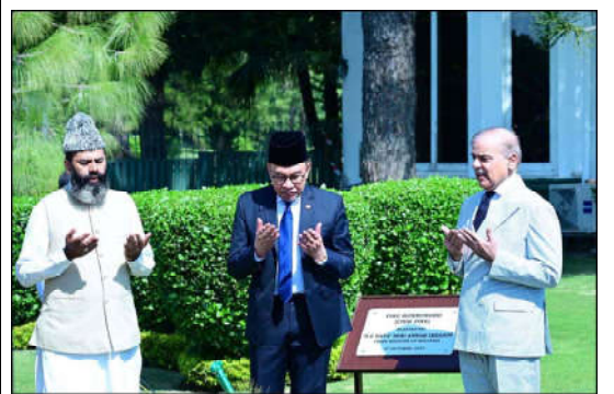
ISLAMABAD: Prime Minister Muhammad Shehbaz Sharif and Prime Minister of Malaysia Dato' Seri Anwar Ibrahim offering a prayer for tree plantation by the Malaysian Prime Minister.

The Naval Chief also visited various facilities at the campus and appreciated state of the art infrastructure.