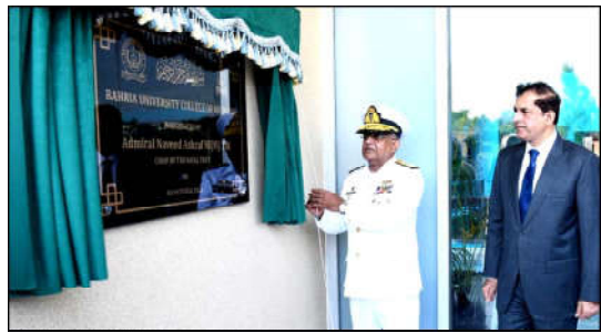
ISLAMABAD: Chief of the Naval Staff Admiral Naveed Ashraf inaugurating Bahria University College of Medicine.

He has also been a voice for the causes of self-determination movements and has particularly stood against oppression across the world. He continues to work tirelessly to counter Islamophobia striving to create interfaith harmony by fostering understanding and respect between different cultures and religions.