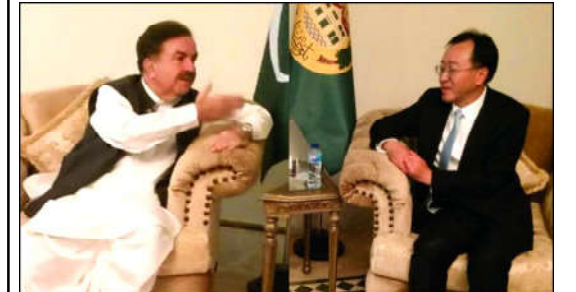
KARACHI: Chinese Consul General Yang Yundong meeting with Governor Balochistan Sheikh Jaffar Khan Mandokhail

The Chinese Consul General on the occasion invited Governor to visit China. Both the leaders were agreed on extending cooperation and assistance in different sectors.