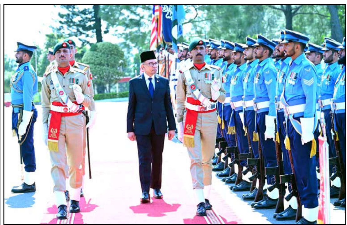
ISLAMABAD: Prime Minister of Malaysia Dato' Seri Anwar Ibrahim being presented Guard of Honor upon arrival at the Prime Minister's House.

The national anthems of Pakistan and Malaysia were played as the foreign dignitary stood at the salute dias.