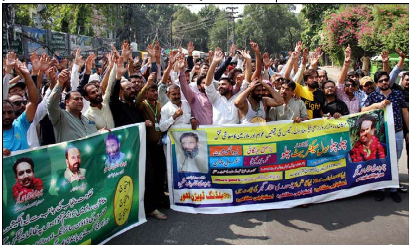
LAHORE: Members of All Pakistan Clerks Association (APCA) are holding protest demonstration against massive unemployment, increasing price of daily use products and inflation price hiking, at Lahore press club.