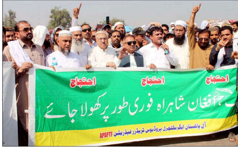
PESHAWAR: Members of All Pakistan Agriculture Produce Traders Federation are holding protest demonstration for acceptance of their demands.

Drawing attention to the longstanding camaraderie, the Ambassador likened the two nations to "part of the same body and soul," and remarked on the high demand for Pakistani products not only in Tajikistan but across Central Asia. He highlighted the potential for importing high-quality Maldivian tuna at competitive rates, he suggested Pakistani businesses could reciprocate by exporting vegetables and fruits to the Maldives.