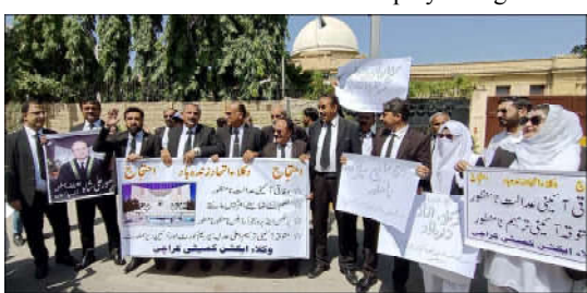
KARACHI: Members of Lawyers Action Committee are holding protest demonstration against the establishment of the Federal Constitutional Court and proposed constitutional amendments, outside the Supreme Court Karachi Registry building.