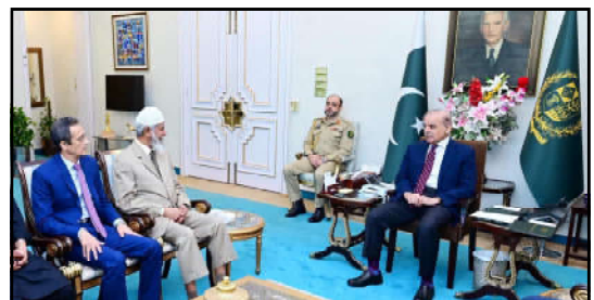
ISLAMABAD: Renowned Islamic Scholar Dr. Zakir Naik calls on Prime Minister Muhammad Shehbaz Sharif.