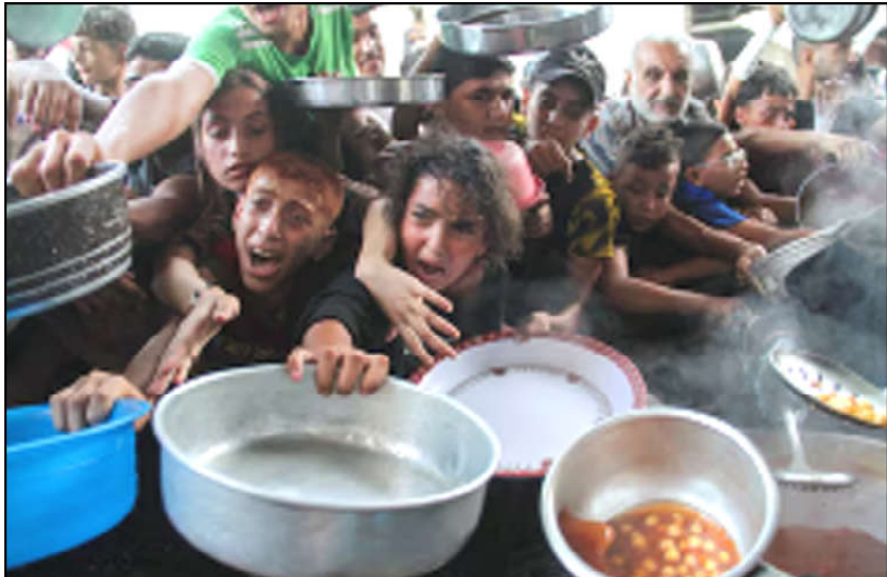
Palestinians gather to receive food cooked by a charity kitchen, amid the Israel-Hamas conflict, in the northern Gaza Strip.

"This attack will have consequences. We have plans, and we will operate at the place and time we decide," said Israeli military spokesman Rear Admiral Daniel Hagari.