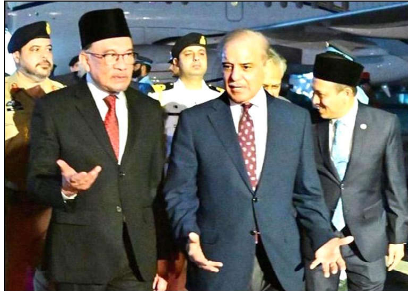
Prime Minister Muhammad Shehbaz Sharif welcoming the prime Minister of Malaysia Dato' Seri Anwar Ibrahim upon his arrival on a 3-day official visit at Islamabad.