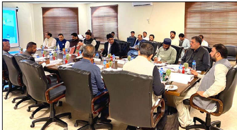
GWADAR: Balochistan Chief Minister Mir Sarfaraz Ahmed Bugti presiding over 29th meeting of Governing Body of Gwadar Development Authority