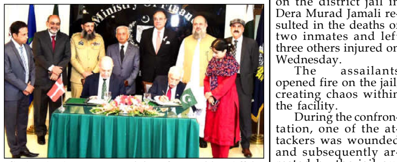
ISLAMABAD: Federal Minister for Maritime Affairs Qaiser Ahmed Sheikh signed the MoU on behalf of Government of Pakistan with Danish Government. Finance Minister for Finance and Revenue Muhammad Aurangzeb, Federal Minister for Commerce Jam Kamal and Federal Minister for Industries Rana Tanveer were present on the occasion.

This initiative would also highlight the prospects of joint efforts for enhancing the trade and coordination and relationship among the people in country.