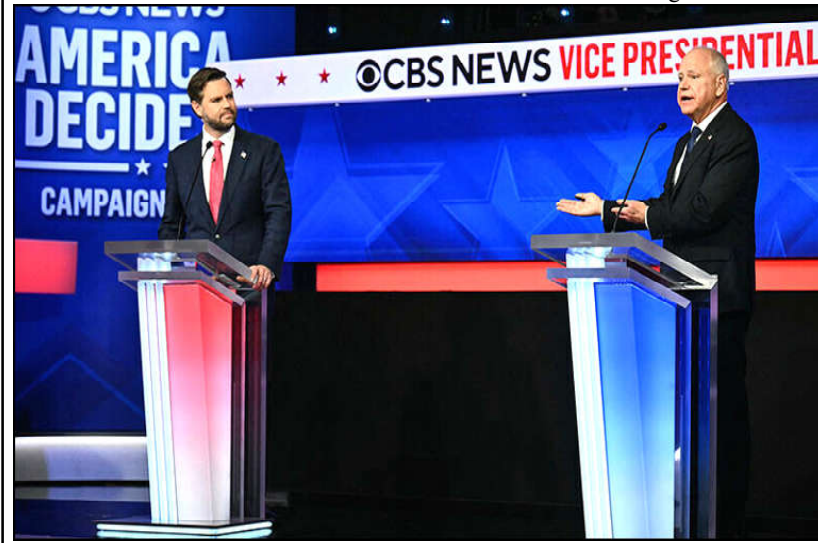
US Senator and Republican vice presidential candidate JD Vance and Minnesota Governor and Democratic vice presidential candidate Tim Walz participate in the Vice Presidential debate hosted by CBS News at the CBS Broadcast Center in New York City.

Bangladesh, one of the world's largest garment producers and a supplier to western brands such as H&M, Zara and Carrefour, has been facing widespread protests in recent weeks, leading to the closure of dozens of factories. The protests have worsened an already significant production backlog caused by recent political turmoil and devastating floods.