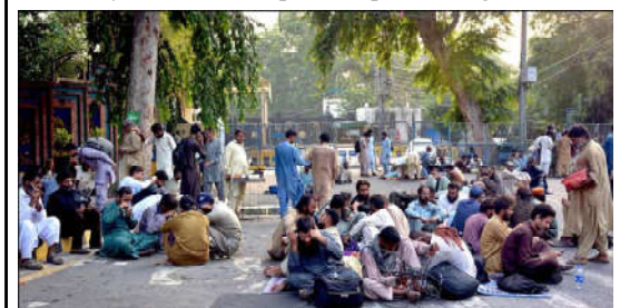
LAHORE: Disabled blind persons are holding protest demonstration for demanding employment, outside CM House in Lahore.