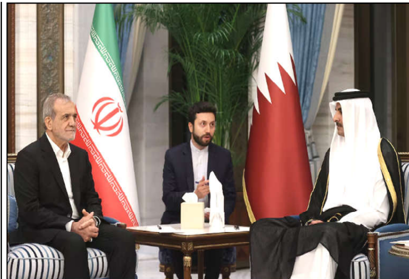
Qatar's Emir Sheikh Tamim bin Hamad al-Thani meets with Iran's President Masoud Pezeshkian, in Doha, Qatar.

Monitoring Desk FLORIDA: Almost 1.3 million homes and businesses were still without power in the US Southeast and Midwest on Wednesday after Helene slammed into the Florida Panhandle as a major hurricane on Sept 26, according to data from PowerOutage.us. Those outages were down from around 1.7 million on Tuesday as utilities continued to restore power. In total, the storm knocked out service to around 5.5 million customers, predominantly in the Southeast. Helene's winds, rain and storm surge killed more than 160 people. The utility with the most outages was US energy company Duke Energy in the Carolinas with about 323,000 customers still out in South Carolina and 299,000 still out in North Carolina, according to PowerOutage.us.