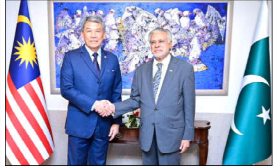
ISLAMABAD: Deputy Prime Minister and Foreign Minister Senator Mohammad Ishaq Dar welcomes the Foreign Minister of Malaysia Dato Seri Utama Haji Mohamad Bin Haji Hasan, on his arrival at the Ministry of Foreign Affairs.