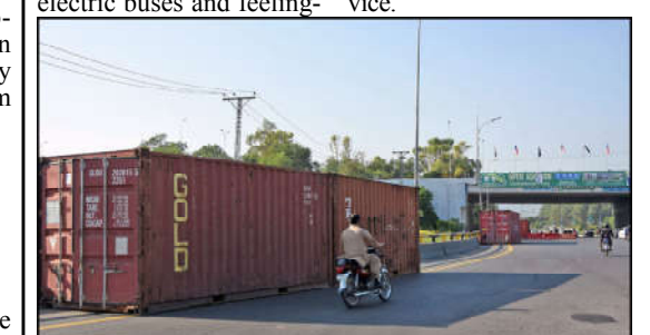
ISLAMABAD: A view of heavy shipping containers placed alongside Islamabad Highway near zero point due to PTI protest on October 4, Friday, in the Federal Capital.

He further appreciated the landmark initiative of the present government under the leadership of Prime Minister Muhammad Shehbaz Sharif, who directed the Capital Development Authority (CDA) to launch the electric buses in various sectors of the city that were not covered under the erstwhile Metro Bus service.