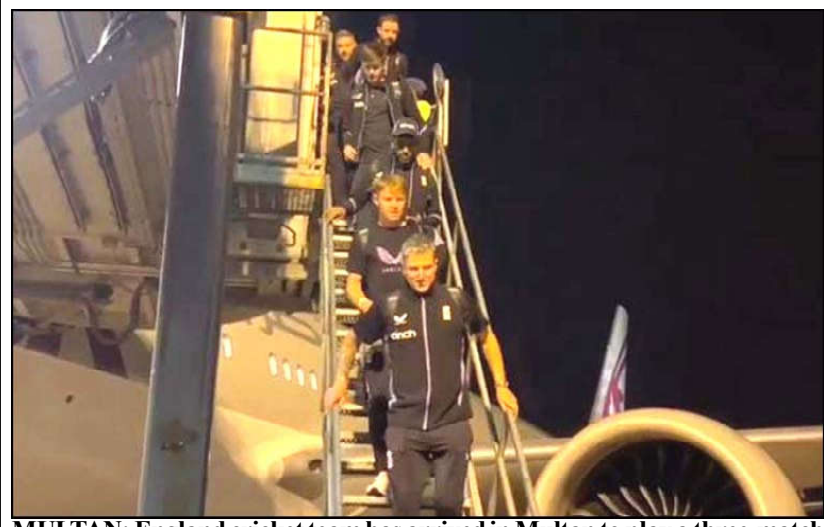
MULTAN: England cricket team has arrived in Multan to play a three-match Test series against Pakistan.