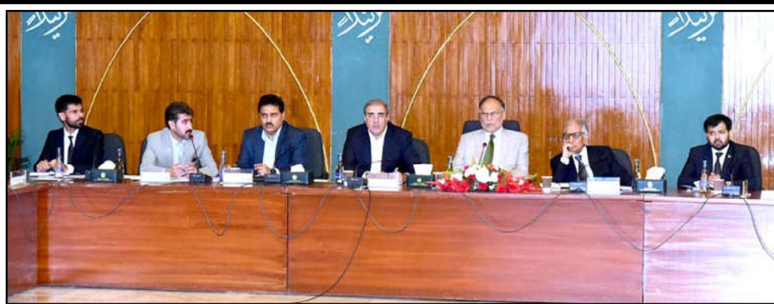
ISLAMABAD: Ahead of the mid-October Shanghai Cooperation Organization (SCO) Summit, a high-level review meeting on China-Pakistan Economic Corridor (CPEC) projects was convened under the chairmanship of Minister for Planning, Development, and Special Initiatives, Ahsan Iqbal.

ISLAMABAD (APP): Prime Minister Muhammad Shehbaz Sharif on Wednesday lauded eminent scholar Dr Zakir Naik's exceptional efforts in spreading the true essence of Holy Quran and Hadith, besides promoting Islamic values worldwide. The prime minister warmly welcomed Dr Zakir, expressing his admiration for his scholarly work. He said the entire Ummah was proud of him for projecting the real image of Islam across the world. It was heartening to note that a vast majority of youth listened to his lectures. PM Shehbaz said that he had personally benefited from Dr Zakir's lectures, enriching himself from the valuable teachings of Islam. He said that the people of Pakistan fully admired the great personality of Dr Naik and were happy over his presence in the country.