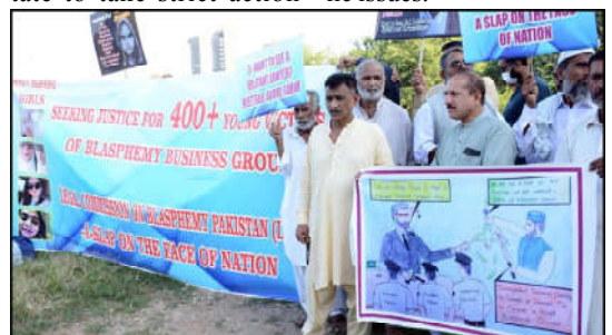
ISLAMABAD: Parents of more than 450 children caught in blasphemy cases hold Protest outside NPC.

Rana Sanallah has strongly criticized Pakistan Tehreek-e-Insaf (PTI) for its undemocratic attitude, stating that they are unwilling to engage with the government and are not serious about addressing public issues.