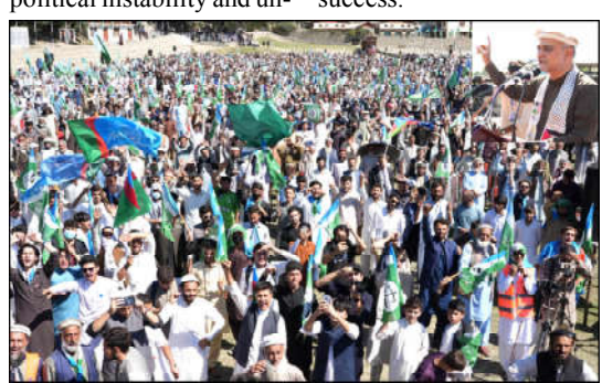
CHITRA: Ameer Jamaat Islami Hafiz Naeem ur Rehman addressing a public gathering