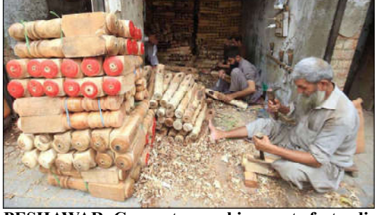
PESHAWAR: Carpenters making part of a traditional bed (charpai) at his workplace in Dabgari area.