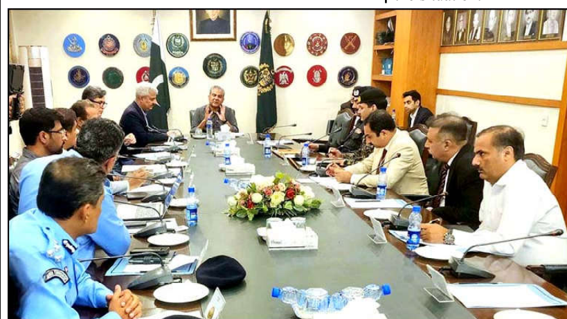
ISLAMABAD: Federal Minister for Interior Mohsin Naqvi chairing a meeting regarding preparation of SCO Summit.