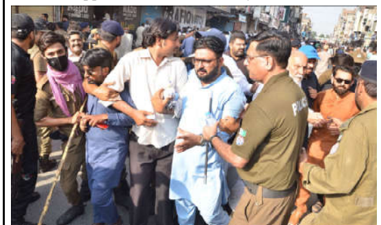
FAISALABAD: Protest demonstrations on the call of Pakistan Tehreek-e-Insaf in the city.