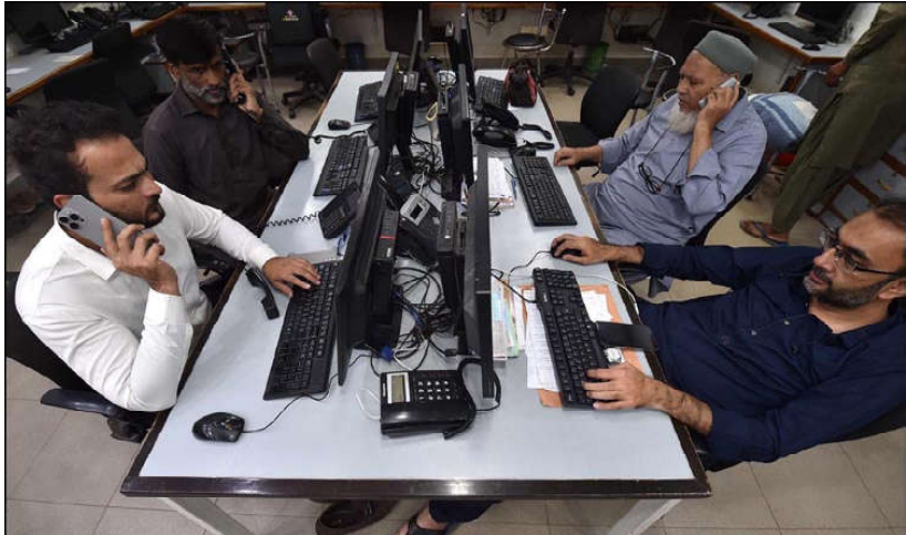
KARACHI: Pakistani stockbroker monitors the share prices during a trading session at the Pakistan Stock Exchange (PSX) in Karachi.

opportunity to deepen these relations further. He said visit would lead to the signing of new agreements and memorandum of understandings (MoUs) aimed at diversifying trade portfolios and increasing market access for two countries. He said his visit would underscore the importance of regional partnerships in overcoming economic challenges posed by the global market. Enhanced cooperation between Malaysia and Pakistan would not only strengthen bilateral trade but also contribute to broader regional economic stability and growth, he added.