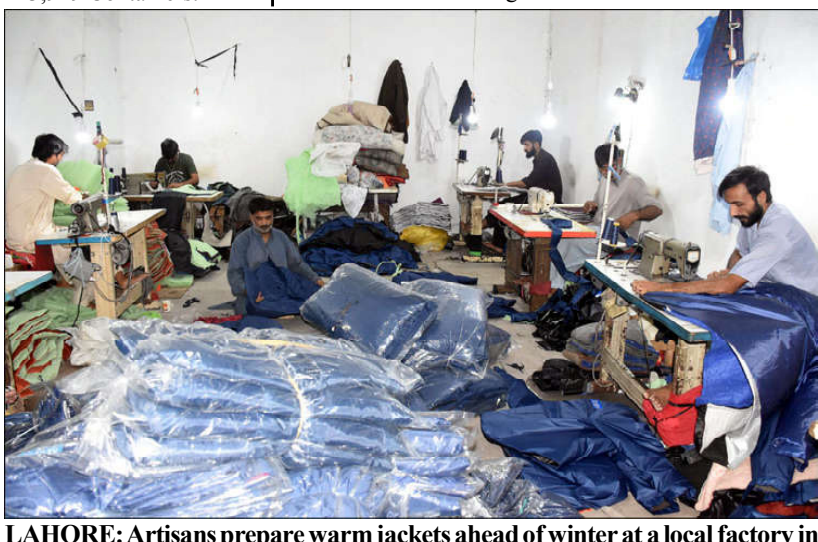
LAHORE: Artisans prepare warm jackets ahead of winter at a local factory in the provincial capital.