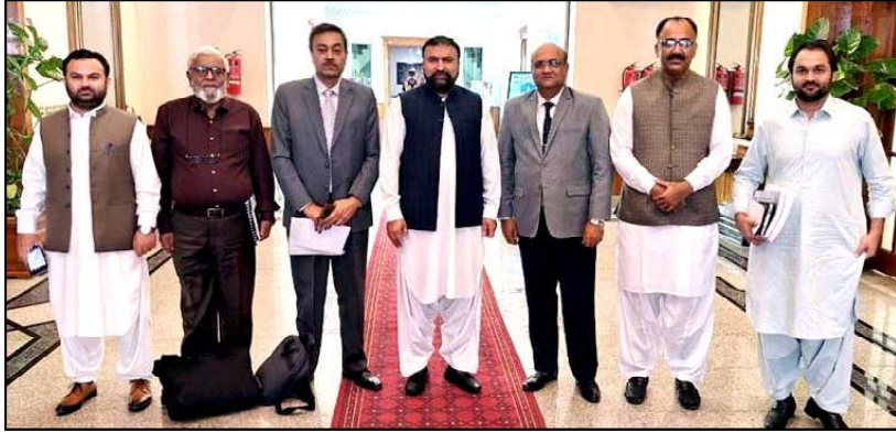
QUETTA: Chief Minister Balochistan Mir Sarfaraz Ahmed Bugti in a group photo with officials of Kachhi Canal Project

Repair work on Phase-I to be completed by November 15: Kachhi canal project has backbone status in agricultural economy of Balochistan, says CM