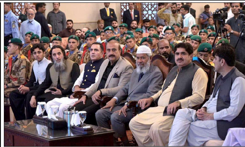
ISLAMABAD: Famous Islamic Scholar Dr Zakir Naik meeting with the students of Sweet Home in a Local Hotel.