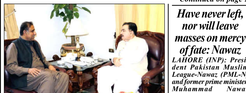
QUETTA: Provincial Minister Mir Saleem Ahmed Khosa meeting with Governor Balochistan Sheikh Jaffar Khan Mandokhail