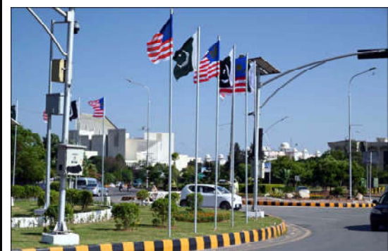
ISLAMABAD: The flags of Pakistan and Malaysia hoisted in front of Parliament House, celebrating the warm reception for Malaysian Prime Minister Datuk Seri Anwar Ibrahim during his first official visit to Pakistan in early October.