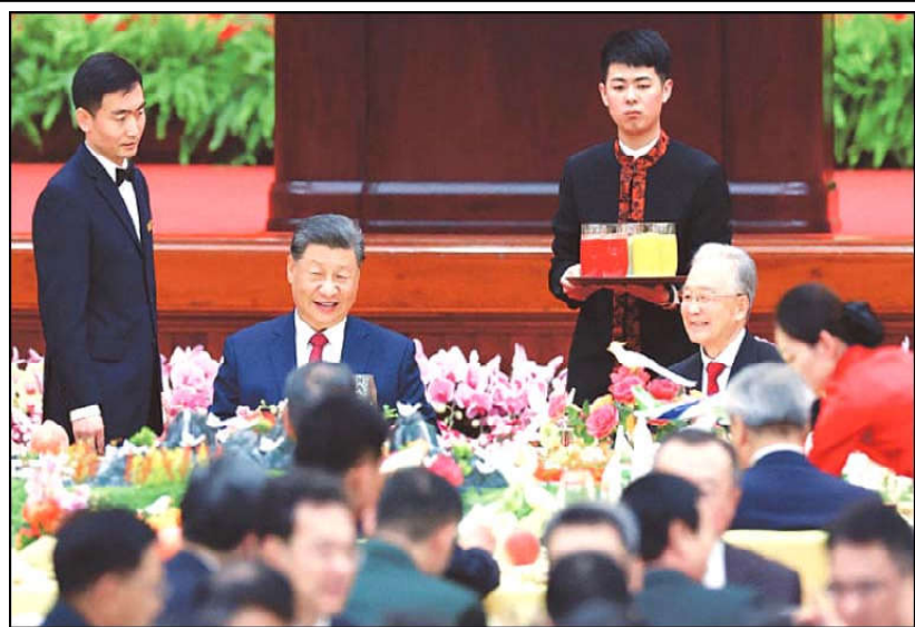
President Xi Jinping and ex-premier Wen Jiabao attend the national day reception at the Great Hall of the People.

Monitoring Desk BEIRUT: French Foreign Minister Jean-Noel Barrot on Monday urged Israel not to send ground troops into Lebanon, calling on Israel and armed group Hezbollah to immediately agree to a ceasefire. "I urge Israel to refrain from any ground incursion and to cease fire. I call on Hezbollah to do the same and refrain from any action that could destabilise the region," Barrot told reporters in Beirut. He called on the sides to agree to a truce put forward at the United Nations. "It is still on the table. There is still hope, but there is little time," Barrot said. Paris and Washington, joined by Arab,