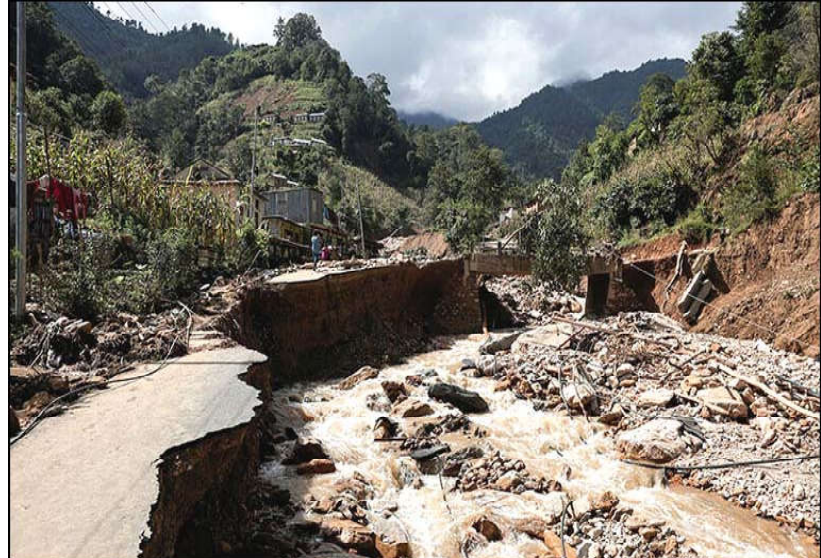
A view of a damaged road resulting in the disruption of all means of transportation after the deadly flood following heavy rainfall, along the bank of Kalati River, in Bhumidanda village of Panauti municipality, in Kavre, Nepal.

Monitoring Desk MOSCOW: Russian President Vladimir Putin ordered the conscription of 133,000 new servicemen in Russia's autumn draft that starts Oct. 1 and goes until the end of the year, according to a Kremlin decree published on Monday. The decree, published in Russian state-run newspaper Rossiyskaya Gazeta, calls to carry out the draft of citizens "aged 18 to 30 years, who are not in the reserve and are subject to conscription in accordance with the Federal Law ... in the amount of 133,000 people."