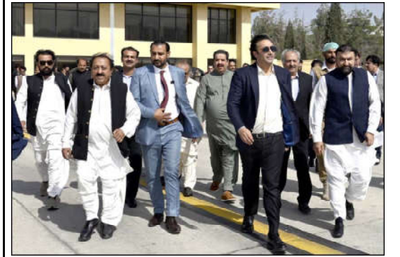
QUETTA: Chief Minister Balochistan Mir Sarfaraz Ahmed Bugti coming to airport to see off PPP Chairman Bilawal Bhutto Zardari to Islamabad.

He said that the Ministry of Overseas Pakistanis was upgrading the technical training centers in Pakistan on modern lines which would train the workforce according to the certification requirement of each country or region. Chaudhry Salik Hussain informed that the Ministry of Overseas Pakistanis was going to start a compulsory pre-departure orientation program for all the workers going abroad which would educate them about the labor laws of the host country.