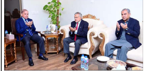
ISLAMABAD: Prime Minister Muhammad Shehbaz Sharif offering condolences to Deputy Prime Minister and Foreign Minister Ishaq Dar on the demise of his elder brother.