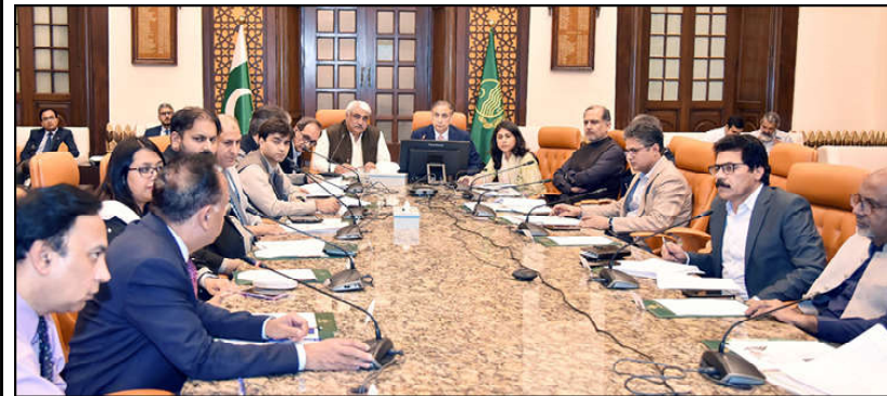
LAHORE: Punjab Minister for Health Khawaja Salman Rafique presides over the high level meeting of cabinet committee for anti-dengue. Punjab Chief Secretary Zahir Akhtar Zaman is also present.

The chief minister appealed to the citizens that never forget your elders, rather give them the respect and status they deserve. Only those societies rise that value their elders. She underscored that government was taking steps for the dignity, welfare and comfort of senior citizens.