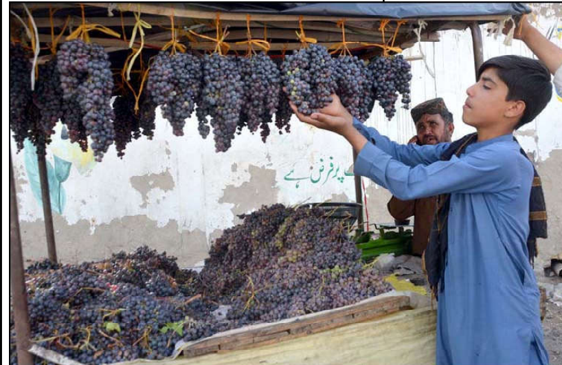
QUETTA: A vendor patiently waits for customers on the roadside in the city, selling antioxidant-rich black grapes known for their health benefits.