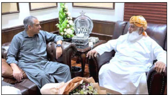
ISLAMABAD: Federal Minister for Interior Mohsin Naqvi meets with JUI-F Chief Maulana Fazal ur Rehman in Federal Capital.