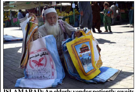
ISLAMABAD: An elderly vendor patiently awaits customers, offering eco-friendly shopping bags at the weekly Bazaar in Federal Capital.