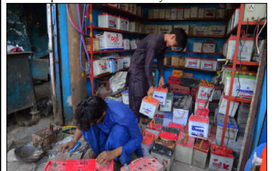
KARACHI: Technician busy in repairing work of batteries to earn his livelihood for support his family, as demand of batteries in city during hot weather of summer season and high tariff of electricity bills, at his workplace located on Garden area in Karachi.