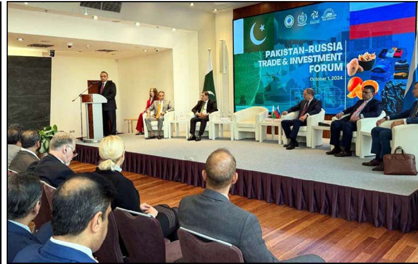
MOSCOW: Federal Minister for Board of Investment, Privatization and Communications, Abdul Aleem Khan addressing Pakistan-Russia Trade and Investment Forum, in Moscow.