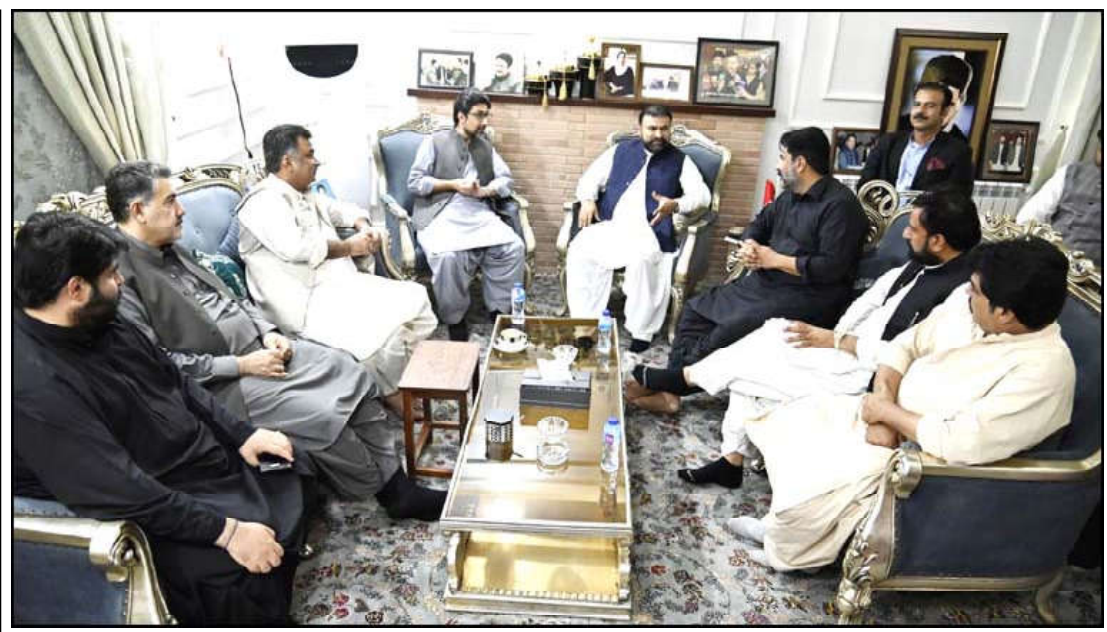
QUETTA: Chief Minister Balochistan Mir Sarfaraz Ahmed Bugti talking with leader of PPP Agha Shakeel Durrani. Former Senator Nawabzada Saifullah Khan Magtgi and other leaders are also present

ISLAMABAD (INP): Federal Board of Revenue (FBR) has extended final date for filing income tax returns for fourteen days, now taxpayers can file their tax returns until Oct 14, 2024. Initially, Federal Board of Revenue strongly rejected all the announcements on social media and said that there is no proposal under consideration for extension in last date for filing for filing income tax returns. But on the 11th hour FBR decided to extend last date for filing income tax returns and enable taxpayers to file tax returns until October 14.