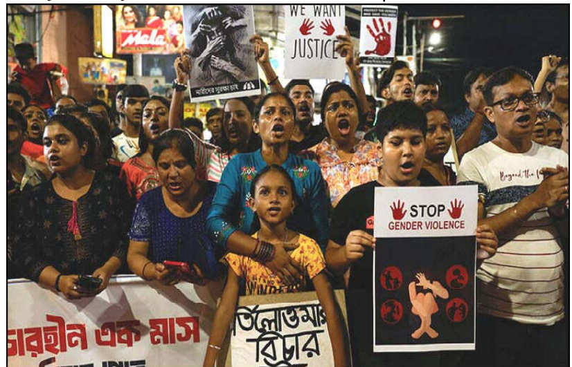
People chant slogans as they participate in a protest condemning and marking one month since the rape and murder of a trainee medic at a government-run hospital in Kolkata, India.