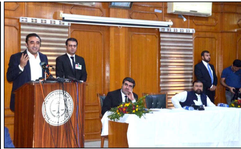
QUETTA: Chairman of Pakistan People's Party (PPP) Bilawal Bhutto Zardari addresses the Balochistan High Court Bar Association, focusing on key legal and political issues in the provincial capital.

Police and law enforcement agencies immediately reached the scene, launched an investigation, and initiated a search operation to apprehend the perpetrators.