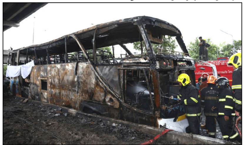
Firefighters work to extinguish a burning bus that was carrying teachers and students from Wat Khao Phraya school, reportedly killing at least 23, on the outskirts of Bangkok, Thailand.