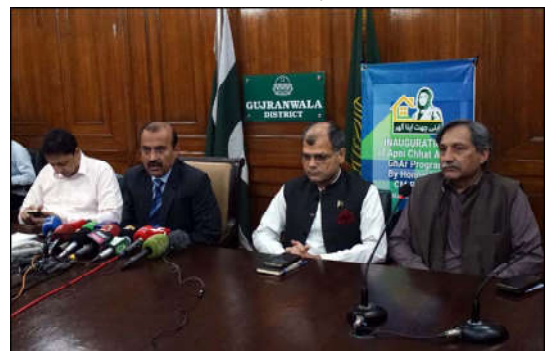
GUJRANWALA: Chief Minister Directorate for Evaluation, Feedback, Inspection and Monitoring (DEFIM) Chairperson, Brigadier (Retd) Babar Ala Uddin addresses to media persons during press conference, in Gujranwala.

Consul General of other countries posted in Karachi and other dignitaries were also present on this occasion and later a cake was cut on the occasion of Malaysia's Independence Day.