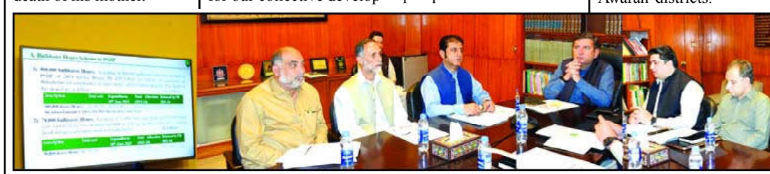
QUETTA: Chief Secretary Balochistan Shakeel Qadir Khan presiding over a meeting

The apex court's hearing is crucial as it addresses critical interpretation of Article 63-A, which relates to disqualification of lawmakers for defection.