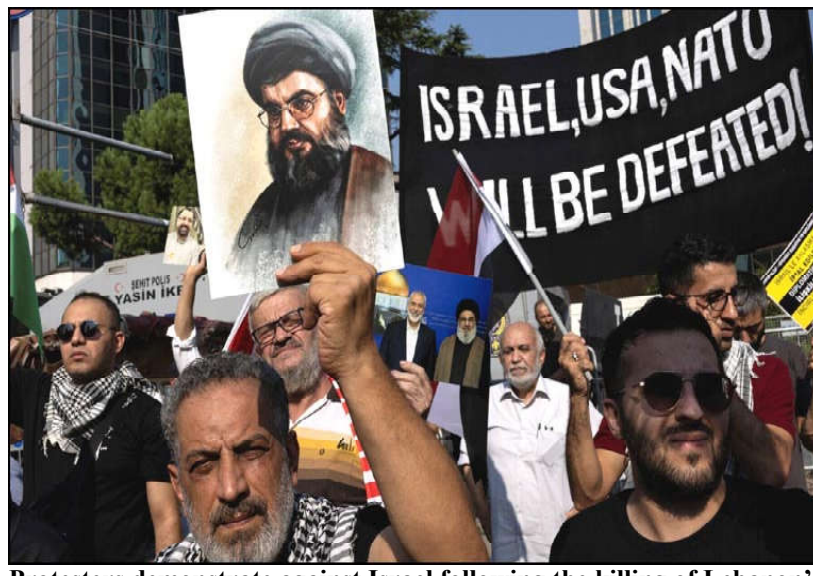
Protesters demonstrate against Israel following the killing of Lebanon's Hezbollah leader Sayyed Hassan Nasrallah in an Israeli air strike in Beirut, near the Israeli Consulate in Istanbul, Turkey.

Monitoring Desk WASHINGTON: US President Joe Biden approved $567 million in defense support for Taiwan, the White House said, the latest move by the United States to boost the island's military in the face of rising tensions with China. The United States is Taiwan's most important international backer and arms supplier even in the absence of formal diplomatic ties. China has repeatedly demanded Washington stop selling weapons to Taipei, which it claims as its territory. In a statement, the White House said Biden had delegated the Secretary of State the authority "to direct the draw-down of up to $567 million in defense articles.