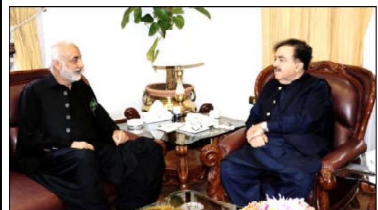
QUETTA: Provincial Minister Sardar Abdul Rehman Khetrani meeting with Governor Balochistan Sheikh Jaffar Khan Mandokhail

The fruits of the reduction of petroleum products are being transferred to the masses. The Prime Minister has been consistently focusing on providing relief to the people since the incumbent government came into power.