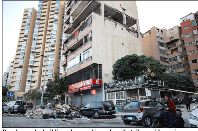
People pass by buildings damaged in an Israeli strike, amid ongoing cross-border hostilities between Hezbollah and Israeli forces, in Kola, central Beirut, Lebanon.

"goes beyond morality" when defence is not proportional to the attack. Israeli military operations in Lebanon seek to downgrade Hezbollah's capacity to attack Israel, eliminate the group's military leadership and "clean" the border areas from fighters, an Israeli security official said Friday. Israeli leaders say they want their citizens displaced from the north to be able to safely return. Israel's military said dozens of its warplanes had attacked targets of Iran-backed Houthi rebels in war-ravaged Yemen Sunday, including around Hodeida port, a key entry point for fuel and humanitarian aid. Houthi media reports said the strikes had killed four people and wounded 33. The Yemen raids came a day after the Huthis said they targeted Israel's Ben Gurion Airport with a missile, trying to hit it as Prime Minister Benjamin Netanyahu returned from New York.