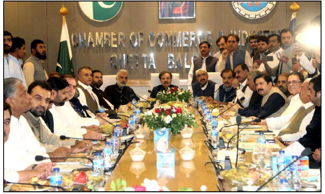
QUETTA: Balochistan Governor, Jaffar Khan Mandokhail addresses to gathering during ceremony on his visit to Quetta Chamber of Commerce and Industry (QCCI) in Quetta.

Regarding the declining trade with Afghanistan, the minister emphasized the need to address the issue in order to improve access to Central Asian markets. The virtual meeting ended with a shared understanding of the urgency to resolve the business community's challenges and to work towards sustainable solutions that would bolster industrial growth and increase Pakistan's trade footprint regionally and globally.