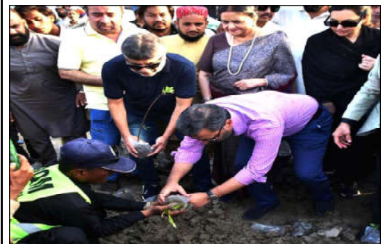
KARACHI: Muttahida Qaumi Movement (MQM-P) Leader, Syed Mustafa Kamal along with others planting a tree during Trees Plantation Campaign organized by Muttahida Qaumi Movement Pakistan, held at Coastal area in Karachi.