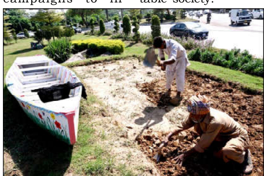
ISLAMABAD: CDA gardeners preparing the land for planting on the green belt at Kashmir Chowk in the Federal Capital.