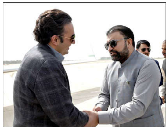
QUETTA: Chief Minister Balochistan Mir Sarfaraz Ahmed Bugti receiving Chairman PPP Bilawal Bhutto Zardari upon arrival at Quetta Airport

Chairman Bilawal Bhutto Zardari reiterated the need to build new homes for flood victims, noting that the construction of homes for victims is already underway in Sindh. He urged by stating, "Our country has limited resources, and we must use them wisely."