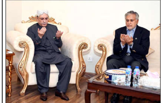
President Asif Ali Zardari offering Fataha over the sad demise of the brother of Deputy Prime Minister and Foreign Minister, Senator Mohammad Ishaq Dar, in Islamabad.

Separately, the deputy prime minister and foreign minister also chaired the 4th meeting of the committee established by the prime minister on addressing key exploration and production sector issues, including circular debt resolution and re-gasified liquefied natural gas price rationalization.