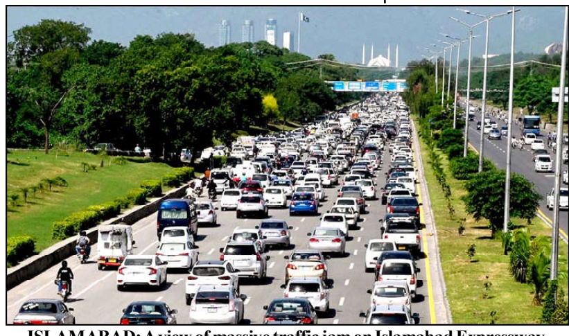
ISLAMABAD: A view of massive traffic jam on Islamabad Expressway.