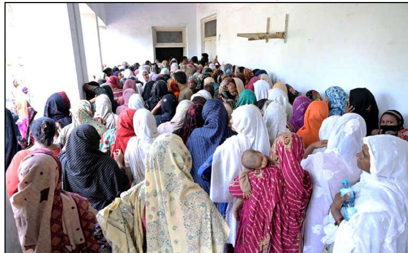
SARGODHA: A large number of women gathered at the Benazir Income Support Program Distribution Center in Company Bagh to collect their payment.