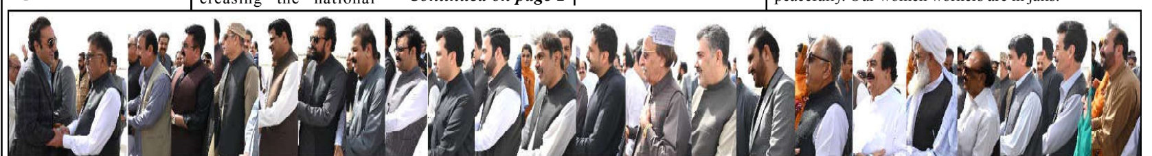
Provincial Ministers, Provincial Advisors, Parliamentary Secretary, MNA, Senator and party workers receiving Chairman PPP Bilawal Bhutto Zardari on arrival in Quetta

Taking a swipe at the government, the ex-PM said they (coalition government) want him 'crushed under the London plan.' He added: "I have been in jail for a long time. My wife has been kept in prison for many months. They want me shattered. We have always protested peacefully. Our women workers are in jails."