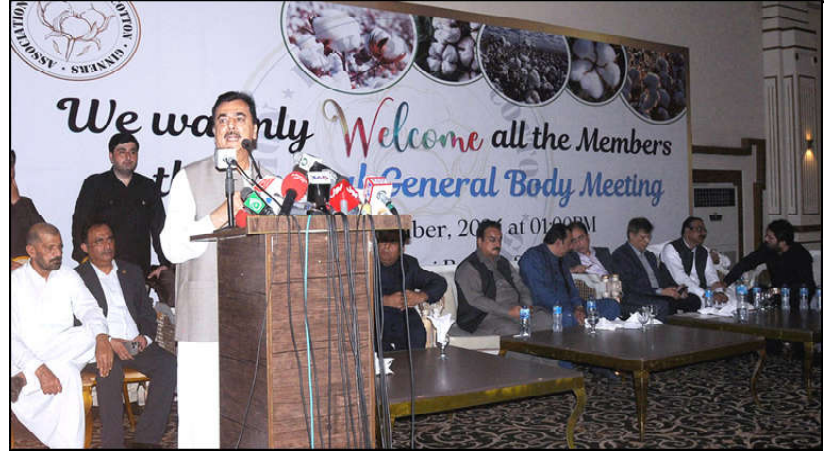
MULTAN: Chairman Senate Syed Yousaf Raza Gillani addressing during the oath-taking ceremony of the Pakistan Cotton Ginners Association.