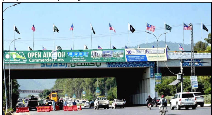
ISLAMABAD: Flags of Pakistan and Malaysia adorn Zero Point Interchange, welcoming Malaysia's Prime Minister Datuk Seri Anwar Ibrahim for his first official visit to Pakistan in the first week of October.