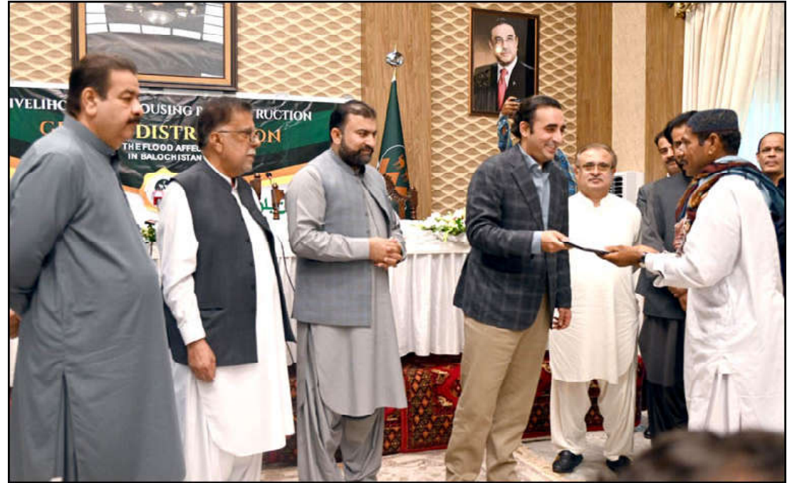
QUETTA: Chairman PPP Bilawal Bhutto Zardari and Chief Minister Balochistan Mir Sarfraz Ahmed Bugti distributing cheques among flood affectees during a ceremony.

The Chief Minister on the occasion welcomed Adeela Baloch on joining national mainstream and thanked her on giving up suicide bombing. Continued on page 2