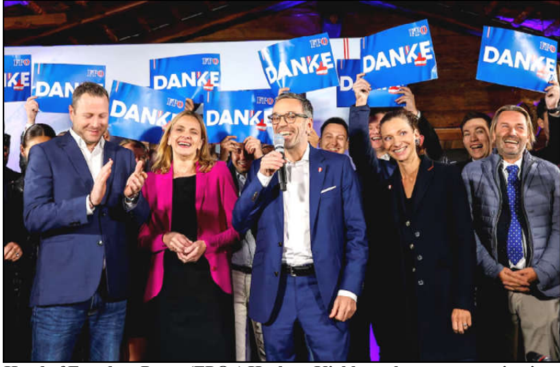
Head of Freedom Party (FPÖ) Herbert Kickl speaks, as vote projections show that FPÖ won the general election, in Vienna, Austria.

cratic Party (LDP), which has governed almost uninterrupted for decades, went down to the wire on Friday, with right-winger Sanae Takaichi tipped to win when markets closed. With Takaichi a fan of former prime minister Shinzo Abe's unorthodox "Abenomics" economic policies of ultra-low interest rates and tax cuts, the prospect of her winning sent stocks higher and the yen lower. Takaichi, an arch-nationalist, would also have been the first woman prime minister in a country where men still dominate politics.