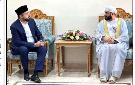
OMAN: Federal Minister for Religious affairs and inter-faith Harmony Chaudhary Salik Hussain meeting with Oman's Minister of Auqaf and Religious affairs Mohammad bin Said bin Khalfan Al-Mamari during his three day visit to Oman.

ISLAMABAD (APP): Senate Chairman Syed Yousuf Raza Gilani on Monday strongly condemned Israeli attacks on Palestine, Yemen, and Lebanon, urging the United Nations to take immediate notice of the atrocities committed against civilians and take action to end its aggression. Gilani also called on the Islamic nations to break their silence and speak out against Israeli aggression. The Senate chairman, in a statement, expressed deep sorrow over the brutal violence and the loss of innocent lives. He also conveyed heartfelt condolences to the bereaved families, expressing his grief over the massacre of innocent people in Palestine and Lebanon.