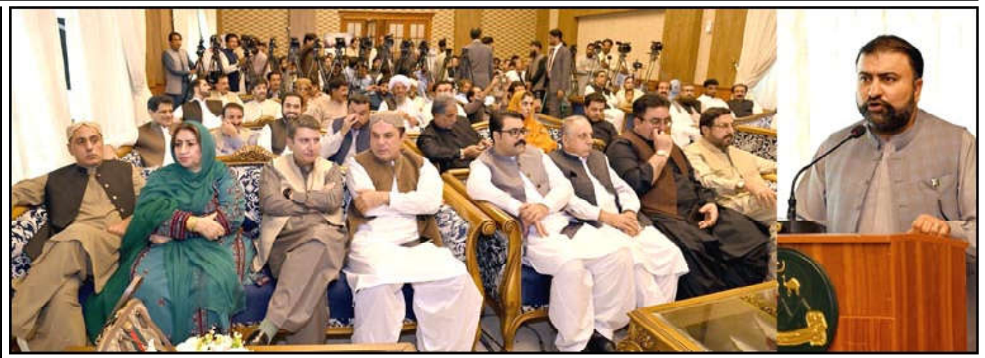
QUETTA: Chief Minister Balochistan Mir Sarfaraz Ahmed Bugti addressing cheque distribution ceremony among flood affectees

vocated the formation of a constitutional court in the country with equal representation of all provinces. He added that the time has come to rectify the judicial shortcomings. He was of the view that not only in Islamabad, constitutional courts should also be established in provinces which is a necessary step to dispatch timely justice on a provincial level. He, however, clarified that consensus on the mechanism for provincial constitutional courts is yet to be developed. Bilawal said that they "only criticised due to political differences" when responding to the opposition's criticism of the proposed constitutional amendments. The PPP chief said Maulana Fazlur Rehman-led Jamiat Ulama-e-Islam-Fazl (JU-I-F) along with political parties part of the ruling alliance have had same stances on constitutional courts.