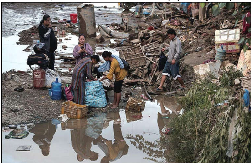
People salvage their belongings along a street as the floodwater recedes in an area that was flooded by the overflowing Bagmati River following heavy rains in Kathmandu, Nepal.

work its way across the centre of Taiwan heading northeast and cross out into the East China Sea, the Central Weather Administration (CWA) said. The typhoon has strengthened into the equivalent of a Category 4 hurricane, packing powerful winds of more than 210 kph (125 mph) near its centre, according to Tropical Storm Risk. "The impact is getting bigger and bigger," said Gene Huang, forecaster at the CWA, pointing to threats to Taiwan's southwest and adding it was "rare" for such a powerful typhoon to make a direct hit to the island's western plains.