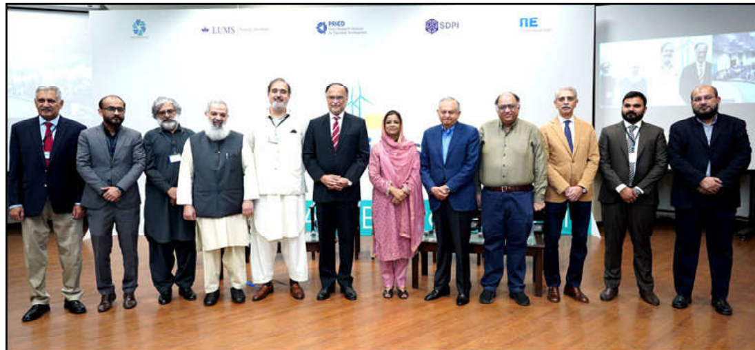
Key figures gather at LUMS for the inaugural Asia Energy Transition Summit 2024, hosted in collaboration with the Pakistan Renewable Energy Coalition (PREC), to discuss pathways towards a sustainable energy future.

In a session on energy policy, Sher Ali Arbab, Convener of the Parliamentary Forum on Energy and Economy, highlighted the opportunities presented by the devolution of power to the provinces under the 18th Amendment and encouraged further decentralization to enhance efficiency and inclusivity in Pakistan's energy policy.