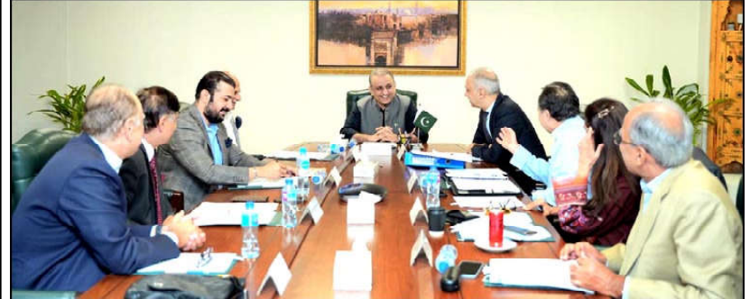
Federal Minister for Privatisation, Board of Investment & Communications, Abdul Aleem Khan presided over meeting of Privatisation Commission Board in Islamabad.