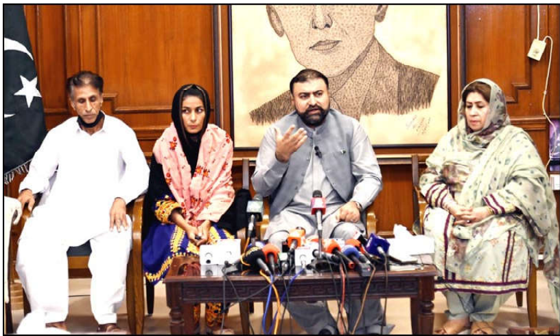
QUETTA: Chief Minister Balochistan Mir Sarfraz Ahmed Bugti along with Adeela Baloch addressing a Press conference. Deputy Speaker Provincial Assembly Ghazala Gola is also present