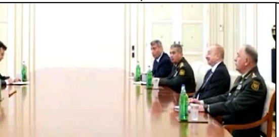
RAWALPINDI: Chairman Joint Chiefs of Staff Committee (CJCSC) General Sahr Shamsah Mirza called on Azerbaijan President Ilham Aliyev.

The 13-member judicial commission will include two members from the treasury benches and two from the opposition. The Prime Minister's Office had re-