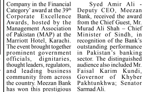
Company in the Financial Category' award at the 39th Corporate Excellence Awards, hosted by the Management Association of Pakistan (MAP) at the Marriott Hotel, Karachi. The event brought together prominent government officials, dignitaries, thought leaders, regulators, and leading business community from across the country. Meezan Bank has won this prestigious

award, for the third consecutive year, highlighting its contributions to the success of Islamic banking in Pakistan.