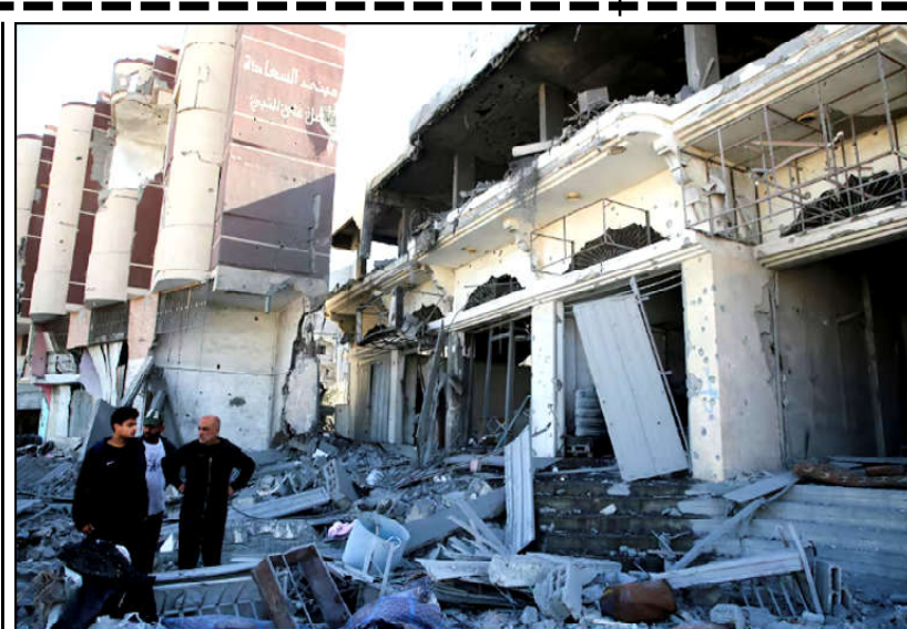
Palestinians inspect the site of an Israeli strike on a house, amid the Israel-Hamas conflict, in Khan Younis in the southern Gaza Strip.