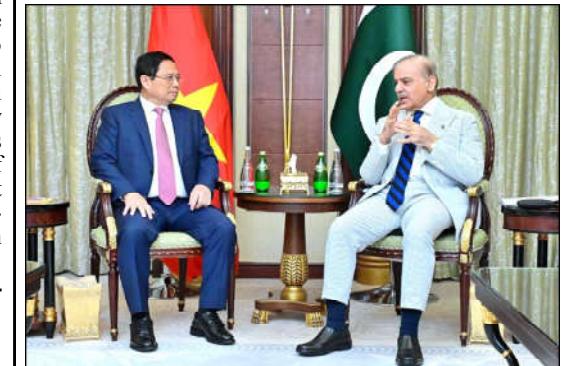
RIYADH: Prime Minister Muhammad Shehbaz Sharif meets Prime Minister Pham Minh Chinh of Vietnam on the sidelines of the 8th Future Investment Initiative (FII) Conference.

approaches because it perceives its global ambitions as incompatible, it obstructs the path to peace," he said in the debate on 'Regional Disarmament and Security'. "Such denial isn't just a regional issue; it destabilizes the entire global order," the Pakistani delegate added. Confidence-building measures could lead to favourable measures for the peaceful settlement of existing disputes, he said, adding they should not become an end in themselves. "They (CBMs) also cannot act as a substitute nor a precondition for steps towards peaceful settlement of disputes," Raza said. "Without progress towards eliminating underlying disputes and causes of mistrust between states, the utility of CBMs diminishes." A stable balance of conventional forces and weapons, he said, was necessary to ensure strategic stability, particularly in regions mired in tensions.