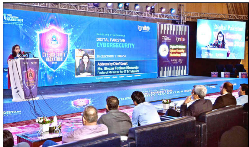
KARACHI: Minister of State for IT and Telecommunication Ms. Shaza Fatima Khawaja addressing as a Chief Guest of the "Inaugural Ceremony of Digital Pakistan Cyber security Hackathon 2024" local Hotel.