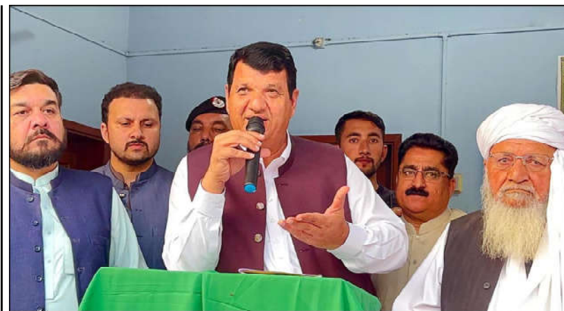
BUNER: Federal Minister for States and Frontier Regions and President PML-N KP, Engr Amir Muqam addressing Jirga Members in Buner.

are all Pakistanis, and Diwali symbolizes peace, harmony, and love." She urged citizens to view smog as a humanitarian issue, not a political one, and expressed her determination to protect minority rights. The CM remarked on the importance of inclusivity, saying, "I felt immense happiness lighting the Diwali lamp. It symbolizes our unity as Pakistanis." She shared her childhood teachings from Nawaz Sharif about treating minorities as a source of pride, stating that all religious celebrations would be honored collectively.