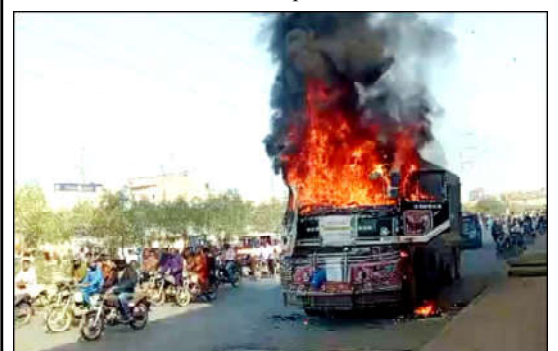
KARACHI: View of burning dumper, which torched by angry mob after an accident killed a motorist, at North Karachi Power House area in Karachi.