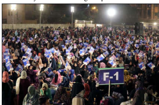
KARACHI: A large number of students gather to attend Aptitude Test Examination ceremony of the IT courses program under "Bano Qabil Mega Project 4.0" organized by Al-Khidmat Foundation, held at North Karachi Hockey Stadium in Karachi.