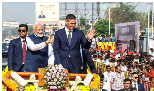
Spanish Prime Minister Pedro Sanchez with his Indian counterpart Narendra Modi waving to crowd in India's Gujarat.

Monitoring Desk UNITED NATIONS: United Nations Secretary-General Antonio Guterres appealed to the Security Council on Monday for its support to help protect civilians in war-torn Sudan, but said conditions are not right for deployment of a UN force. "The people of Sudan are living through a nightmare of violence — with thousands of civilians killed, and countless others facing unspeakable atrocities, including widespread rape and sexual assaults," Guterres told the 15-member council. War erupted in mid-April 2023 from a power struggle between the Sudanese army and the paramilitary Rapid Support Forces ahead of a planned transition to civilian rule, and triggered the world's largest displacement crisis. "Sudan is, once again, rapidly becoming a nightmare of mass ethnic violence," Guterres said, referring to a conflict in Sudan's Darfur region about 20 years ago that led to the International Criminal Court charging former Sudanese leaders with genocide and crimes against humanity.