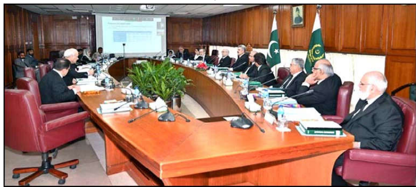
ISLAMABAD: The Hon'ble Chief Justice of Pakistan Justice Yahya Afridi presides over Full Court meeting at Supreme Court of Pakistan.

Chief Justice thanked all the judges for their resolve to implement the case management plan in full, with a commitment to achieve the outlined targets. Progress will be reviewed in the next session of the full court meeting scheduled for 2 December 2024.