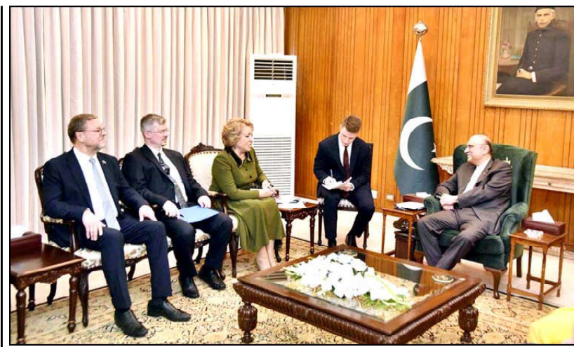
ISLAMABAD: The Russian Parliamentary delegation, led by the Speaker of the Russian Federation Council, Ms. Valentina Matvienko, at Aiwan-e-Sadr.

Serene Air flights ER-502 and ER-504 from Karachi to Islamabad were cancelled while Serene Air flights ER-522 and ER-524 from Karachi to Lahore were also called off.