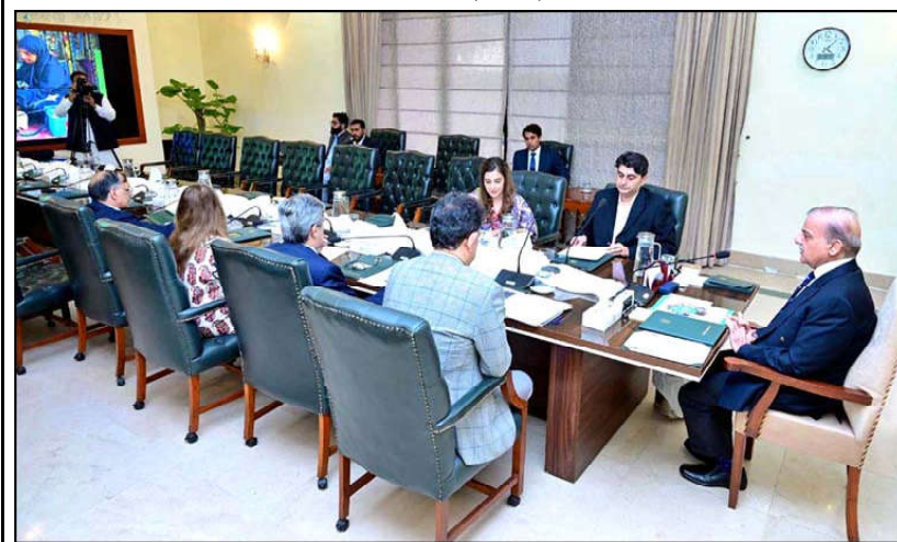
ISLAMABAD: Prime Minister Muhammad Shehbaz Sharif chairs a meeting on Polio Eradication.

The CM said that with 41 polio cases reported in Pakistan this year, 12 of which have been in Sindh, the urgency of this campaign cannot be overstated. He added that the presence of positive environmental samples in Karachi and other areas