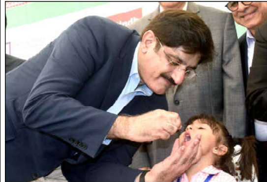
KARACHI: Sindh Chief Minister, Syed Murad Ali Shah administers polio drop to a child during launching ceremony a week long the Polio Eradication Campaign, on his visit to SMB Fatima Jinnah School at Garden East in Karachi.

While talking to the delegation, the president underscored the need to strengthen cultural linkages through people-to-people contacts and scholarship programs.