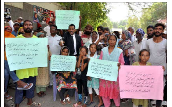
HYDERABAD: Residents of Eesa Nagri are holding protest demonstration against district administration, at Hyderabad press club.