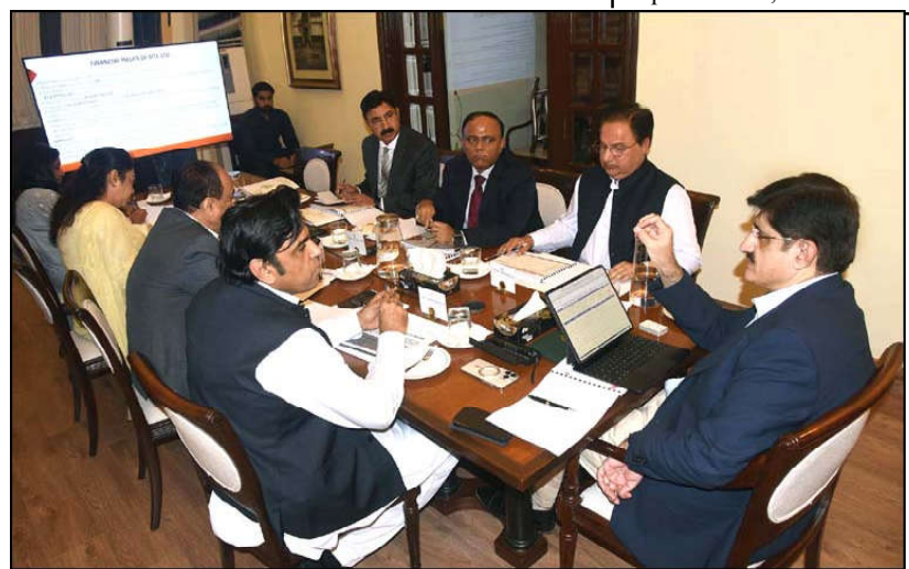
KARACHI: Sindh Chief Minister, Syed Murad Ali Shah presides over a meeting of the Industries Department, at CM House in Karachi.