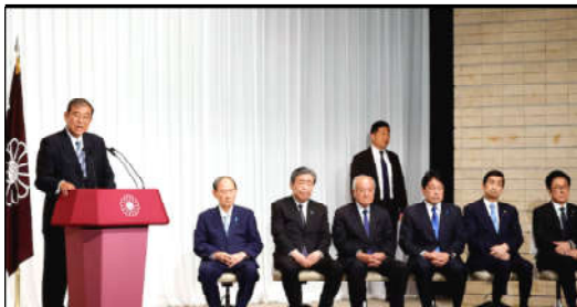
Japanese Prime Minister and leader of the ruling Liberal Democratic Party (LDP) Shigeru Ishiba speaks next to LDP lawmakers during a press conference a day after Japan's lower house election, at the party's headquarters in Tokyo, Japan.