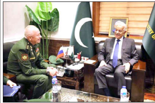
RAWALPINDI: Deputy Defence Minister, Russian Federation, Col. General Aleksandr V. Fomin called on Minister for Defence & Defence Production, Khawaja Muhammad Asif at Ministry of Defence.

He further said that the present government was determined to eradicating polio from the province.