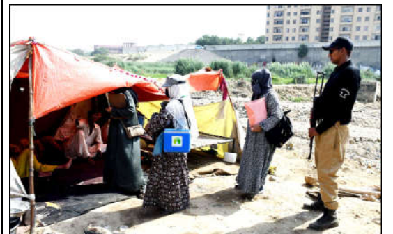
KARACHI: A health worker administers a polio vaccine to a child in Karachi.

ISLAMABAD (APP): Chairmen of the Senate, Syed Yousuf Raza Gilani, and Speaker of the Federal Assembly of the Russian Federation, Ms Valentina Matvienko, on Monday reiterated their commitment to regional security, particularly in combating illicit drug trafficking through joint initiatives. In a meeting with the Russian delegation led by Ms. Matvienko, the Chairman extended a warm welcome as the two nations marked the 76 th anniversary of diplomatic relations. The discussions highlighted the evolution of bilateral ties since 1948, with both leaders emphasizing the importance of ongoing cooperation in defense, economic infrastructure, and energy sectors. He commended Russia's contributions to Pakistan's oil and gas industries and infrastructure development, including significant projects such as the Pakistan Steel Mills and Guddu Thermal Power Station. He acknowledged the recent momentum in bilateral relations, catalyzed by high-level meetings, especially between Prime Minister Shehbaz Sharif and President Putin at the SCO summit, where energy cooperation and trade initiatives were focal points.