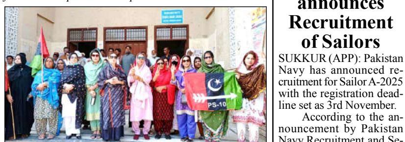
LARKANA: Leaders and activists of Peoples Party (PPP) are holding celebration rally on approval of the 26th constitutional amendment, held in Larkana.