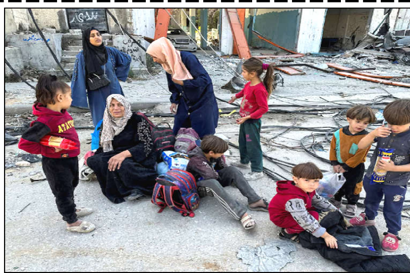
Displaced Palestinians ordered by the Israeli military to evacuate the northern part of Gaza take a rest as they flee amid an Israeli military operation, in Jabalia in the northern Gaza Strip.

Monitoring Desk JERUSALEM: Israel's air strikes "hit hard" Iran's defences and missile production, Prime Minister Benjamin Netanyahu said, but Iranian Supreme Leader Ayatollah Ali Khamenei said the damage from Saturday's attack should not be exaggerated. With warfare raging in Gaza and Lebanon, direct confrontation between Israel and Iran risks spiralling into a regional conflagration. But a day after the air strikes, there was no sign they would spark another round of escalation. However, heavy fighting in Lebanon between Israeli forces and Iran-backed Hezbollah, which sharply intensified over recent weeks, continued on Sunday with an Israeli airstrike killing eight people in a residential block in Sidon, medical aid said. "The air force attacked throughout Iran. We hit hard Iran's defence capabilities and its ability to produce missiles that are aimed at us," Netanyahu said in a speech, calling the attack "precise and powerful" and saying it met all its objectives. The Islamic Republic has not signalled how it will respond to Saturday's long-anticipated strikes, which involved scores of fighter jets bombing targets near the capital Tehran and in the western provinces of