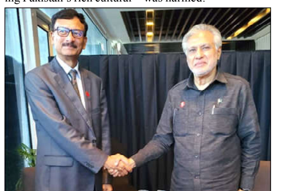
APIA (SAMOA): Deputy Prime Minister Ishaq Dar shaking hand with Adviser for Foreign Affairs of Bangladesh, Md. Touhid Hossain on the sidelines of the Commonwealth Heads of Government meeting.

In Ambassador Donald Blome's October 22-25 visit to Karachi, he reinforced the long-term partnership between the U.S. and Pakistan at the closing ceremony of a $350,000 U.S. Ambassadors Fund for Cultural Preservation (AFCP) grant to restore the historic Frere Hall. At the closing ceremony, the Ambassador noted "It's rare for one project, a partnership between the U.S. Consulate and the Sindh Exploration and Adventure Society, to sum up so much of what the United States and Pakistan work on together. After the 2002 bombing that damaged both U.S. assets and Frere Hall, we felt a responsibility to help restore what was harmed."