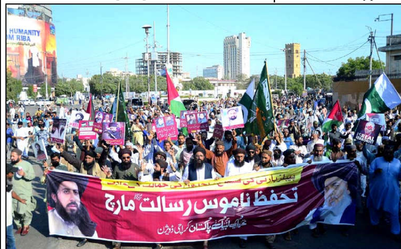
KARACHI: Activists of Tehreek-e-Labbaik (TLP) are holding Tafaaz-e-Namose Raisalat (PBUH) March, near Governor House in Karachi.