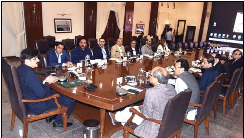
KARACHI: Sindh Chief Minister Syed Murad Ali Shah presides over a joint meeting of the Labour & Finance departments at CM House.

Sindh government since 2016-2017, despite consistently collecting the Workers Welfare Fund (WWF) and Workers Participation Fund (WPPF) from industrial establishments throughout Pakistan, including Sindh. It was pointed out that, following the passage of the 18th Constitutional Amendment, the power to collect the SWWF and SWPPF from industrial establishments - both intra-provincial and trans-provincial - rests exclusively with the provinces. The CM was informed that the WWF and WPPF collected from trans-provincial industrial establishments amount to Rs. 25.36 billion, which is currently under review by the Sindh High Court and being deposited in the court.