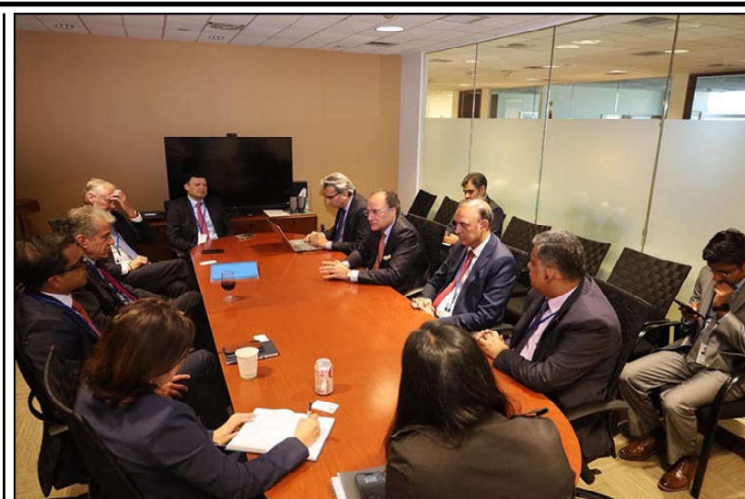
WASHINGTON DC: Federal Minister for Finance and Revenue Senator Muhammad Aurangzeb, accompanied by Governor SBP, held a meeting with the lead team of JP Morgan Bank.

The exchange rate of the Emirates Dirham and the Saudi Riyal decreased by 05 paise and 07 paise to close at Rs 75.59 and Rs73.91 respectively.