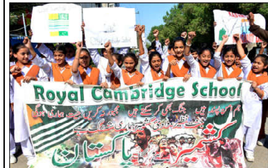
HYDERABAD Students are participating in a rally to show solidarity with Kashmiri people on 27 October marks as Black Day to condemn the Indian atrocities against Kashmiris and illegal occupation at Latifabad.