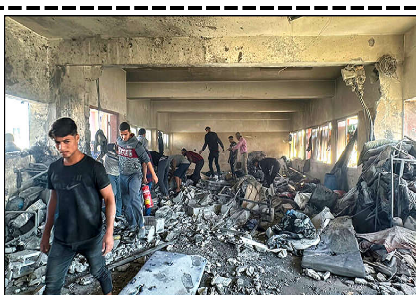
Palestinians inspect the site of an Israeli strike on a school sheltering displaced people, in Nuseirat in the central Gaza Strip.