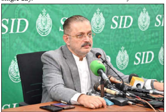
KARACHI: Sindh Senior Minister Sharjeel Inam Memon addressing a press conference at the Directorate of Social and Electronic Media in Karachi.

The Pakistan People's Party government in Sindh has delivered exemplary services across all sectors. Addressing a press conference at the Directorate of Social and Electronic Media in Karachi, Sindh Senior Minister and Provincial Minister for Information, Transport, Excise, Taxation, and Narcotics Control, Sharjeel Inam Memon, announced that a 2,320 MW solar project has been completed at Dow Medical Campus. Karachi Central Jail has also been fully solarized.