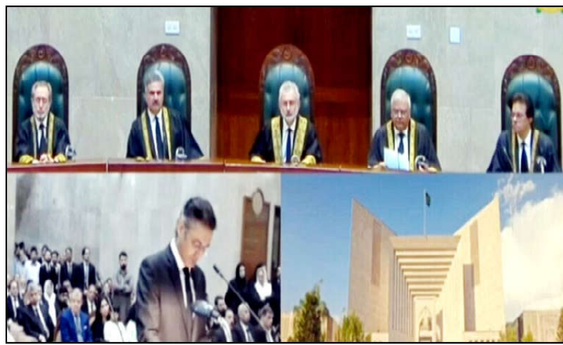
ISLAMABAD: Attorney General Mansoor Usman speaking before a full court reference held at Supreme Court in honour of outgoing Chief Justice of Pakistan Justice Qazi Faez Isa.

Speaking at the full court reference, Chief Justice Qazi Faez Isa thanked Allah Almighty for considering him worthy of the high position and said that he learned a lot during his tenure. He said that the role of lawyers is important in ensuring the delivery of justice. Qazi Faez Isa said that he is grateful to former Chief Justice Itikhar Muhammad Chaudhry for his selection as the Chief Justice of Balochistan High Court. The Chief Justice thanked all the participants of the full court reference for their presence. The Chief Justice designate Yahya Afridi, in his address on the occasion, reiterated his determination to ensure the rule of law and said that cooperation between the bar and the bench is indispensable for the delivery of justice.