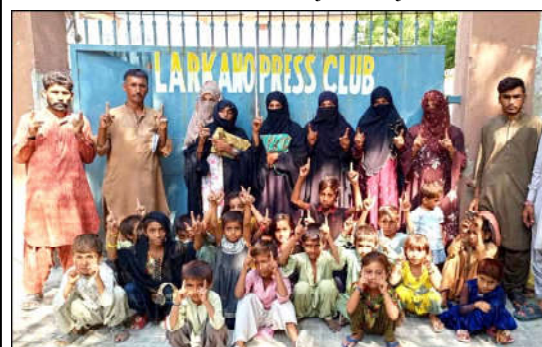
LARKANA: Residents of Ghulab Bhattu village are holding protest demonstration against the high handedness of police, at Larkana press club.

SUKKUR (APP): Divisional Commissioner Sukkur, Fayyaz Hussain Abbasi on Friday presided over a high level meeting to review the progress of the M-6 Motorway (Sukkur-Hyderabad) and Ghotki-Kandhkot Bridge projects. The meeting aimed to expedite the completion of these vital projects, crucial for Sindh's development. Abbasi emphasized that the M-6 Motorway and Ghotki-Kandhkot Bridge are essential for Sindh's progress, stated that we are committed to completing these projects efficiently, ensuring timely completion and maximizing economic benefits to the people adding that the 306-kilometer M-6 Motorway will connect Sukkur to Hyderabad, significantly enhancing Sindh's transportation infrastructure. The Commissioner directed officials to resolve land acquisition issues in certain talukas of Khairpur in collaboration with the Survey Department. He also instructed survey department officials to present records regarding land acquisition in the next meeting. Abbasi warned that no compromises would be made on the quality of work for the Ghotki-Kandhkot Bridge, promising strict action against those responsible for delays. The bridge will resolve long-standing connectivity issues between the two districts, facilitating travel. Among others Additional Commissioner-I, Muhammad Aamir Ansari, Additional Commissioner-II Muhammad Hajan Ujjan, Project Director Sukkur Motorway Ikhlaq Nabi Dayo, Deputy Commissioner Sukkur Dr. M.B. Raja Dharejo.