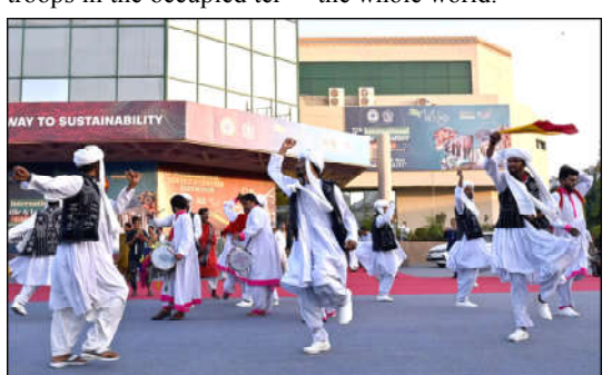
KARACHI: Artists perform traditional folk dances on the closing day of the 5th International Textile and Leather Exhibition, TEXPO 2024, at the Expo Center.