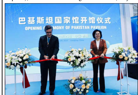
Ambassador of Pakistan to China H.E. Mr. Khalil Hashmi inaugurated Pakistan Pavilion at 31st China Yangling Agricultural Hi-Tech Fair.

The sector also played a significant role in employment, supporting 631,000 jobs in 2023, equivalent to one in five jobs in Dubai. With projected growth, an additional 185,000 jobs will be created by 2030, bringing the total to 816,000 jobs.