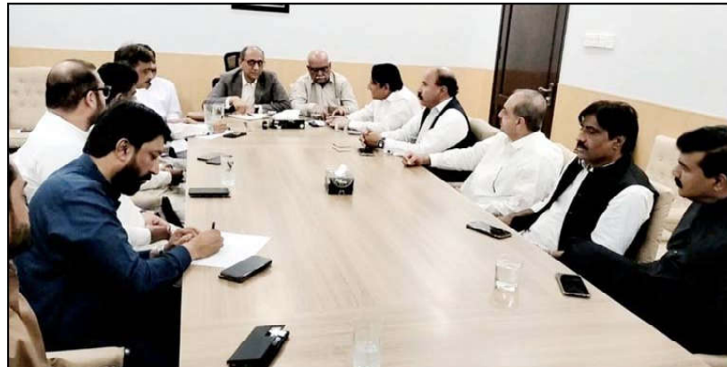
KARACHI: Sindh Local Government Minister, Saeed Ghani chaired meeting of the PPP Karachi Division.