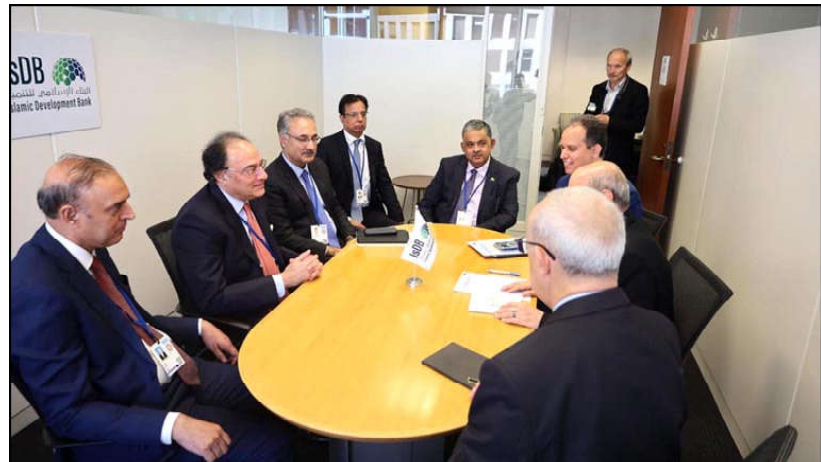
WASHINGTON DC: Federal Minister for Finance and Revenue Senator Muhammad Aurangzeb held a meeting with President Islamic Development Bank (IsDB) on the sidelines of WB/IMF annual meetings 2024.