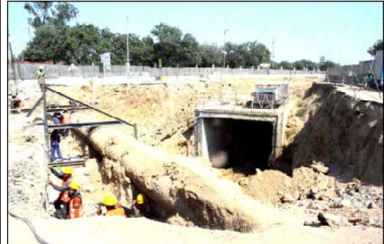
KARACHI: A view of ongoing construction work at the Numaiish Chowranghi underpass in the provincial capital, aiming to improve city infrastructure.