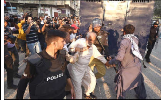
KARACHI: Police arrest the activists of Baloch Yakjehti Committee during a protest rally outside the Karachi Press Club.

The event was held at the Karachi Medical and Dental College auditorium in North Nazimabad.