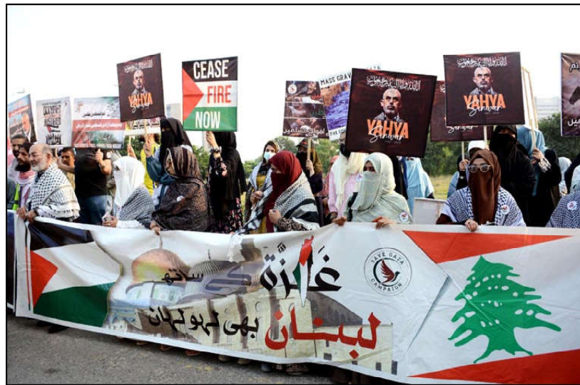
ISLAMABAD: Activists of Save Gaza hold placard during the protest in support of the oppressed and resistance in Gaza outside the National Press Club.

F and PTI, and the committee reached a consensus. The Law Minister then briefed the committee on each clause. Dar also acknowledged PTI's active participation in the committee, noting that they showed unanimity on the draft. However, despite reaching a consensus in the parliamentary committee, PTI did not support the amendment during the vote. Dar remarked that this was their democratic and constitutional right. He praised Maulana Fazl-ur-Rehman for his wisdom and commended his efforts in helping to build consensus on the amendment.