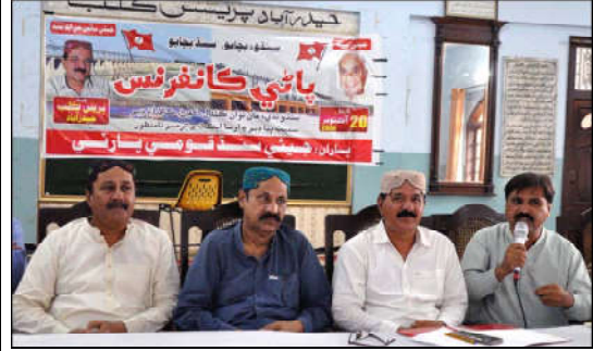
HYDERABAD: Leaders of Jeay Sindh Qaumi Party addressing during Party Conference held at Hyderabad press club.

people will be significantly improved as a result of these reforms. Reflecting on the legacy of the late Benazir Bhutto, Gilani said she was deeply committed to improving the judicial system. "Today, with the passing of the 26 th Amendment, another dream of Shaheed Bibi has come true," he added. He credited Bilawal Bhutto Zardari and the coalition partners for this historic achievement, acknowledging the PPP's sacrifices in promoting democracy in the country. Gilani reaffirmed that the PPP remains the largest and most dedicated party serving the people of Pakistan. He also expressed his gratitude to all coalition partners for their support in passing this critical constitutional amendment.