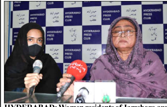
HYDERABAD: Women residents of Jamshoro are holding press conference for acceptance of their demands, held at Hyderabad press club.