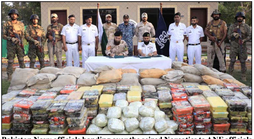
Pakistan Navy officials handing over the seized Narcotics to ANF officials at Gwadar.

The current clause states that "eliminate Riba as early as possible," and the government replaced this with "as far as practicable, by the 1 st of January, 2028."