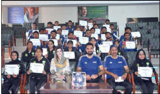
SIALKOT: A group photo of participants of the first ever Referee Refresh and Talent Hunt Course in Sialkot Organizers by FIFA and District Football Association.