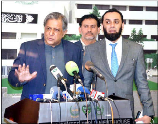
ISLAMABAD: Federal Minister for Law and Justice Senator Azam Nazeer Tarar and Federal Minister for Information and Broadcasting Attaullah Tarar holding a joint Media talk.

"The violation of party discipline will result in a bye-election," he stated.