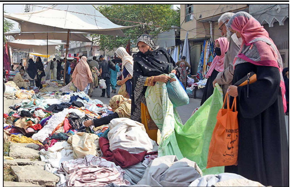
RAWALPINDI: People selecting and purchasing second hand warm clothes on the beginning of winter season at Landa Bazar in Sunday weekly Bazaar Committee chowk area, in the city.

He said S. Jaishankar extended a symbolic hand of cooperation to Pakistan, signaling a potential thaw in the long-strained bilateral ties between the two nuclear-armed neighbors. Relations between both countries have been tense for decades, marked by territorial disputes, particularly over Kashmir, and intermittent armed conflict. However, the Indian participation in SCO provides an opportunity for constructive dialogue. His interaction with Prime Minister Shehbaz Sharif and others is good omen.