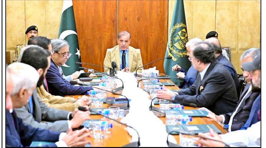
ISLAMABAD: Prime Minister Muhammad Shehbaz Sharif chairs a meeting of the Federal Cabinet.

Now, he said that the JC, responsible for the appointment and confirmation of judges would consist of the Chief Justice of Pakistan (CJP), three senior Supreme Court judges, four parliamentarians, the Law Minister, an advocate having at least 15 years experience, and the Attorney General. Out of four parliamentarians, two members each from Senate and National Assembly, he added.