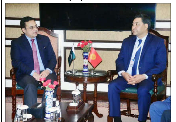
ISLAMABAD: Federal Minister for Economic Affairs, Ahad Cheema in meeting with Kyrgyz Finance Minister Daniyar Amangeldiev.

The event concluded with an interactive questions and answers session, allowing attendees to share experiences and propose solutions to strengthen the local business ecosystem.