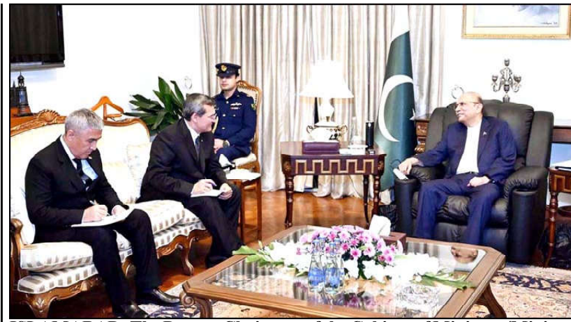
ISLAMABAD: The Deputy Chairman of the Cabinet of Ministers/Minister of Foreign Affairs of Turkmenistan, Rashid Meredov, calls on President Asif Ali Zardari, at Aiwan-e-Sadr.

people. He also conveyed the special greetings of President of Turkmenistan, Serdar Berdimuhamedov, and National Leader of the Turkmen People and Chairman of the People's Council of Turkmenistan, Gurbanguly Berdimuhamedov, to President Asif Ali Zardari. The President thanked the Deputy Chairman of the Cabinet of Ministers/Minister of Foreign Affairs Rashid Meredov for his participation in the 23rd meeting of the Council of Heads of Governments of the member states of the Shanghai Cooperation Organization being held in Islamabad. The president also thanked the Turkmenistan government for its warm hospitality extended to him during his visit to Ashgabat.