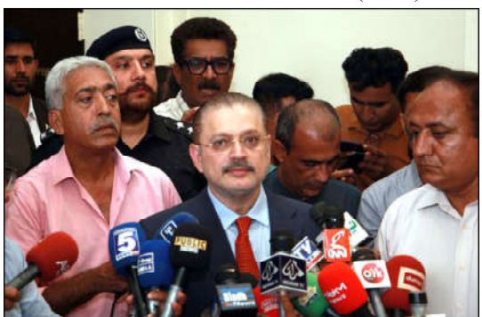
KARACHI: Sindh Minister for Transport, Sharjeel Inam Memon talking to media persons during the launching ceremony of E-Turbo new electric bikes (e-bike), at local hotel in Karachi.

He pointed out that the burden of debt posed a serious challenge to achieving Sustainable Development Goals (SDGs).