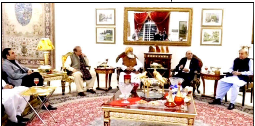
PPP Chairman Bilawal Bhutto-Zardari, PML-N President Nawaz Sharif, Jamiat Ulema-i-Islam-Fazl chief Maulana Fazlur Rehman, President Asif Ali Zardari and Prime Minister Shehbaz Sharif attend a meeting in Lahore.

Our beneficiaries under this program are being