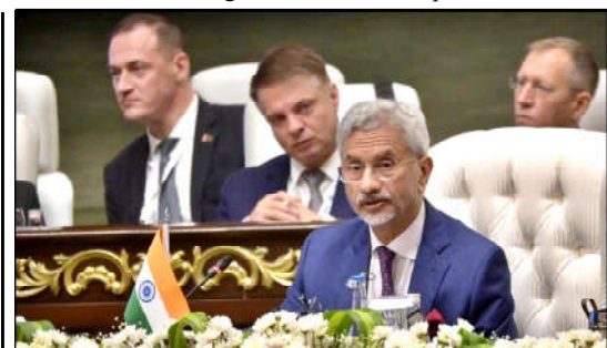
ISLAMABAD: Foreign Minister India, Subrahmanyam Jaishankar addresses the 23rd SCO Council of Heads of Governments Meeting.

ISLAMABAD (INP): Prime Minister (PM) Shehbaz Sharif invited lawmakers of all coalition parties for a lunch on Thursday ahead of the National Assembly in which the 26th constitutional amendment is likely to be presented. According to sources, the meeting will take place at Parliament House at 2 pm.