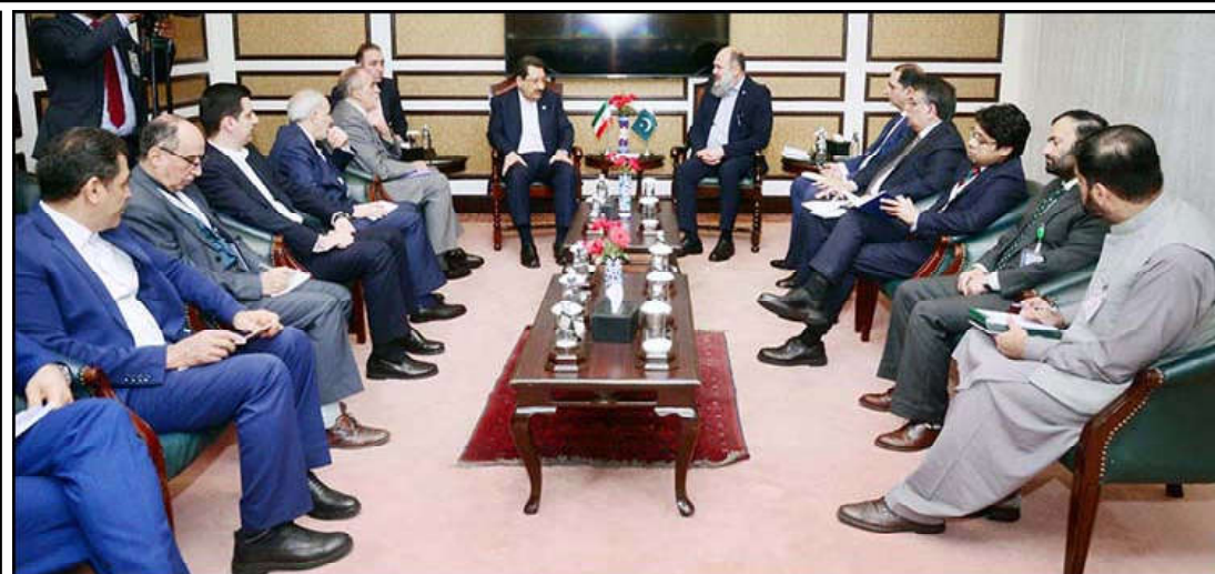
ISLAMABAD: Federal Minister for Commerce, Jam Kamal Khan meeting with Iran's Minister for Industry, Mining, and Trade, Mohammad Atabak, during the SCO 2024 summit. The discussion focused on enhancing bilateral trade, industrial cooperation, and regional economic ties.

companies transacted their shares in the stock market, 227 of them recorded gains and 150 sustained losses, whereas the share price of 68 companies remained unchanged. The three top trading companies were The Searle Company with 26,011,365 shares at Rs 63.32 per share, Hub Power Company with 24,345,667 shares at Rs 101.73 per share and Hum Network with 22,574,161 shares at Rs 14.24 per share. Unilever Pakistan Foods Limited witnessed a maximum increase of Rs 156.55 per share price.