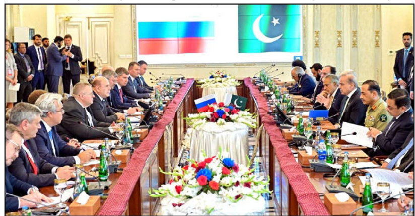
Russian Prime Minister H.E. Mikhail Mishustin along with a delegation meets Prime Minister Muhammad Shehbaz Sharif in Islamabad.

The students from SAU had the opportunity to meet foreign professors and delegates, which fostered academic and research collaborations in the field of parasitology. The students enthusiastically participated in all sessions and represented their university with great interest. During the technical sessions, important topics including food safety and the impact of parasite interference on the agriculture and livestock sectors.