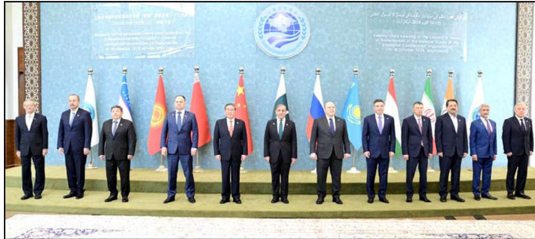
ISLAMABAD: A group photograph of Prime Minister of Pakistan Muhammad Shehbaz Sharif and Heads of delegations of the 23rd SCO Heads of Government Meeting.

Let us work together for a well-integrated and prosperous region that benefits all Member states," the prime minister said in his National Statement at the 23rd meeting of the Council of the Heads of Government (CHG) of the member states of the Shanghai Cooperation Organization (SCO) here. The prime minister, who earlier received the participating leaders at the venue before a group photo, said that the SCO collaboration, spanned academic and tourism linkages, poverty alleviation, and the empowerment of women and youth across the SCO region—a reflection, of our determination, to promote prosperity through unity.