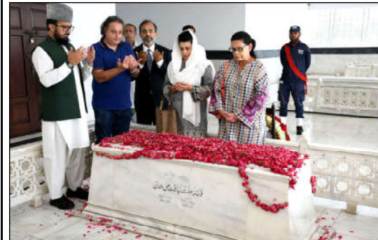
KARACHI: Relatives offering Fathia, on the occasion of the death anniversary of the first Prime Minister of the country Liaquat Ali Khan.