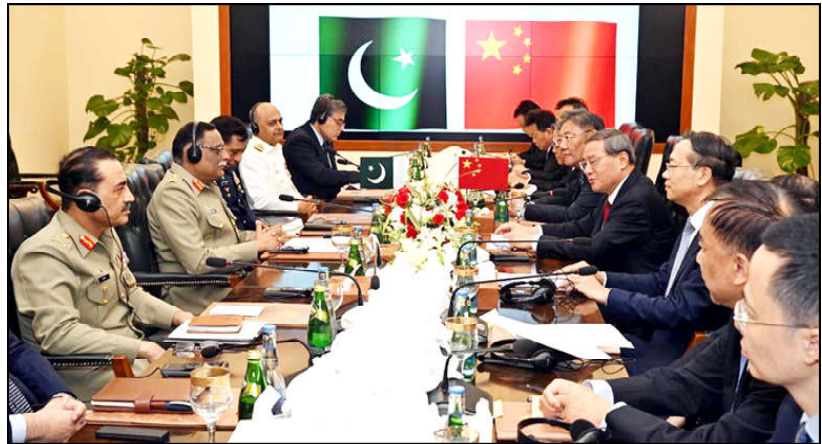
ISLAMABAD: Chinese Premier Li Qiang holding a significant meeting with Chairman of the Joint Chiefs of Staff Committee and the Service Chiefs.

He reiterated that the PPP's approach is based on reconciliation but underscored the need for accountability. He announced a public gathering in Hyderabad on October 18, inviting citizens to join the demand for judicial reforms.