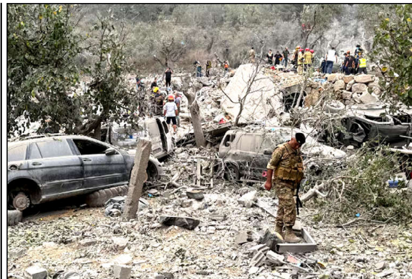
Lebanese army soldier inspects a site damaged by an Israeli air strike in the Christian-majority region of Aitou in north Lebanon.

Monitoring Desk MUNICH: The World Health Organisation (WHO) said on Monday it had approved Bavarian Nordic's mpox vaccine for adolescents aged 12 to 17 years, an age group considered especially vulnerable to outbreaks of the disease that has triggered global concern. The WHO said in a statement that it gave the Jynneos vaccine prequalification for adolescents on Oct 8. The WHO declared mpox a global public health emergency for the second time in two years in August after a new type of the virus spread from the Democratic Republic of Congo to its neighbours.