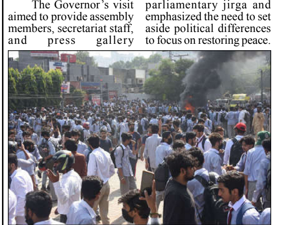
LAHORE: Angry students protest by burning tyres and furniture at a local college, after the alleged rape of a female student by security card at Gulberg in the Provincial Capital.

representatives with the convenience of computerized identification cards and passports right at their doorstep. This marked Kundi's first visit to the provincial assembly as Governor, during which he also reviewed the assembly hall and the jirga hall. Talking to media, Kundi expressed gratitude to the Federal Interior Minister for their significant support for the project. He acknowledged the critical role played by Speaker Babar Salim Swati in establishing the parliamentary jirga and emphasized the need to set aside political differences to focus on restoring peace.