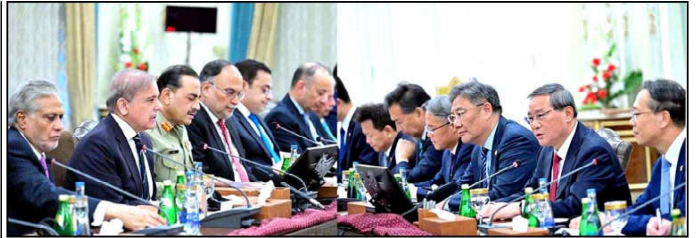
ISLAMABAD: Prime Minister Muhammad Shehbaz Sharif and Chinese Premier, Li Qiang in delegation level talks.

In the meeting, discussions were held regarding the relocation of Chinese industry to Pakistan and strategies to increase Chinese investment in Pakistan.