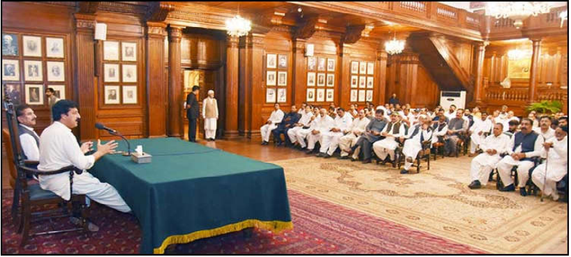
LAHORE: Governor Punjab Sardar Saleem Haider Khan expressing his views while meeting the office bearers, ticket holders and workers belonging to District Sheikhupura here at Governor House Lahore.

Gate, Akbari Hammam, Kharak Singh Haveli with rooftop views, Akbari Mahal, Sheesh Mahal Attic Rooms, Ranjeet Singh's Last Living Room, British Barracks or Jails, Mughal era Water Channels, The Mysterious grave in the basement, Torture cells near the Royal Kitchens, Zanana Masjidi, Naag Temple, Summer Palace and Daulat Khana Khas o Aam have been opened to the public for the first time in this tour.