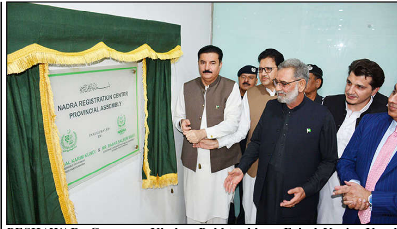
PESHAWAR: Governor Khyber Pakhtunkhwa Faisal Karim Kundi inaugurates NADRA registration Center at Provincial Assembly.

He said that the KP government should write a letter to fulfill this constitutional obligation as soon as possible. He said that the CCI meeting should be held within 90 days as a constitutional requirement and deplored that it could not be held for the last eight months.