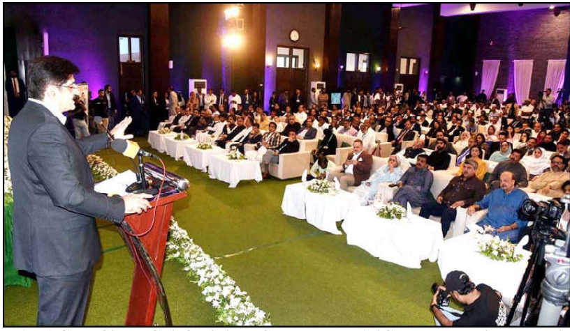
KARACHI: Sindh Chief Minister Syed Murad Ali Shah addressing Benazir Hari Cards distributing ceremony to the farmers at the Chief Minister House.

new and the rest 256 are the old ones which would be upgraded. These 1,300 cameras would be installed at 300 sites in districts South, East, Malir and Korangi. Altaf Shakoor said that it needs that this project needs to be completed as soon as possible to make the megacity safer and more secure. He said the recent terrorist act near the Karachi airport has increased the urgency to complete this project as soon as possible. He said as per the original plan with 12 megapixel cameras in place, the safe city system would help carry out digital forensic and image enhancement of the acquired data, facial recognition, automatic number plate recognition which is called ANPR, which will be integrated with national and criminal databases.