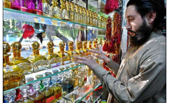
ISLAMABAD: A shopkeeper arranging and displaying perfumes to attract the customers in the city.

ISLAMABAD (Online): Special Investment Facilitation Council is playing a pivotal role in taking the country's economy on the path of development and restoring the confidence of the world. As a result of these efforts, China, Russia and Brazil have recently expressed their desire to invest in various sectors of Pakistan. China desires to shift its various industries to Pakistan while Russia and Brazil are involved in trade agreements with Pakistan.