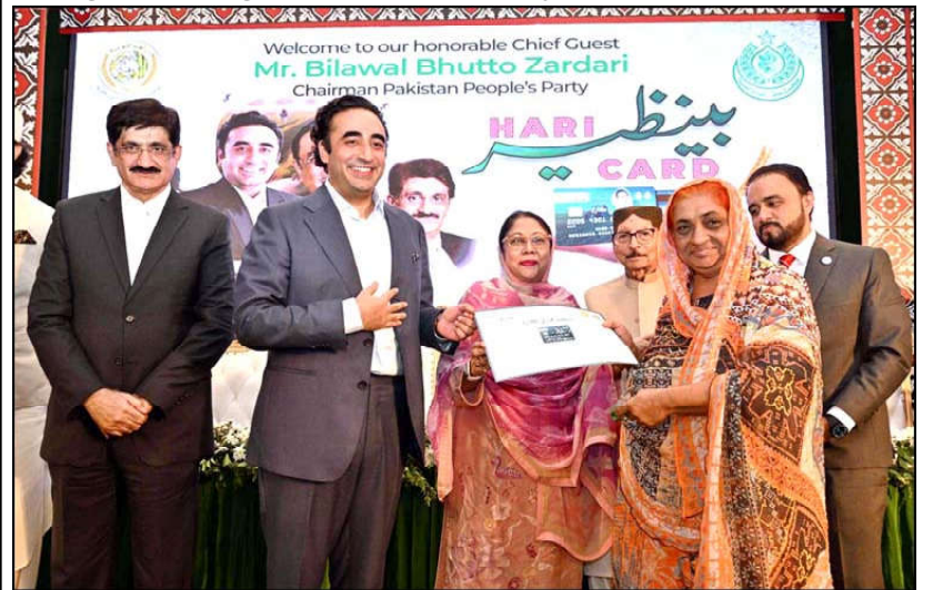
KARACHI: Chairman Pakistan People's Party, Bilawal Bhutto Zardari distributing Benazir Hari Cards to the farmers in a ceremony at the Chief Minister House. PPP Women's Central President Faryal Talpur, Sindh Chief Minister Syed Murad Ali Shah and Sindh Agriculture Minister Sardar Muhammad Baksh Khan Meher is also present.

The two-day meeting of SCO CHG, the second highest forum within the SCO, will be chaired by Prime Minister Shehbaz Sharif as the current chair of the Council.