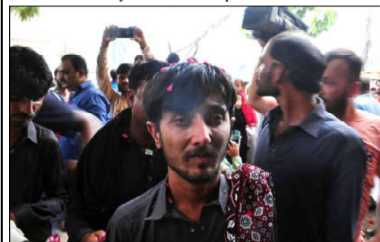
KARACHI: Pakistani fishermen released from Indian jail are hugging their relatives after reaching the Edhi Center in the Provincial Capital.