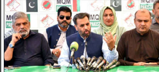
KARACHI: Muttahida Qaumi Movement (MQM) Leader, Mustafa Kamal along with others addressing to media persons during press conference held at Pakistan House in Karachi.