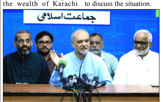
KARACHI: Jamat-e-Islami (JI) Chief, Hafiz Naeem-ur-Rehman along with others addresses to media persons during press conference, at Idara-e-Noor-ul-Haq in Karachi.

He also pointed out the prevalence of white-collar crime, criticizing the "electric mafia" for evading justice with legal loopholes. "These criminals are protected, and even after their misdeeds, they manipulate the legal system to their advantage," he lamented. Rehman further commented on the recent local elections, alleging that MQM Pakistan was awarded 17 seats despite not winning any polling stations, which he claimed was indicative of electoral manipulation. He denounced the ruling party for allegedly tampering with ballot boxes during the ongoing recounting of by-elections. In response to ongoing protests by Tehreek-e-Insaf, Rehman urged the party to postpone their demonstrations, suggesting a meeting with former Prime Minister Imran Khan to discuss the situation.