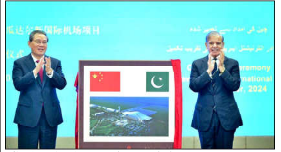
ISLAMABAD: Prime Minister Muhammad Shehbaz Sharif and Chinese Premier, Li Qiang unveiling a plaque to mark the completion of New Gawadar International Airport.

ment worth 2.2 billion dollars in Pakistan. He said that all economic indicators of Pakistan were positive with inflation decreasing to record 6.9 as compared to 32 per cent last year. He said that foreign exchange reserves and IT exports had witnessed a surge and remittances during the first quarter of the current fiscal year had touched $ 8.8 billion mark. International financial institutions like International Monetary Fund and World Bank praised Pakistan's economy and renowned financial journals like Bloomberg had termed Pakistan stock exchange as the most emerging market in the region, he remarked. He said that the Chinese Prime Minister had come to Pakistan after 11 years which was an honour. The minister said China had always extended the hand of friendship to Pakistan, and after the recent visit of the Prime Minister Shehbaz Sharif to China, the second phase of China Pakistan Economic Corridor was launched.