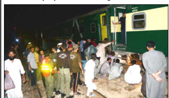
HYDERABAD: Rescue workers busy in work after Lahore bounded train Karachi Express derailed near Hyderabad railway station.