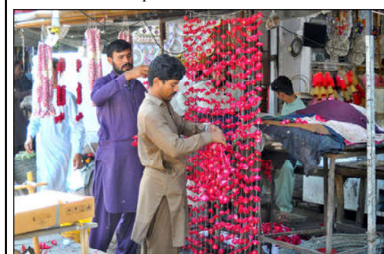
MULTAN: Vendors are busy preparing flower garlands at their roadside setup.