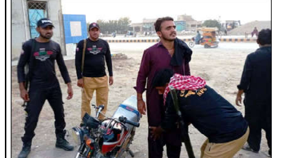
LARKANA: Police officials carry out the combing search operation against criminals as security has been tightened in city to maintain law and order situation, in Larkana.

government sources told APP here on Sunday that special ceremonies will be held in all ten districts of Azad Jammu Kashmir to celebrate the day with simplicity. Speakers will highlight the historic significance of the founding day. Besides, 'Fateha' will be offered for the Kashmiri martyrs, besides offering special prayers for the early success of the Jammu & Kashmir freedom movement. The government's founding day anniversary will be observed with prime focus to elaborate on the due role of this base camp of the Kashmiri freedom movement for raising the Kashmiris indigenous struggle for freedom at an international level.