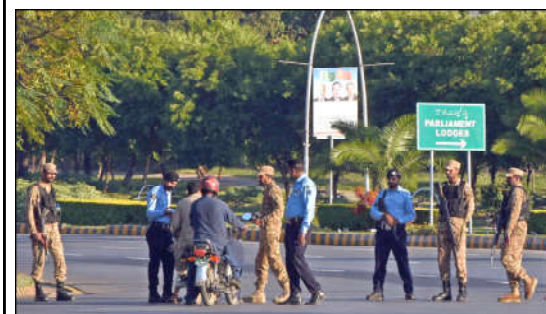
ISLAMABAD: Pak Army soldiers and police personnel checking a motorcyclist in front of Parliament House at Constitution Avenue, during security high alert at "red zone" area ahead of Shanghai Cooperation Organisation (SCO) summit, in the Federal Capital.

taining peace in the city after those announcements, while Section 144 was already announced by the Commissioner Karachi. Therefore, the protestors should have followed the law but the law was violated by them. Sindh Home Minister said that the police detained some people for violating Section 144; the police officers were tortured by the protesters, in which two police officers were injured, while the police van was also set on fire, and the red zone was set on fire, adding that no one is allowed to take the law into their own hands.