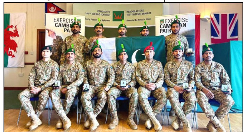
WALES: Pakistan Army Team participate in Exercise Cambrian Patrol-2024, held in Wales. This year, 128 teams from 42 Countries participated in the Exercise and out of all these teams, Pakistan Army's Team showed Exceptional Performance in the exercise and has been awarded with the Gold Medal.

Mustafa Kamal said that our politics is not above the dignity and integrity of the country. If the country and institutions are there, we are breathing in peace, Mustafa Kamal said. Mustafa Kamal said that Pakistan's enemies do not want to see stability here.