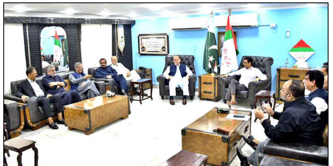
KARACHI: Pakistan Muslim League Nawaz (PML-N) delegation, led by Secretary General Ahsan Iqbal, Advisor to PM Rana Sanaulah, and Federal Minister Azam Nazeer Tarar, meets with MQM-Pakistan leadership, including Chairman Khalid Maqbool Siddiqui, at Pakistan House.

Iqbal said that the former elected prime minister Nawaz Sharif suffered illegal sentence, which was not a sentence pronounced against us but it was also against the people and development of the country including CPEC. He said that there was only darkness and damages during the four years from 2018 to 2022 and it was suffered by the nation and the country including Karachi because no development programme was initiated.