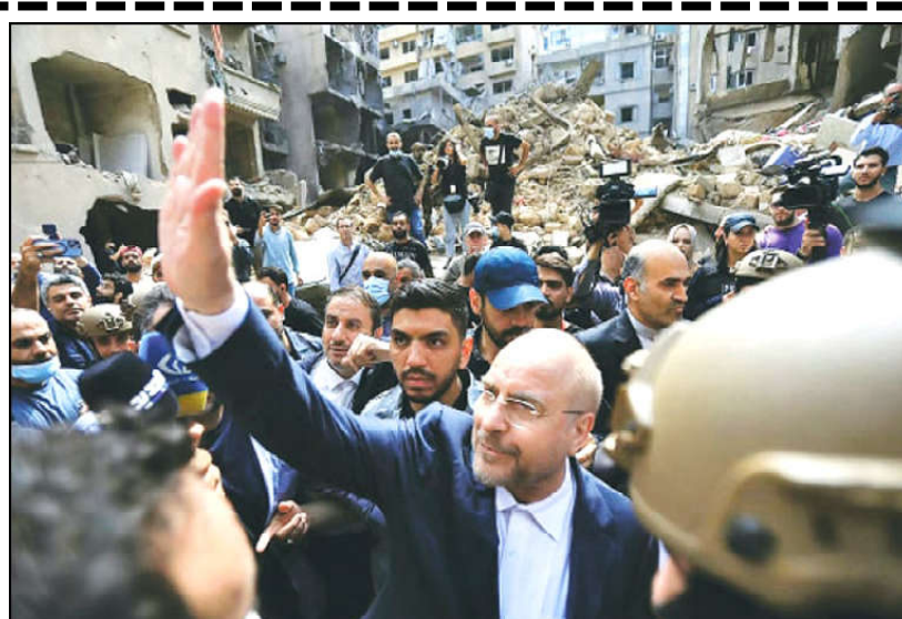
BEIRUT: Iran's Parliament Speaker Mohammad Bagher Ghalibaf waves during his visit to the site of an Israeli air strike in the Basta neighbourhood.

Beirut's southern suburbs, which have previously faced heavy bombardment, have not been struck in the past 48 hours. Hezbollah functions as a state within a state there.