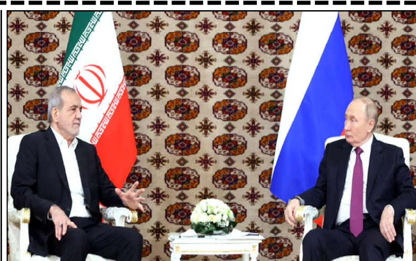
Russian President Vladimir Putin meets Iranian counterpart Masoud Pezeshkian on the sidelines of a cultural forum dedicated to the 300th anniversary of the birth of the Turkmen poet and philosopher Magtymguly Fragi, in Ashgabat, Turkmenistan.

resulted in a new toll of 22 people killed and 117 injured," the ministry said in an updated toll statement. A Lebanese security source, requesting anonymity to discuss sensitive matters, told AFP that Israel had attempted to kill a Hezbollah official who often frequented the locations targeted. Israeli forces fired on positions used by UN peacekeepers in Lebanon on Wednesday and Thursday, the UN force said, as Israel warned Lebanese civilians not to return to homes in the south and pursued a widening offensive against Hezbollah. The UNIFIL force said two of its peacekeepers were injured in one of the incidents when an Israeli tank fired at a watchtower at the force's main headquarters in Ras al-Naqoura, hitting the tower and causing them to fall.