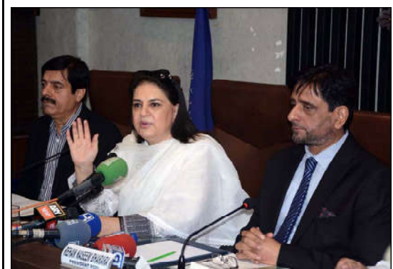
FAISALABAD: Senator Rubina Khalid, Chairperson of the Benazir Income Support Programme (BISP) is addressing members of Faisalabad Chamber of Commerce & Industry (FCCI).

Among others, the meeting was attended, Minister for Industries and Production, Rana Tanveer Hussain; Minister for Power, Sardar Awaiz Ahmed Khan Leghari; Minister for Economic Affairs, Ahad Khan Cheema; Minister of State for Finance and Revenue, Ali Pervaiz Malik, Governor State Bank of Pakistan (SBP), Chairman Securities and Exchange Commission of Pakistan (SECP) along with federal Secretaries and senior officers from the concerned ministries and divisions.