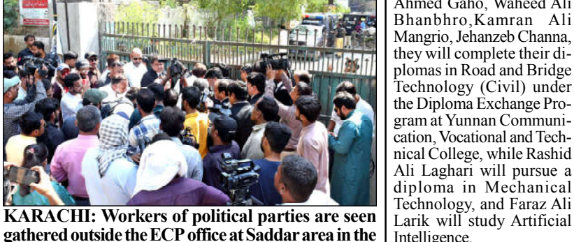
KARACHI: Workers of political parties are seen gathered outside the ECP office at Saddar area in the Provincial Capital.