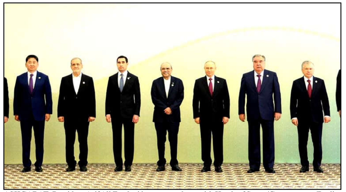
ASHGABAT: President Asif Ali Zardari in a group photo with Heads of States/Governments/Parliaments participating in the International Forum on "Interrelation of Times and Civilizations - Basis of Peace and Development."

nationalism, he added. He lauded the Turkmen government and people for organizing the event to promote understanding of peace and dialogue among different cultures which also provided him an opportunity to interact with leaders of regional countries to help strengthen mutual friendship. President Zardari said that his participation in the Forum reflected his country's commitment to strengthening bilateral ties.