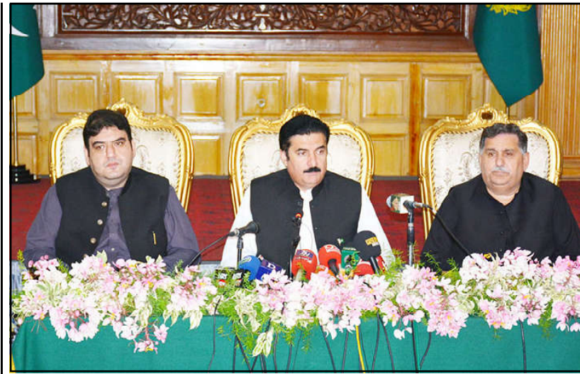
PESHAWAR: Governor Khyber Pakhtunkhwa Faisal Karim Kundi addressing press conference at Governor House.

accepting recommendations during these discussions. Kundi reiterated the significance of dialogue and reconciliation, referencing the ideals of former President Asif Ali Zardari, who has consistently advocated for peaceful negotiations. He also encouraged local leaders to voice their concerns through parliamentary representation, asserting, "We will support their case until they have representation in Parliament." Furthermore, he reflected on the historical hospitality extended to Afghan refugees, urging them to contribute to peace and stability in the region.