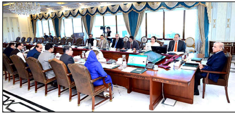
ISLAMABAD: Prime Minister Muhammad Shehbaz Sharif chairs a meeting on matters related to Ministry of Federal Education and Professional Training.

He further highlighted that, in line with the government's commitment to ensuring no child in Pakistan is left out of school, the incumbent administration had implemented an educational emergency. The Prime Minister called for the formulation of a strategy to provide monthly stipends to female students in rural areas of Islamabad, aiming to increase enrollment in these schools. "Technical training should be integrated into the curriculum of Islamabad schools," the Prime Minister said. He added that students who had dropped out of education for any reason should be offered free technical training, and an awareness campaign should be launched to encourage them to return to school. "Teachers are the builders of the nation," he said, highlighting the critical need to establish a high-quality teacher training institution in Islamabad. He also directed a third-party audit of teacher training programs and the assessment of teachers' skills. Special attention, he noted, should be given to ensuring transparency and merit in teacher recruitment.