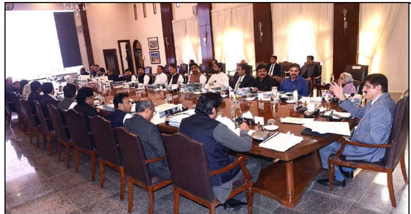
KARACHI: Sindh Chief Minister, Syed Murad Ali Shah presides over a cabinet meeting held at CM House in Karachi.