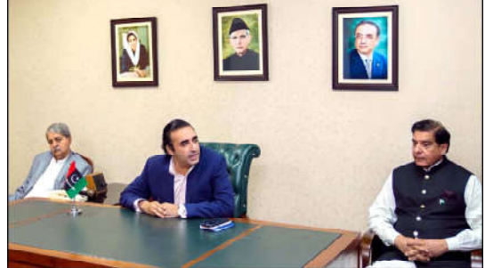
ISLAMABAD: Peoples Party (PPP) Chairman, Bilawal Bhutto Zardari talking to media persons, at Parliament House in Islamabad.

KARACHI (APP): Mayor Karachi Barrister Murtaza Wahab has said that under the City Institute of Health Sciences that has been established in the Karachi Institute of Heart Diseases, the Karachi Metropolitan Corporation is launching a training program for Certified Nursing Assistants and Certified Nursing Aides. This program will offer one-and two-year diplomas, with 100 percent scholarships for participants. In a statement on Friday, he said that the aim of this program is to provide modern training for nursing staff in Karachi's medical institutions, including expertise in accidents, emergency and cardiac nursing. The availability of such skilled nursing staff will enhance the quality of medical services in KMC hospitals and other public and private hospitals in Karachi, ensuring that citizens have access to modern and quality healthcare facilities, he said. He said that in the start of admissions for the one-year and two-year diploma programs for Certified Nursing Assistants and Nursing Aides at the City Institute of Health Sciences, which operates under the KMC.