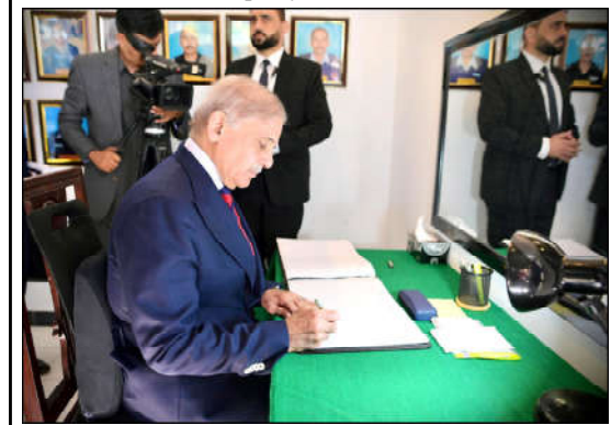
ISLAMABAD: Prime Minister Muhammad Shehbaz Sharif writes his remarks in the visitors' book at the Police Lines Headquarters.

Speaking to the media in his chamber at Parliament House, he said that the government has given time to reach a consensus on constitutional amendments related to judicial reforms.