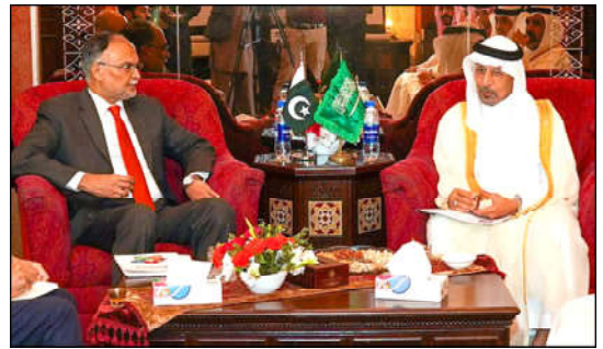
ISLAMABAD: Saudi Investment Minister Khalid Bin Abdulaziz Al Falih meeting with Federal Minister for Planning Ahsan Iqbal.

Federal minister for Interior Mohsin Naqvi has strongly condemned the brutal attack on coal miners in the Duki area of Balochistan, where 20 workers were tragically killed by armed individuals.