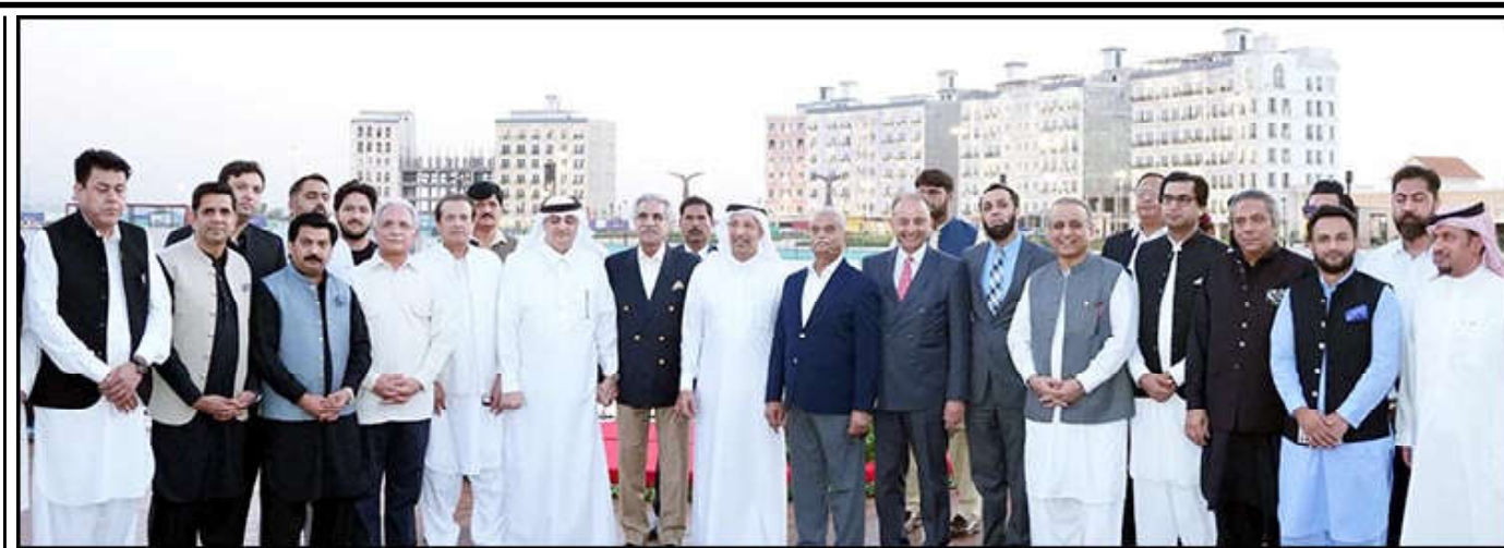
Group photo on reception in honor of KSA Investment Minister, Sh. Khalid Bin Abdul Aziz Al Faleh by Federal Minister for Board of Investment, Privatization & Communications Abdul Aleem Khan in Islamabad.

The central bank received 23 bids for a 7-day tenor cumulatively offering an amount of Rs3,722.7 billion at the rate of return ranging between 17.56 to 17.62 percent while 15 bids amounting to Rs4,901.15 billion were received for the 28-day tenor at the rate of return ranging between 17.56 to 17.63 percent. The central bank accepted all 23 bids for 7-day tenor and 15 quotes for 28-day tenor at a 17.56% rate of return.