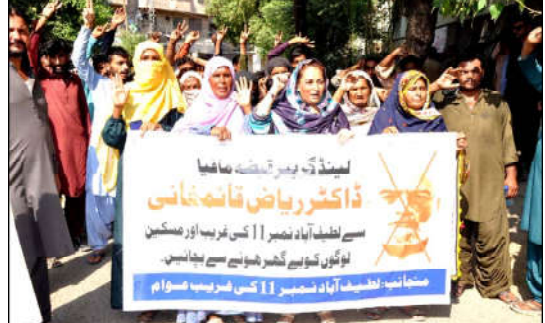
HYDERABAD: Residents of Latifabad No.11 are holding protest demonstration against high handedness of land grabbers, at Hyderabad press club.