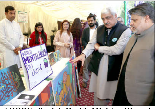
LAHORE: Punjab Health Minister Khawaja Salman Rafique watching the stalls on the eve of World Mental Health Day ceremony at Punjab Institute of Mental Health.

The Assembly Provincial including leadership of all religiouspolitical parties assigned CM KP the responsibility of conducting a peace jirga with concerned for solution of all matters through consultation and peaceful means. The CM KP has accepted the responsibility of conducting a peace jirga and thanked the participants for reposing trust in him.