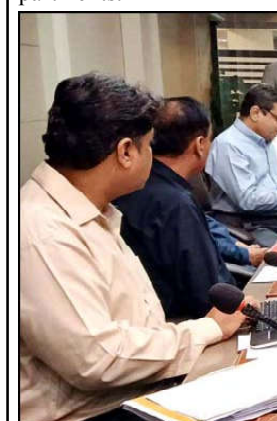
KARACHI: Provincial Minister for Energy Syed Nasir Hussain Shah presiding over a high level meeting.

According to SIU officials, the operation led to the seizure of hand grenades, a launcher, 9mm pistols, and several fake service cards from various departments.