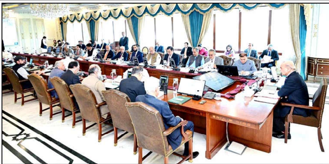
ISLAMABAD: Prime Minister Muhammad Shehbaz Sharif chairs a Federal Cabinet Meeting.

The meeting was briefed that since October 2023, Pakistan had dispatched 10 consignments of medicines, food items, clothing and other relief items worth 1810 tons to Palestine. The prime minister said that the government was bringing back 71 Pakistani nationals stranded in Lebanon via Damascus while steps were being taken to bring back more Pakistani citizens from war-hit areas.