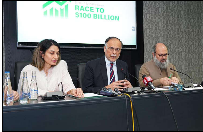
Federal Minister for Planning Ahsan Iqbal and Federal Minister for Commerce Jam Kamal Khan at the event of Innovation Lab on Achieving $100 Billion Exports Target organized by MoPDSI here in Islamabad.