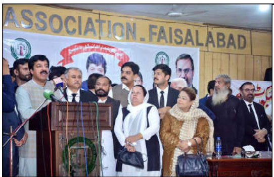
FAISALABAD: Governor Punjab Sardar Saleem Haider Khan is addressing the lawyer's community at the auditorium of District Bar Association (DBA) Faisalabad.

The Chief Minister said that the provincial government highly values China's cooperation in the development of the province.