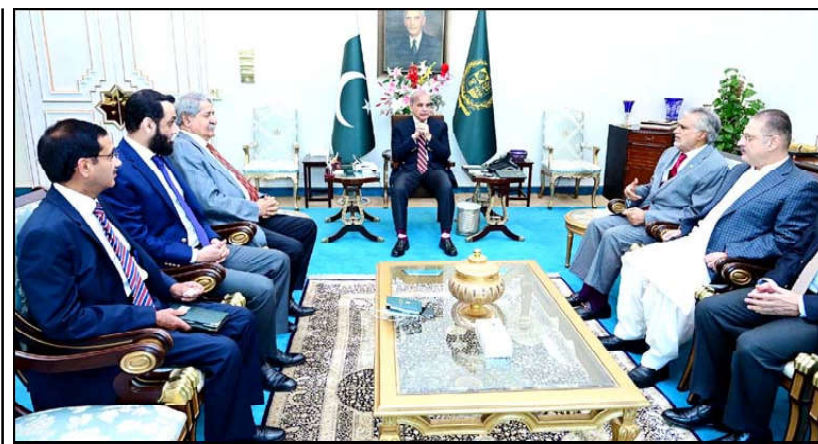
ISLAMABAD: Prime Minister, Muhammad Shehbaz Sharif in a meeting with a delegation of Peoples Party (PPP) held in Islamabad.

The cabinet meeting offered Fateha for the security personnel martyred in different terrorist incidents.