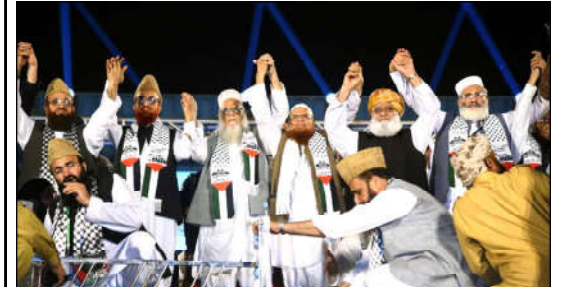
KARACHI: Jamiat Ulema-e-Islam (JUI-F) Chief, Maulana Fazal-ur-Rehman, Mufti Taqi Usmani, Mufti Muneeb Rehman, Siraj-ul-Haq and others joints hands to express solidarity on stage during the National Palestine Conference on the completion of one year of Israeli brutality organized by Markazi Jamiat Ahle Hadith Pakistan, held at Shahr-e-Quaideen road in Karachi.

According to sources consultation was made on constitutional amendment, overall political situation of the country and SCO conference during the meeting.