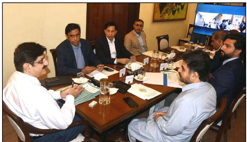
KARACHI: Sindh Chief Minister, Syed Murad Ali Shah presides over a meeting of Agriculture Department, at CM House in Karachi.

A Toyota Wagon was reportedly hit by an unknown vehicle, causing the Wagon to go out of control and crash into a tree on the side of the road. The impact of the collision proved fatal for 5 individuals who were traveling in the van as they were pronounced dead at the scene. Ten other passengers in the van sustained serious injuries and were immediately transported to the hospital by the Rescue 1122 team for medical treatment.