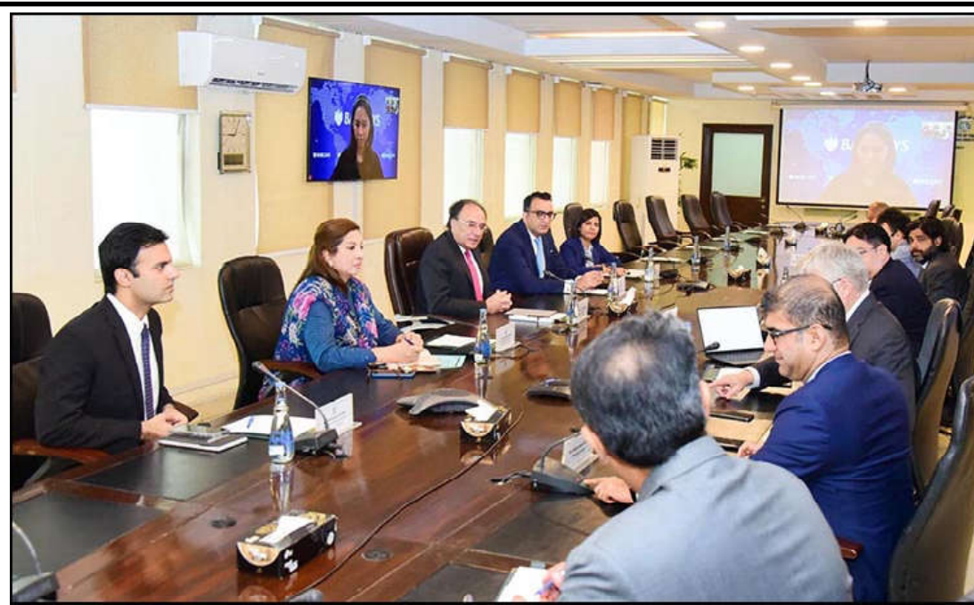
ISLAMABAD: Federal Minister for Finance and Revenue Senator Muhammad Aurangzeb held a meeting with a group of investors led by Barclays at the Finance Division.

“In the past, the focus was on textiles, now the focus is on pharmaceutical exports”, he added.