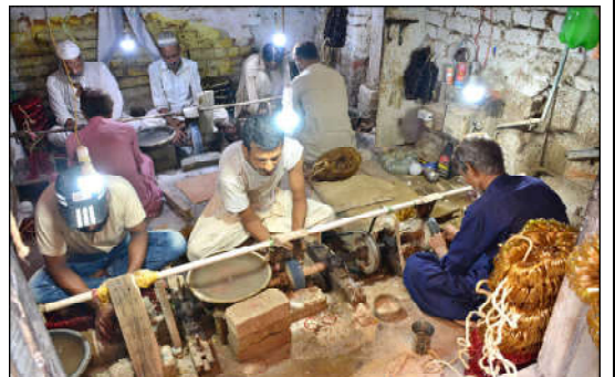
HYDERABAD: Labourers busy in preparing the design on the bangles with the help of machine at their workplace.