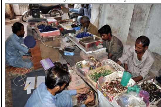
HYDERABAD: Laborers prepare bangles at a workshop as demand of bangles increased in Hyderabad.

The board has decided to impose 15 restrictions on non-filers within two to three months through a finance bill, he said adding the non-filers would not be allowed to purchase of properties and vehicles and would not also travel abroad or open current account in any bank.