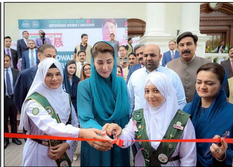
LAHORE: Punjab Chief Minister Maryam Nawaz Sharif along with students of Girls College inaugurate Chief Minister Transport Program for Women.

19 tehsils deprived of transport. These tehsils include: Bhakkar, Sialkot, Chiniot Kamalia, Hasilpur, Malakwal, Ferozowala, Shorekot, Jatoti, Fateh Jang, Hasan Abdal, Kot Momin, Jalalpur Pirwala, Kallar Syedan, Pindi Ghep, Manchanabad and Sharqpur. In the second phase, girls colleges of Nowshera Virkan, Dina, Yazman, Pindi Bhattian, Lalian, Bhawana, Kot Addu, Taxila, Sarai Alamgir and Pellaan would get buses.