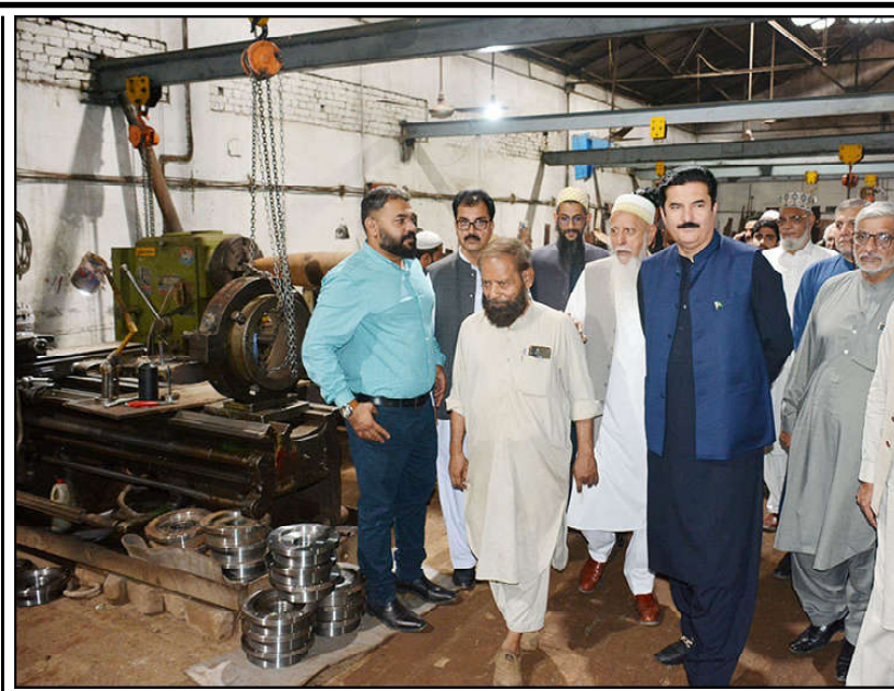
PESHAWAR: Governor Khyber Pakhtunkhwa Faisal Karim Kundi visits Daudsons Army at Industrial Estate.

According to a spokesman for the SNGPL, in Multan and Sahiwal, 38 connections were severed due to illegal gas usage, resulting in fines totaling 210,000 rupees. Meanwhile, Lahore and Faisalabad saw 44 connections cut, with fines amounting to over 2 million rupees. In Sheikhupura, Gujranwala, and Gujrat, 17 connections were disconnected for illegal gas use, incurring fines of 1.55 million rupees. Additionally, 21 connections were dismantled in Bahawalpur and Rawalpindi for similar violations.