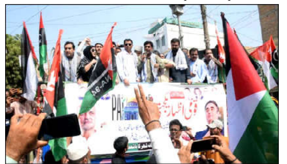
LARKANA: Leaders and supporters of Jamat-e-Islami (JI) and Peoples Party (PPP) are holding protest demonstration against Israeli aggression and atrocities on the Gaza Strip and solidarity with the Palestinians, held in Larkana.

The moot was attended by Prime Minister Shehbaz Sharif, Chairman of Senate Syed Yousuf Raza Gilani, federal cabinet members, PML-N President Nawaz Sharif, PPP chairman Bilawal Bhattu Zardari, JUI-F chief Maulana Fazlur Rehman, Jamat-e-Islami Ameer Hafiz Naemur Rehman and leaders of other mainstream political parties.