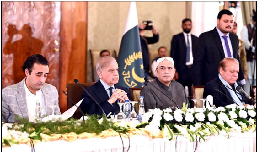
ISLAMABAD: All Parties Conference (APC) on Palestine and Gaza at Aiwan-e-Sadr.

Ph: 0300-3898091 Vol: 06. No. 224 Rabi-us-Sani 04, 1445 AH Tuesday October 08, 2024 Pages 04 Price Rs. 12.00