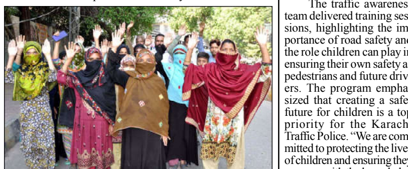
HYDERABAD: Residents of Latifabad No.10 are holding protest demonstration against high handedness of police, at Hyderabad press club.

While presenting the biographical sketch of Kafka, She said that Kafka's literature was actually written under the biographical