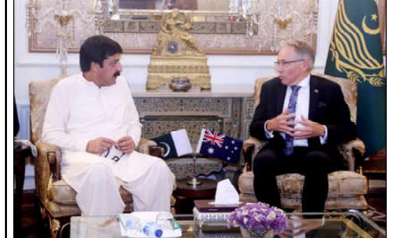
LAHORE: Australian High Commissioner Neil Hawkins meeting with Punjab Governor Sardar Saleem Haider Khan.

PESHAWAR (APP): Parliamentary leader of Pakistan Peoples Party (PPP), in Khyber Pakhtunkhwa Assembly Ahmad Karim Kundi on Monday calls for Chief Minister's resignation. Addressing press conference, outside KP Assembly Hall, Ahmad Karim Kundi said that the chief minister is mentally retarded and not suitable for this post. He described the Chief Minister as a "self-imposed absentee" and accused him of evading accountability during a crucial time for the province. Kundi emphasized the urgency of convening a meeting of the Council of Common Interests within the next 90 days, which he claimed had not been called, further undermining governance. He pointed out the deteriorating law and order situation in the southern districts, saying that the Chief Minister failed to communicate with anyone during his periods of absence. "He talks about traversing 12 districts, but that is simply unbelievable," Kundi asserted, insisting that the sensitive province needs a serious and engaged leader not a film star.