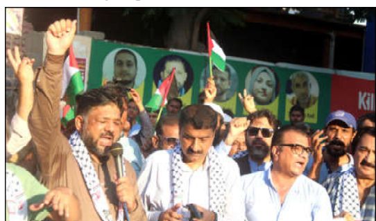
KARACHI: Journalists protest against Israeli aggression under the auspices of Karachi Press Club in the Provincial Capital.

The DC further said that market committee officers will be assigned the duty of delivering the daily price list to every shop and cart, and if the list was not displayed, action will be taken.