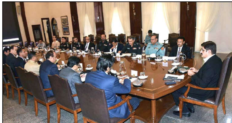
KARACHI: Sindh Chief Minister, Syed Murad Ali Shah presides over a meeting to review law and order situation, at CM House in Karachi.

"We are committed to protecting the lives of children and ensuring they grow up with the knowledge of proper traffic conduct," said a spokesperson from the traffic police. At the conclusion of the session, the staff of Karachi Public School expressed their gratitude to the Traffic Police for organizing the valuable and informative program.