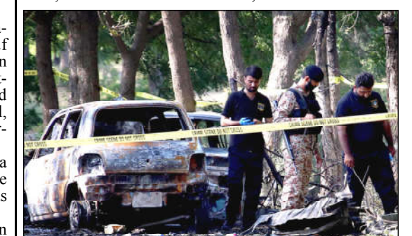
KARACHI: A view of the cordoned-off area where the wreckage of destroyed vehicles lies following a deadly explosion near Karachi Airport occurred late Sunday night.

"The Chinese embassy and consulates in Pakistan remind Chinese citizens and companies in Pakistan to be vigilant, pay close attention to the local security situation, strengthen security measures, and make every effort to take safety precautions," it added.