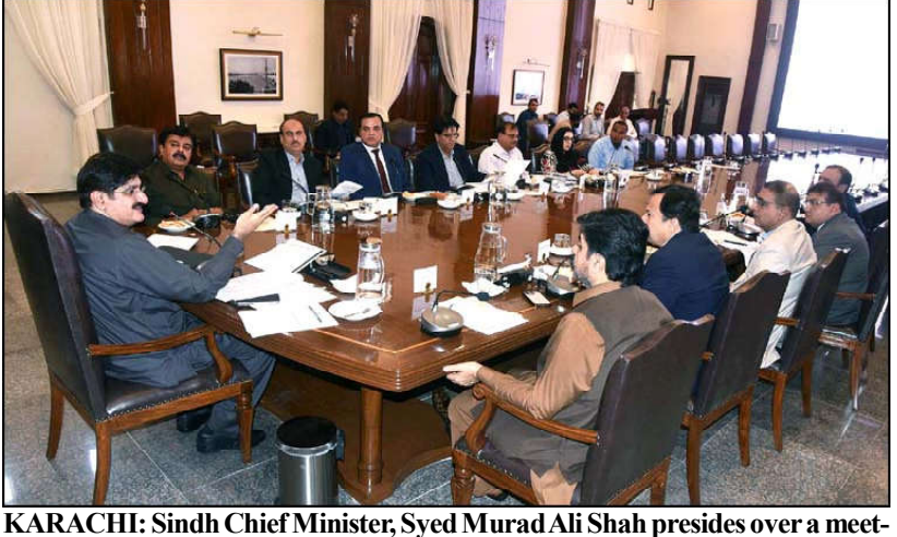
ing of the school education department, held at CM House in Karachi.

four cases, Punjab one, Khyber Pakhtunkhwa one, and Islamabad one