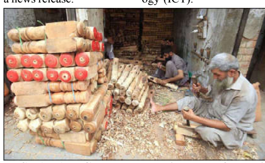
PESHAWAR: Carpenters making part of a traditional bed (charpai) at his workplace in Dabgari

The minister said that Ethiopia could benefit from Pakistan's experiences in the field of Information and Communications Technology (ICT).