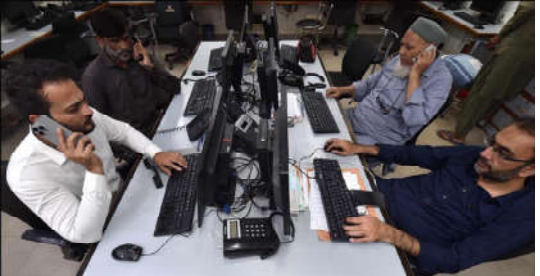
KARACHI: Pakistani stockbroker monitors the share prices during a trading session at the Pakistan Stock Exchange (PSX) in Karachi.

He said that this initiative marked a significant milestone in our ongoing efforts to promote transparency and enhance the accessibility of economic data, particularly for academia and research insti-