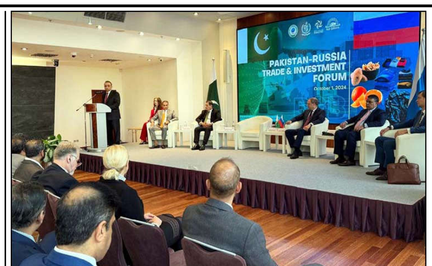
MOSCOW: Federal Minister for Board of Investment, Privatization and Communications, Abdul Aleem Khan addressing Pakistan-Russia Trade and Investment Forum, in Moscow,

SBP was ready to develop a pilot and BISP has to finalize the internal mechanics of the implementation strategy