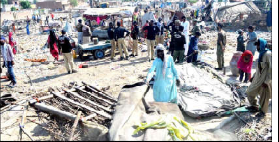
HYDERABAD: Staffer busy in removing illegal huts during anti-encroachment opration in Latifabad no 10.

SLAMABAD (Online): the closed door in SC. PPP ing. APP adds: The Su-Review appeal regarding interpretation of article 63 A was heard in the Supreme Court (SC) A larger bench of SC headed over by Chief Justice of Pakistan (CJP) Qazi Faez Isa took up the case for hearing. CJP remarked at the inception of hearing Justice Munib