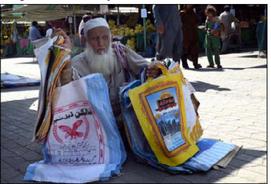
ISLAMABAD: An elderly vendor patiently awaits customers, offering eco-friendly shopping bags at the weekly Bazaar in Federal Capital.

The ministry informed the committee that a special task force, led by the Finance Minister, had been established by the Prime Minister to address the issue, with progress being made towards a resolution, and its detailed report on any final decisions was awaited