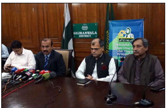
GUJRANWALA: Chief Minister Directorate for Evaluation, Feedback, Inspection and Monitoring (DEFIM) Chairperson, Brigadier (Retd) Babar Ala Ùddin addresses to media persons during press conference, in Gujranwala.

The chief minister appealed to the citizens that never forget your elders, rather give them the respect and status they deserve. Only those societies rise that value their elders