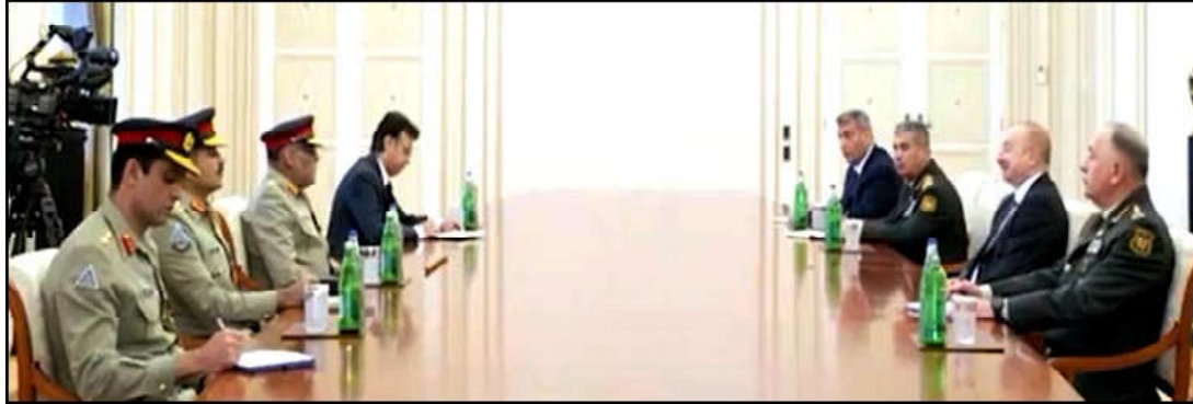
RAWALPINDI: Chairman Joint Chiefs of Staff Committee (CJCSC) General Sahir Shamshad Mirza called on Azerbaijan President Ilham Aliyev.

Minister Al-Falih said that as a follow-up of their Pakistan visit, both sides had "extensive" working-level meeting to elevate the bilateral relations to yet higher horizons in the fields of economy, finance, trade and people-to-people contacts.