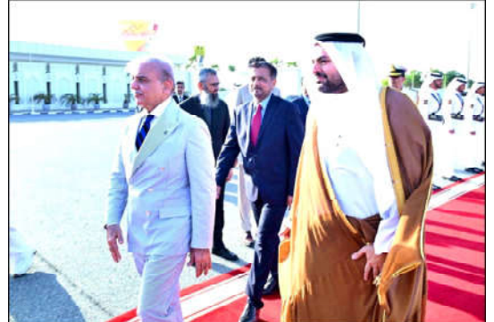
DOHA: Prime Minister Muhammad Shehbaz Sharif arrives at Doha International Airport for his 2 day official visit of Qatar. He is being received by Qatar's Minister of State, Muhammad bin Abdulaziz Al-Khulaifi.

The leadership level delegations of Qatar Investment Authority (QIA) and Qatar Businessmen Association (QBA) will call on the prime minister to explore investment opportunities in Pakistan.