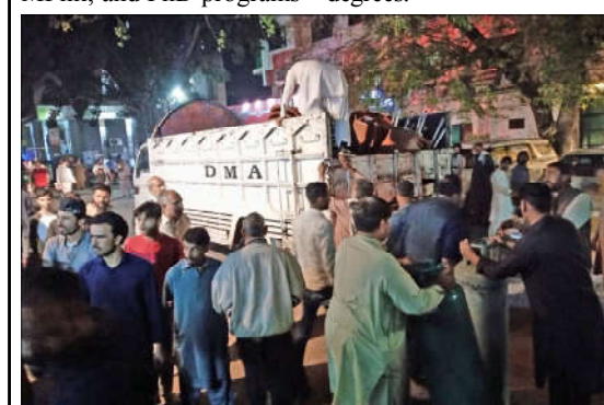
ISLAMABAD: DMA staff loading encroachments on a loading truck during anti-encroachments operation at Sittara Market, in the Federal Capital.