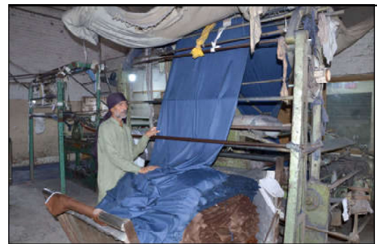
FAISALABAD: A worker busy in his work in a local Garments factory in the city.

The focus of the discussions centered on incorporating agricultural insurance into disaster risk financing strategies and national food security policies, introducing compulsory occupational health insurance, and strengthening the enforcement of mandatory group life and motor third-party insurance.