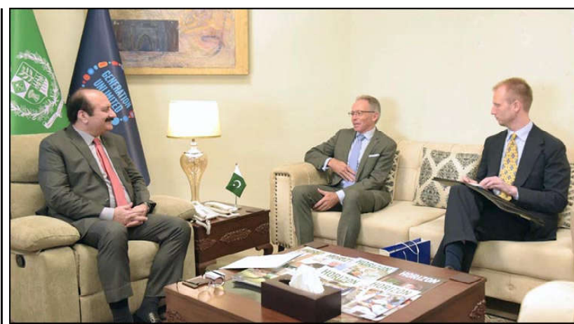
ISLAMABAD: Chairman Prime Minister's Youth Programme Rana Mashhood Ahmed Khan in a meeting with Australian High Commissioner Neil Hawkins.

Officers were ordered to conduct indiscriminate operations against vehicles with tinted glasses, and with blue lights. Furthermore, IGP Islamabad directed the officers to enhance the effectiveness of the Dolphin Squad's to ensure the prevention of criminal activi-