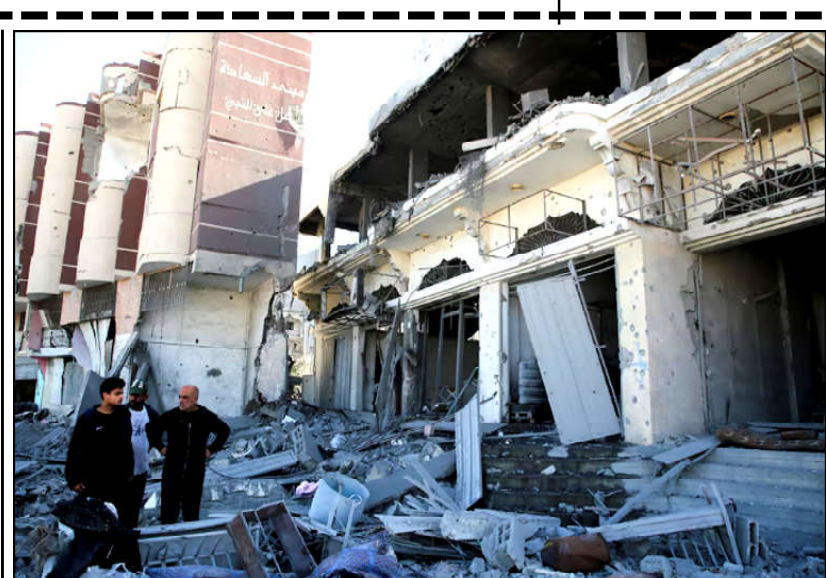
Palestinians inspect the site of an Israeli strike on a house, amid the Israel-Hamas conflict, in Khan Younis in the southern Gaza Strip.