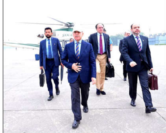
ISLAMABAD: Prime Minister Muhammad Shehbaz Sharif departs for his two day official visit of Kingdom of Saudi Arabia to represent Pakistan in Future Investment Initiative.

He underlined the need for the two countries to invest in trade infrastructure. streamline customs processes, strengthen trade facilities, develop transportation links, build mutual trust, and enhance diplomatic dialogues for achieving long-term trade benefits.