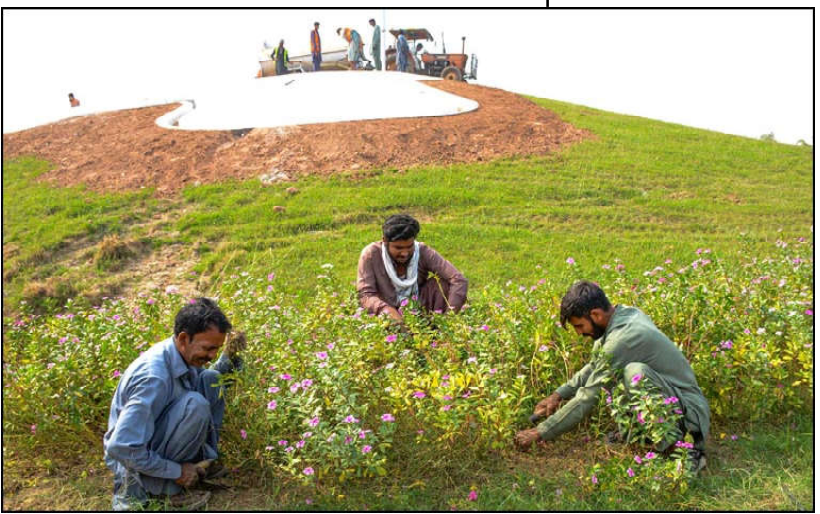
ISLAMABAD: CDA workers are busy cutting surplus grass to maintain green belt area vegetation.

NHMP officer's dedication and encouraged them to continue serving with the same commitment, ensuring the safety and support of all travellers on national highways. Earlier, the NHMP officials had saved a family from a burning car while risking their lives during an incident near M-1- Sial Mor on the motorway.