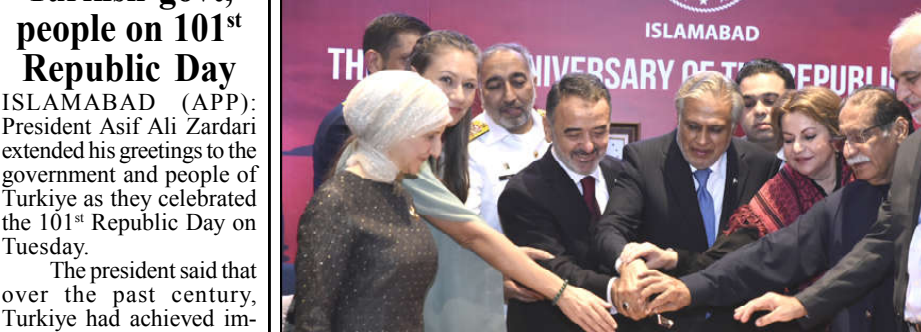
ISLAMABAD: Deputy Prime Minister and Foreign Minister Senator Ishaq Dar and Ambassador of Türkiye, Dr. Irfan Neziroglu, and others cutting the cake during the 101 Anniversay of Turkish National Day at a local hotel in Federal Capital.

sion of SC be reviewed. Meeting between Chief Election Commissioner (CEC) and Chief Justice Lahore High (CJLHC) can not become reason for change of Election tribunals. Who will be judge of Election Tribunal, this power rests with Chief Justice. LHC registrar notified 6 election tribunals on April 4. Names of serving judges for election tribunals were returned following the meeting between CJLHC and chief election commissioner