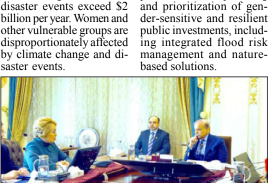
ISLAMABAD: Speaker of the Federation Council of the Federal Assembly of the Russian Federation, H.E. Ms. Valentina Matvienko, calls on Prime Minister Muhammad Shehbaz Sharif.

The program supports enhanced capacity for disaster risk mapping and modeling for investment and development decisions. It enhances coordination for disaster monitoring and response. It supports enhanced planning