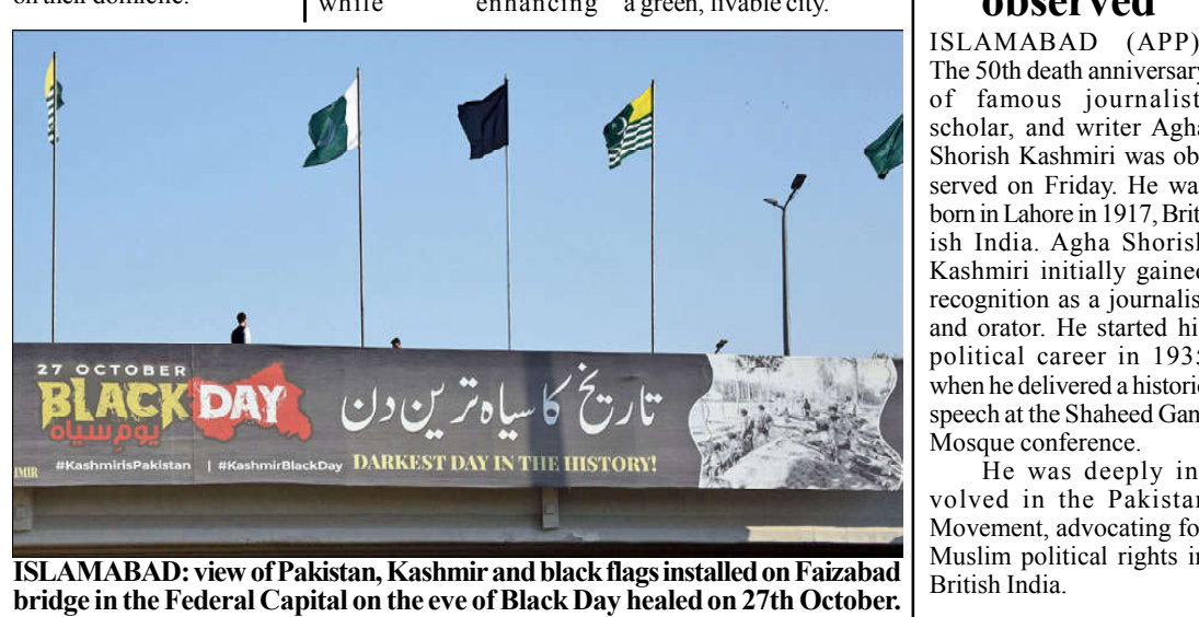
ISLAMABAD: view of Pakistan, Kashmir and black flags installed on Faizabad bridge in the Federal Capital on the eve of Black Day on 27th October.