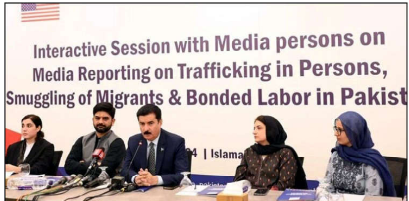
ISLAMABAD: Governor Khyber Pakhtunkhwa Faisal Karim Kundi attends Interactive session with media persons during an event arranged by SSDO.