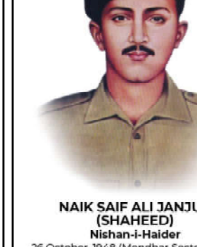
NAIK SAIF ALI JANJUA (SHAHEED) Nishan-i-Haider 26 October, 1948 (Mendhar Sector, IIOOK)

RAWALPINDI (PR): The Chairman Joint Chiefs of Staff Committee, Services Chiefs, and Armed Forces of Pakistan pay heartfelt tribute to Naik Saif Ali Janjua Shaheed, Nishan-e-Haider, on his 76th martyrdom anniversary.