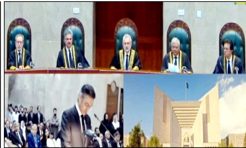
ISLAMABAD: Attorney General Mansoor Usman speaking before a full court reference held at Supreme Court in honour of outgoing Chief Justice of Pakistan Justice Qazi Faez Isa.

He attributed the 36% increase in the stock market since March 2024, a significant reduction in the