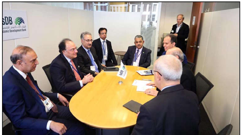
WASHINGTON DC: Federal Minister for Finance and Revenue Senator Muhammad Aurangzeb held a meeting with President Islamic Development Bank (ISDB) on the sidelines of a meeting with IMF/IMF annual meetings 2024.

The nation remains eternally proud of its brave sons.