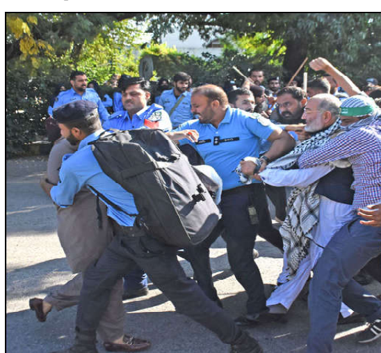
ISLAMABAD: Islamabad Police Crackdown on Aid Hamas March under the auspices of Save Gaza Campaign, police arrested the protestors heading towards US Embassy in the Federal Capital.

In the meeting held on the sidelines of the Commonwealth Heads of Government Meeting (CHOGM) being held here in the capital city of Samoa, the two foreign ministers agreed to remain engaged on issues of mutual interest. The deputy prime minister reiterated Pakistan's commitment to forge a broad-based relationship with Singapore anchored in strong economic, political and cultural cooperation.