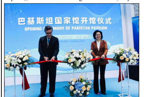
Ambassador of Pakistan to China H.E. Mr. Khalil Hashmi inaugurated Pakistan Pavilion at 31st China Yangling Agricultural Hi-Tech Fair.

The sector also played a significant role in employment, supporting 631,000 jobs in 2023, equivalent to one in five jobs in Dubai. With projected growth, an additional 185,000 jobs will be created by 2030, bringing the total to 816,000 jobs.