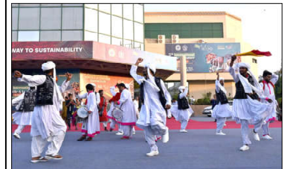
KARACHI: Artists perform traditional folk dances on the closing day of the 5th International Textile and Leather Exhibition, TEXPO 2024, at the Expo Center.

ritory and strongly condemned the atrocities inflicted on innocent Kashmiris. Ghulam Muhammad Safi emphasized on highlighting the long-standing dispute of Kashmir at the global level, saying that India is committing serious violations of human rights in Kashmir, which cannot be ignored anymore and will be raised on international forums. Safi highlighted the difficulties faced by the people of IIOJK, saying that the voice should be raised for the rights of Kashmiris not only in Azad Jammu and Kashmir but in the whole world.