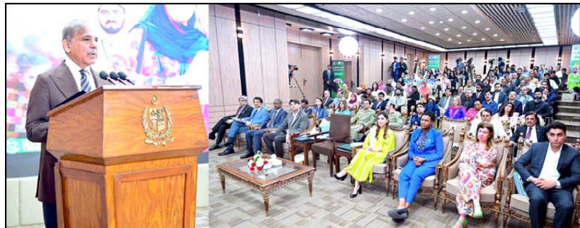
ISLAMABAD: Prime Minister Muhammad Shehbaz Sharif addressing a ceremony organized to mark World Polio Day & the Inauguration of the National Polio Campaign.

He assured the government's all-out support to the polio workers and said the event was also held to acknowledge their dedicated efforts and sacrifices. He said the surge in polio cases, caused by an immunity gap, was a matter of concern and resolved that the polio vaccination teams would reach every household to vaccinate every child to ensure no one was left behind.