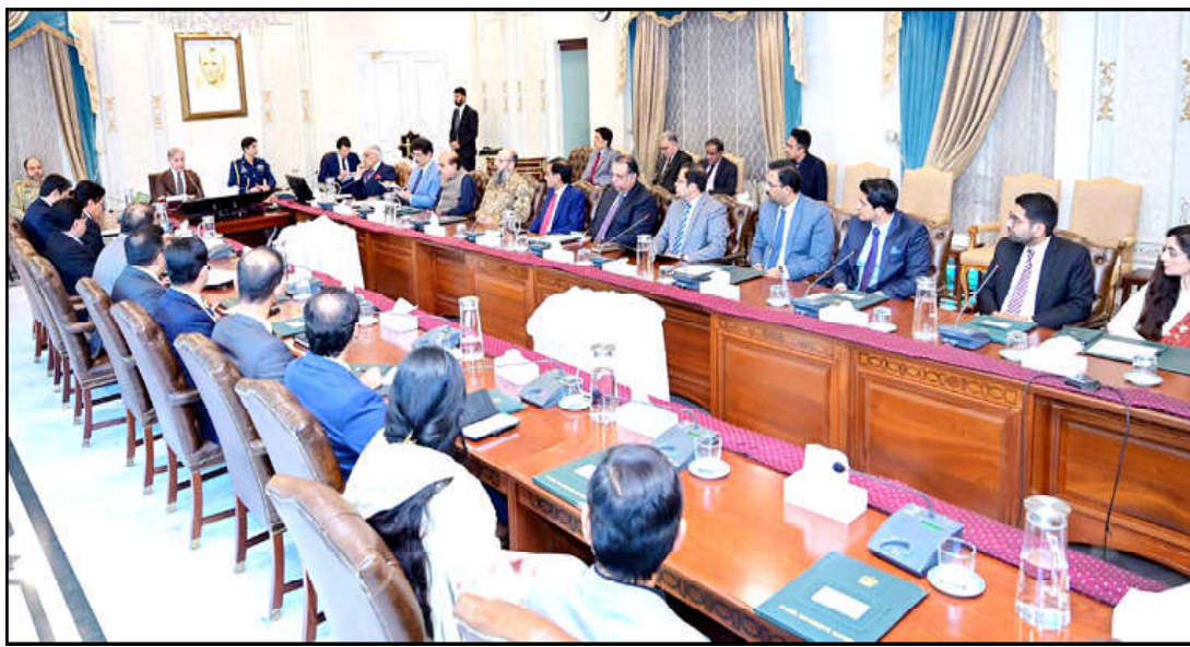
ISLAMABAD: Newly selected Community and Labor Welfare Attachés call on Prime Minister Muhammad Shehbaz Sharif.