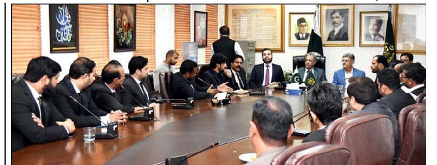
ISLAMABAD: Federal Minister for Law and Justice Senator Azam Nazeer Tarrar held a meeting with Lawyers from various Bar Associations.

the elections. Ambassador Tukhtayev announced the launch of direct flights between Lahore and Tashkent, which will later be extended to other major cities in Pakistan. Irfan Siddiqui praised Uzbekistan's initiative to commence flights starting next month, stating that this development will significantly boost trade, tourism, and people-to-people exchanges between the two countries.