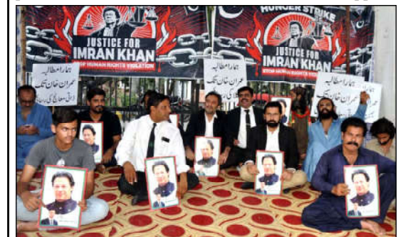
HYDERABAD: Members of Tehreek-e-Insaf (PTI) Lawyers Wing are holding protest demonstration for release of PTI Founder Imran Khan, outside Civil Court in Hyderabad.

WAPDA's North Project Manager has requested pre-qualification tenders for the initial two phases of the canal.