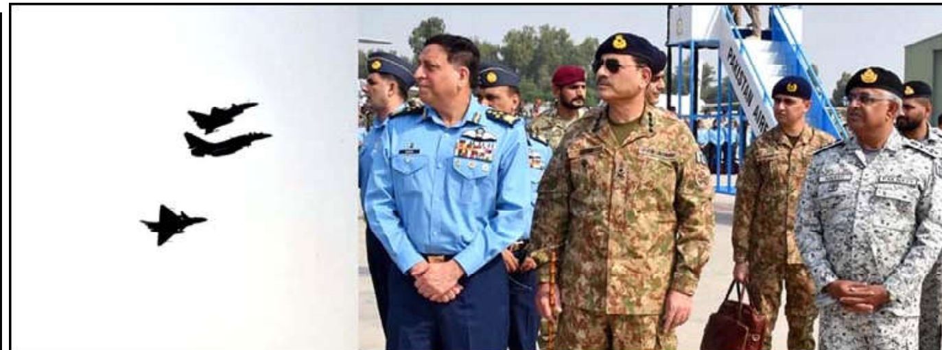
RAWALPINDI: Chief of Army Staff (COAS), General Syed Asim Munir witness the ongoing Multinational Exercise Indus Shield-2024, at an operational Air Base of Pakistan Air Force (PAF).

The written court order noted the PTI founder's age—72 years—and his status as a former prime minister and under-trial prisoner.