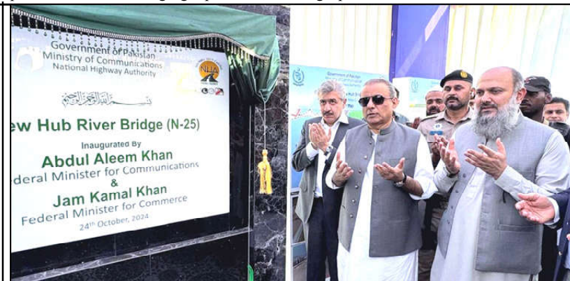
Federal Minister for Board of Investment, Privatization & Communications Abdul Aleem Khan and Federal Minister for Commerce Jam Kamal Khan inaugurating the Hub River Bridge (N-25).

He is a graduate of Royal College of Defence Studies (UK), Army Command & Staff College (Quetta) and National Defence University (Islamabad). The Admiral has an illustrious naval career comprising vast experience of various Command and Staff appointments.