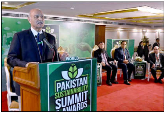
ISLAMABAD: Senator Mushahid Hussain Sayed addresses at the opening ceremony of the 'Pakistan Sustainability Summit' held at a local hotel.

ISLAMABAD (APP): The representatives of different bar councils on Thursday met Minister for Law and Justice Senator Azam Nazeer Tarrar. The representatives of bar associations from Jhelum, Khushab, Sohawa, Chuniyan and Nurpur Thal held meeting with the law minister. They discussed the discussion on various issues related to bar councils. The law minister said that Bank of Punjab branches and counters will be opened in court premises after discussing with the Punjab government and the Punjab Bar Council on the issues of court fees and stamps. The contact has been established between the Vice Chairman Punjab Bar Council Chaudhry Babar Waheed and the management of Bank of Punjab. He assured that full cooperation while discussing the problems of lawyers and said that government prioritizes welfare schemes for lawyers.