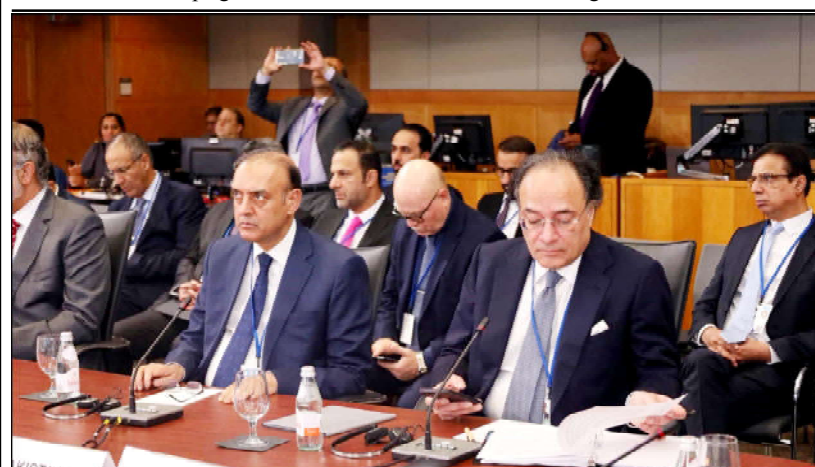
WASHINGTON DC: Federal Minister for Finance and Revenue Senator Muhammad Aurangzeb, accompanied by the Governor State Bank of Pakistan, attended the meeting of Managing Director IMF with Finance Ministers, Central Bank Governors, and Heads of Regional Financial Institutions of the Middle East, North Africa, Afghanistan, and Pakistan

The Minister expressed his deep appreciation to the NEA for its continued cooperation to address our energy shortages in Pakistan, at a time when the country was facing worst power outages in its history.