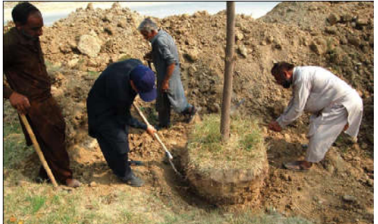
ISLAMABAD: CDA workers starts relocate the plants from the site of new flyover site on Jinnah Avenue.