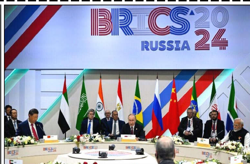
Chinese President Xi Jinping, Russia's President Vladimir Putin and Indian Prime Minister Narendra Modi attend the narrow format meeting of the Brics summit in Kazan.

summit hosted by New Delhi the following month, a decision seen as another setback to their relations. Diplomatic efforts gained momentum in recent months after foreign ministers of the two countries met in July and agreed to step up talks to ease the border tensions. As India had made improving the wider political and damaged business ties contingent upon finding a solution to the border stand-off, Wednesday's talks between the two leaders are expected to result in potentially more Chinese investment into India. New Delhi had increased the scrutiny of investments coming from China, blocked direct flights between the two countries and had practically barred issuing any visas to Chinese nationals since the Ladakh clashes.