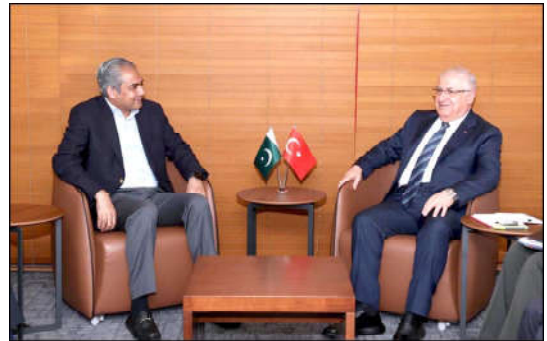
ISTANBUL: Federal Minister for Interior Mohsin Naqvi in a meeting with Turkish Minister of National Defense Yasar GULER.

Senior judges can have what objection over appointment of junior judge as chief justice of Pakistan. Congress accords approval to the appointment of judges in US. The power for appointment of judges of SC rest with parliamentarians in India. Members of parliament can make attachment of judges in India as well.