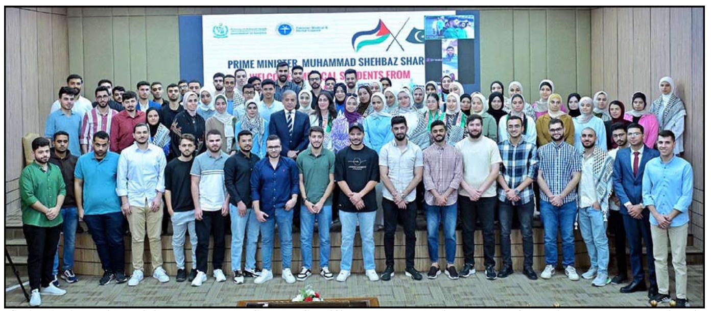
ISLAMABAD: Prime Minister Muhammad Shehbaz Sharif in a group photo with students of Palestine who recently arrived in Pakistan to complete their medical education.

voiced reservations about the undue delay in constructing additional family suites and servant quarters adjacent to the Parliament Lodges, pointing out that these delays have significantly increased project costs. The Committee highlighted the grievances of parliamentarians who were not provided with accommodation and directed the Capital Development Authority (CDA) to carry out repair and maintenance work impartially. The committee directed CDA to make serious efforts to complete the construction of the additional family suites and servant quarters without any further delay. It also directed the CDA to provide details regarding the resolution of long-standing litigation related to the construction of additional family suites and servant quarters. The CDA apprised the Committee that tenders for the construction project have been published, with openings scheduled for 11th November 2024. The CDA also informed the Committee that Central Development Working Party (CDWP) has recommended the project to ECNEC for approval.