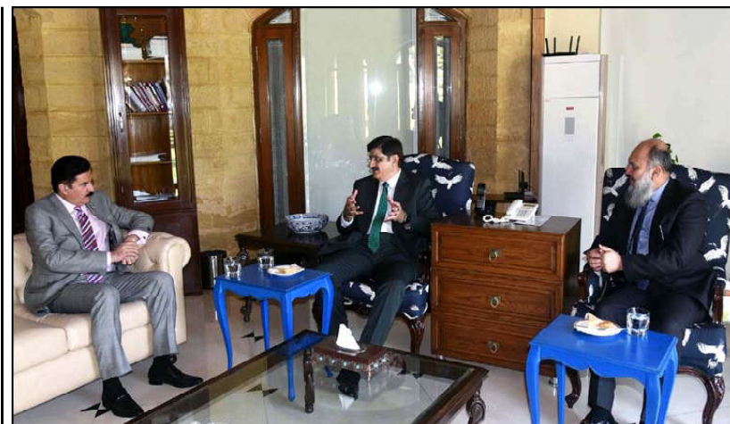
KARACHI: Sindh Chief Minister, Syed Murad Ali Shah exchanges views with Federal Commerce Minister, Jam Kamal and Governor Khyber Pakhtunkhwa Faisal Karim Kundi during meeting held at CM House in Karachi.

service quota has been submitted to the Public Service Commission, along with a case for 631 sub-inspector positions under the 25% quota for current assistant sub-inspectors. The police vehicle procurement process is ongoing at a budget of 802 million PKR, which includes the purchase of 34 double cabins, 15 single cabins, 30 single cabin vehicles, and 15 bikes. Additionally, work is underway to bulletproof 79 vehicles at a cost of Rs. 760 million. The Chief Minister stressed the need for prompt completion of recruitment and vehicle purchases.