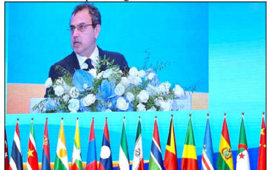
QINGDAO: Federal Minister for Power, Sardar Awais Ahmed Khan Leghari delivers a keynote address at the opening ceremony of the 3rd Belt & Road Energy Ministerial Conference at Qingdao.

In addition to trade, Minister Naqvi highlighted the necessity of regular mutual visits to build sustainable cooperation between the two nations.