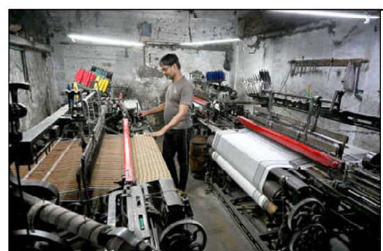
HYDERABAD: Worker busy in preparing design on the handkerchief and traditional fabric by machine at a local textile factory.

He said that we are also focusing on enhancing our design capabilities (replacing the physical samples to 3D prototypes) and creating high-end products that command premium quality in international markets.