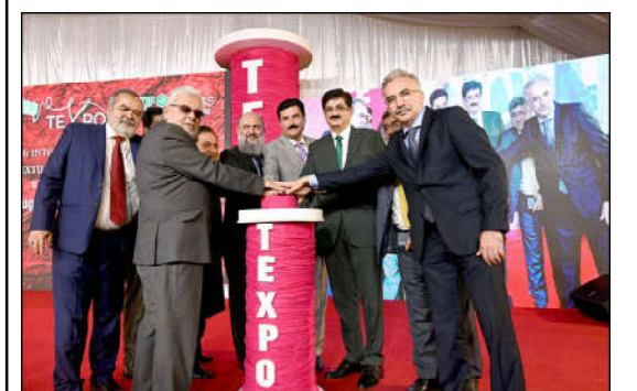
KARACHI: Federal Minister for Commerce and Industry Jam Kamal Khan, Sindh Chief Minister Syed Murad Ali Shah, Governor KPK Faisal Kareem Kundli Chairman TDAP Zubair Motiwala Perform Digital Inaugural of the Fifth International Textile and Leather Exhibition Texpo 2024 at Expo center.