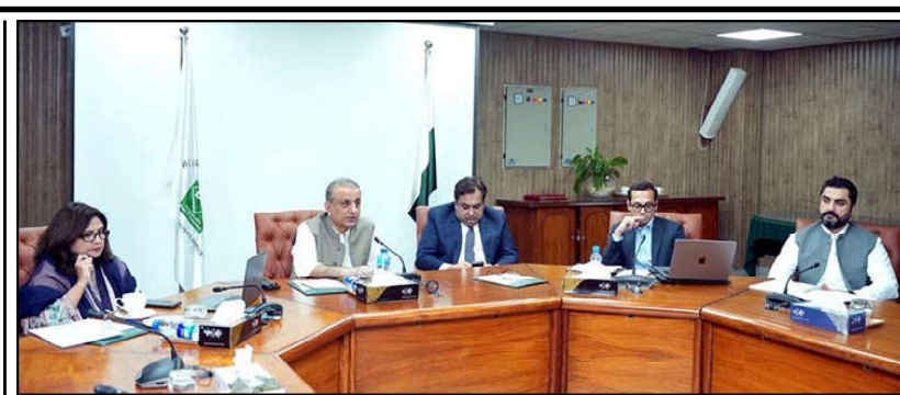
ISLAMABAD: Federal Minister for Board of Investment, Privatization & Communications Abdul Aleem Khan presided over a meeting on Road Shows in China.

He said this initiative is part of Pakistan's broader strategy to increase its global food exports, targeting the Middle East as a crucial growth area. By establishing stronger trade connections, Pakistan aims to enhance its export portfolio and contribute to the economic growth of both countries through mutually beneficial trade partnerships, he added.