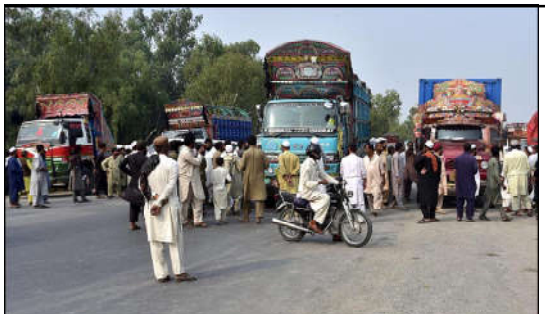
PESHAWAR: Members of All Khyber Pakhtunkhwa Goods Transport Association block road during protest in favor of their demands.

Pervaiz Elahi in the court. The exemption plea said Pervaiz Elahi is unwell and doctors have advised him for bed rest. It is requested the court to accept his one day exemption plea. The court while expressing displeasure over non appearance of Pervaiz Elahi remarked one or other accused becomes absent on every hearing to avert indictment.