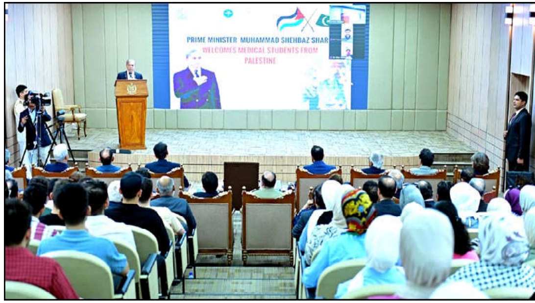
ISLAMABAD: Prime Minister Muhammad Shehbaz Sharif addressing a ceremony held in honour of students of Palestine who recently arrived in Pakistan to complete their medical education.

The notification said, "In exercise of the powers conferred by clause (3) of Article 175 A read with Article 177 and 179 of the constitution of the Islamic Republic of Pakistan, the President of the Islamic Republic of Pakistan is pleased to appoint Mr. Justice Yahya Afridi, Judge of Supreme Court, as Chief Justice of Pakistan, for a term of three years with effect from 26-10-2024.