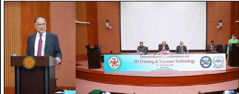
ISLAMABAD: Minister for Planning, Ahsan Iqbal, inaugurates the First International Conference on 3D Printing and Vacuum Technology at National Center for Physics, Quaid-i-Azam University.

The martyred police official was deputed at Sub-Division Bannu and was at home on leave.