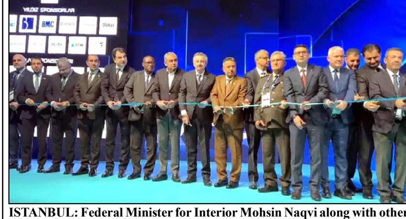
delegates inaugurating SAHA Expo in Istanbul Türkiye.

Discussions also covered stimulating private sector development, building climate resilience through Resilience and Sustainability financing and pursuing prudent monetary and external sector policies.