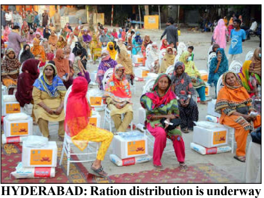
among Hindu Community in connection of Diwali celebration organized by Al-Khidmat Foundation, at Circuit House Mandir in Hyderabad.

operate from 6:30 AM to 7:00 PM, with buses running every 20 minutes providing travel facility to an estimated 4,000 passengers daily. The one-way travel time for the route is approximately 33 minutes. The spokesperson further stated that with the inauguration of the Pabbi route, the total number of BRT routes has increased to 18, expanding the network's reach and providing enhanced convenience to passengers.