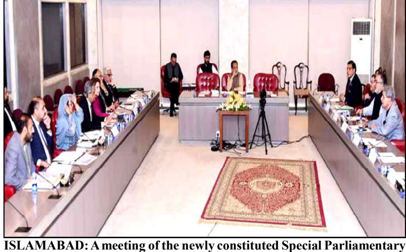
Committee held to deliberate on name of the next chief justice of Pakistan in Parliament House

for formalisation once ap- cussions. The committee, led by Speaker Sadiq, had previously tried to engage PTI members, hoping to involve them in the critical judicial selec-