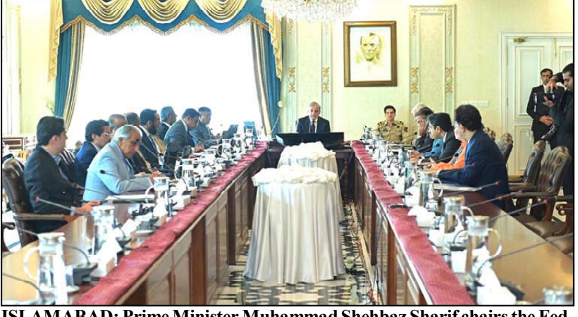
ISLAMABAD: Prime Minister Muhammad Shehbaz Sharif chairs the Fed-

Holding the summit despite challenges with terrorism and security on top, was a great success for the country, he said and appreciated the efforts by the ministries of foreign affairs, information and broadcasting, and interior, law enforcement agencies, police, Pakistan Rangers, Pakistan tional Party, Awami Na- Army and intelligence agen-