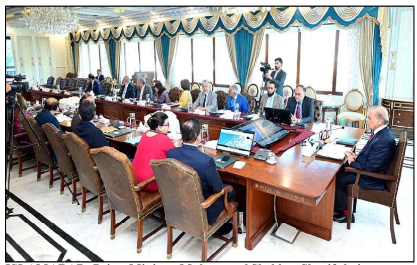
ISLAMABAD: Prime Minister Muhammad Shehbaz Sharif chairs a meet