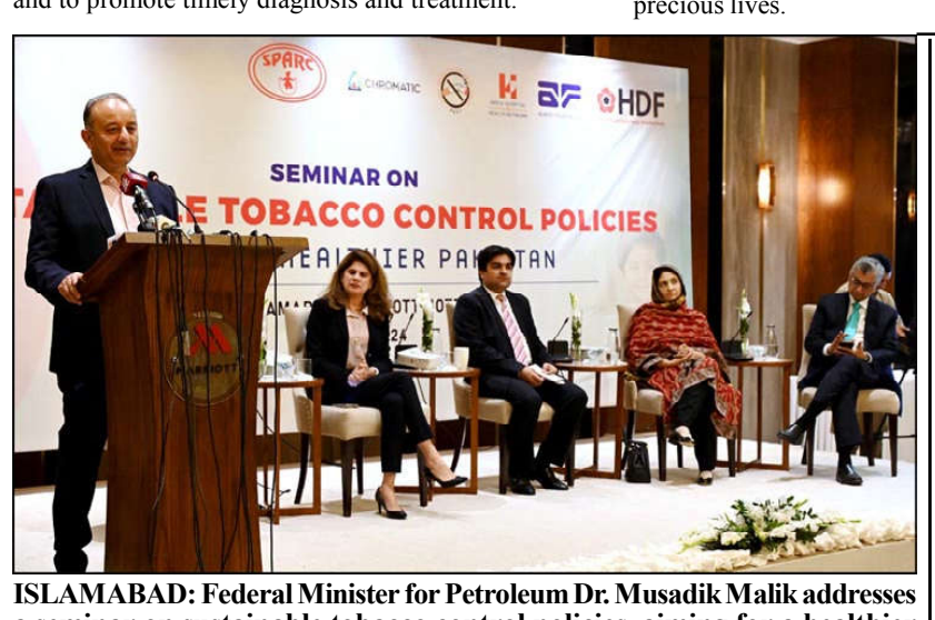
a seminar on sustainable tobacco control policies, aiming for a healthier Pakistan, organized by the Society for the Protection of the Rights of the Child (SPARC).