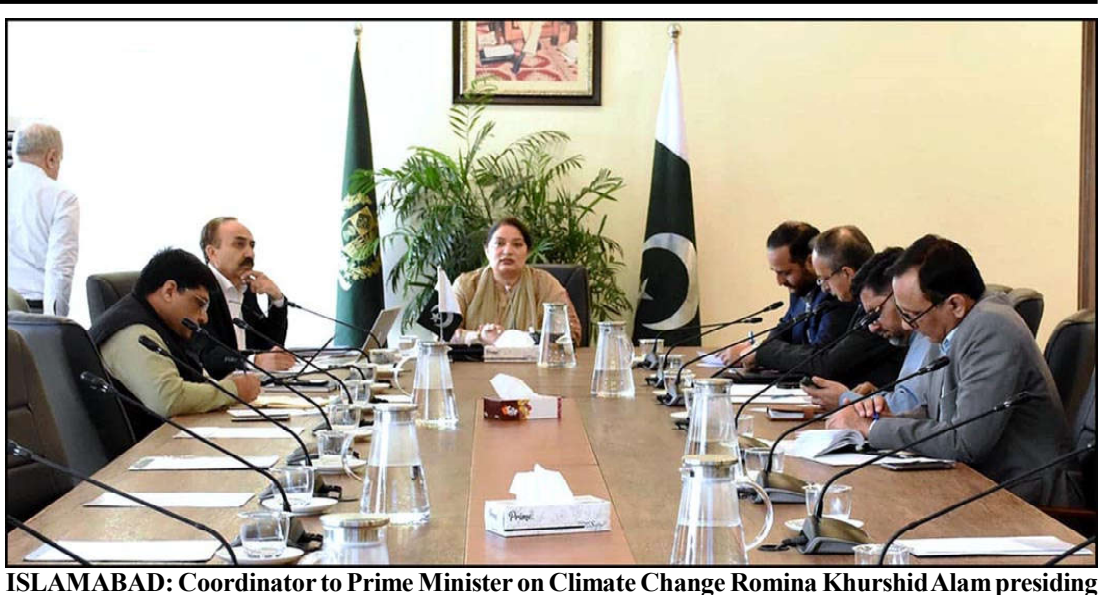
over a 2nd meeting of the Pakistan Climate Change Authority in the Committee Room of the M/o Climate Change & Environmental Coordination.