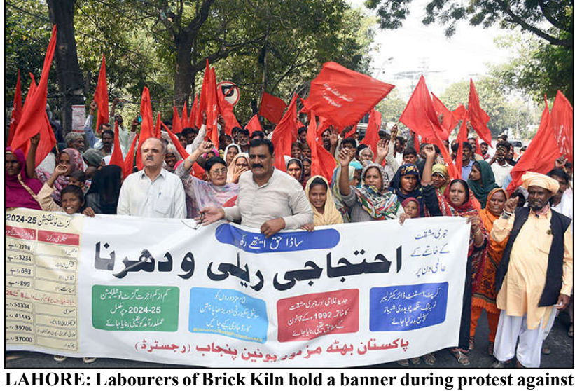
Brick owners in front of press club in the Provincial Capital.