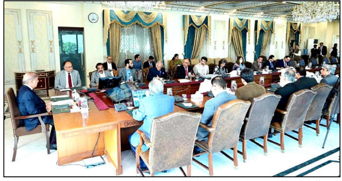
ISLAMABAD: Prime Minister Muhammad Shehbaz Sharif chairs a meeting regarding relief efforts in Gaza and Palestine by the Government of Pakistan.

amendment if the opposi-tion parties refused to sup-