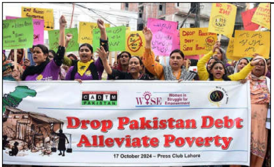
LAHORE: Members of Women in Struggle for Empowerment (WISE) are holding protest demonstration against massive unemployment, increasing price of daily use products and inflation price hiking, at Lahore press club.

empowered financially to reduce unemployment and poverty. She took concrete measures for reduction of inflation and rates of necessary items, Maryam Nawaz emphasized. Punjab CM stressed that mutual responsibility and effort was needed for reduction of poverty. International Day for the Eradication of Poverty is being observed today. This year the theme of the day is "Ending Social and Institutional Maltreatment Acting together for just, peaceful and inclusive societies".