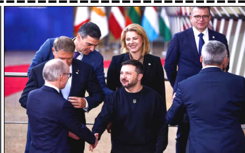
Luxembourg's Prime Minister Luc Frieden, Romania's President Klaus Iohannis, Spain's Prime Minister Pedro Sanchez, Ukraine's President Volodymyr Zelenskyy, and President of the European Council Charles Michel attend a European Union leaders summit in Brussels, Belgium.

lier said that during "operations in the Gaza Strip, three terrorists were eliminated". Israeli defence agencies "are checking the possibility that one of the terrorists was Yahya Sinwar. At this stage, the identity of the terrorists cannot be confirmed", the statement added. There was no immediate comment from Hamas. Israeli Defence Minister Yoav Gallant said that Israel would hunt down "every terrorist" after the military made its announcement. "We will reach every terrorist and eliminate them," Gallant wrote on social media platform X. Israel has been fighting Hamas since the October 7 attack — which resulted in the deaths of 1,206 people, mostly civilians, according to an AFP tally of official Israeli figures.