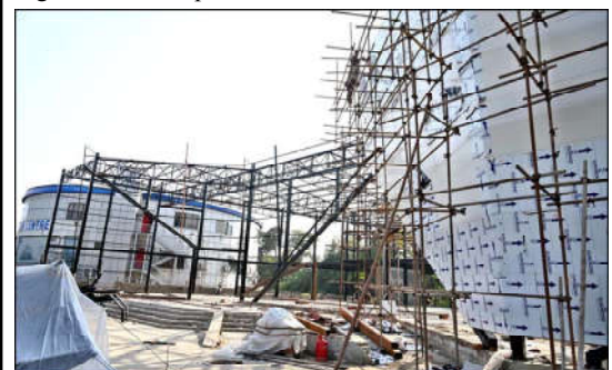
ISLAMABAD: Labourers busy in construction work of CDA Business Facilitation Centre at G-7 sector.

The CDA is committed to completing these vital infrastructure projects on time, significantly enhancing traffic flow and connectivity across Islamabad.