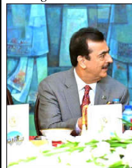
ISLAMABAD: Prime Minister Muhammad Shehbaz Sharif with Chairman Senate Syed Yousuf Raza Gillani at a banquet organized in honor of the senators.

The meeting was also attended by Punjab Chief Minister Maryam Nawaz and senior minister Marriyum Aurangzeb.