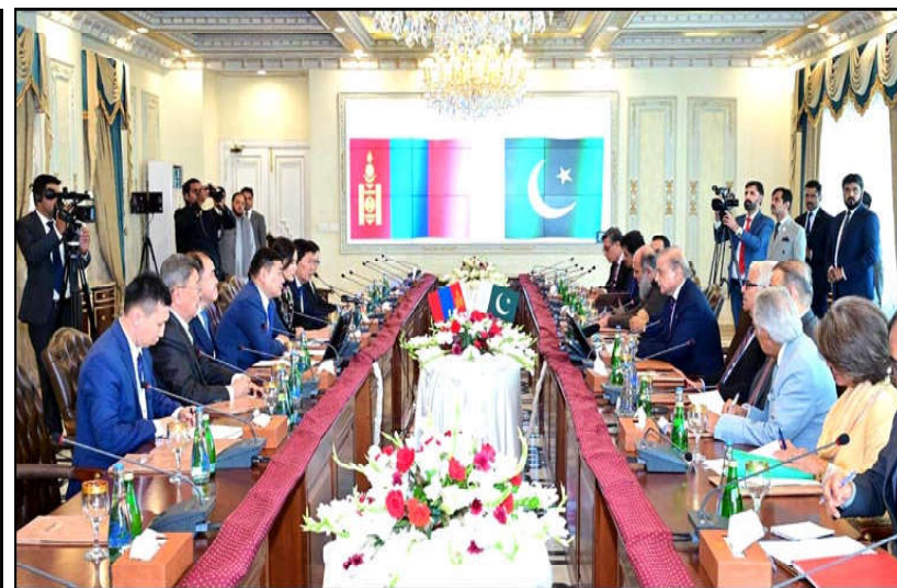
ISLAMABAD: The Prime Minister of Mongolia H.E. Luvsannamsrain Oyun-Erdene along with a delegation meets Prime Minister Muhammad Shehbaz Sharif.

The Mongolian prime minister also planted a sapling in the lawn of the Prime Minister's House.