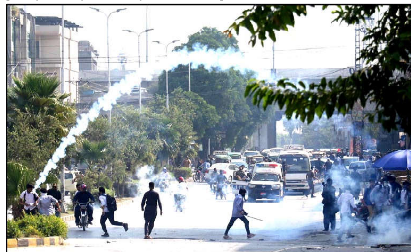
RAWALPINDI: A view of tear gas fire toward student during for protest against the alleged rape in Lahore. More than 150 students have been arrested.