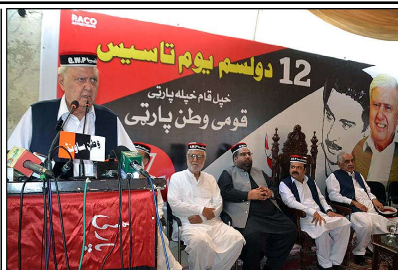
PESHAWAR: Quami Watan Party Chairman, Aftab Ahmad Khan Sherpao addresses to participant during Annual Foundation Day ceremony held in Peshawar.