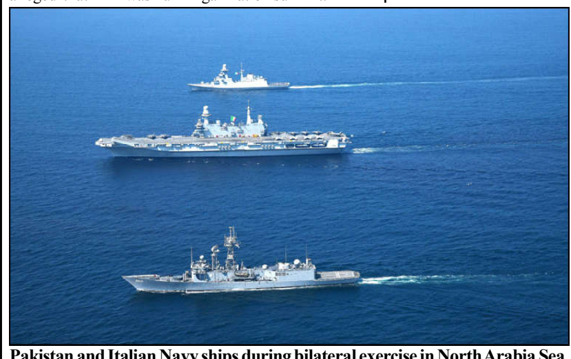
Pakistan and Italian Navy ships during bilateral exercise in North Arabia Sea.

In the United Nations E-Governance Development Index, Pakistan has improved its ranking by 14 points. The country now stands at 136 in overall ranking which was at 150 in 2022.