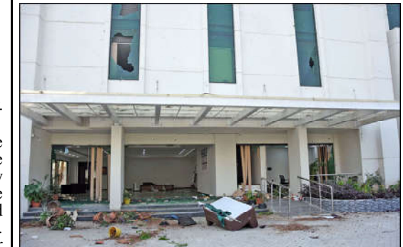
RAWALPINDI: A view of damage building of a college from students during a protest of students in favor of their demands at 6th road in the city.

Insaf Student Wing were found involved in creating chaos. She alleged that the PTI defamed a girl and her family as per planning. Azma said police were performing its duty to maintain law and order, and all cities including Lahore, Gujranwala, Rawalpindi were normal. She said that strict action would be taken against all those who spread fake information in this regard and did negative propaganda.