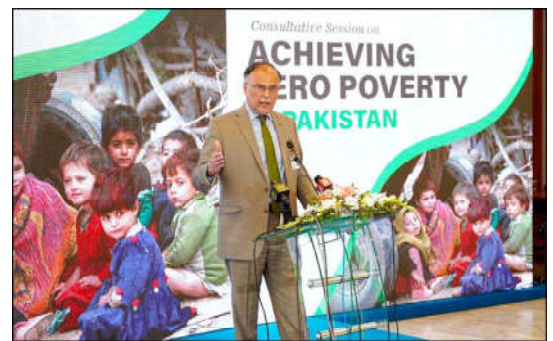
ISLAMABAD: Federal Minister for Planning, Development, and Special Initiatives, Ahsan Iqbal addressing during an event organized by the Ministry of Planning on the International Day for the Eradication of Poverty.

The House recognized that this was the first major international event in 27 years hosted by Pakistan, marking a significant milestone. Hosting the SCO summit is a diplomatic victory for Pakistan, and the House commends the government for its achievements on the international front.