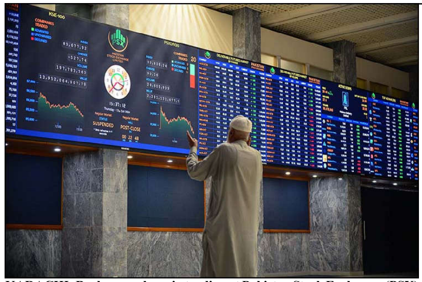
KARACHI: Brokers are busy in trading at Pakistan Stock Exchange (PSX) in Karachi.