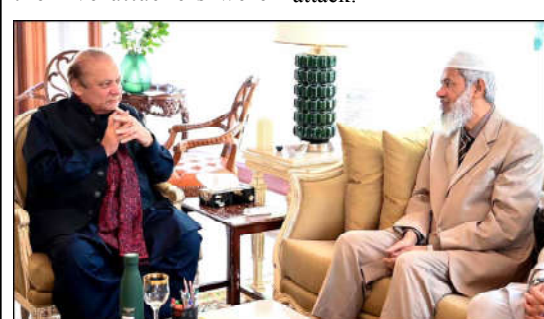
LAHORE: Renowned religious scholar Dr. Zakir Naik meeting with Quaid PML (N) Muhammad Nawaz Sharif

BANNU (APP): At least four policemen were martyred and five terrorists killed when the latter attacked Bannu police lines here on Monday, police said. The terrorists wearing "Burqa" (veil) stormed the police line and started indiscriminate firing on policemen deployed at its main gate. During the exchange of firing, which continued for about an hour. The gunshots rocked the police station, as a result, four police personnel embraced Shahadat while all the five attackers were killed. The KP Chief Minister has sought a report from police high ups of the incident. He directed the Chief Secretary and IGP KP to reach Bannu. The security forces cordoned off the police line and started search operation. The KP Governor and Chief Minister have strongly condemned the attack, emphasizing that terrorists will not undermine the police force's determination. They commended the bravery of the police for successfully thwarting the attack.