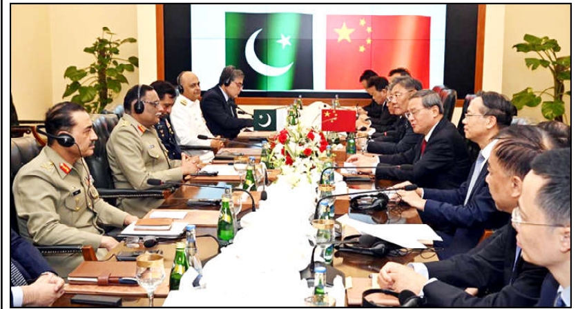
ISLAMABAD: Chinese Premier Li Qiang holding a significant meeting with Chairman of the Joint Chiefs of Staff Committee and the Service Chiefs.