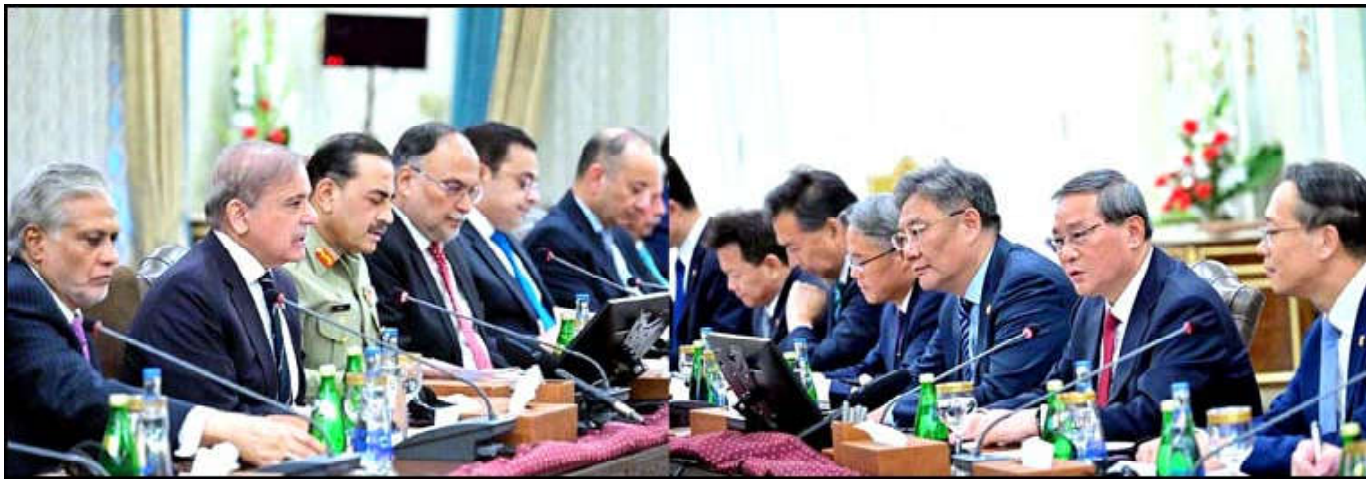
ISLAMABAD: Prime Minister Muhammad Shehbaz Sharif and Chinese Premier, Li Qiang in delegation level talks.

Vol. XIV No. 239 Reg. mails-B / ID-445 Tuesday October 15, 2024, Rabi-us-Sani 11, 1446 A.H. Ph: 2158688, 2158997 Pages 4: Rs. 12