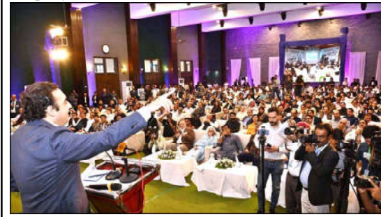
the promises made in the Charter of Democracy. He stated that the launch of the Hari Card follows the Benazir Income Support Programme and the