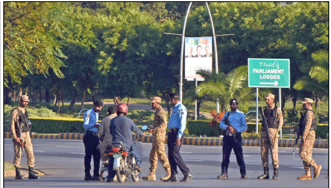
ISLAMABAD: Pak Army soldiers and police personals checking a motorcyclist in front of Parliament House at Constitution Avenue, during security high alert at "red zone" area ahead of Shanghai Cooperation Organisation (SCO) summit, in the Federal Capital.