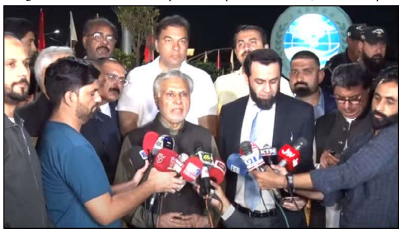
ISLAMABAD: Deputy Prime Minister and Foreign Minister Muhammad Ishaq Dar along with Federal Minister for Information and Broadcasting Attaullah Tarar talking with media men after visit to review arrangements for the upcoming CHG-SCO meeting