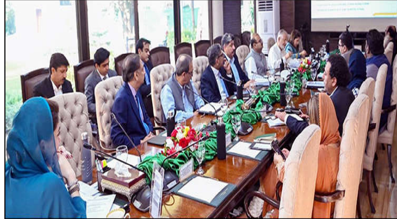
LAHORE: Punjab Chief Minister Maryam Nawaz Sharif chairs 99th Governing Body meeting of Punjab Housing and Town Planning Agency.