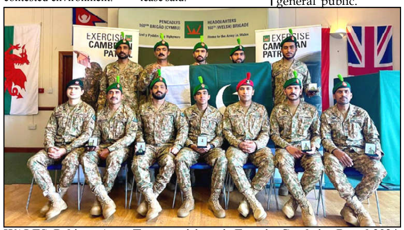
WALES: Pakistan Army Team participate in Exercise Cambrian Patrol-2024, held in Wales. This year, 128 teams from 42 Countries participated in the Exercise and out of all these teams, Pakistan Army's Team showed Exceptional Performance in the exercise and has been awarded with the Gold Medal.

This year, one hundred and twenty-eight teams from forty-two countries participated in the exercise, and the Pakistan Army's team demonstrated exceptional performance and secured the gold medal. This year, Exercise Cambrian Patrol celebrated its 65th year and has retained its demanding professional standards; patrols all across from the globe had to move tactically across inhospitable terrain, covering a distance of 60 kilometers (kms) within 48 hours, completing specialist tasks in a contested environment, an Inter Services Public Relations (ISPR) news release said.