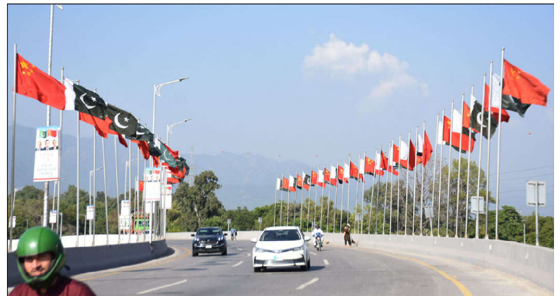
ISLAMABAD: View of Rawal Dam Chowk Flyover decorated with flags of various countries in connection with SCO Summit in the Federal Capital.

He further said, "The increasing frequency and intensity of floods, particularly the catastrophic floods of recent years, have highlighted the critical importance of preparedness and adaptation measures." "I urge all Pakistanis to take active steps to learn about disaster risks and contribute to disaster reduction efforts. By educating ourselves and others, we can save lives and protect our communities from the worst impacts of natural disasters," he said.