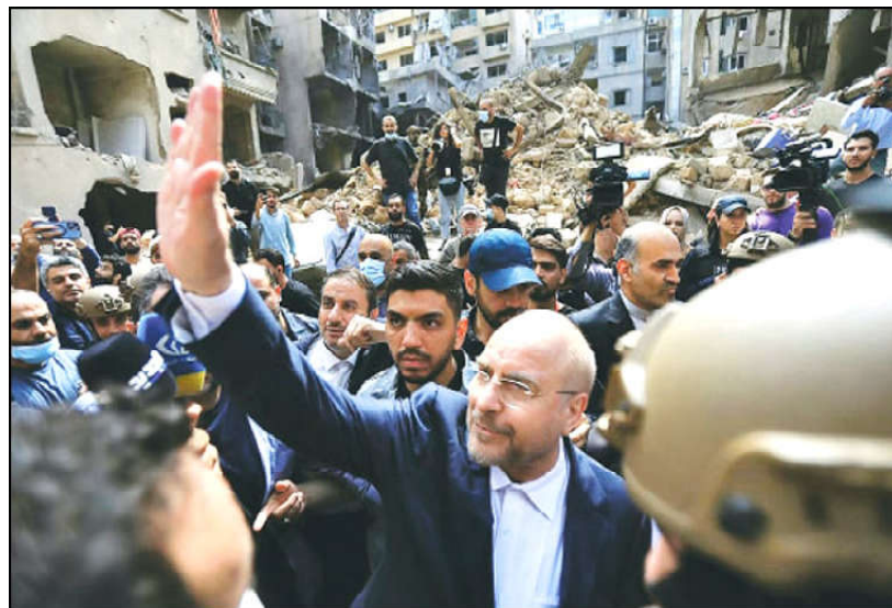
BEIRUT: Iran's Parliament Speaker Mohammad Bagher Ghalibaf waves during his visit to the site of an Israeli air strike in the Basta neighbourhood.

Monitoring Desk WARSAW: Poland plans to temporarily suspend the right to asylum as part of a strategy to limit illegal migration amidst tensions with Belarus, which Warsaw accuses of channelling migrants across its border. "One of the elements of the migration strategy will be the temporary territorial suspension of the right to asylum," Prime Minister Donald Tusk said on Saturday. "I will demand this, I will demand recognition in Europe for this decision," he told a congress held by his liberal Civic Coalition (KO) grouping, the largest member of Poland's coalition government. Tusk said the right to asylum was being used by Belarusian President Alexander Lukashenko, Russian President Vladimir Putin and by people smugglers in a way that goes against the essence of the right to asylum.