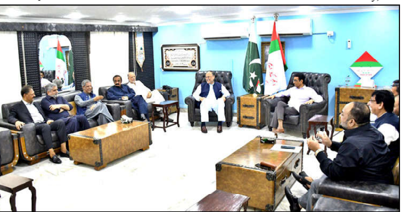
KARACHI: Pakistan Muslim League Nawaz (PML-N) delegation, led by Secretary General Ahsan Iqbal, Advisor to PM Rana Sanaullah, and Federal Minister Azam Nazeer Tarar, meets with MQM-Pakistan leadership, including Chairman Khalid Maqbool Siddiqui, at Pakistan House.

This theme invites us to reassess the competitiveness of our products in the international market," PM Office Media Wing, in a press release, quoted the prime minister as saying. In line with the commitment to public safety, health and environment, the prime minister said that he was proud to highlight that the PSQCA had developed rigorous safety standards for automotive vehicles to protect the lives of our citizens. "Noteworthy achievement is that it has set a limit of 2% on industrially produced Trans Fatty Acids (TFA) in food products, a critical step towards reducing cardiovascular diseases in Pakistan.