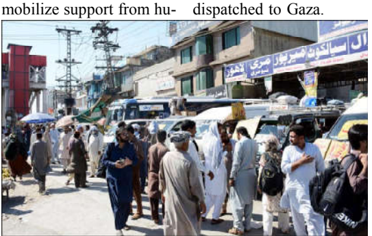
ISLAMABAD: In connection with the opening ceremony of the International Shanghai Organization, people are standing at the Faizabad bus station to go to their native areas.

plify these efforts. Minister Iqbal announced the establishment of a special account titled "Prime Minister Relief Fund for Gaza and Lebanon," created under the Prime Minister's directives to gather and channelize aid from the people of Pakistan for those in Gaza and Lebanon. The Chairman NDMA provided an overview of the humanitarian assistance