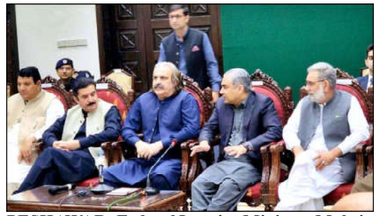
PESHAWAR: Federal Interior Minister, Mohsin Naqvi participating in Grand Jirga organised by the Khyber Pakhtunkhwa government.

tiations are essential for resolving issues, particularly in light of ongoing challenges, including the situation in Afghanistan. Referring to a recent tragic incident in district Khyber, he underscored the urgency of addressing security concerns, saying that many areas in the province are still considered no-go zones. He called for unity among all stakeholders, including the provincial and federal governments, to establish peace. The Governor emphasized the need for dialogue with those who respect the country's constitution and laws.