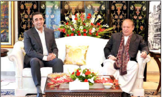
ISLAMABAD: Chairman Pakistan People's Party, Bilawal Bhutto Zardari meets with President PML-N, Mian Muhammad Nawaz Sharif at Punjab House.

cluding the record $8.8 billion sent by overseas Pakistanis. The two leaders expressed optimism about the swift relief for Pakistan and its people, calling it an auspicious sign, while also welcoming the arrival of the Saudi investor delegation and the hosting of the Shanghai Cooperation Organisation (SCO) summit in the federal capital. The two leaders agreed that these activities mark a highly positive development for Pakistan's international standing and economic progress. Nawaz Sharif stated that time has proven the 2006 Charter of Democracy (CoD) to be a historic and timely decision.