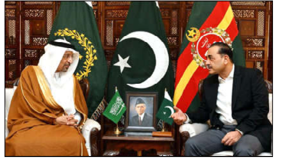
RAWALPINDI: Minister of Investment, Kingdom of Saudi Arabia, Khalid Bin Abdul Aziz Al Falih, accompanied by a high-level government cum business delegation, meet with General Syed Asim Munir, NI(M), Chief of Army Staff (COAS).

from King Salman bin Abdulaziz Al Saud and the Crown Prince Muhammad bin Salman. "Manifestation of one of the largest business delegations' visit to Pakistan reaffirms the enduring and fraternal ties between Pakistan and Kingdom of Saudi Arabia," he said. He underscored the deep respect and affection that the people of Pakistan hold for the Kingdom of Saudi Arabia. The COAS further assured the delegation of Pakistan's full support and commitment and conveyed his optimism for the promising outcomes that would mutually benefit both nations.