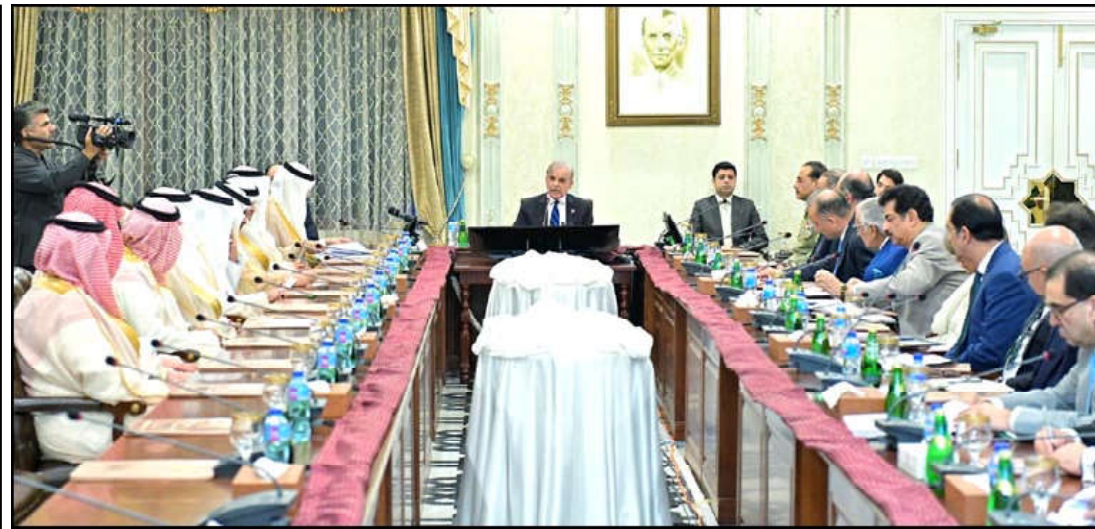
A delegation of the Kingdom of Saudi Arabia led by Investment Minister H. E. Mr Khalid Bin Abdul Aziz Al Falih called on Prime Minister Muhammad Shehbaz Sharif in Islamabad.

the 15-member Council pursuant to its resolution 1540 that requires UN member states to take specific steps to prevent the proliferation of weapons of mass destruction (WMD). "In the latest incident last August 2024, a group was found in illegal possession of a large quantity of highly radioactive and toxic substance Californium, worth US$ 100 million," he said, adding that three incidents of theft of Californium were reported also in India in 2021. These incidents, Ambassador Akram suggested the existence of a black market for sensitive materials. At the same time, the Pakistani envoy said, "While preventing non-state actors from acquiring sensitive materials, rights of