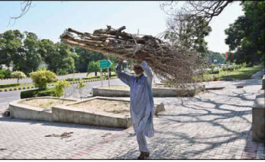
ISLAMABAD: An elderly person on the way carrying bundle of dry branches of tree for domestic use in Federal Capital.

mit is going to be held in 'Shehbaz Sharif should not take the govern-"This is not the proper time for protest in ment which does not have the capital. Using KP state people's mandate.