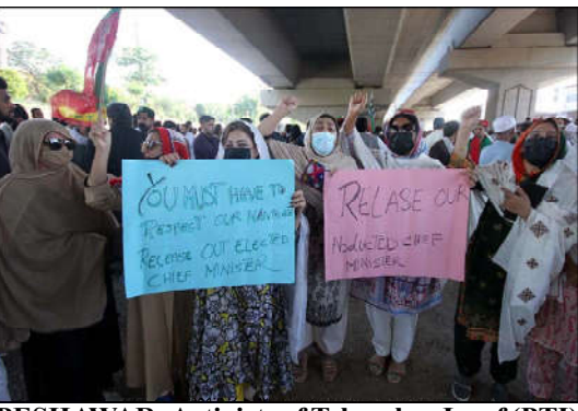
PESHAWAR: Activists of Tehreek-e-Insaf (PTI) are holding protest demonstration for release of PTI Founder Imran Khan, outside KPK Assembly in Peshawa.

Furthermore, he criticized the Chief Minister's rhetoric, questioning whether it is appropriate for a leader to respond to violence with Khyber violence.