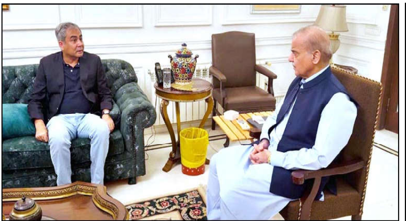
LAHORE: Interior Minister Syed Mohsin Raza Naqvi calls on Prime Minister Muhammad Shehbaz Sharif.

"They are treading course of collision. They