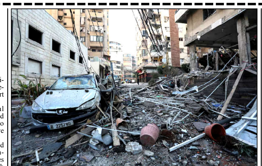
A view shows a damaged site in the aftermath of Israeli strikes on Beirut's southern suburbs, amid the ongoing hostilities between Hezbollah and Israeli forces, Lebanon.

Thunberg, 21, was part of a smaller group of demonstrators who broke away from a march organised by the United for Climate Justice movement that began outside the European Parliament. The rally was calling for the European Union headquartered in Brussels — to end subsidies for fossil fuels in order to achieve its ambitious goal of making the continent carbon neutral by 2050.