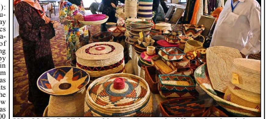
ISLAMABAD: Visitors taking keen interest in different handmade items displayed by artisans during two day "Daachi Arts & Craft Exhibition" at Pak China Friendship Centre in the Federal Capital.

shattered when a Suzuki responsible for the worsenvan carrying wedding reveling of the situation, stating lers collided with a motorthat the government had cycle in Khairpur, unleashtried to reason with him. ing a trail of devastation that but he remained unwilling left 14 innocent lives hangto listen and was oversteping in the balance, a private news channel reported.