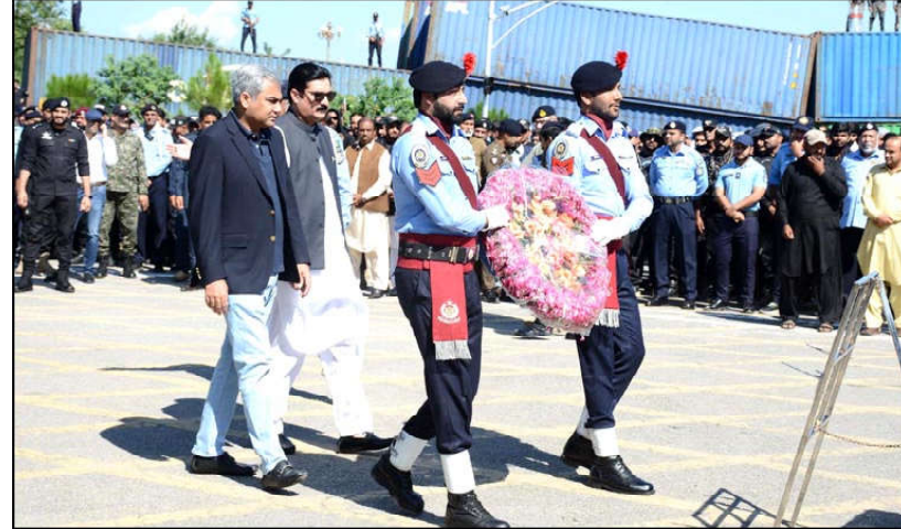
ISLAMABAD: Interior Minister Mohsin Naqvi and Governor KPK Faisal Karim Kundi laying floral wreath during the funeral of martyred constable Abdul Hameed Shah.

According to a notification issued by the Interior Ministry, the PTM is declared "unlawful" under Section 11B of the Anti-Terrorism Act of 1997. The announcement from the Interior Ministry stated that the PTM poses Is lamabad police is significantly affecting consumers, he added.