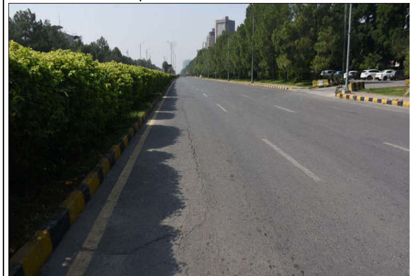
ISLAMABAD: A view of deserted roads in the Federal Capital, creating life miserable for citizens.