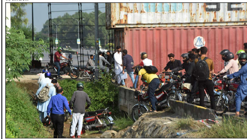
ISLAMABAD: People facing problems to reach their destination due to container placed for PTI protest.

Gilani reaffirmed Pakistan's commitment to enhancing the status of teachers, ensuring their well-being, and recognizing their pivotal role in the nation-building process.