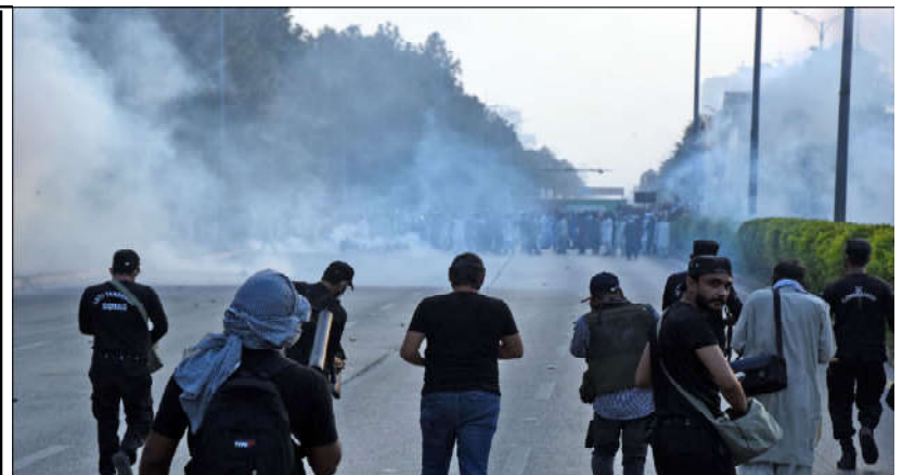
ISLAMABAD: Policemen fire tear gas shells to disperse protesters of Pakistan Tehreek-e-Insaf (PTI) party during a protest in favor of their demands at Jinnah Avenue, in the Federal Capital.

"The Government of Pakistan remains committed to honour the promise that it has made with teachers. We recognize the importance of a motivated and well-supported teaching workforce, and we will continue to invest in modern infrastructure and educational resources," he said in a message on the World Teachers Day, being observed across the globe on Saturday (October 5).