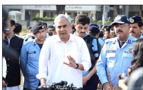
ISLAMABAD: Federal Interior Minister Mohsin Naqvi talking to media persons at D Chowk.

"This is not the right way and we will not allow this to happen," the security czar said while talking to journalists in Islamabad on Friday. With hoards of the PTI