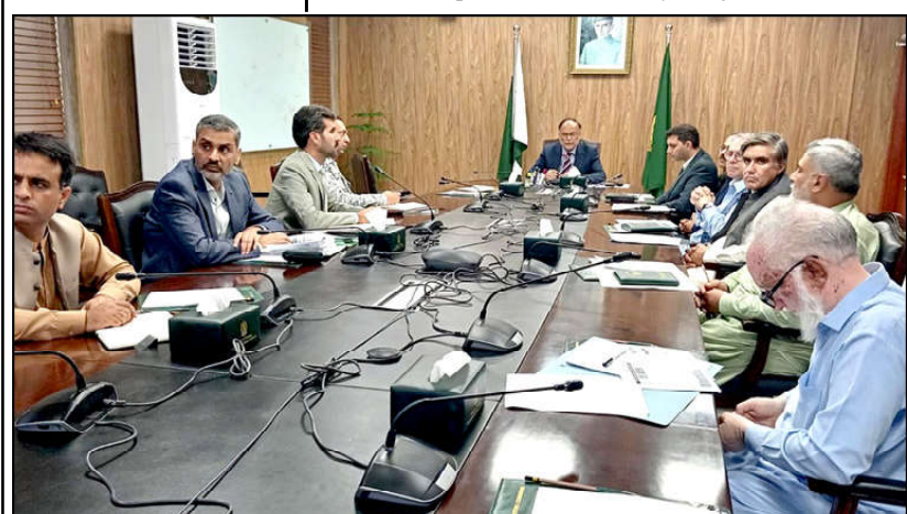
ISLAMABAD: Federal Minister for Planning, Development & Special Initiatives, Ahsan Iqbal, chairs a high-level review meeting to address the challenges hindering the development of Gwadar Port and the Free Zone.