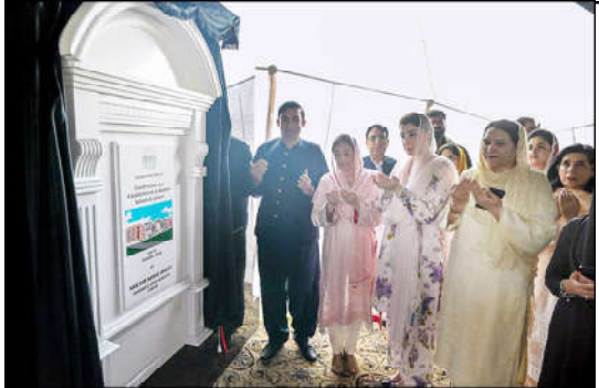
LAHORE: Punjab Chief Minister Maryam Nawaz Sharif offering Dua after inaugurating first Autism School in Pakistan.