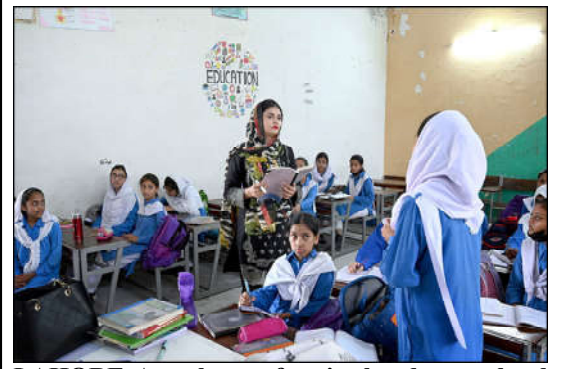
LAHORE: A teacher performing her duty at a local school as world celebrates the World teacher's Day, also known as International Teachers Day.

He said that the eligibility criteria regarding family income range had been set with the monthly income of Rs300,000 to support upper middle class families in the scholarship programme.