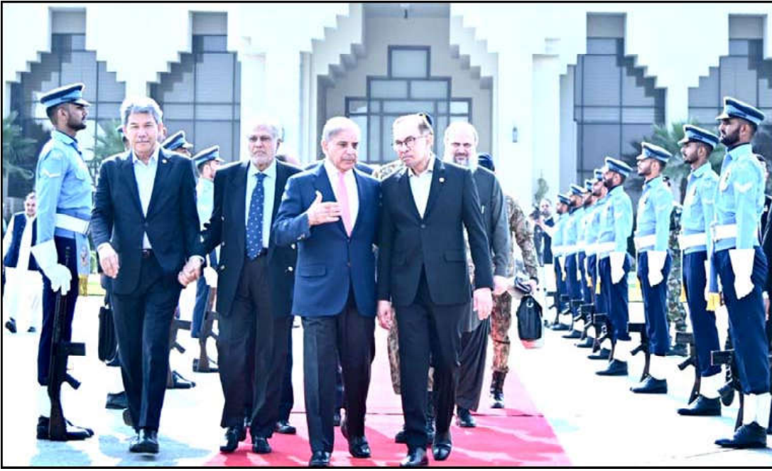
RAWALPINDI: Prime Minister, Muhammad Shehbaz Sharif bidding farewell to Prime Minister of Malaysia, Dato Seri Anwar Ibrahim before his departure at PAF Nur Khan Air Base in Rawalpindi.