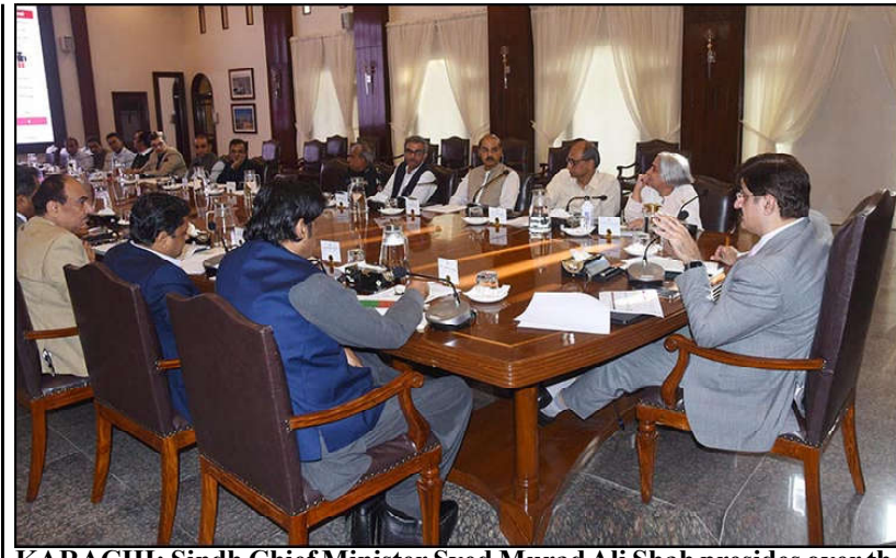
KARACHI: Sindh Chief Minister Syed Murad Ali Shah presides over the high level meeting to review anti-polio campaign.

PHC approves transit bail of CM KP till Oct 25 in two cases PESHAWAR (Online): Peshawar High Court (PHC) has approved transit bail of Chief Minister (CM) KP Ali Amin Gandapur in two cases till October 25. Transit bail plea of KP CM came up for hearing before Chief Justice (CJ) PHC Ishtiaq Ibrahim Friday. Alam Khan advocate counsel for the petitioner said CM KP Ali Amin Gandapur has filed petition for transit bail in high court.