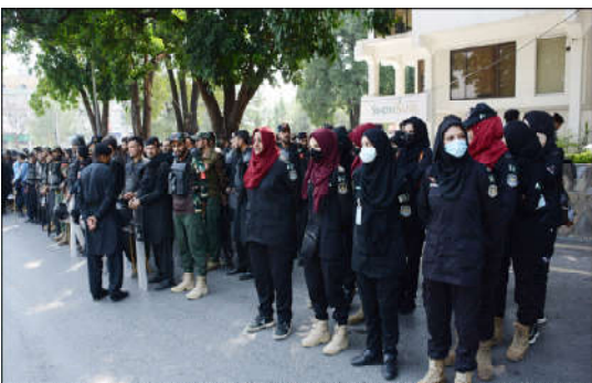
ISLAMABAD: A view of security personal stand on red zone area due to PTI anti-government protest at D Chowk.

PM Anwar Ibrahim, expressing his personal interest in Pakistan, said, "I chose Pakistan and engaged with its prime minister closely because we both see enormous untapped potential. We can learn from each other and collaborate for mutual benefit." To a question, he emphasized the importance of collaboration within the ASEAN region and beyond. "ASEAN is fortunate to be considered an economically vibrant region, and the potential is enormous."