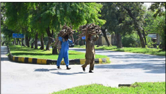
ISLAMABAD: Two men on their way carrying bundle of dry woods on head for domestic use.

The Speaker also highlighted the unwavering commitment of Parliament of Pakistan for uplifting and upholding the due respect deserved by teachers.