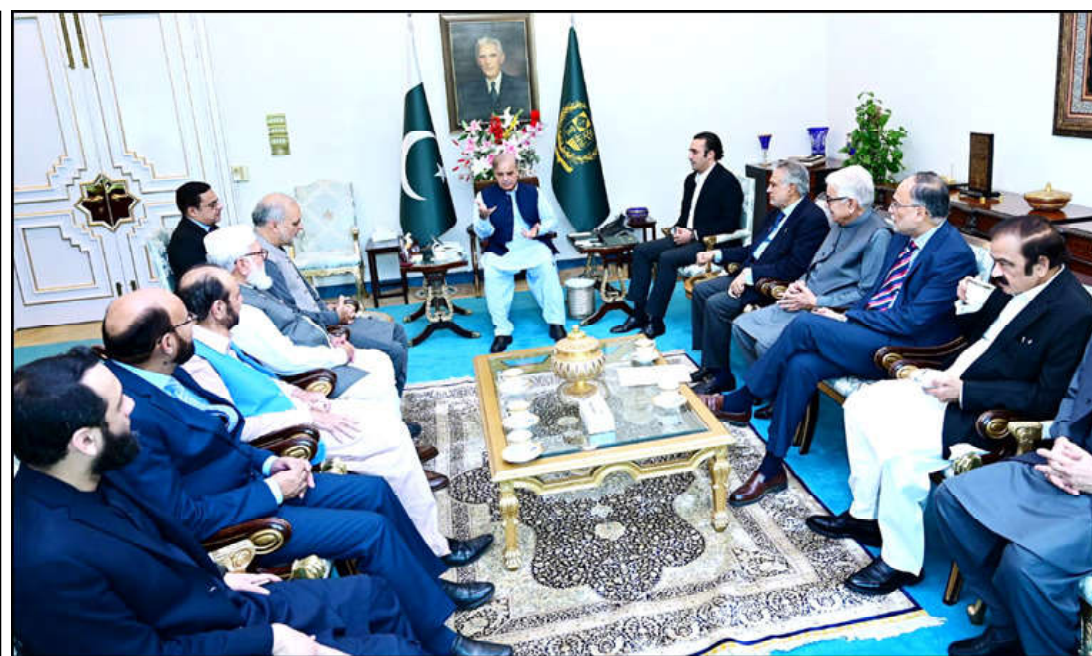
ISLAMABAD: Chairman Pakistan People's Party, Bilawal Bhutto Zardari and a delegation of Jamaat Islami led by Amir e Jamaat Islami Haafiz Naeem ur Rehman call on Prime Minister Muhammad Shehbaz Sharif.

The JI Ameer also lauded the prime minister's speech at the United Nations General Assembly for raising the issue of ongoing Israeli atrocities against Palestinians, and commended the walkout by the Pakistani delegation, led by the prime minister, at the start of the Israeli prime minister's speech.