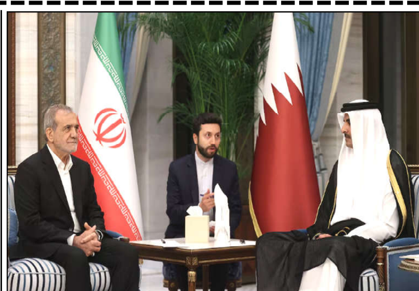
Qatar's Emir Sheikh Tamim bin Hamad al-Thani meets with Iran's President Masoud Pezeshkian, in Doha, Qatar.

After about an hour, the military announced there was no longer a threat and "it was decided that it is now permitted to leave protected spaces in all areas across the country", with a "large number" of Iranian missiles intercepted. Reports said between 150 and 200 missiles had been fired in the attack. It was Iran's second on Israel after a missile and drone attack in April in response to a deadly Israeli air strike on the Iranian consulate in Damascus. Israel vowed to retaliate with an army spokesman saying it would respond at the time and place of its choosing. "This attack will have consequences. We have plans, and we will operate at the place and time we decide," said Israeli military spokesman Rear Admiral Daniel Hagari.