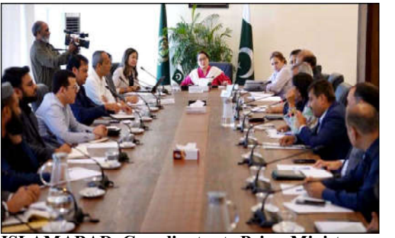
ISLAMABAD: Coordinator to Prime Minister on Climate Change Romina Khurshid Alam chairs a high-level meeting on the Country Programme Framework 2024-28 with the Global Green Growth Initiative in the M/o Climate Change & Environmental Coordination.

He also recalled his year meeting with Dr Zakir Naik in 2006.