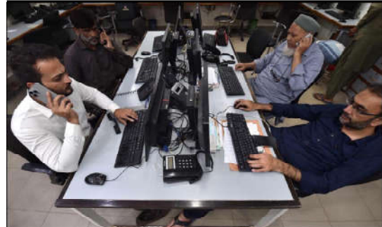
KARACHI: Pakistani stockbroker monitors the share prices during a trading session at the Pakistan Stock Exchange (PSX) in Karachi.

A total of eight ships were engaged at POA berths during the last 24 hours, out of them three ships, MSC Positano, Maersk Kinloss and Ice Fighter are expected to sail on today. Cargo volume of 95,743 tonnes, comprising 41,664 tonnes imports cargo and 54,079 tonnes export cargo carried in 3,919 Containers.