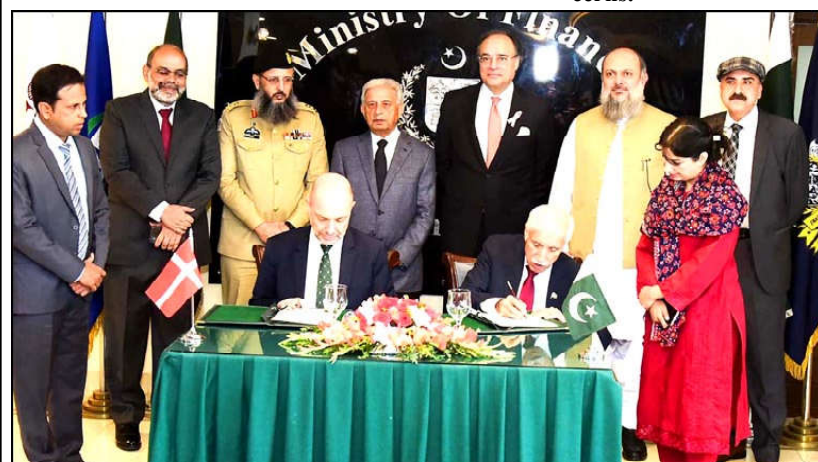
ISLAMABAD: Federal Minister for Maritime Affairs Qaiser Ahmed Shaikh signed the MoU on behalf of Government of Pakistan with Danish Government. Finance Minister for Finance and Revenue Muhammad Aurangzeb, Federal Minister for Commerce Jam Kamal and Federal Minister for Industries Rana Tanveer were present on the occasion.

DERA MURAD JAMALI (INP): An armed attack on the district jail in Dera Murad Jamali resulted in the deaths of two inmates and left three others injured on Wednesday. The assailants opened fire on the jail, creating chaos within the facility. During the confrontation, one of the attackers was wounded and subsequently arrested by the jail authorities.