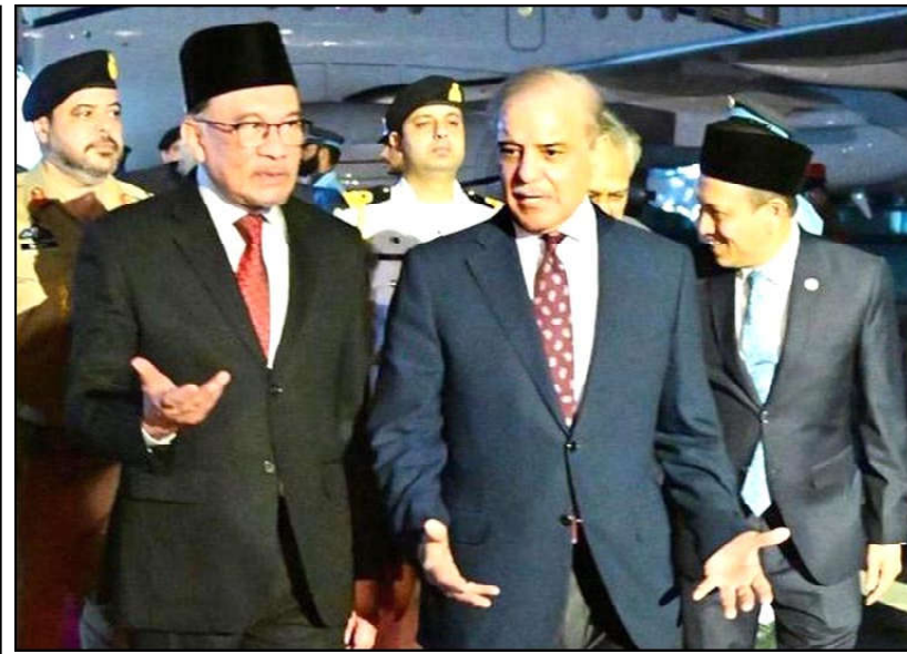
Prime Minister Muhammad Shehbaz Sharif welcoming the prime Minister of Malaysia Dato' Seri Anwar Ibrahim upon his arrival on a 3-day official visit at Islamabad.