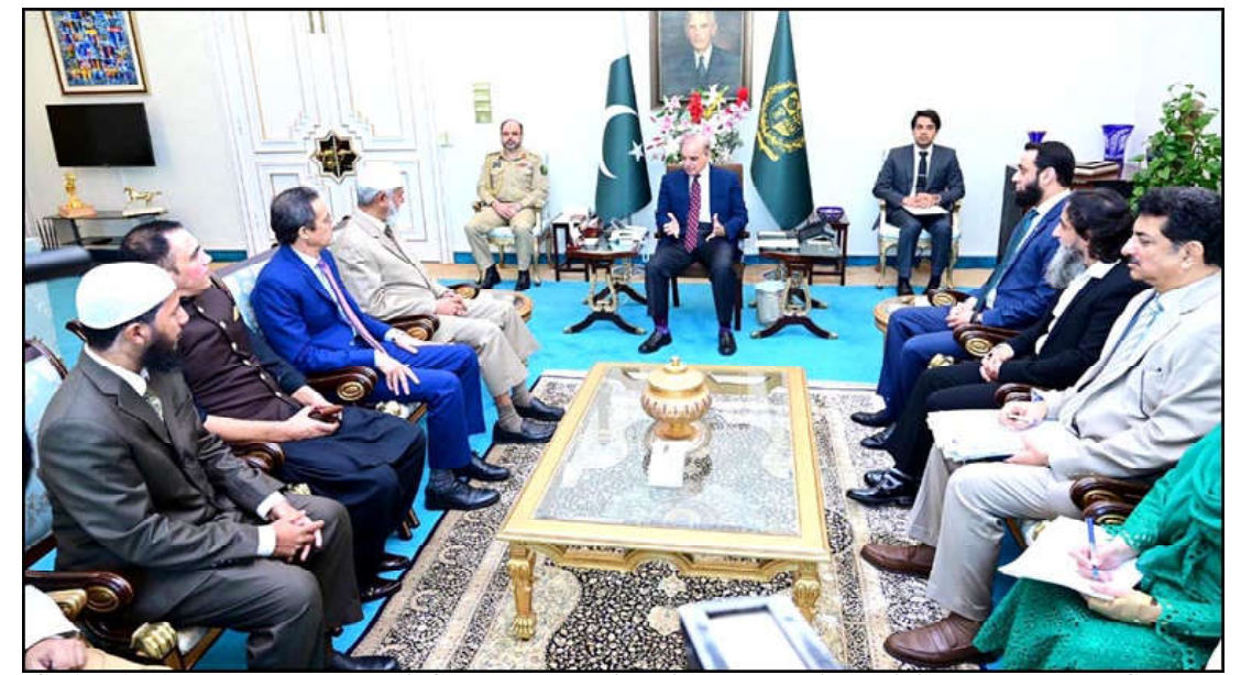
ISLAMABAD: Renowned Islamic Scholar Dr. Zakir Naik calls on Prime Minister Muhammad Shehbaz Sharif.

The complainant then filed a representation with the president against the orders of the Mohtasib. In his decision, the president observed that the complainant's father expired in 1999 during service and at that time the petitioner was only six years of age. He noted that the petitioner applied for appointment, after coming of age, under the policy of 2005, according to which the son of a deceased employee was to be considered for appointment in the same department without undergoing the formality of advertisement.