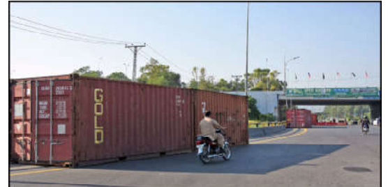
ISLAMABAD: A view of heavy shipping containers placed alongside Islamabad Highway near zero point due to PTI protest on October 4, Friday, in the Federal Capital.

Rana Sanaullah has strongly criticized Pakistan Tehreek-e-Insaf (PTI) for its undemocratic attitude, stating that they are unwilling to engage with the government and are not serious about addressing public issues.