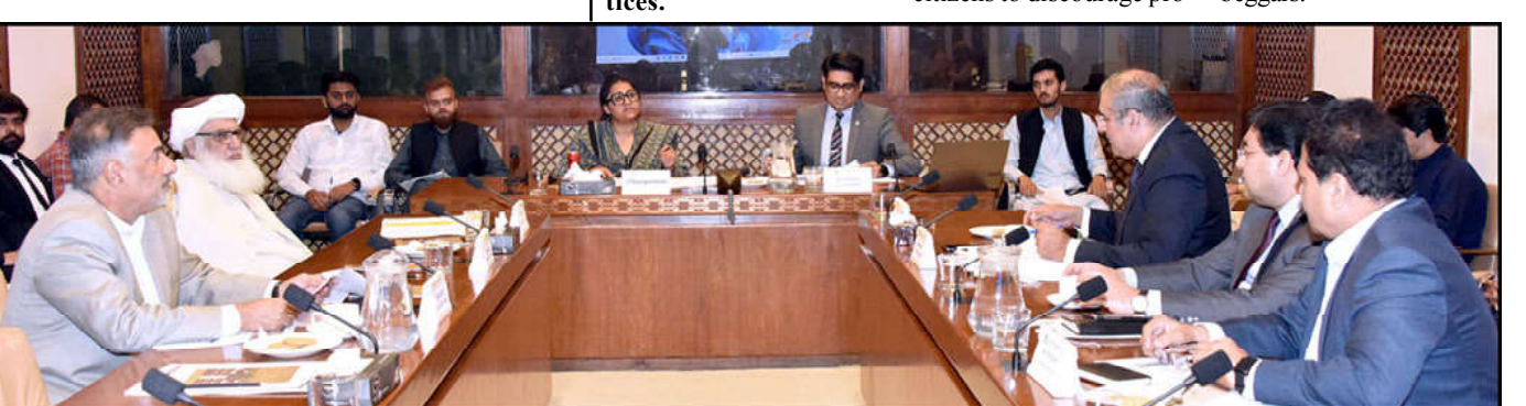
ISLAMABAD: Senator Qurat Ul Ain Marri, Chairperson Senate Standing Committee On Planning, Development And Special Initiatives presiding over a meeting of the committee at Parliament House.

Instead, he encouraged people to support recognized charitable organizations that work to address poverty and provide assistance to those in need. The district administration has also requested the cooperation of citizens in reporting professional beggars.