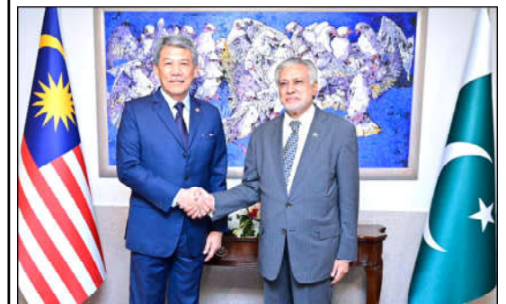
ISLAMABAD: Deputy Prime Minister and Foreign Minister Senator Mohammad Ishaq Dar welcomes the Foreign Minister of Malaysia Dato Seri Utama Haji Mohamad Bin Haji Hasan, on his arrival at the Ministry of Foreign Affairs.

ISLAMABAD (INP): Finance Minister Muhammad Aurangzeb has reaffirmed the government's commitment to privatising Pakistan International Airlines (PIA) and three power distribution companies (Discos) before the end of 2024. In a media interview he said that the incumbent government will complete the privatisation of the national carrier along with three power distribution companies (Discos) before 2024 culminates. The privatisation of PIA, initially set to conclude by October 1, has been postponed to October 31 due to low bidder interest, ongoing court cases, aging fleet issues, and civil aviation concerns.