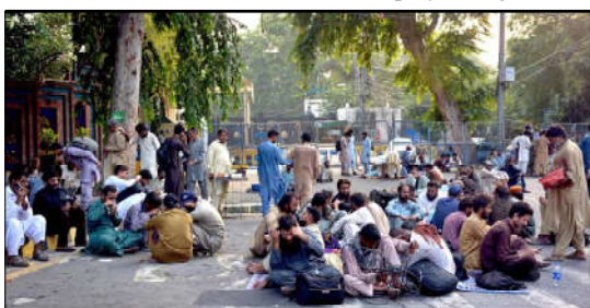
LAHORE: Disabled blind persons are holding protest demonstration for demanding employment, outside CM House in Lahore.