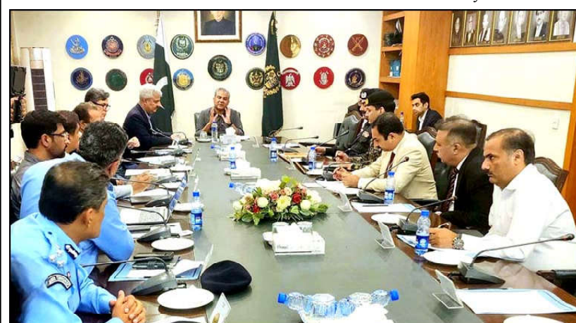
ISLAMABAD: Federal Minister for Interior Mohsin Naqvi chairing a meeting regarding preparation of SCO Summit.

ISLAMABAD (APP): Pakistan on Wednesday expressed deep concern over the escalating hostilities in the Middle East, urging all parties to prioritize peace. "In recent months, Israel has increasingly acted in violation of international law and the UN Charter resulting in grave humanitarian crisis. Israel has endangered regional peace and security with the ongoing genocide in Gaza. The recent invasion of Lebanon has further intensified these tensions, affecting the lives of innocent civilians," the Foreign Office Spokesperson said in a press statement. The people of Palestine, Lebanon, and the wider region deserved to live free from fear and violence. It was crucial for all sides to step back from the brink and for the international community to take swift action to de-escalate the situation.