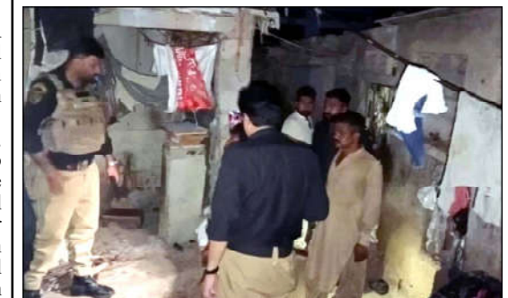
KARACHI: Police officials carry out the combing search operation against criminals as security has been tightened in city due to security reasons, at Dalmia area in Karachi.