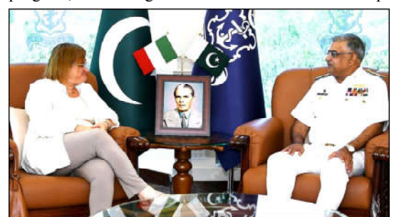
ISLAMABAD: Chief of the Naval Staff Admiral Naveed Ashraf exchanging views with Italian Ambassador Marilina Armellini at Naval Headquarter.

QUETTA (INP): Security forces personnel have killed six top terrorists belonging to banned Balochistan Liberation Army (BLA) during a major intelligence-based operation in Harnai area of Balochistan. According to sources, security forces successfully conducted the intelligence-based joint operation against BLA hideouts on September 12, 2024 in Harnai region of Balochistan. According to reliable sources in BLA, as a result of the operation, six important terrorists of BLA were gunned down in the operation. The slain terrorists were identified as Shafu Samalani alias Tadin, Sarmad Khan alias Dasteen, Muhammad Gul Murri alias Wahid Baloch, Ghulam Qadir Murri alias Anjeer Baloch, Ubaid Baloch alias Fida and Taj Muhammad alias Babul, the sources added. Meanwhile, Interior Minister Mohsin Naqvi paid rich tribute to the security forces for the successful intelligence-based operation against the banned BLA in Harnai. In his message, the Interior Minister said that the security forces once again carried out a successful operation and killed six terrorists.