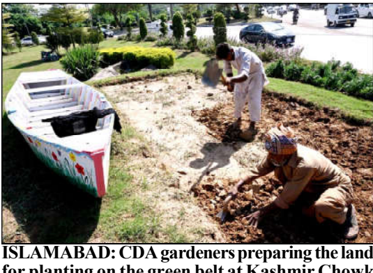
for planting on the green belt at Kashmir Chowk in the Federal Capital.

pride in the capabili-ties demonstrated by women in Khyber Pakhtunkhwa across various sectors, saying that their participation in the police force is a testament to the province's progress will run awareness towards a more equi-