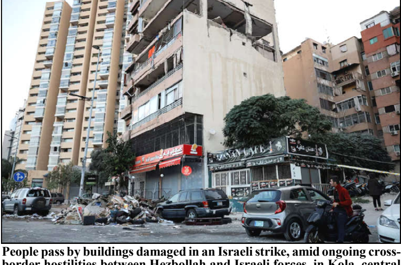
border hostilities between Hezbollah and Israeli forces, in Kola, central

journalist, said the area Sri Lanka last recorded where she lives was still deflation in October 1985 safe but she decided to with a figure of negative leave as a precaution. 2.1pc. Inflation peaked at 69.8pc two years ago at the "We don't want to live (with) the stress, so l height of an unprecedented prefer to come to Istanbul, economic crisis in the island stay for a while, watch nation. Acute shortages of what will happen," she food, fuel and medicines led said waiting for luggage. to months of protests that "Hopefully we go back eventually forced then-president Gotabaya Rajapaksa.