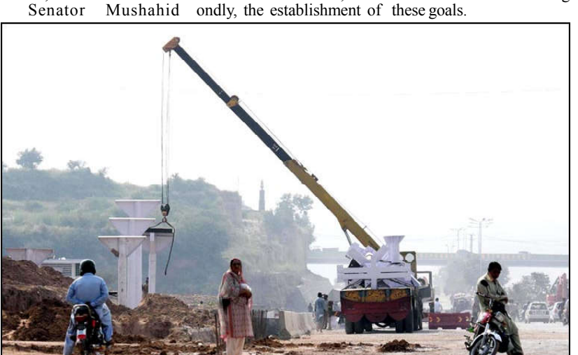
ISLAMABAD: Heavy machinery being used to install a pedestrian bridge on Islamabad Expressway.

"To ensure this is as macy, besides promoting in- to link tourism, culture, and media effectively. Establish-Firstly, he recommended ing a Task Force dedicated