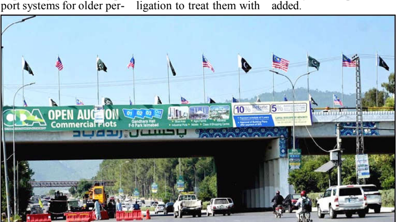
ISLAMABAD: Flags of Pakistan and Malaysia adorn Zero Point Interchange, welcoming Malaysia's Prime Minister Datuk Seri Anwar Ibrahim for his first official visit to Pakistan in the first week of October.

"As populations age, they become dependent and their need for specialized care increases, and therefore, it is imperative to provide affordable and accessible medical facilities to our elderly," the president