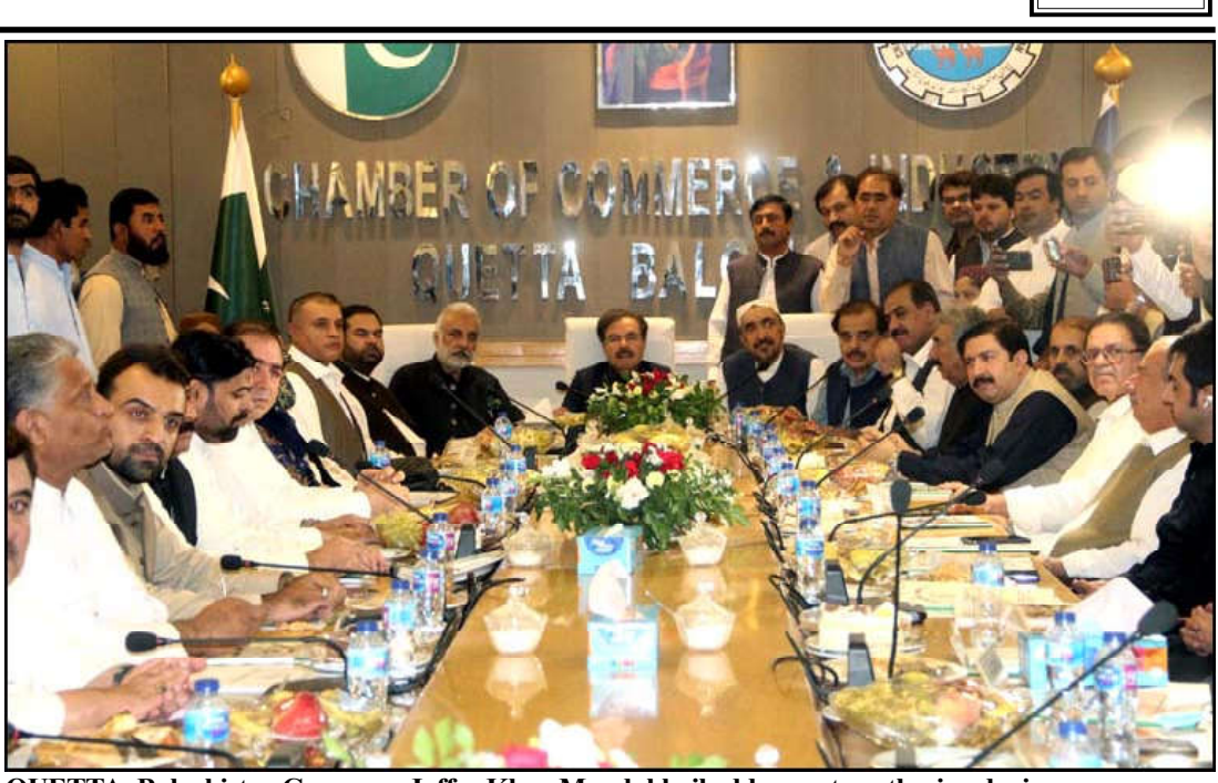
OUETTA: Balochistan Governor, Jaffar Khan Mandokhail addresses to gathering during ceremony on his visit to Quetta Chamber of Commerce and Industry (QCCI) in Quetta.

Regarding the declining trade with Afghanistan, the minister emphasized the need to address the issue in order to improve access to Central Asian markets. The virtual meeting ended with a shared understanding of the urgency to resolve the business community's challenges and to work towards sustainable solutions that would bolster industrial growth and increase Pakistan's trade footprint regionally and globally.