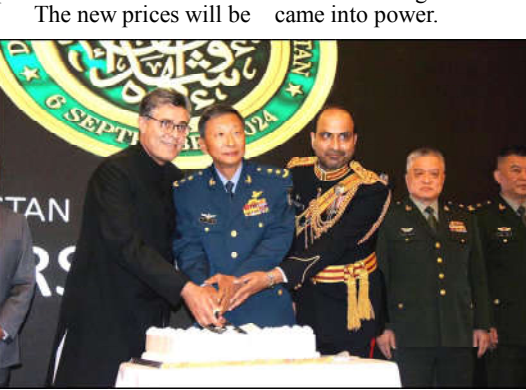
Khalil Hashmi with Air Marshal Jia Zhigang, Deputy Commander Peoples Liberation Army (Air Force) of China cutting the cake at a solemn ceremony commemorating Defence & Martyrs Day honoring the bravery and sacrifices of the Pakistan Armed Forces.

On the directions of Prime Minister Shehbaz Sharif, government has reduced the price of petrol by 28.57 rupees and diesel by 37.51 rupees during last two months. The fruits of the reduction of petroleum products are being transferred to the masses. The Prime Minister has been consistently focusing on providing relief to the people since the incumbent government