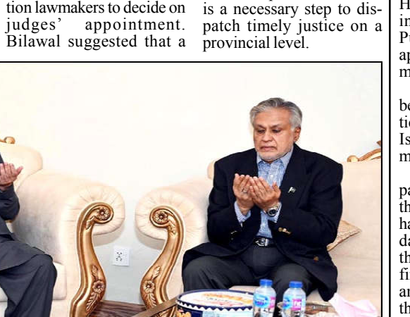
President Asif Ali Zardari offering Fateha over the sad demise of the brother of Deputy Prime Minister and Foreign Minister, Senator Mohammad Ishaq

He was of the view that not only in Islamabad, forming a parliamentary constitutional courts should also be established in provinces which tion lawmakers to decide on is a necessary step to dis-