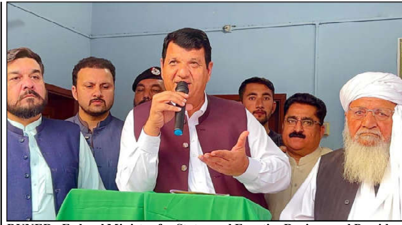
BUNER: Federal Minister for States and Frontier Regions and President PML-N KP, Engr Amir Muqam addressing Jirga Members in Buner.