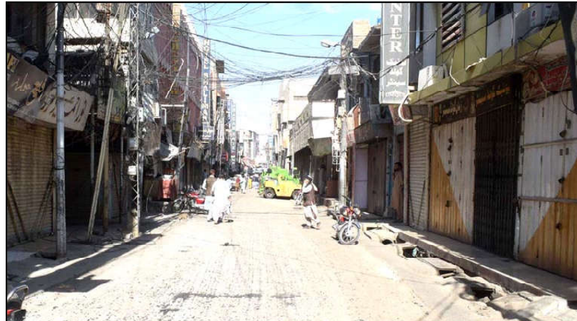
QUETTA: A view of closed shop during a shutter down strike call by Balochistan National Party.