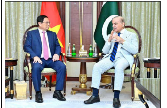
RIYADH: Prime Minister Muhammad Shehbaz Sharif meets Prime Minister Pham Minh Chinh of Vietnam on the sidelines of the 8th Future Investment Initiative (FII) Conference.

change of trade and business delegations between both countries to further explore these opportunities. The two leaders reaffirmed their commitment to strengthening people-to-people ties and promoting tourism between the two countries. Appreciating Vietnam's role in the ASEAN region, Prime Minister Shehbaz sought support for Pakistan's efforts to become a full dialogue partner of ASEAN. He also extended an invitation to the Vietnamese prime minister to undertake an official visit to Pakistan.