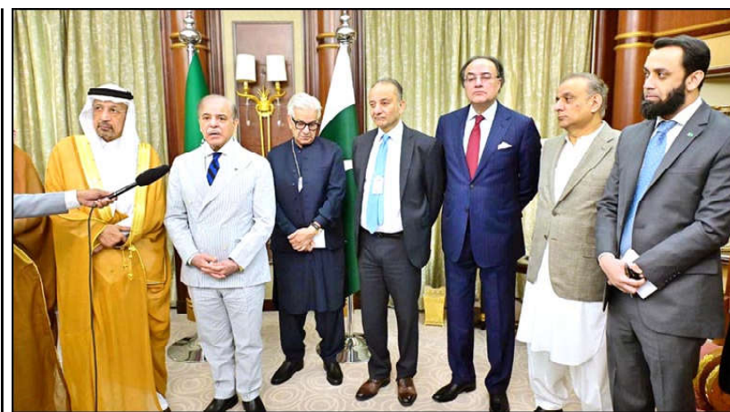
RIYADH: Prime Minister Muhammad Shehbaz Sharif, Minister for Investment of the Kingdom of Saudi Arabia Engineer Khalid bin Abdulaziz Al-Falih and Advisor at the Saudi Royal Court Mohammad Bin Maziyad Al-Tuwajri in a joint press conference on the sidelines of the 8th Future Investment Initiative Conference.

He said that some of the MoUs had resulted in exports from Pakistan in agriculture and other fields.