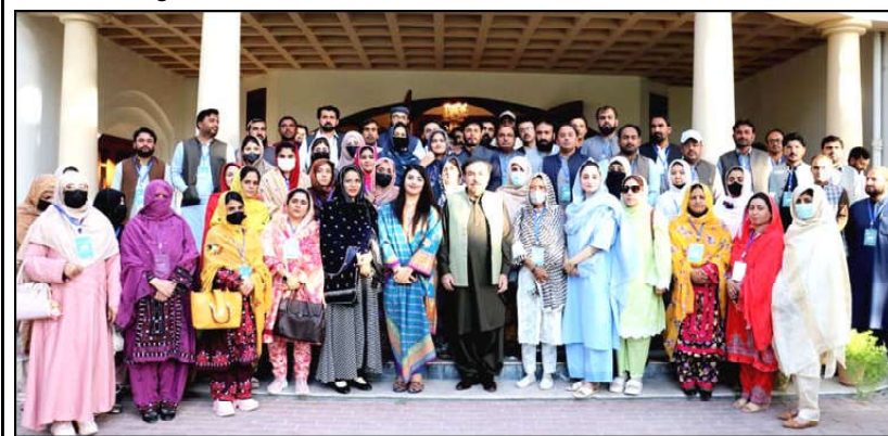
QUETTA: Balochistan Governor Jaffar Khan Mandokhail in a group photo with participants of "Safar Moulim" workshop organized by Voice of Balochistan.

He said that the present government is focusing on the education sector and as such is taking measures to decorate the students with ornament of education. The Governor exhorted the teachers and parents to pay attention on their upbringing and morality along with their education. He also stressed that the process of capacity building of the teachers should remain continued in the educational institutions.