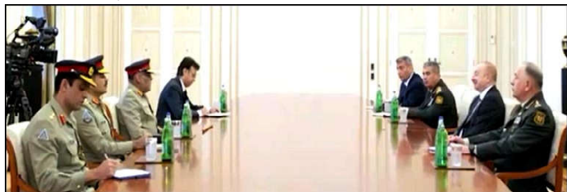
RAWALPINDI: Chairman Joint Chiefs of Staff Committee (CJSC) General Sahir Shamsahd Mirza called on Azerbaijan President Ilham Aliyev.

ISLAMABAD (INP): Supreme Court of Pakistan Justice Athar Minallah has said that although Article 19 A of the constitution guarantees citizens the right to access to information, but the right is subject to certain limitations. In his additional note on the petition, seeking access to information about the SC employees, the judge has said that despite some restrictions, however, the parliament does not have the power to limit the scope of this constitutional right. The judge, while saying he completely agrees