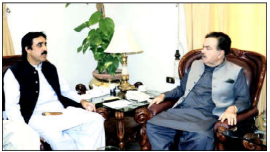
QUETTA: Provincial Minister for Food Noor Muhammad Dummer meeting with Balochistan Governor Jaffar Khan Mandokhail.

The Governor said that the University is that center of research and innovation where new ideas are created and sustainable solution to the collective nature problems is found out. He said that nevertheless, Gwadar deep seaport has potential of becoming an important supply center for promotion of economic and trade development and prosperity in the region. Therefore, we should give more priority to the steps of blue economy for sustainable coastal development, adding he stressed. In addition to this, it is very necessary to encourage the methods of water agriculture for promoting food security and sea trade. The Governor stressed the need to expand circle of courses of the information technology and life skills in the premises.