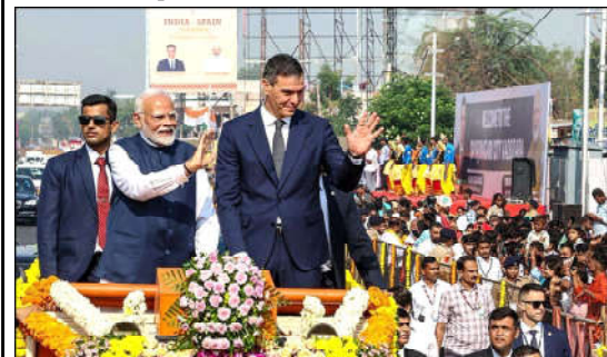
Spanish Prime Minister Pedro Sanchez with his Indian counterpart Narendra Modi waving to crowd in India's Gujarat.

Monitoring Desk UNITED NATIONS: United Nations Secretary-General Antonio Guterres appealed to the Security Council on Monday for its support to help protect civilians in war-torn Sudan, but said conditions are not right for deployment of a UN force. "The people of Sudan are living through a nightmare of violence — with thousands of civilians killed, and countless others facing unspeakable atrocities, including widespread rape and sexual assaults," Guterres told the 15-member council. War erupted in mid-April 2023 from a power struggle between the Sudanese army and the paramilitary Rapid Support Forces ahead of a planned transition to civilian rule, and triggered the world's largest displacement crisis. "Sudan is, once again, rapidly becoming a nightmare of mass ethnic violence," Guterres said, referring to a conflict in Sudan's Darfur region about 20 years ago that led to the International Criminal Court charging former Sudanese leaders with genocide and crimes against humanity.