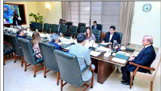
ISLAMABAD: Prime Minister Muhammad Shehbaz Sharif chairs a meeting on Polio Eradication.

polio campaign. Additionally, he emphasized the need to develop a comprehensive strategy to address the immunity gap. In the meeting, the prime minister was briefed on recent polio cases and the eradication campaign. Currently, the number of active polio cases in the country stands at 41, out of which 25 such cases whom routine immunization coverage is not better. The briefing also highlighted that the spread of polio was lower in areas with better vaccination rates. The meeting was attended by Prime Minister's Coordinator for National Health Dr. Mukhtar Ahmed Bharath, Prime Minister's Polio Focal Person Ayesha Raza Farooq, and relevant senior government officials.