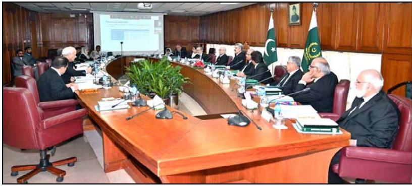
ISLAMABAD: The Hon'ble Chief Justice of Pakistan Justice Yahya Afridi presides over Full Court meeting at Supreme Court of Pakistan.

Ph: 284 1470/2841473 Vol: XIX No. 237, Rabi-us-Sani 25, 1446 AH Tuesday October 29, Pages 04, Price Rs.15