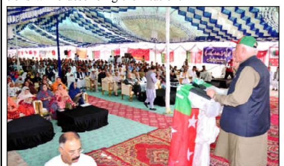
QUETTA: National Party (NP) Chief, Dr. Abdul Malik Baloch addresses during 7th National Congress and Balochistan Wahdat Convention held in Quetta.

ISLAMABAD (Online): Speaker National Assembly Sardar Ayaz Sadiq has called for unified global action to address challenges being faced by the world community. He was addressing inaugural ceremony of 45th Annual Forum of Parliamentarians for Global Action in Islamabad Monday. The Speaker said climate change is a looming threat which requires concerted international efforts. Highlighting the plight of innocent Palestinians in Gaza, the Speaker said every Parliamentarian should raise his voice in every Parliament of the world to end these atrocities. He said dialogue is the only way out to resolve issues and even end wars. Sardar Ayaz Sadiq urged all participants to actively engage in discussions and chalk out a way forward so they can raise the issues discussed at their respective parliaments. Parliamentarians from 39 countries, international jurists, intellectuals, media personnel and civil society representatives are attending the forum.