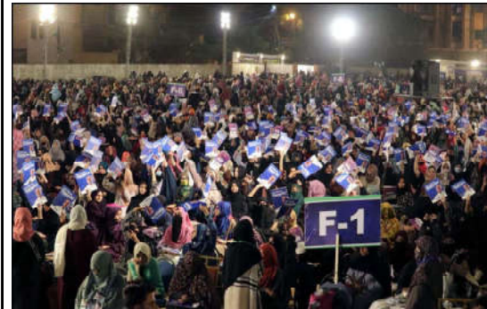
KARACHI: A large number of students gather to attend Aptitude Test Examination ceremony of the IT courses program under "Bano Qabil Mega Project 4.0" organized by Al-Khidmat Foundation, held at North Karachi Hockey Stadium in Karachi.