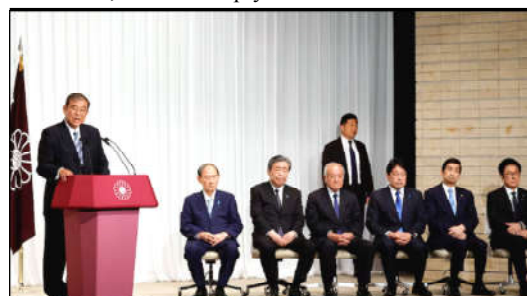
Japanese Prime Minister and leader of the ruling Liberal Democratic Party (LDP) Shigeru Ishiba speaks next to LDP lawmakers during a press conference a day after Japan's lower house election, at the party's headquarters in Tokyo, Japan.

Monitoring Desk BRUSSELS: NATO on Monday confirmed that North Korean troops have been sent to Russia to aid in its almost three-year war against Ukraine and that some have already been deployed in Russia's Kursk border region, where Russia has been struggling to push back a Ukrainian incursion. "Today, I can confirm that North Korean troops have been sent to Russia, and that North Korean military units have been deployed to the Kursk region," NATO Secretary-General Mark Rutte told reporters. Rutte said that the move represents "a significant escalation" in North Korea's involvement in the conflict and marks "a dangerous expansion of Russia's war." His remarks came after a high-level South Korean delegation including top intelligence and military officials as well as senior diplomats briefed the alliance's 32 national ambassadors at NATO headquarters in Brussels. Rutte said NATO is "actively consulting within the alliance, with Ukraine, and with our Indo-Pacific partners," on developments and that he is due to talk soon with South Korea's president and Ukraine's defense minister. "We continue to monitor the situation closely," he said.