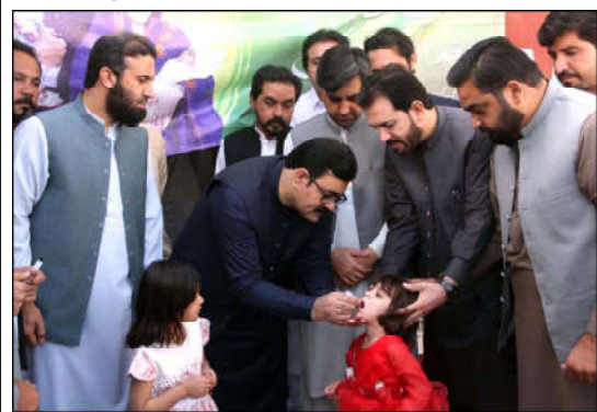
QUETTA: Balochistan Minister for Health, Bakht Muhammad Kakar administers polio drops to child during the launching ceremony of Polio Eradication Campaign in Quetta.

10 to 93. He said over time, the passport offices increased to 223 while Pakistan's missions abroad surged to 93. However, he said the passport production facility was never expanded nor equipped with the technology or equipment to make the printing process "faster and better." "Presently, the department is facing a very high trend of daily passport applications around 45,000 to 50,000 thousand from field formations, whereas, the production facility can merely cater for 20,000 to 22,000 passports per day," Naqvi said. "Resultantly, the routine backlog is being accumulated."