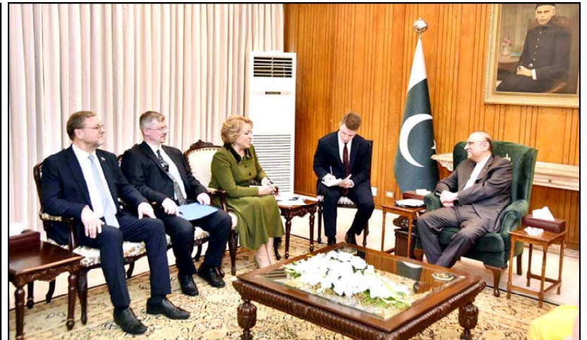
ISLAMABAD: The Russian Parliamentary delegation, led by the Speaker of the Russian Federation Council, Ms. Valentina Matvienko, at Aiwan-e-Sadr.