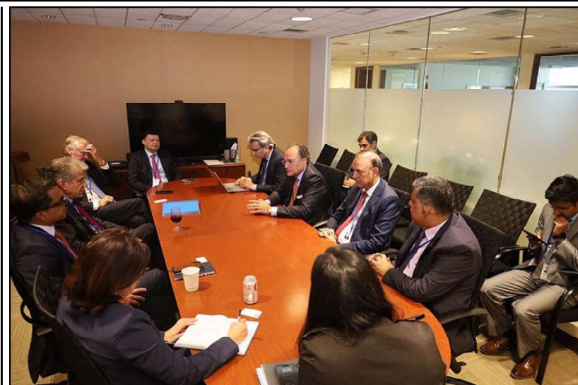
WASHINGTON DC: Federal Minister for Finance and Revenue Senator Muhammad Aurangzeb, accompanied by Governor SBP, held a meeting with the lead team of JP Morgan Bank.

The exchange rate of the Emirates Dirham and the Saudi Riyal decreased by 05 paise and 07 paise to close at Rs 75.59 and Rs73.91 respectively.