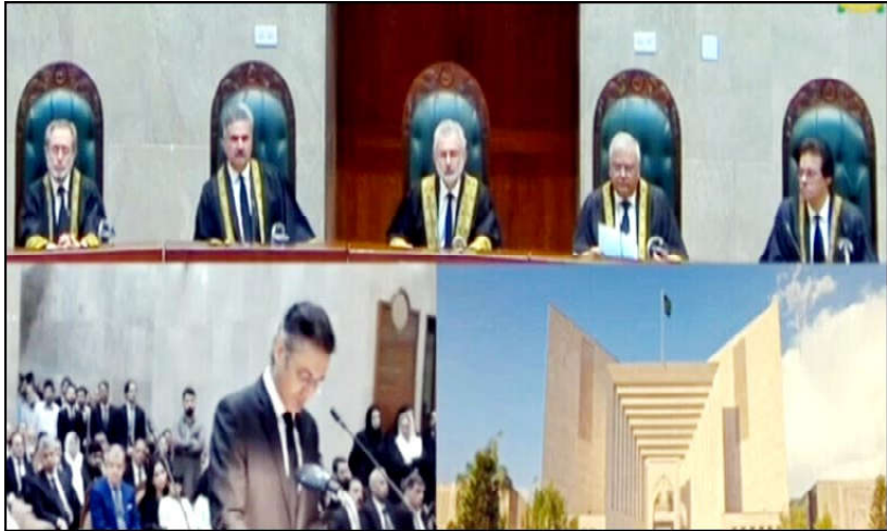
ISLAMABAD: Attorney General Mansoor Usman speaking before a full court reference held at Supreme Court in honour of outgoing Chief Justice of Pakistan Justice Qazi Faez Isa.

Ph: 2841470/2841473 Vol: XIX No. 235, Rabi-us-Sani 22, 1446 AH Saturday October 26, Pages 04, Price Rs.15