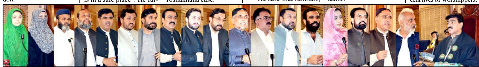
QUETTA: Provincial Ministers, Parliamentary Secretaries and MPs expressing their views on resolutions presented in Balochistan Assembly session

criminate fire on the CTD team, forcing officials to return the fire and killing them on the spot, while several other terrorists managed to escape from the scene, the officials said, adding that a search operation has been launched for the arrest of the fleeing terrorists. "All officers and men of the CTD and the Elite police remained safe in the firing," he said. "A search continued in the area, while efforts were afoot to identify the deceased terrorists," he added. Punjab police chief congratulated the Mianwali police on the successful operation against terrorists.