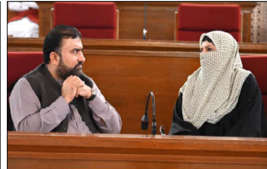
QUETTA: MPA Shahida Rauf meeting with Chief Minister Balochistan Mir Sarfaraz Ahmed Bugti during Assembly session.

LAHORE (INP): Pakistan Muslim League (PML-N) President and former three-time prime minister Mian Nawaz Sharif left Lahore for Dubai on Friday. Nawaz Sharif travelled to Dubai by Emirates flight EK-625 which took off at 9.04 am. He will land in Dubai at 11:25 am local time. After one-day stay in Dubai, the PML-N president will proceed to London, where he is expected to hold important meetings. On October 29, Nawaz Sharif will depart London for a four-day visit of the United States. According to sources, Punjab Chief Minister Maryam Nawaz will also travel to London in the first week of November. After a few days' stay in London, both Nawaz Sharif and Maryam will tour different European countries. The former prime minister will also undergo medical check-up in London.