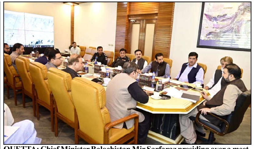
QUETTA: Chief Minister Balochistan Mir Sarfraz Bugti presiding over a meeting regarding anti-encroachment and operation against land grabbers across the province

MIRPUR-AJK (APP): Azad Jammu and Kashmir (AJK) President Barrister Sultan Mehmoed Chaudhry has stressed the need for a unified stand on the Kashmir issue. Addressing a dinner hosted in honor of heads of various political parties in the state capital on Thursday, AJK President said the leadership across the political spectrum must come together to effectively promote the Kashmir cause. "There is a dire need for the top leadership representing different political and religious parties to rise above partisan politics and work together for the freedom movement of Kashmir," the president said. He noted that with the main Hurriyat Conference leadership languishing in Indian jails, "it is our shared responsibility to become a voice for the voiceless Kashmiri brothers and sisters". Referring to the growing importance of social media, the AJK president said these platforms could be used to expose India's "brutal face" and human rights violations against the Kashmiri people. The event was attended by AJK Prime Minister Chaudhry Anwar ul Haq, Speaker Chaudhry Latif Akbar, former Prime Ministers Raja Muhammad Farooq Haider Khan and Sardar Atiq Ahmad Khan and other senior political leaders.