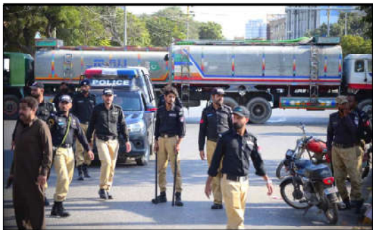
KARACHI: View of road leads towards CM House and red zone area seen closed while police officials stand alert to avoid untoward incident due to rally of Tehreek-e-Labbaik (TLP), in Karachi.

million, while families of SPs and SSPs will see an increase of Rs. 12 million. Families of DIGs and officers of higher ranks will now receive an increase of Rs. 20 million for home purchases. IG Punjab expressed gratitude to Chief Minister Maryam Nawaz Sharif, noting that the increase in funds will ease the challenges in purchasing suitable housing and offer improved living conditions for the families of martyrs.