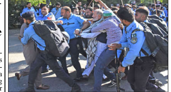
ISLAMABAD: Islamabad Police Crackdown on Aid Hamas March under the auspices of Save Gaza Campaign, police arrested the protestors heading towards US Embassy in the Federal Capital.