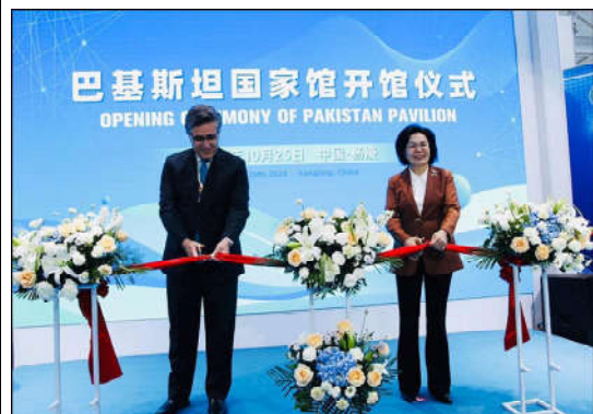
Ambassador of Pakistan to China H.E. Mr. Khalil Hashmi inaugurated Pakistan Pavilion at 31st China Yangling Agricultural Hi-Tech Fair.

The sector also played a significant role in employment, supporting 631,000 jobs in 2023, equivalent to one in five jobs in Dubai. With projected growth, an additional 185,000 jobs will be created by 2030, bringing the total to 816,000 jobs.