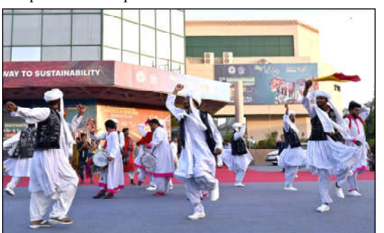
KARACHI: Artists perform traditional folk dances on the closing day of the 5th International Textile and Leather Exhibition, TEXPO 2024, at the Expo Center.

Ghulam Muhammad Safi emphasized on highlighting the long-standing dispute of Kashmir at the global level, saying that India is committing serious violations of human rights in Kashmir, which cannot be ignored anymore and will be raised on international forums. Safi highlighted the difficulties faced by the people of IIOJK, saying that the voice should be raised for the rights of Kashmiris not only in Azad Jammu and Kashmir but in the whole world.