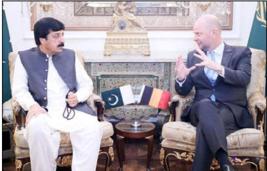
LAHORE: Ambassador of Belgium to Pakistan, Idesblad van der Gracht, called on Governor Punjab Sardar Saleem Haider Khan here today at Governor House.

demand from the Islamabad International Airport. The cabinet approved federal government to legislation on the subject of "Explosive" for implementation of National Explosive Policy. Cabinet also decided to approve amendments in Khyber Pakhtunkhwa Civil Servants (Appointments, Promotion and Transfer) Rules, 1989 for reservation of quota for transgender, revising the fourth condition of its decision taken in the 12 th meeting of the Provincial Cabinet allowing partial relaxation of ban for creation of positions of project employees with domicile from other than Ex-FATA.