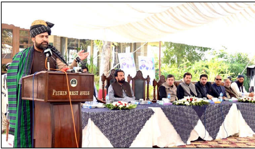
PISHIN: Chief Minister Balochistan Mir Sarfaraz Ahmed Bugti addressing participants of inaugural ceremony of shifting of agriculture tubewells on solar energy.