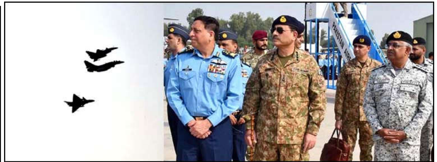
RAWALPINDI: Chief of Army Staff (COAS), General Syed Asim Munir witness the ongoing Multinational Exercise Indus Shield-2024, at an operational Air Base of Pakistan Air Force (PAF).

The written court order noted the PTI founder's age—72 years—and his status as a former prime minister and under-trial prisoner.