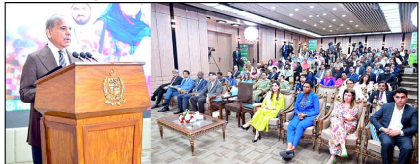
ISLAMABAD: Prime Minister Muhammad Shehbaz Sharif addressing a ceremony organized to mark World Polio Day & the Inauguration of the National Polio Campaign.

He assured the government's all-out support to the polio workers and said the event was also held to acknowledge their dedicated efforts and sacrifices. He said the surge in polio cases, caused by an immunity gap, was a matter of concern and resolved that the polio vaccination teams would reach every household to vaccinate every child to ensure no one was left behind.