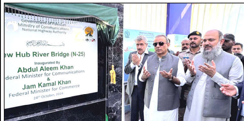
Federal Minister for Board of Investment, Privatization & Communications Abdul Aleem Khan and Federal Minister for Commerce Jam Kamal Khan inaugurating the Hub River Bridge (N-25).

One of the key points of discussion was the Pakistan Navy's recent successful operation in the Northern Arabian Sea, which resulted in the seizure of over 2,400 kilograms of narcotics worth an estimated $145 million.