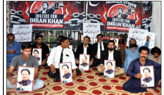
HYDERABAD: Members of Tehreek-e-Insaf (PTI) Lawyers Wing are holding protest demonstration for release of PTI Founder Imran Khan, outside Civil Court in Hyderabad.

WAPDA's North Project Manager has requested pre-qualification tenders for the initial two phases of the canal.