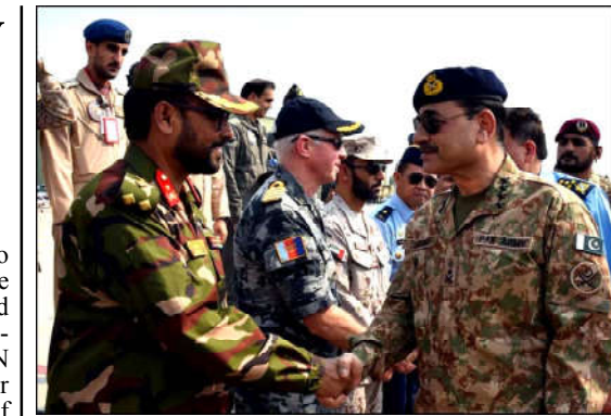
RAWALPINDI: Chief of Army Staff (COAS), General Syed Asim Munir interacts with aircrew during the Multinational Exercise Indus Shield-2024, at an operational Air Base of Pakistan Air Force (PAF).

poor, the walls of the unit are dirty, the machinery is contaminated while the air circulation arrangements were found to be inappropriate during action, he said. The spokesman said that the manufacture and date of cancellation were not shown on the candy toffees produced in the factory, while the colors, chemicals and other ingredients used in the manufacture of Plummet were found to be non-food grade, all the products were unregistered and the water used in the processing was found to be contaminated. The condition of personal hygiene of factory employees was poor and fitness certificate masks, head covers etc. were also not available, he said.