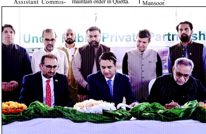
QUETTA: Balochistan Chief Minister, Mir Sarfaraz Bugti along with others witnesses MoU signing agreement during signing ceremony of four projects run under Public Private Partnership, held in Quetta.

Justice Mansoor emphasized upon self-accountability. "People are watching our actions, and history never forgives," said Justice Mansoor.