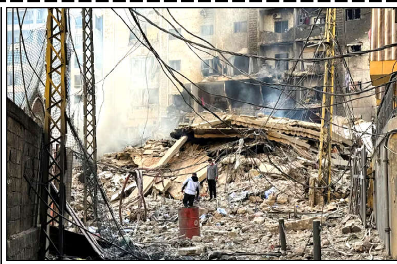
Men walk on the rubble at a site damaged in the aftermath of Israeli strikes on Beirut's southern suburbs, amid the ongoing hostilities between Hezbollah and Israeli forces, Lebanon.

Monitoring Desk BEIRUT: Lebanon state media reported 17 Israeli raids on Beirut's southern suburbs, with six buildings levelled and the vacated offices of a pro-Iran broadcaster hit as the Iran-Hezbollah war reached its one-month mark. AFP TV footage showed a massive explosion followed by smaller blasts in the embattled southern suburbs after the Israeli army issued an evacuation warning for the area, where Hezbollah holds sway. The official National News Agency (NNA) reported at least 17 Israeli raids, marking one of the most violent nights in the area since the Israel-Hezbollah war erupted on Sep 23. Six buildings were destroyed around the suburb of Laylaki, NNA said, calling the raids "the most violent in the area since the beginning of the war". The strikes came shortly after the Israeli military's Arabic-language spokesman, Avichay Adraee, issued evacuation warnings on social media platform X. There was no warning, however, for a strike that hit the Jnah neighbourhood in southern Beirut.