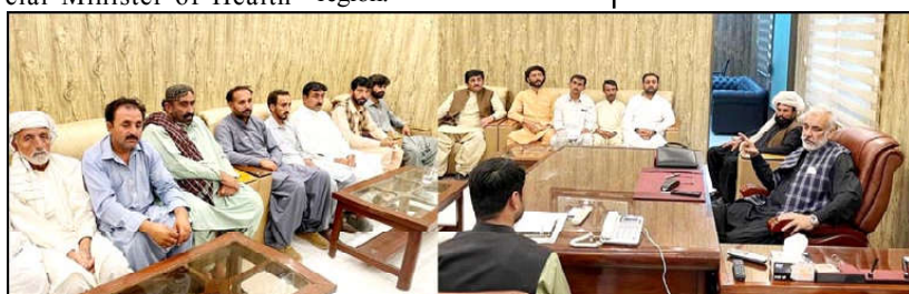
QUETTA: Different delegations meeting with Provincial Minister for PHE Sardar Abdul Rehman Khetran.

Additionally, Provincial Minister of Health Bakht Muhammad Kakar has ordered action against absent health staff. During a recent visit to Prince Abdul Karim Khan Hospital in Kalat, pharmacist Waqar Ahmed Kakar was found absent without notice. The Minister directed the Secretary of Health to take disciplinary action against him. It's clear the government is cracking down on absenteeism and reshuffling key positions to improve healthcare services in the region.