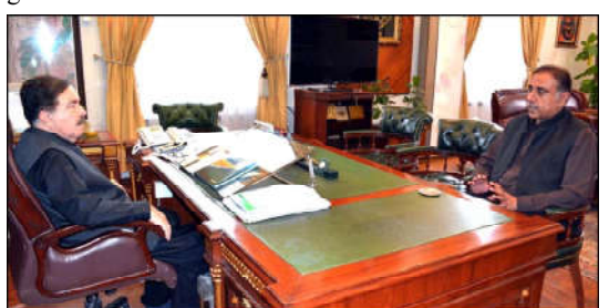
QUETTA: Provincial Minister for Communication & Works Mir Saleem Ahmed Khosa meeting with Governor Balochistan Sheikh Jaffar Khan Mandokhail.

COAS expressed his satisfaction over the combat readiness of Pakistan Air Force and the progress made through various modernization and up-gradation programs. Later, he witnessed exercise operations, static display of various niche and disruptive technologies where he was briefed on the modernization efforts of Pakistan Air Force to stay abreast with contemporary security challenges which was later followed by an enthralling aerial display by PAF fighter jets. COAS also interacted with the aircrew and appreciated the resolve of PAF personnel to safeguard the aerial frontiers of Pakistan. He emphasized on the critical role of inter-service collaboration, which he believes is essential for achieving operational success.